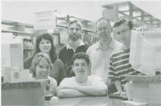
Loan and Reserve staff are excited about their new desk.

This year will be a time of transition for many library services. We will keep you informed with signs and announcement boards to direct you. Please do not hesitate to ask any staff member for assistance.