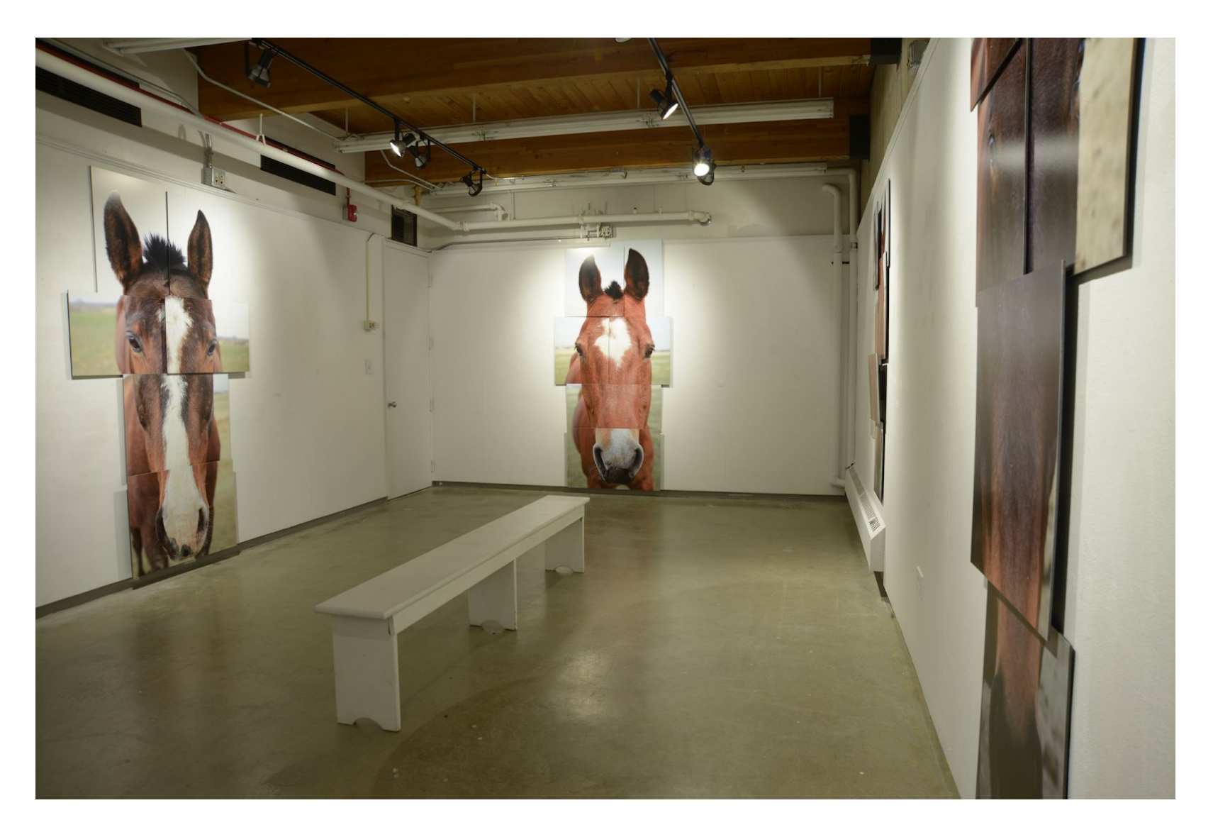
Figure 3: Gallery View