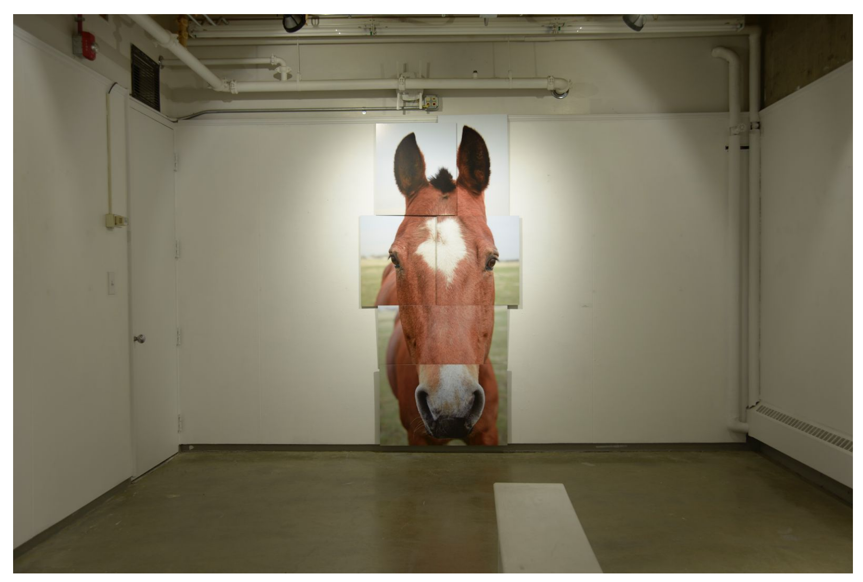
Figure 6: Tammy