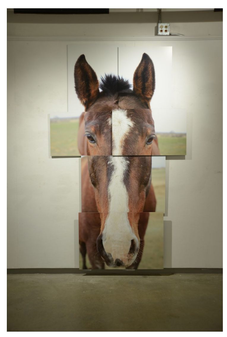
Figure 5: Jade