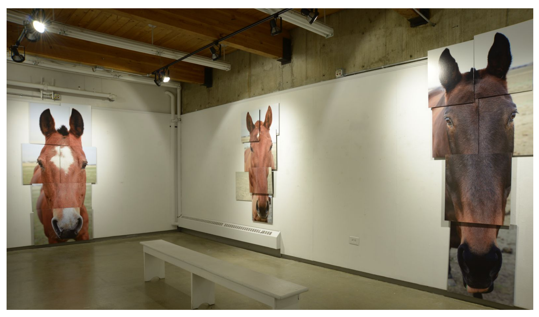
Figure 1: Gallery View