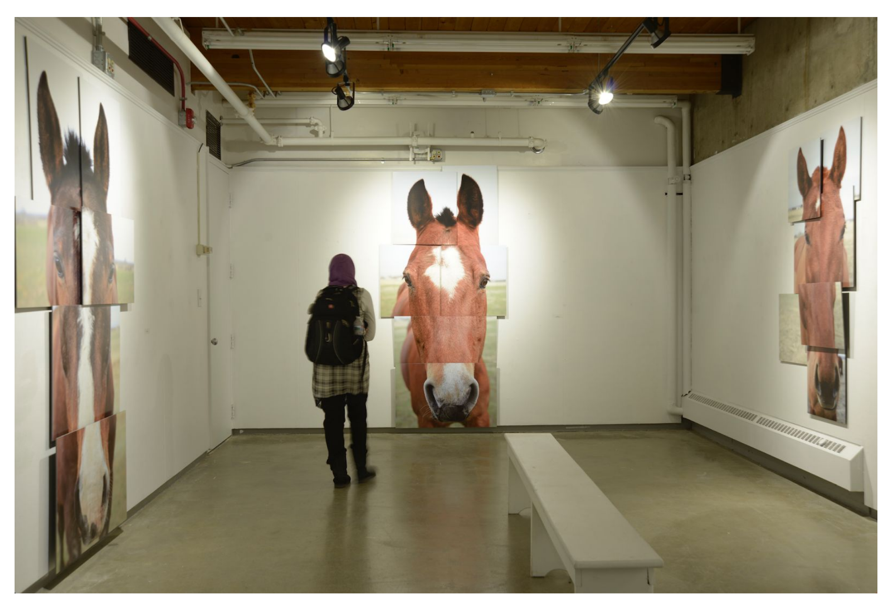
Figure 4: Gallery View