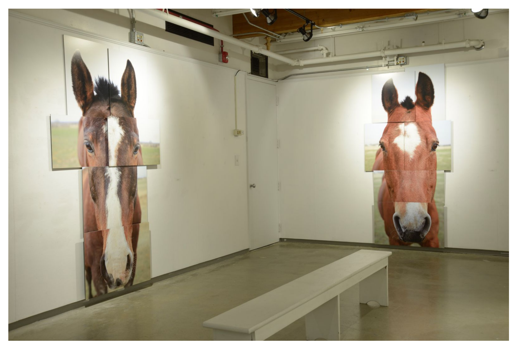
Figure 2: Gallery