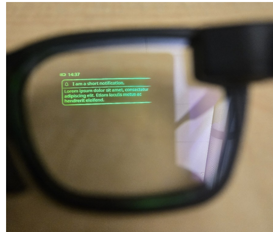
(b) A short text notification on the smartglasses.