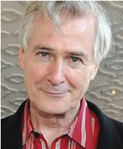
Playwright, Director, Screenwriter JOHN PATRICK SHANLEY