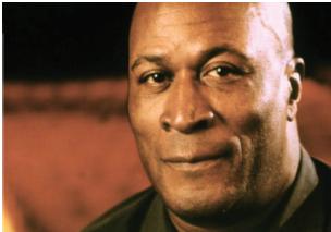
Actor JOHN AMOS