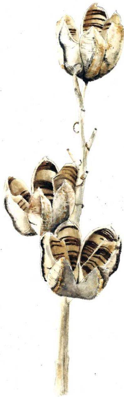
Figure 10: Yucca.