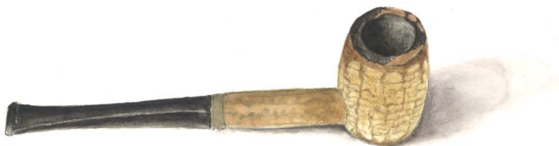
Figure 1: Corn Cob Pipe.