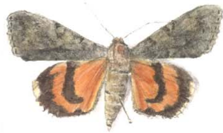
Figure 5: Moth.