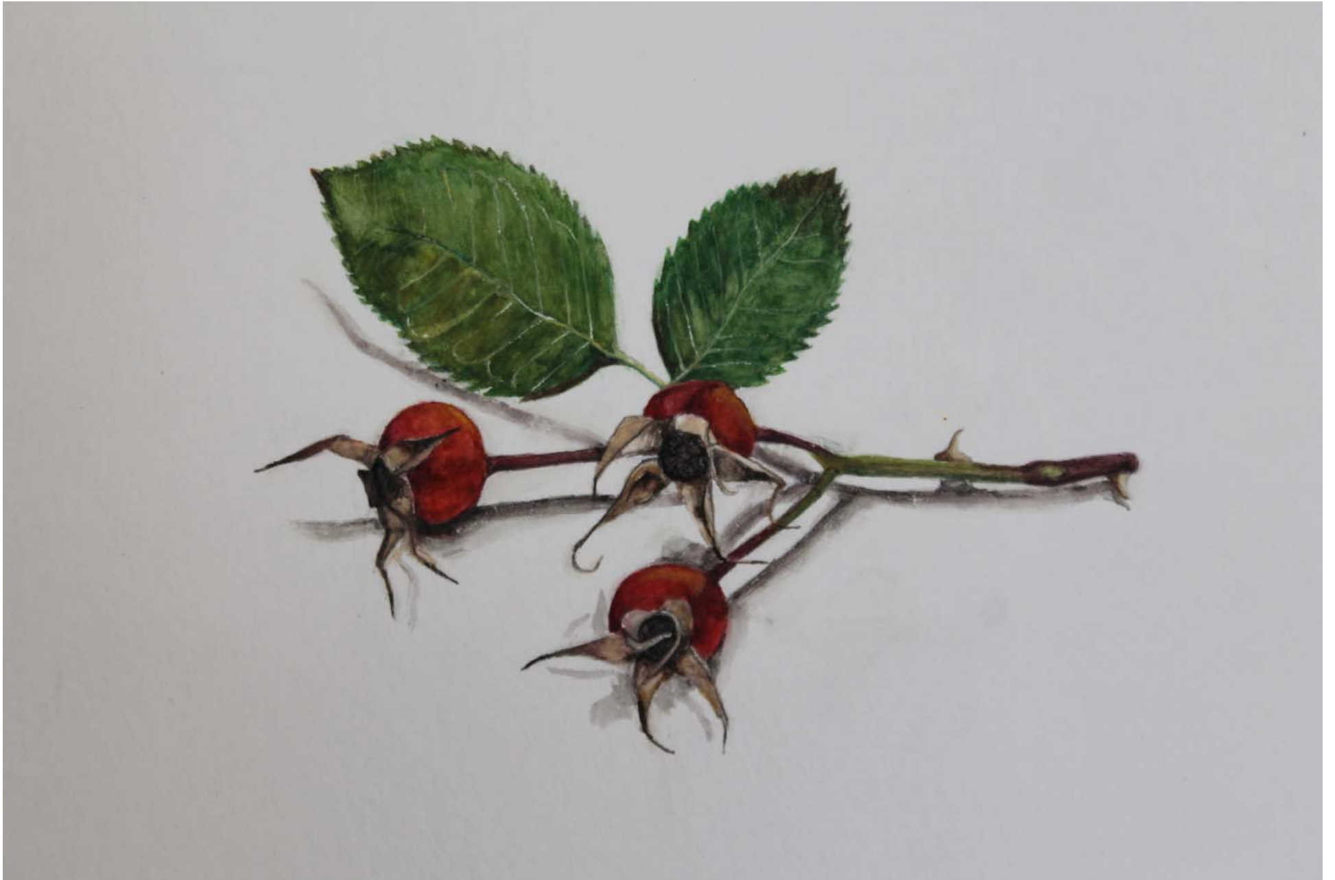
Figure 8: Rosehips.