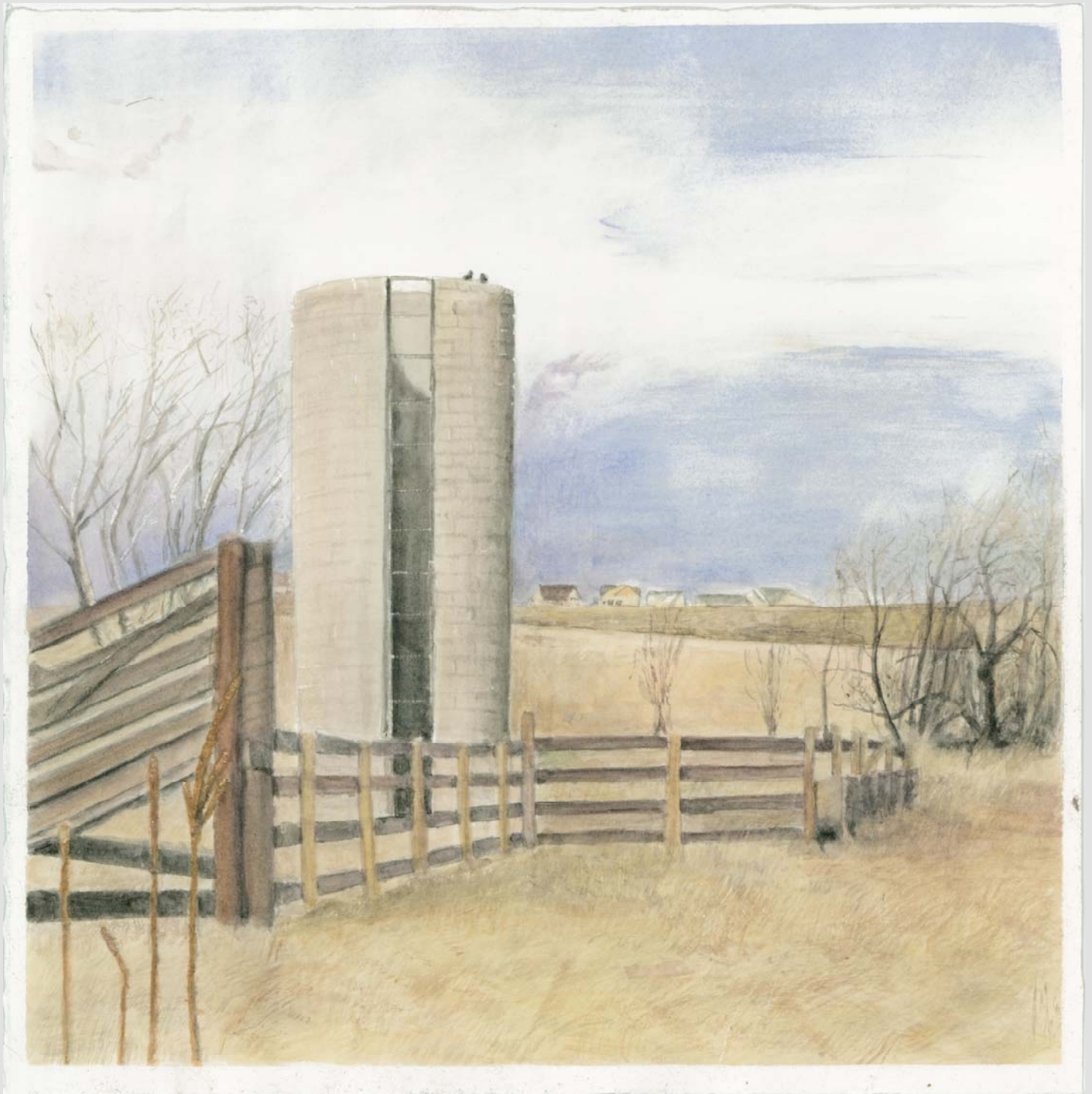
Figure 9: Silo.