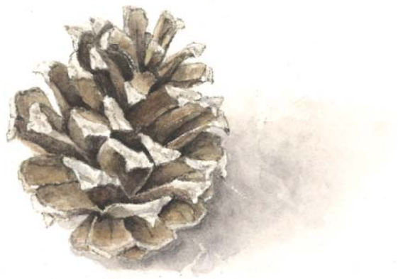
Figure 7: Pinecone.