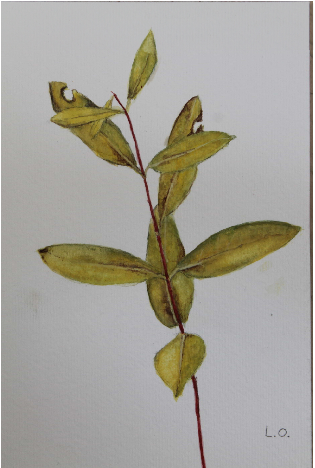
Figure 4: Milkweed.