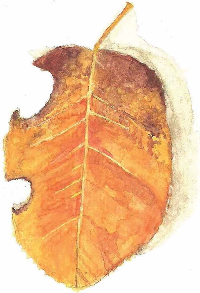
Figure 6: Leaf.