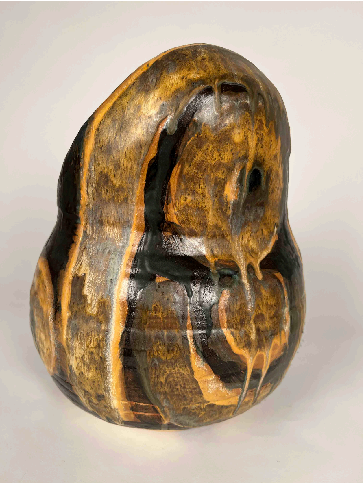
Figure 1: untitled