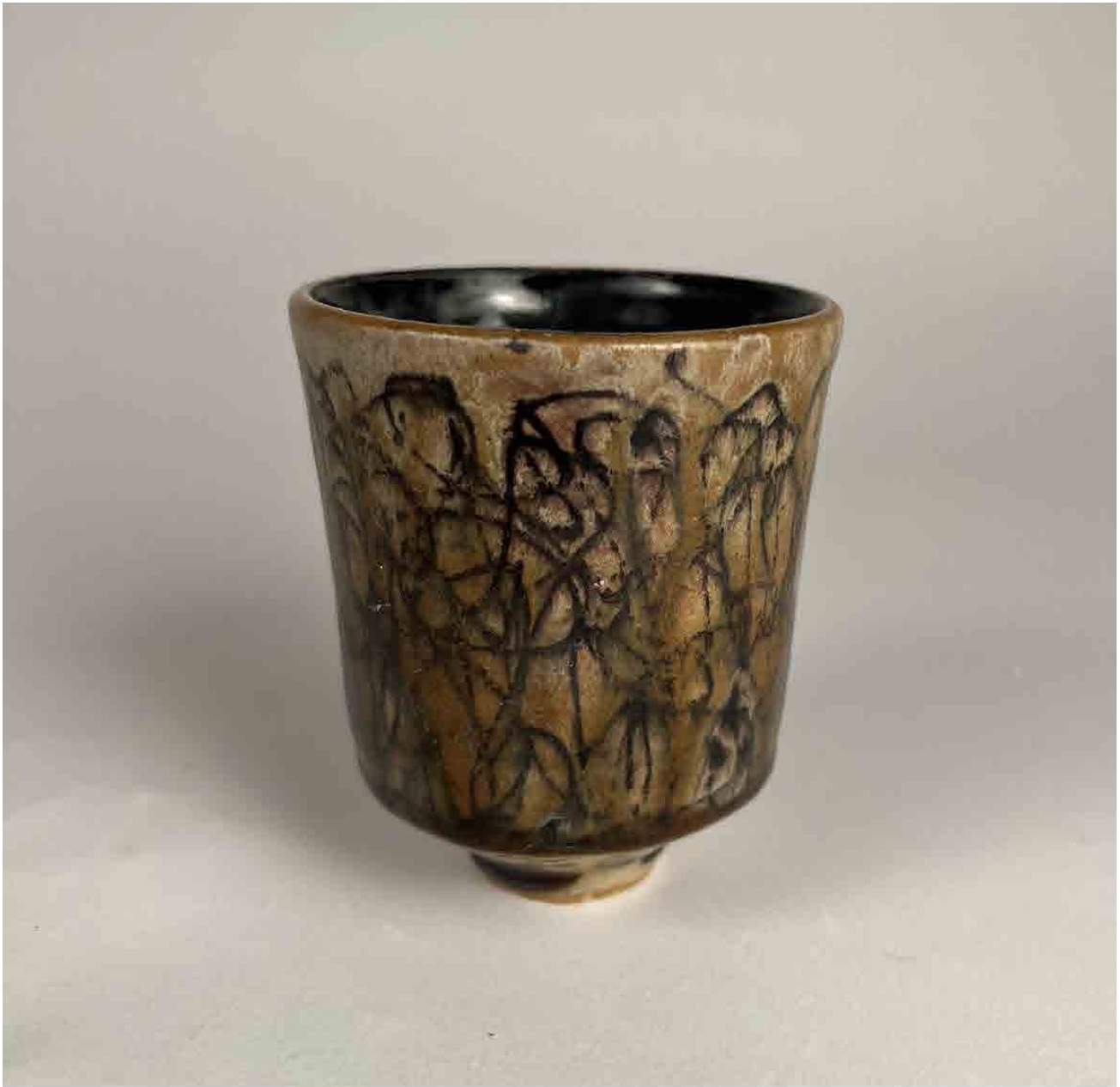
Figure 6: Untitled