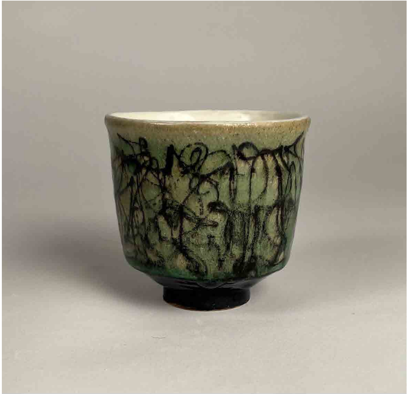
Figure 3: Untitled