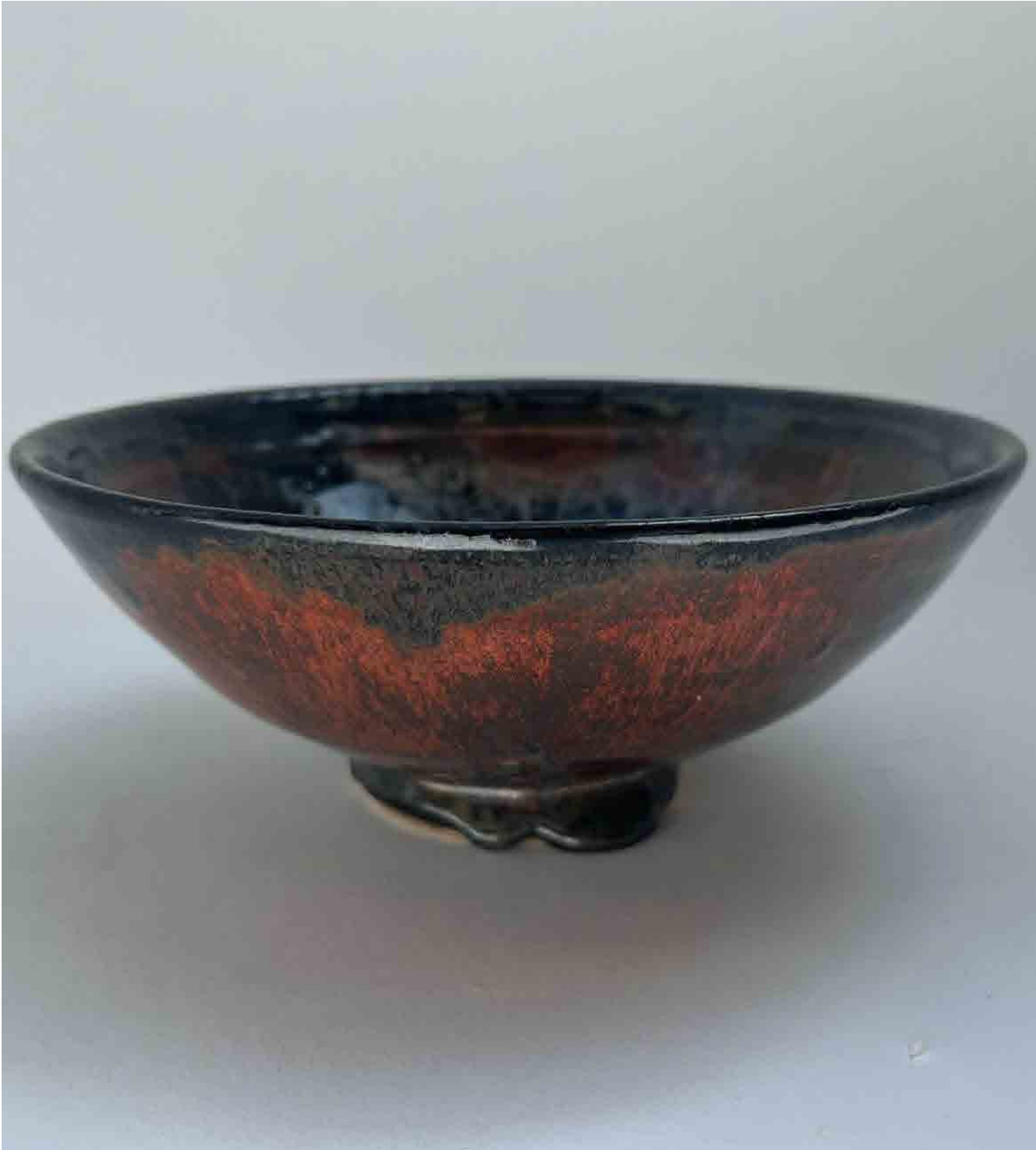
Figure 5: Untitled