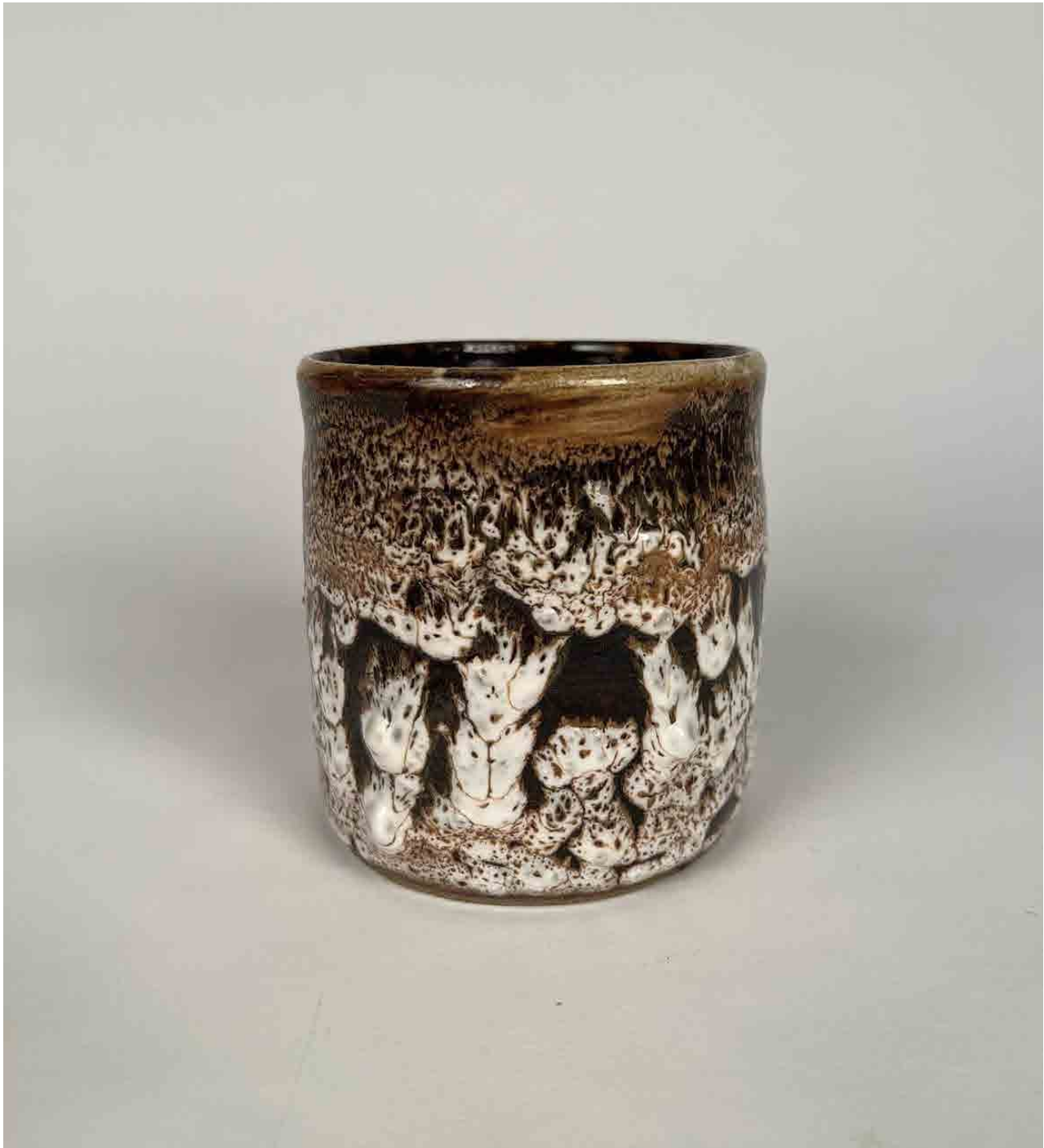
Figure 2: Untitled