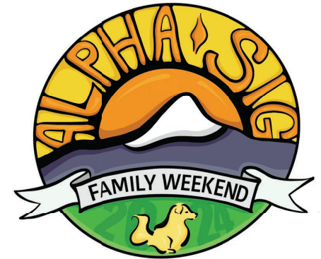
Figure 4: Fraternity Merchandise