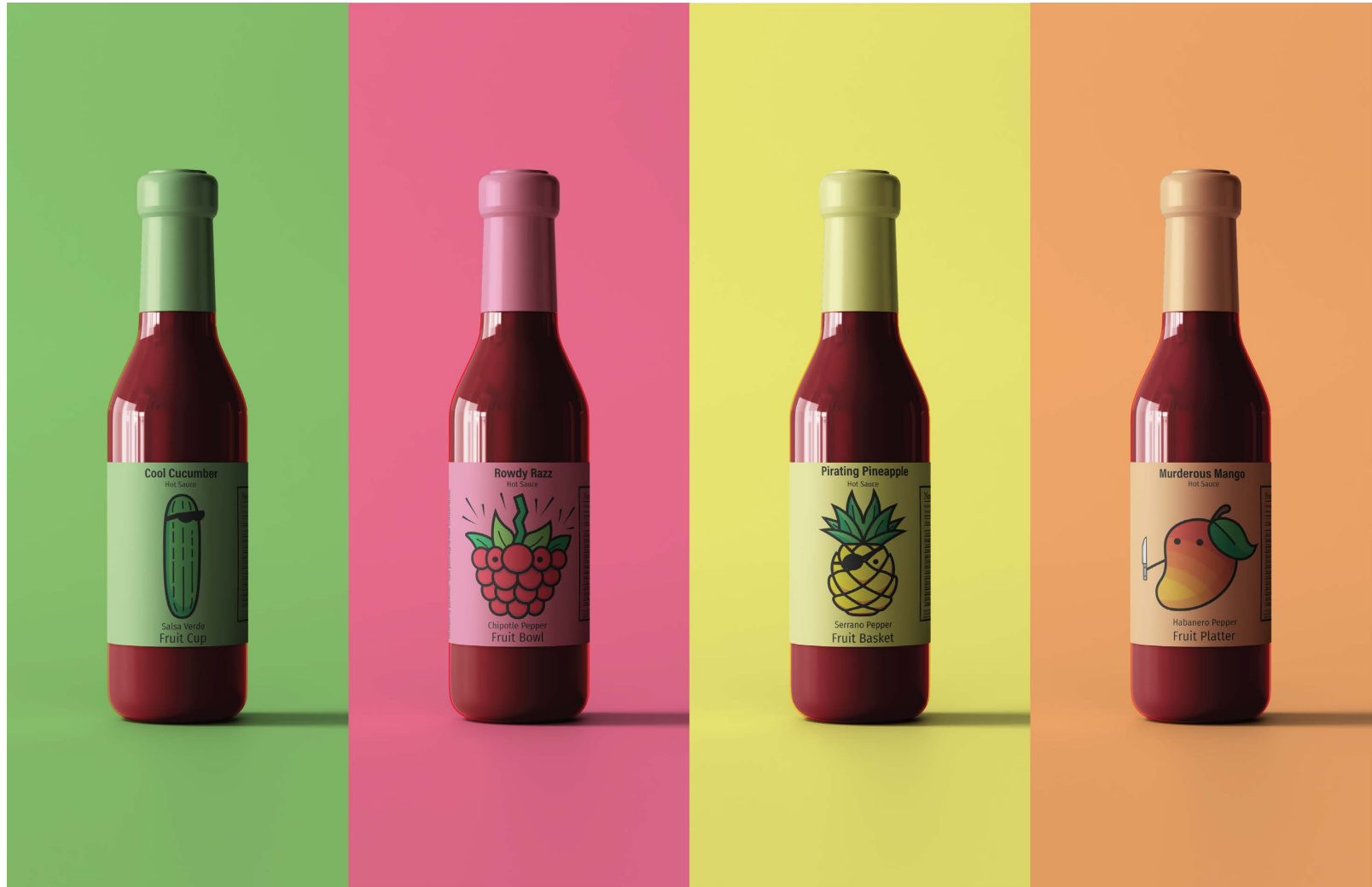
Figure 1: Hot Sauces