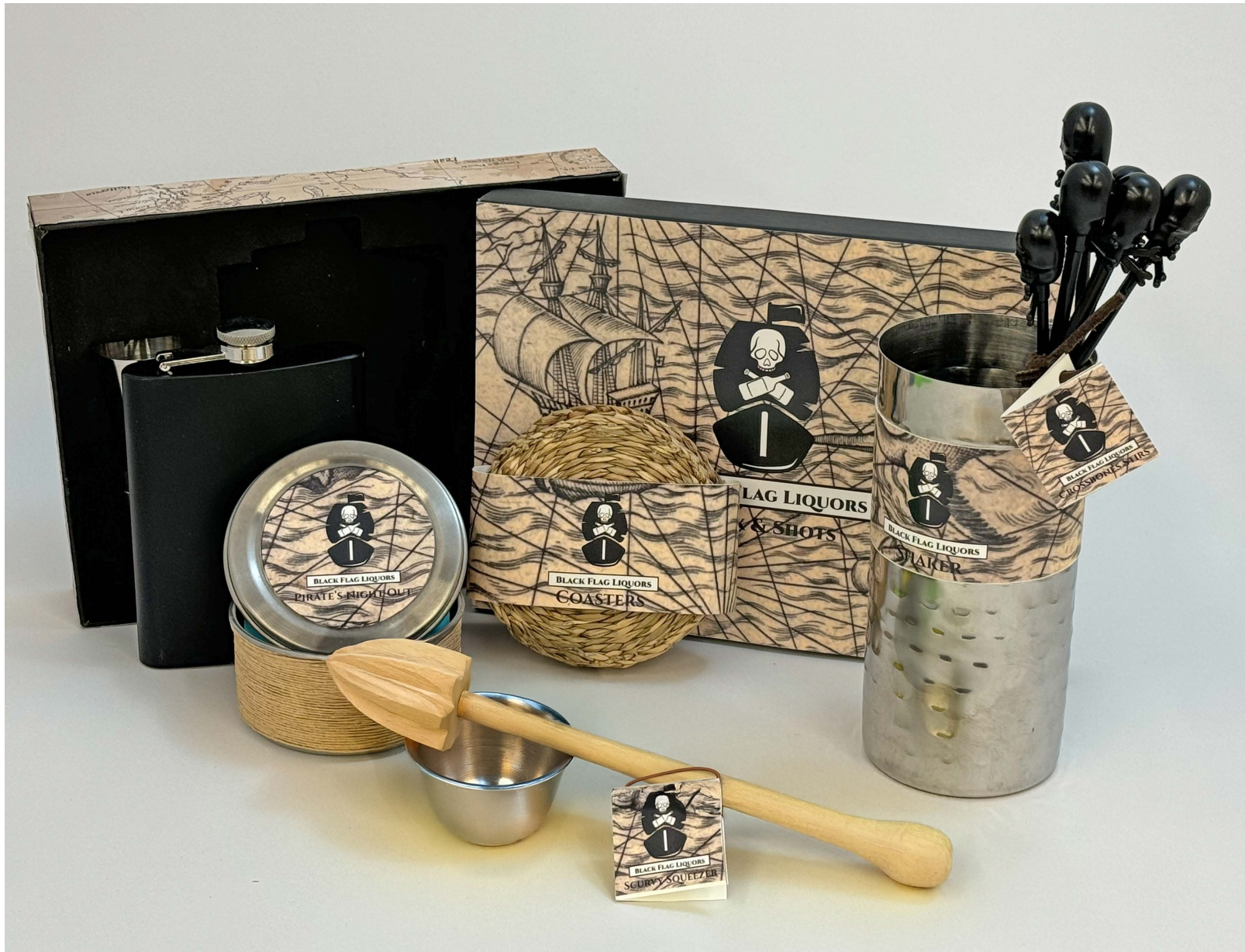
Figure 2: Black Flag Liquors