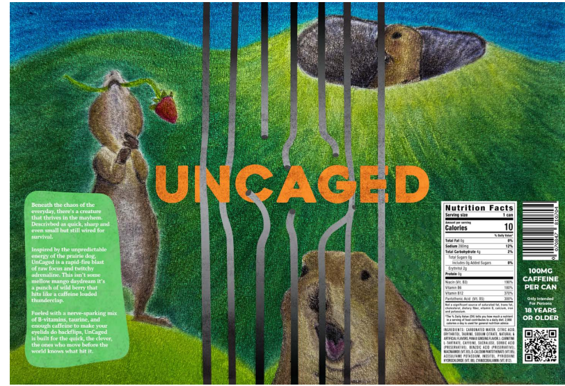
Figure 3: UnCaged