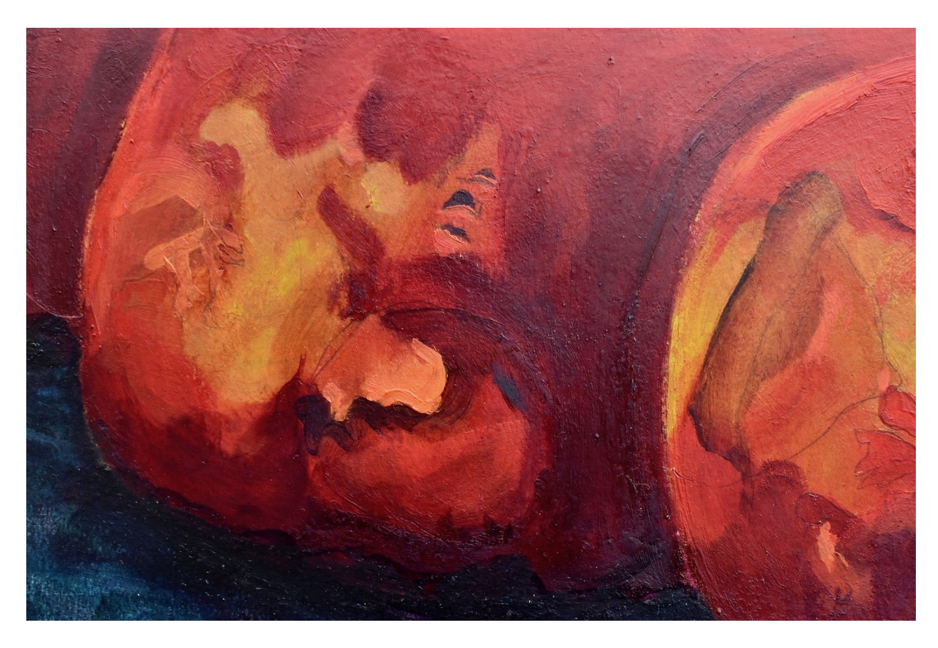
Figure 9: 4/12/18 and 9/3/18 detail 2