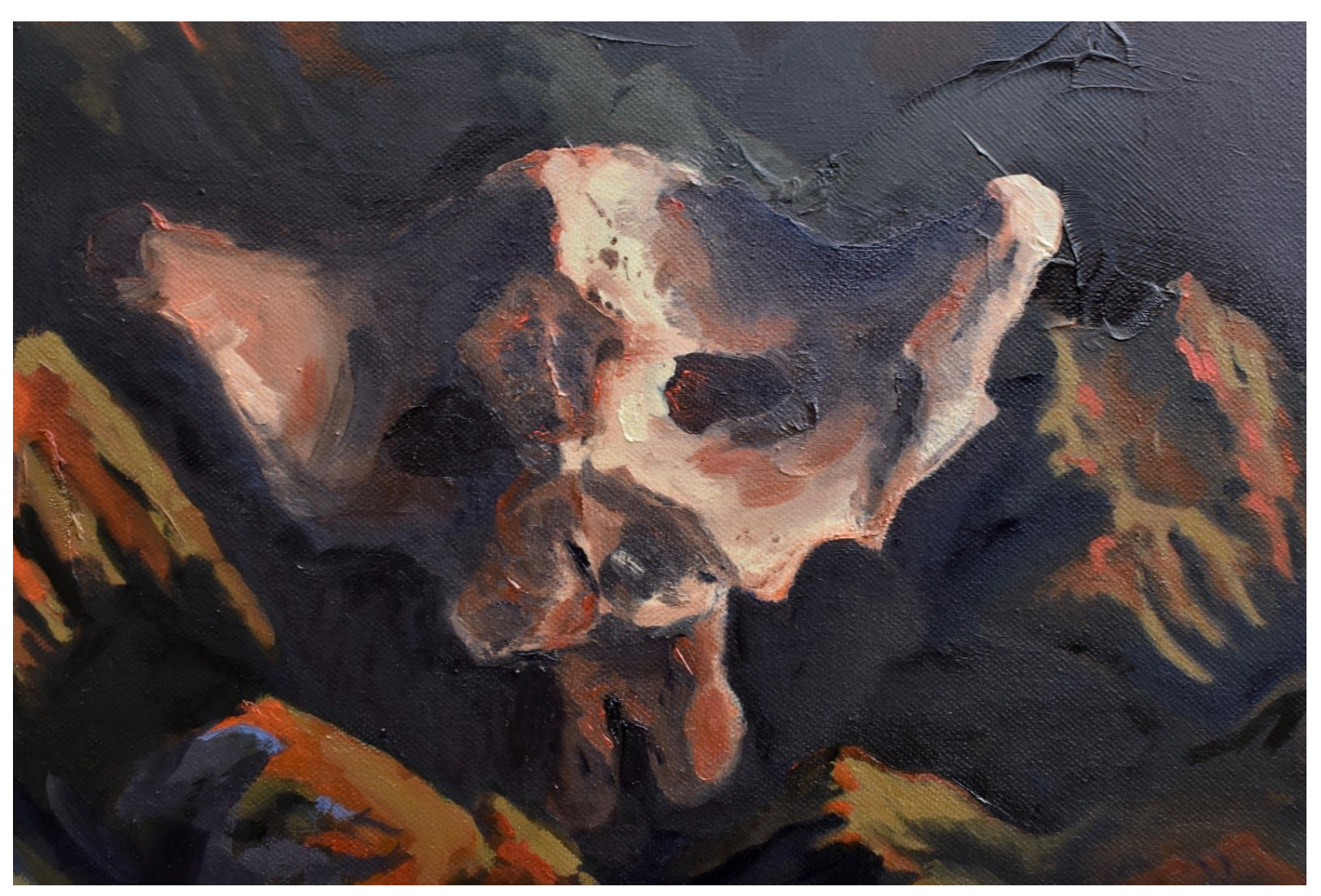
Figure 6: Mom detail 2