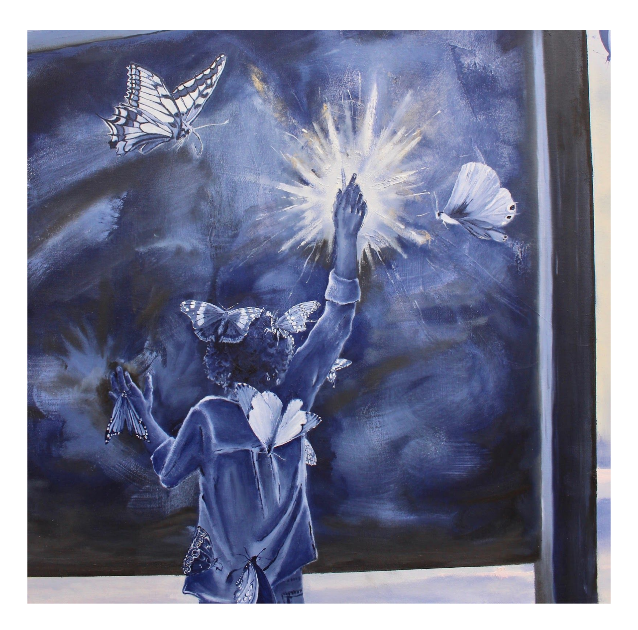
Figure 2: 9/2/17 and 11/26/18 detail 1