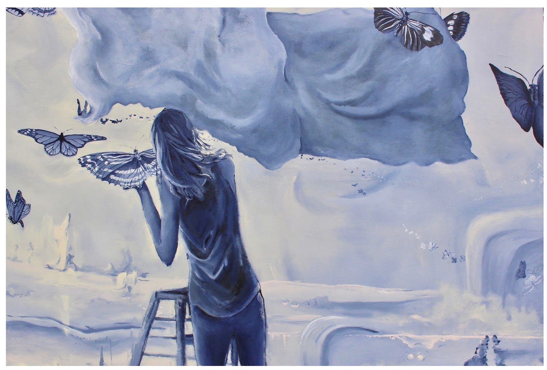
Figure 3: 9/2/17 and 11/26/18 detail 2