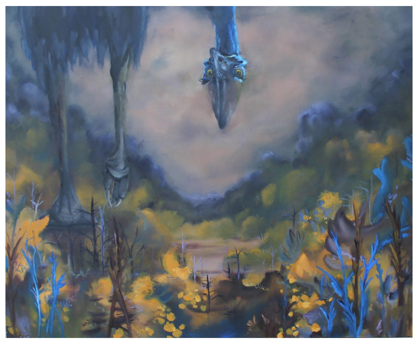
Figure 10: 7/17/17