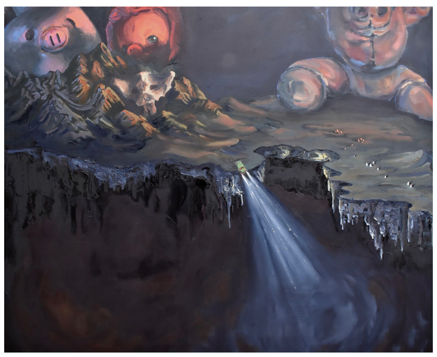
Figure 4: Mom's reoccuring dream, dates unknown