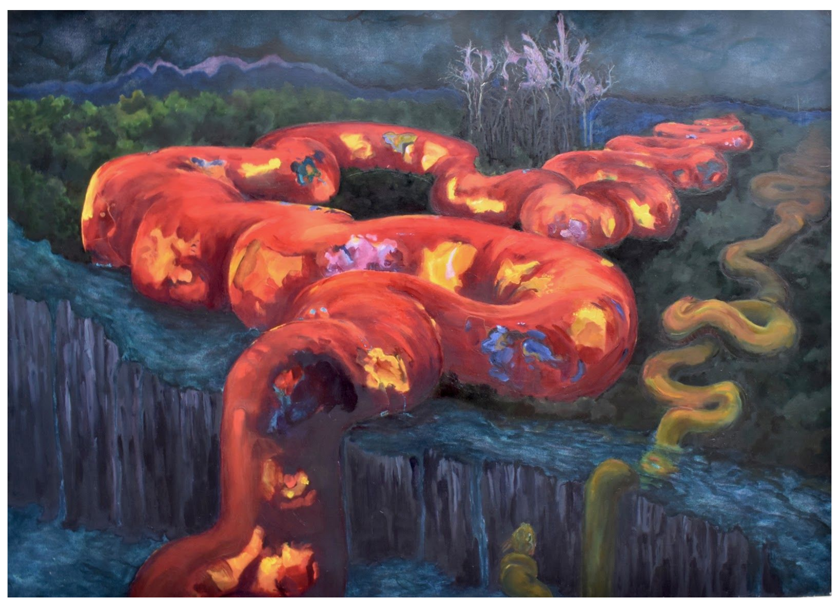
Figure 7: 4/12/18 and 9/3/18