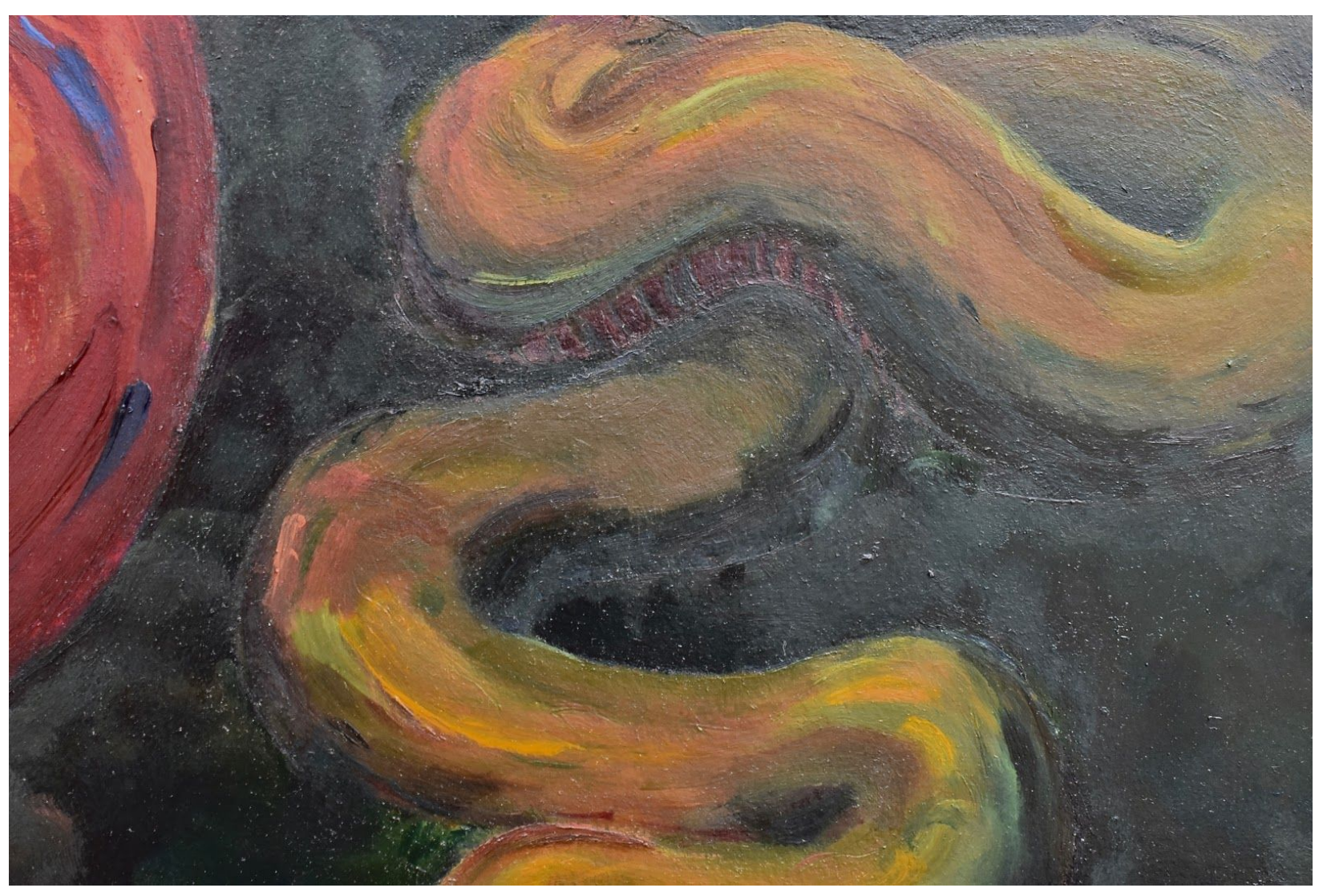
Figure 8: 4/12/18 and 9/3/18 detail 1