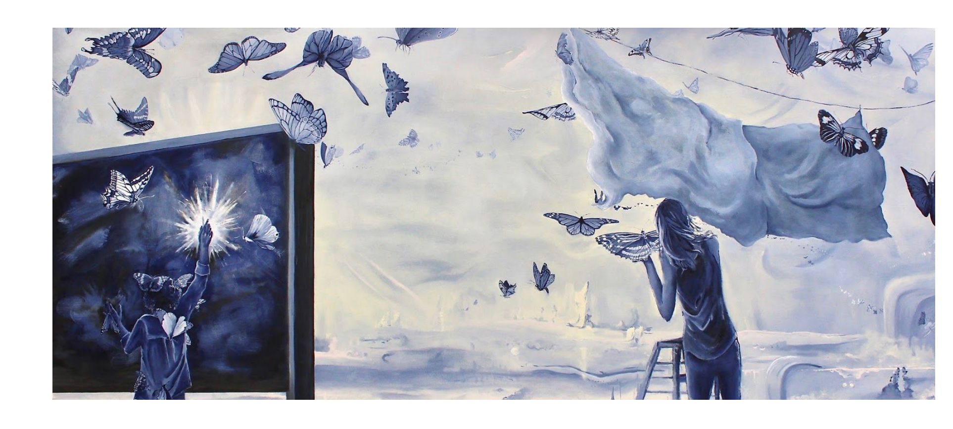
Figure 1: 9/2/17 and 11/26/18