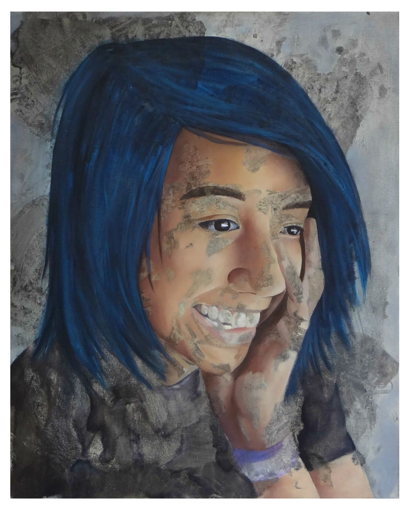
Figure 8: Innocence