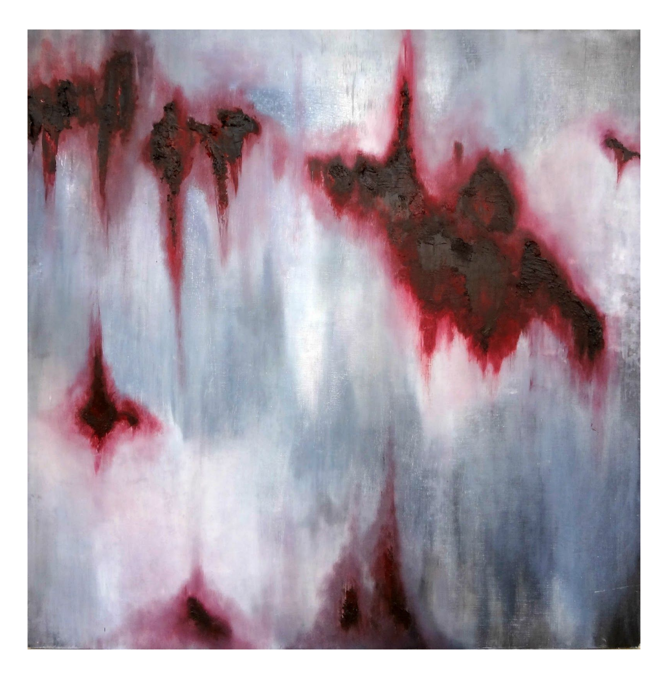
Figure 9: Scars