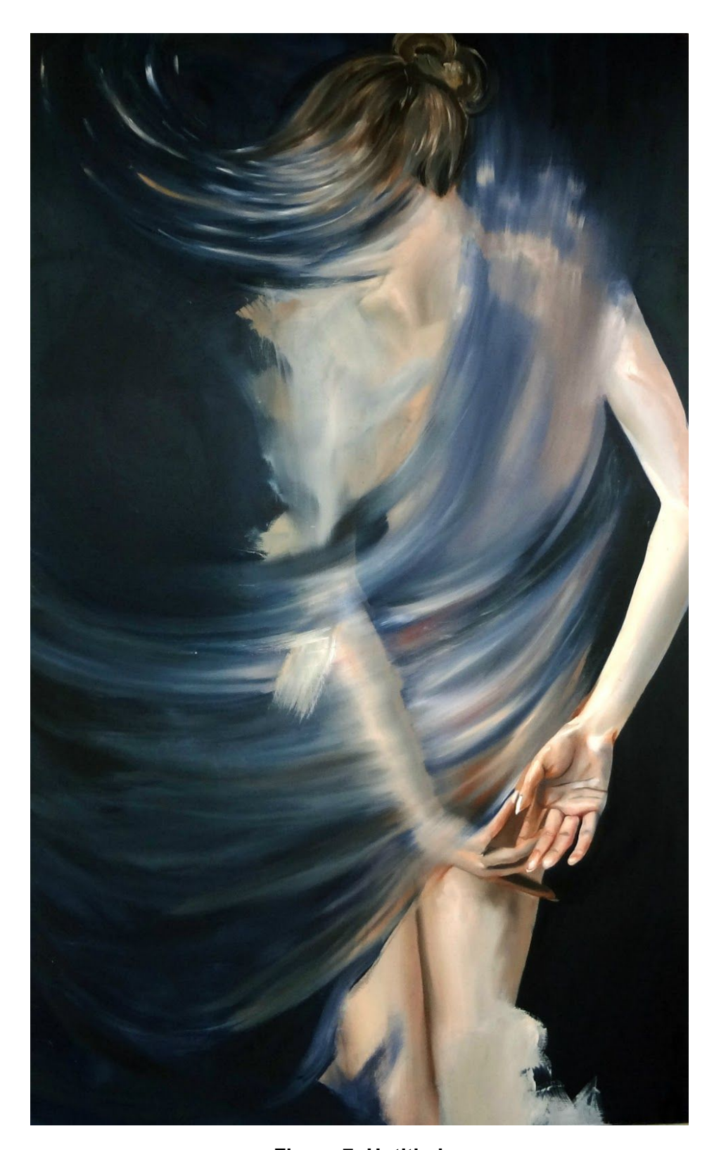
Figure 7: Untitled