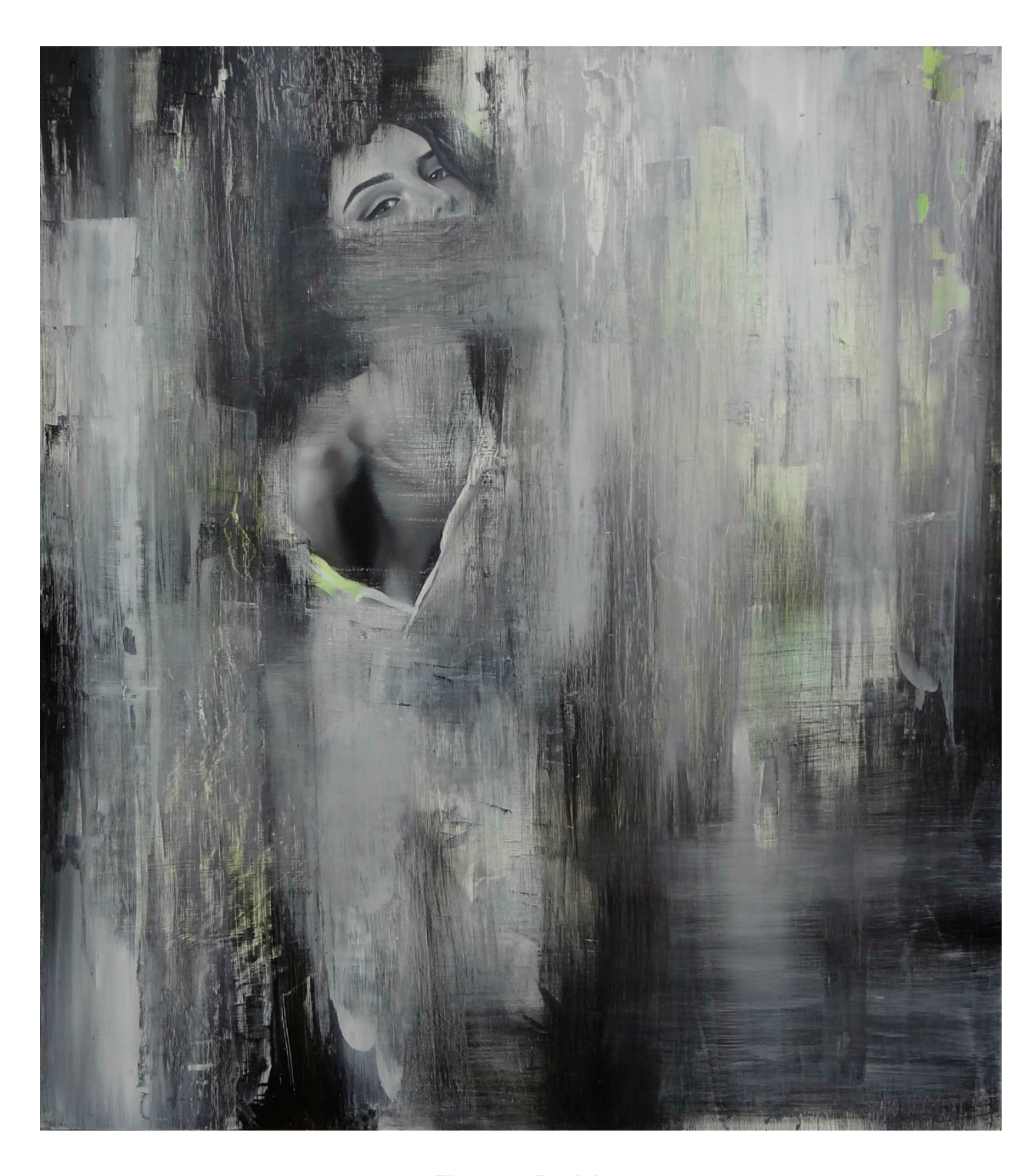
Figure 5: Burial