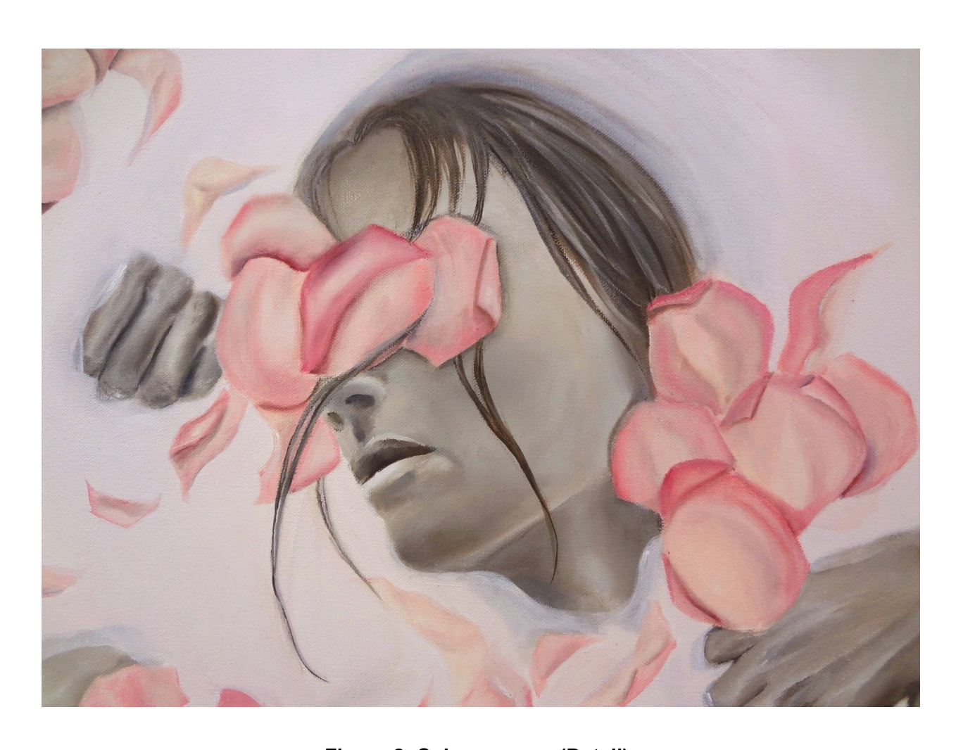
Figure 2: Submergence (Detail)