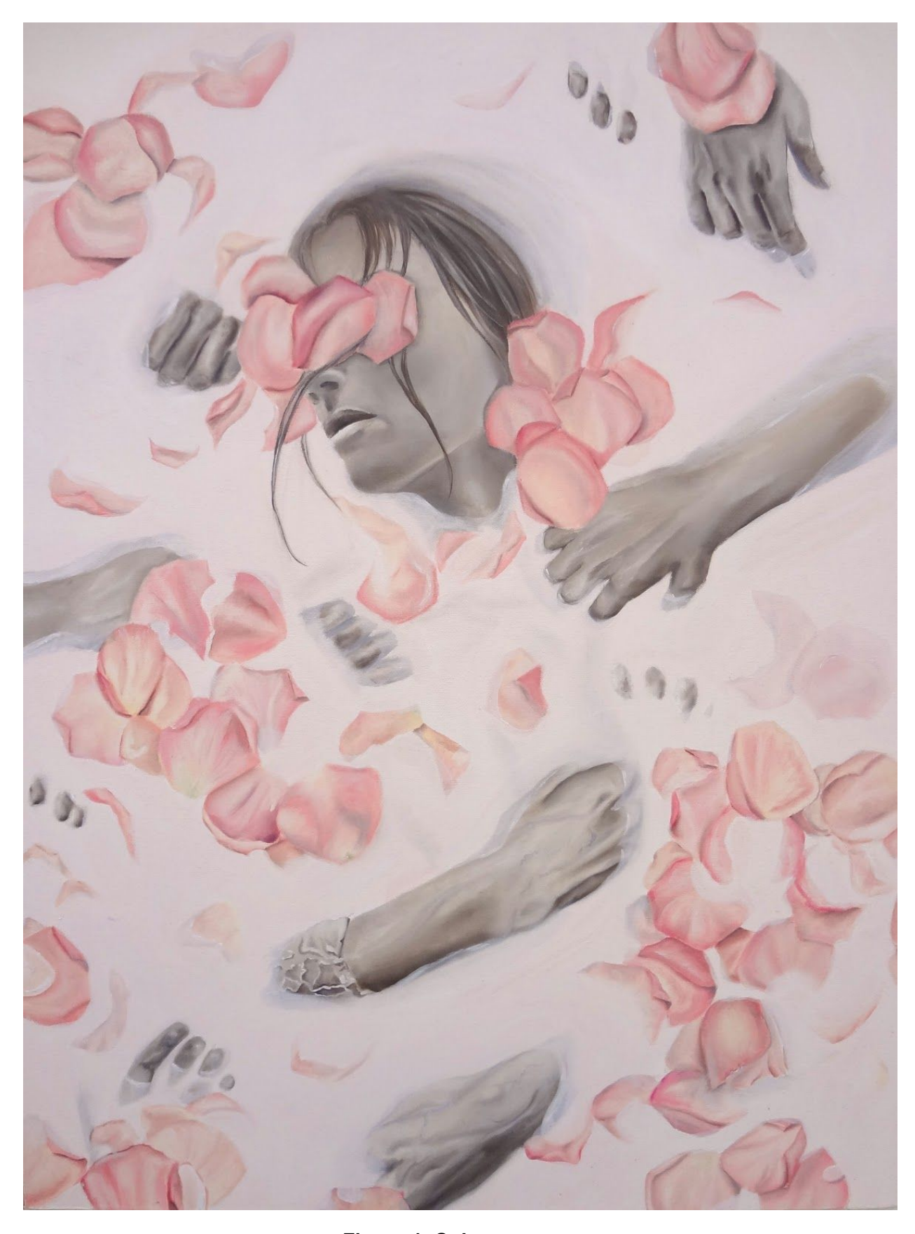
Figure 1: Submergence