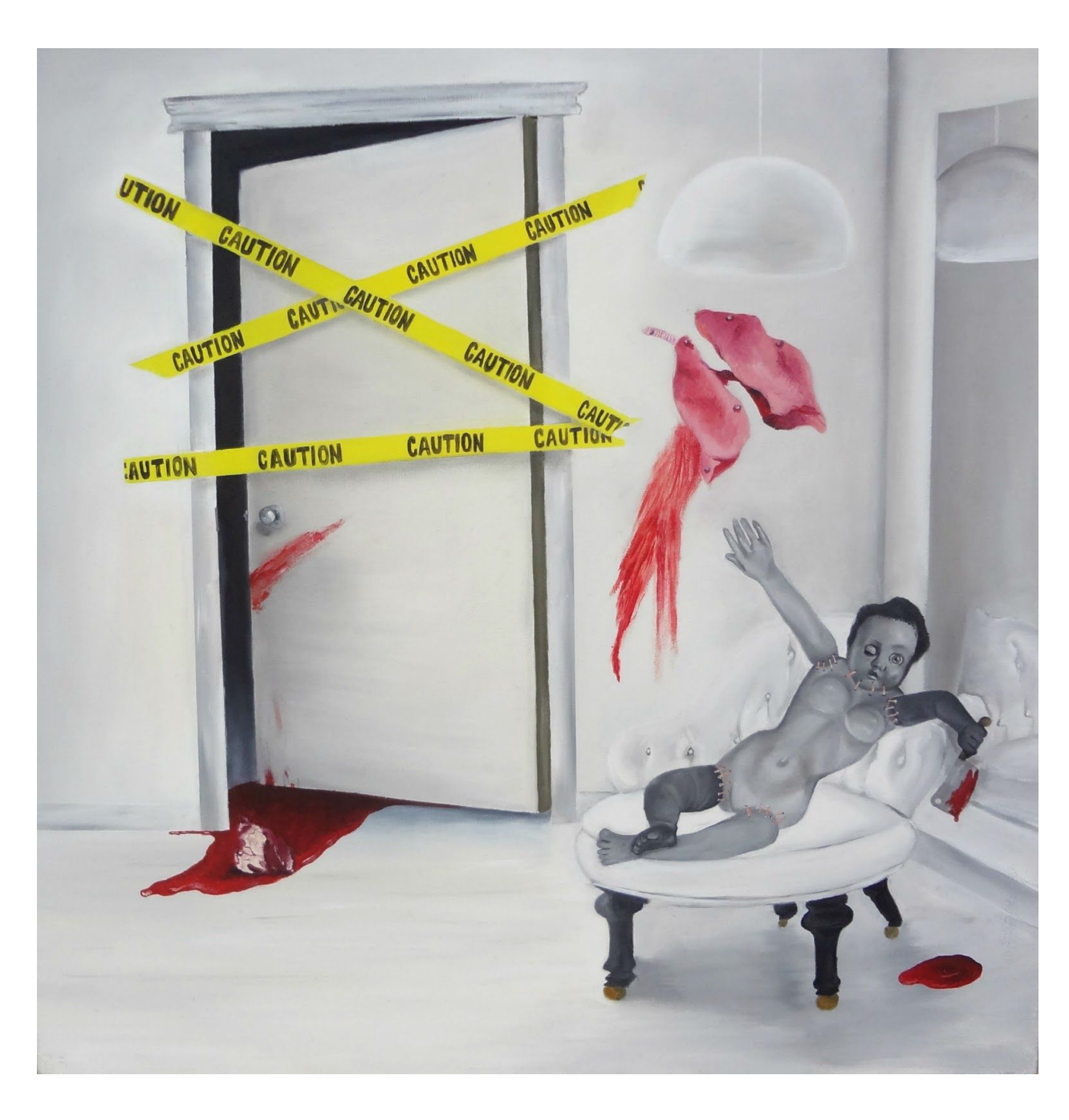
Figure 10: The Intruder