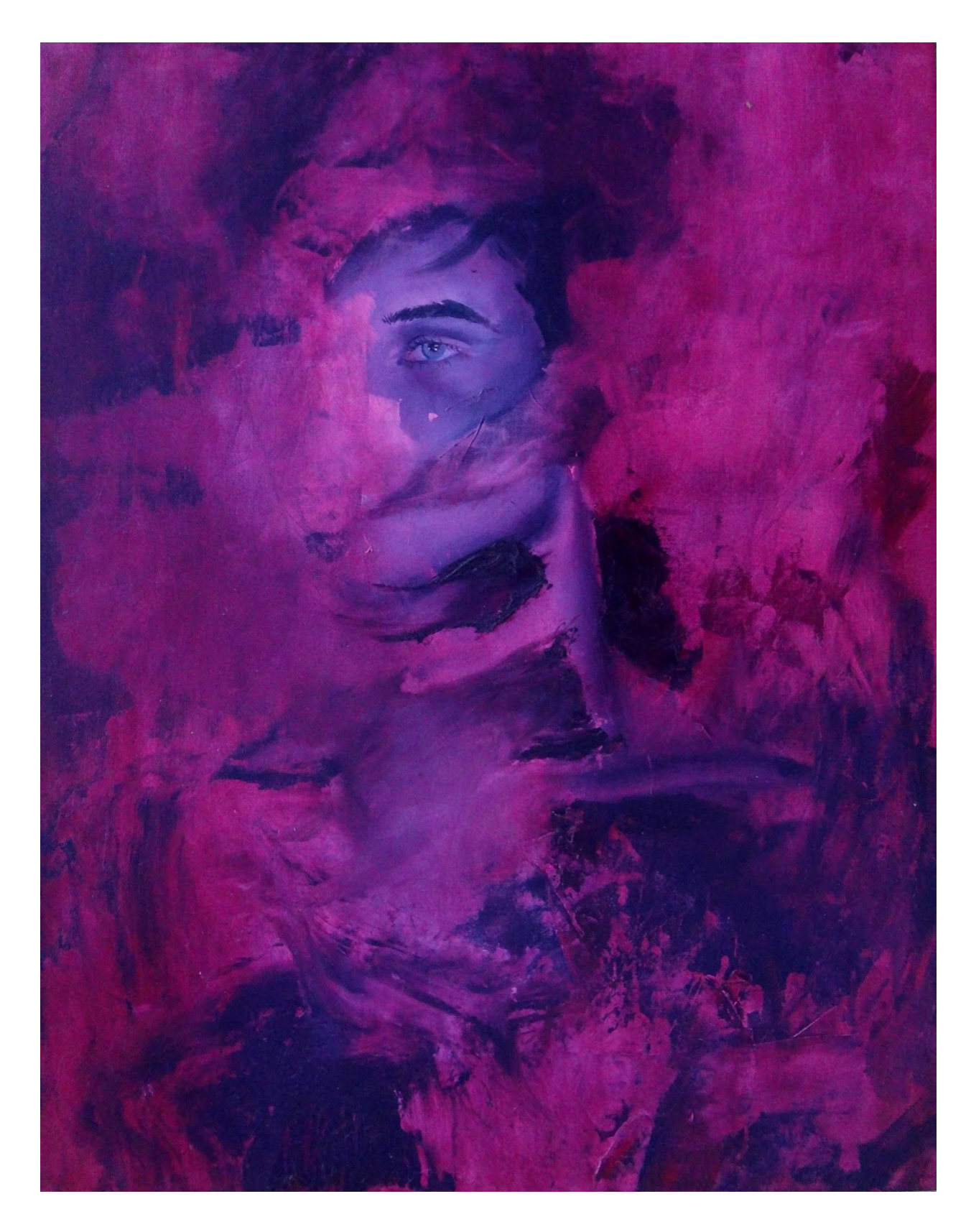
Figure 3: Untitled-Male