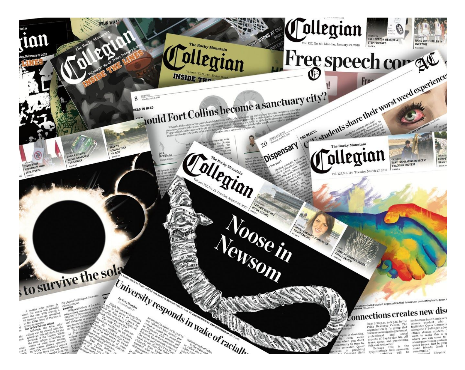
Figure 2: The Collegian