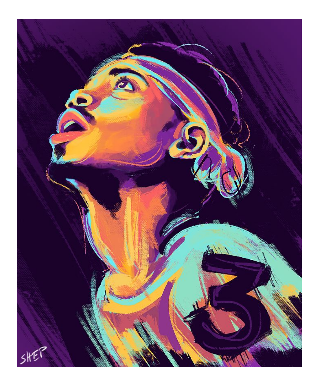
Figure 7: Acid Rapper