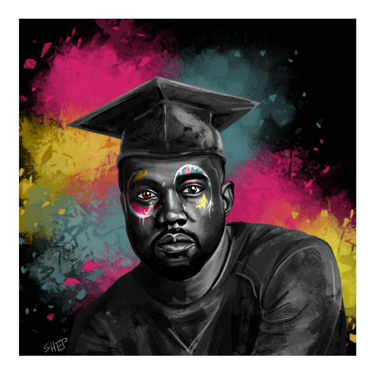
Figure 10: Graduation