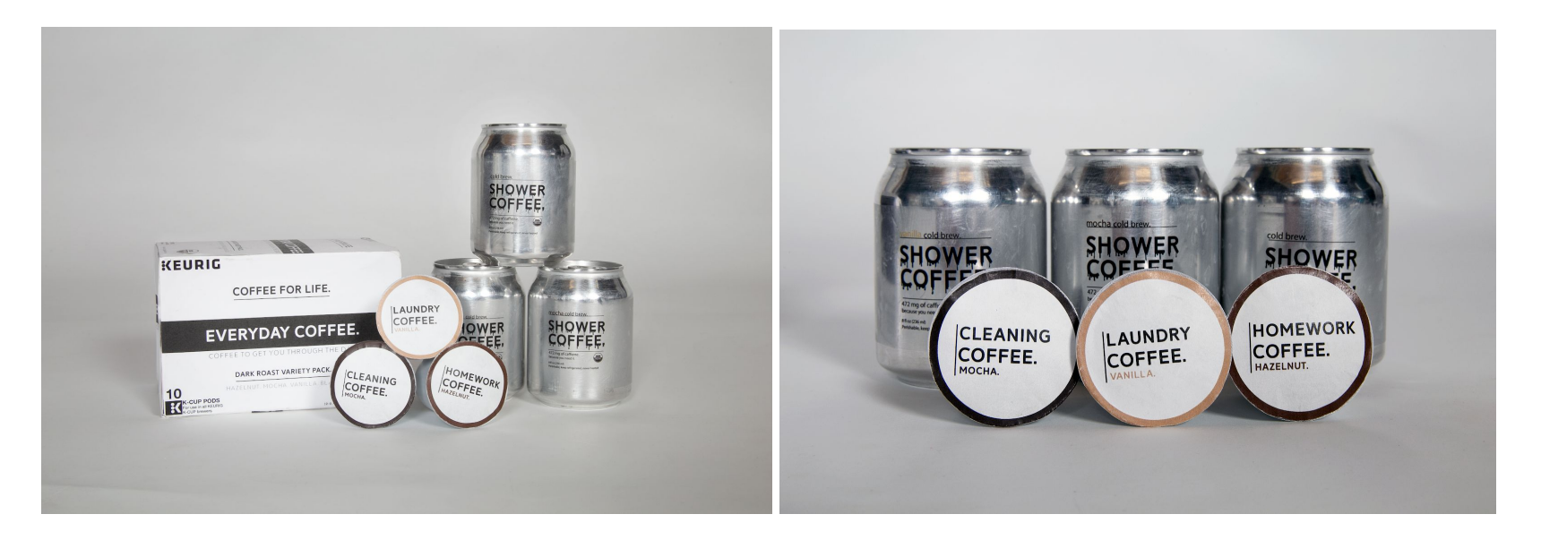
Figure 6: Coffee For Life