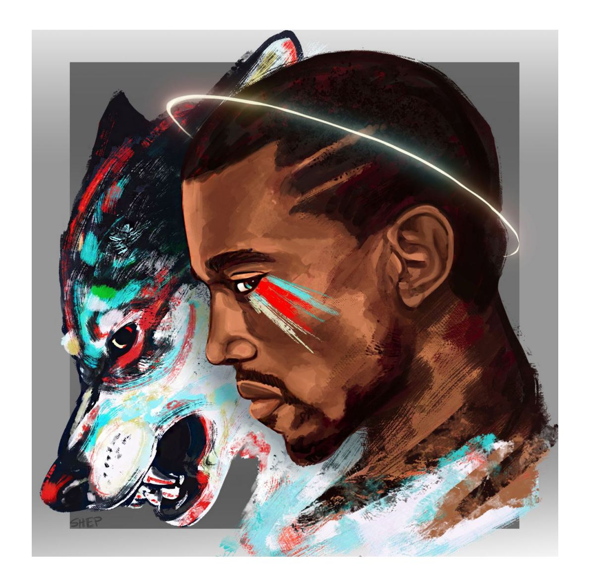
Figure 9: I'm Aware I'm A Wolf