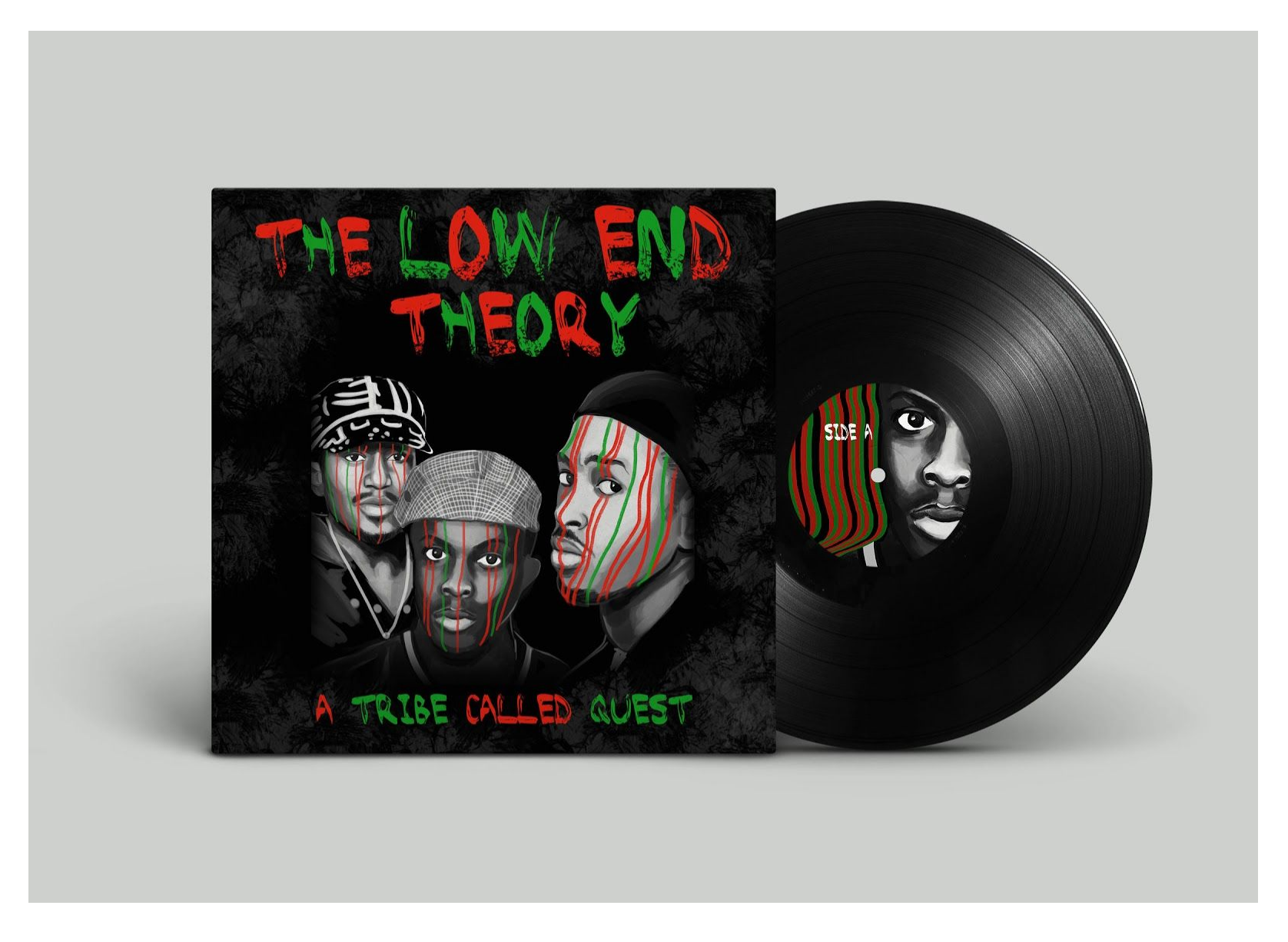
Figure 3: The Low End Theory