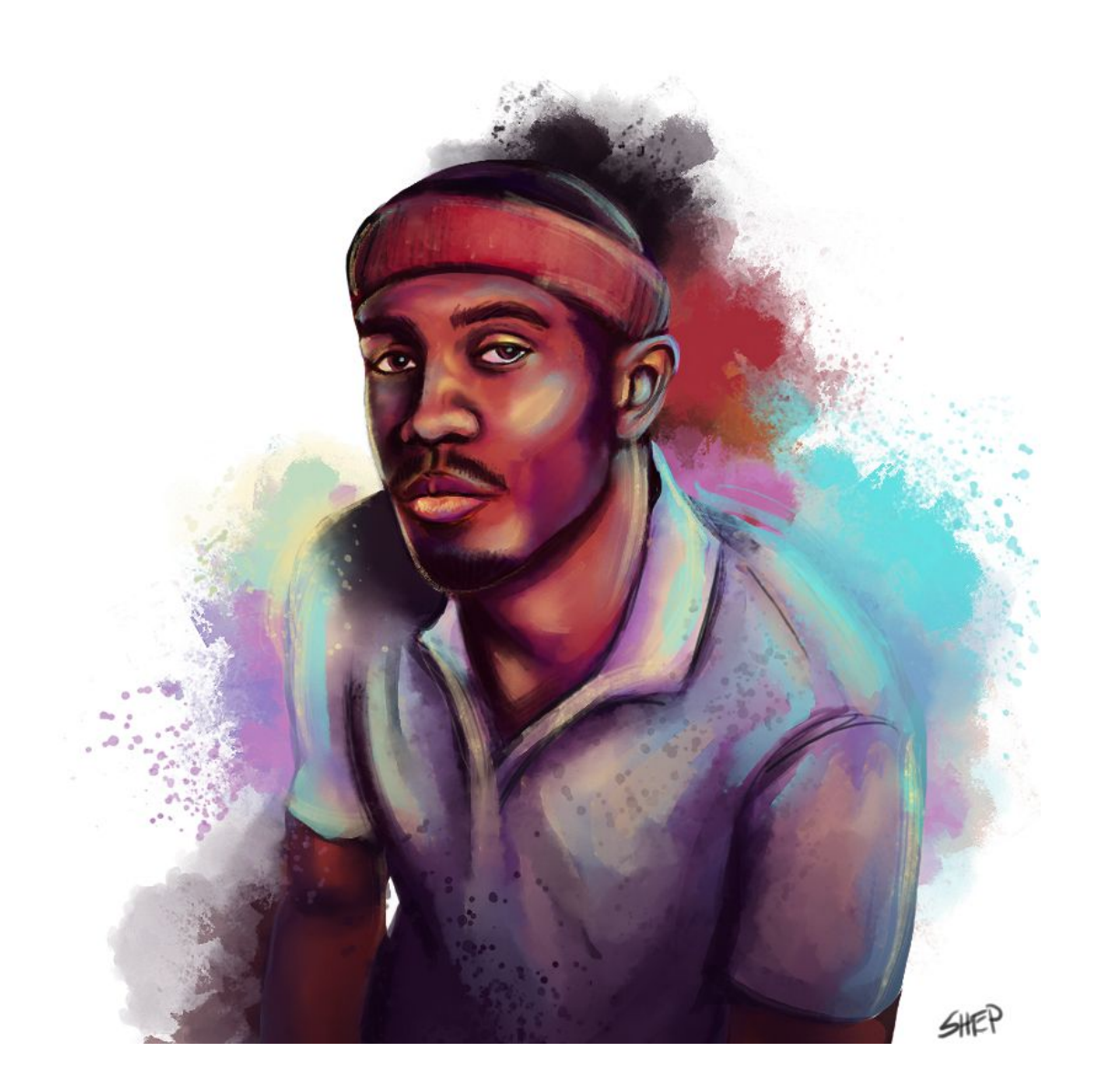
Figure 8: Self Control