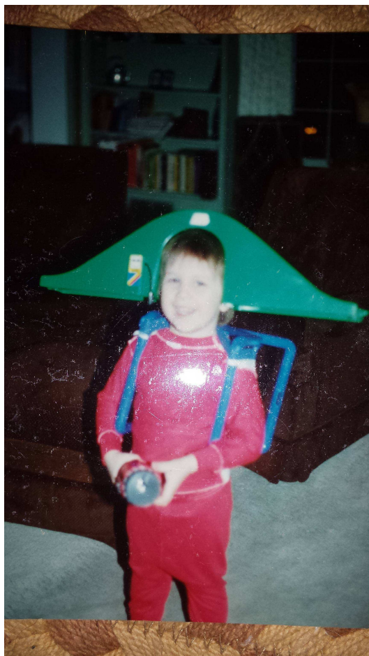
FIG. 2 Image of myself playing “Ghostbusters” 1992