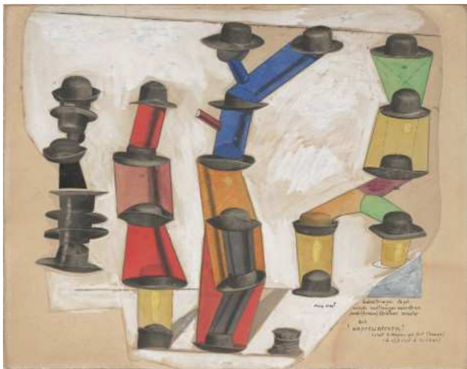
FIG. 4 The hat makes the Man. Max Ernst, 1920, Gouache, pencil, oil, and ink on cut-and-pasted printed paper on paper, 13 7/8 x 17 3/4" . MOMA, New York N.Y.