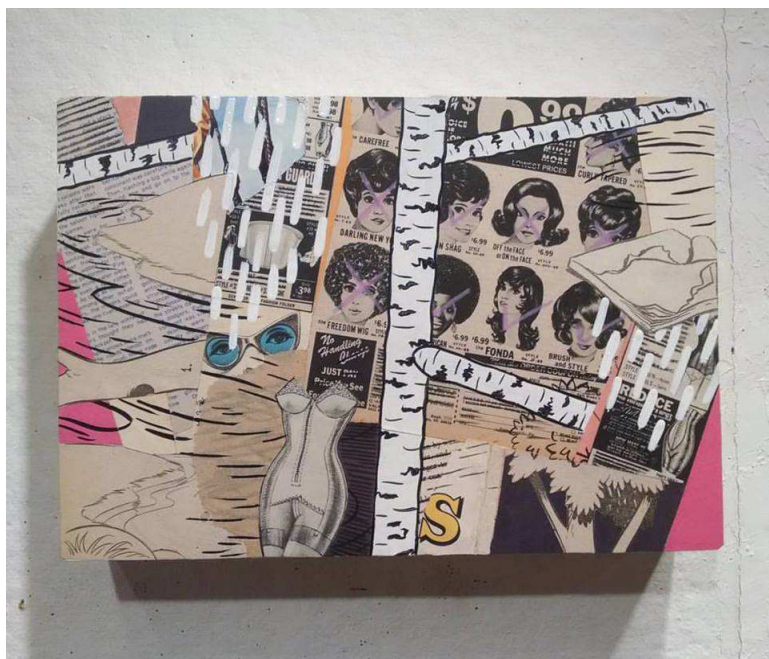
FIG. 5 Typical White Birches. Colin Ruff, Mixed Media, Dimensions Variable, 2015.