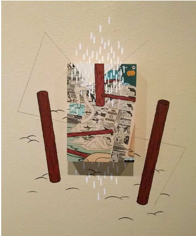
FIG.1 Accumulate Currency, Disregard Women Colin Ruff, Mixed Media, 2016.