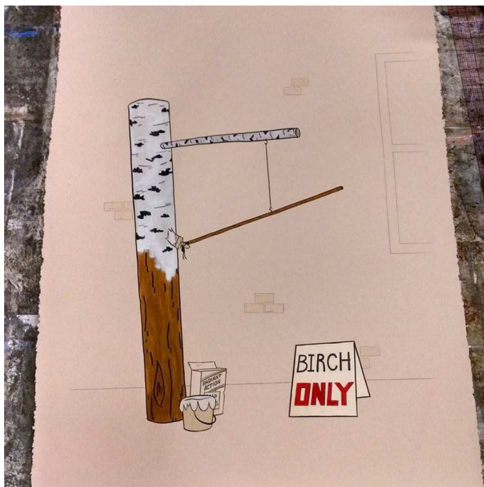
FIG. 6 Privilege Colin Ruff, Mixed media, 22"x 30", 2015.