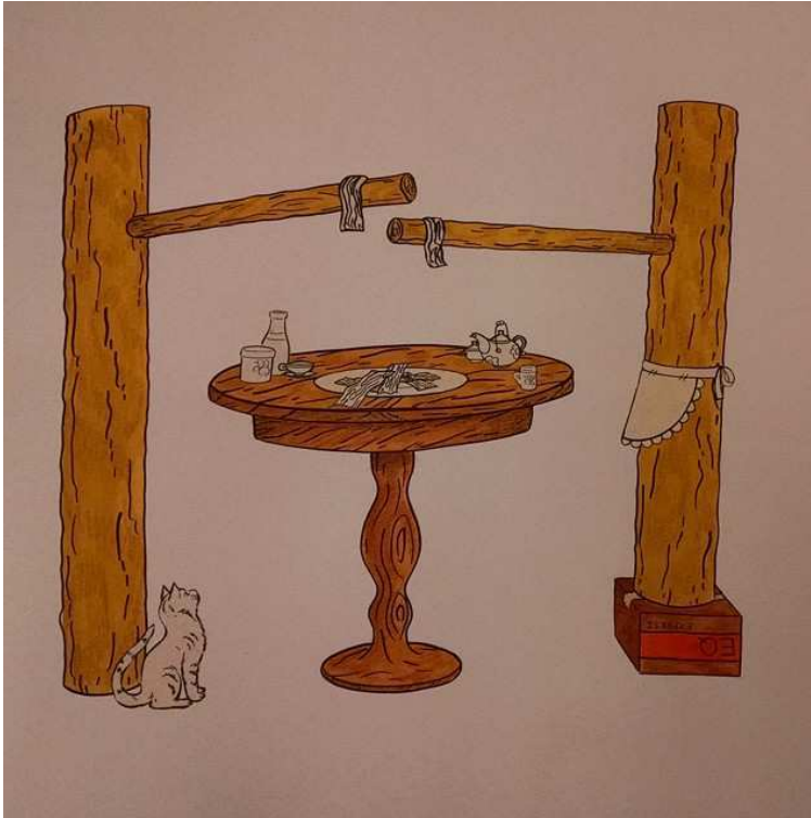
FIG. 7 Bring home the Bacon Colin Ruff, Mixed Media, 22" x 30", 2015.