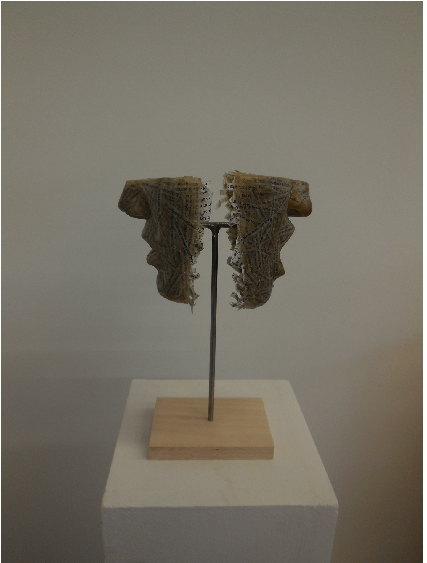
Figure 6: Use Your Words