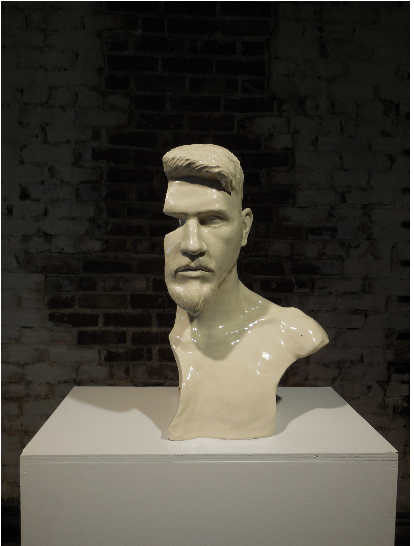
Figure 2: Self Portrait