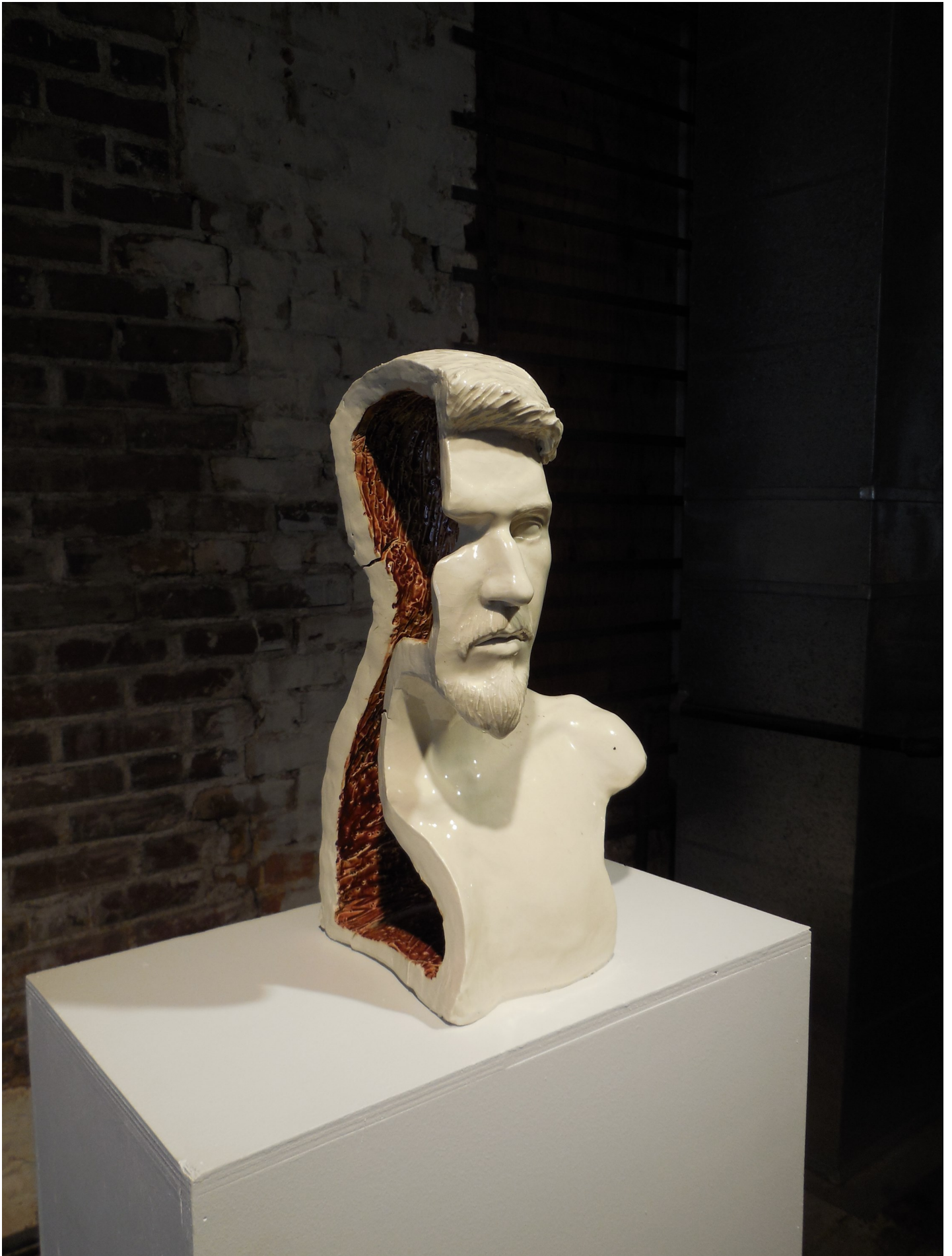
Figure 3: Self Portrait