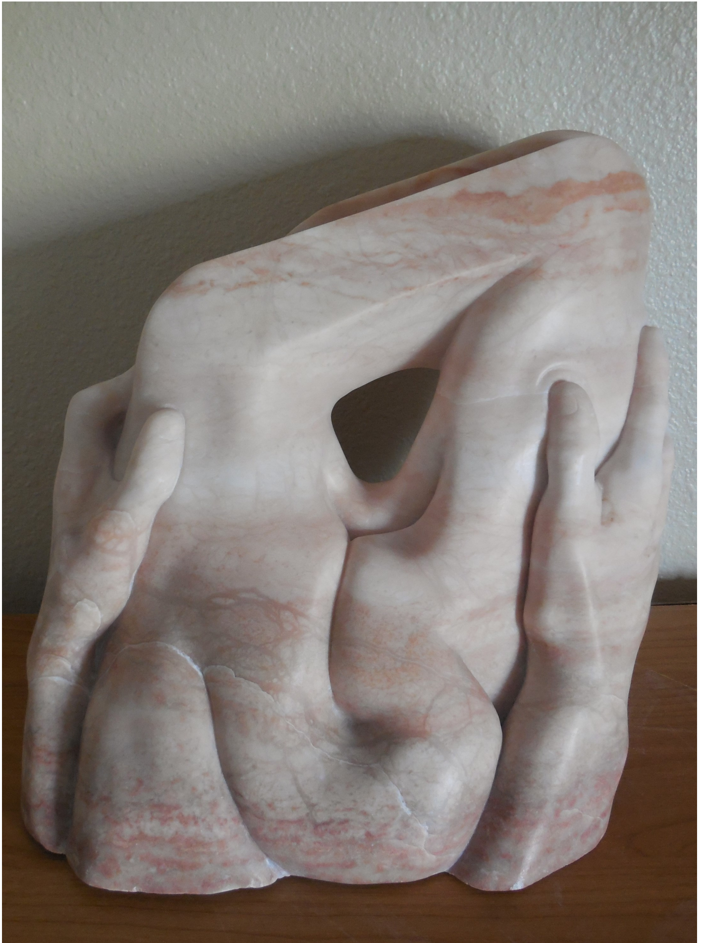
Figure 4: Desire