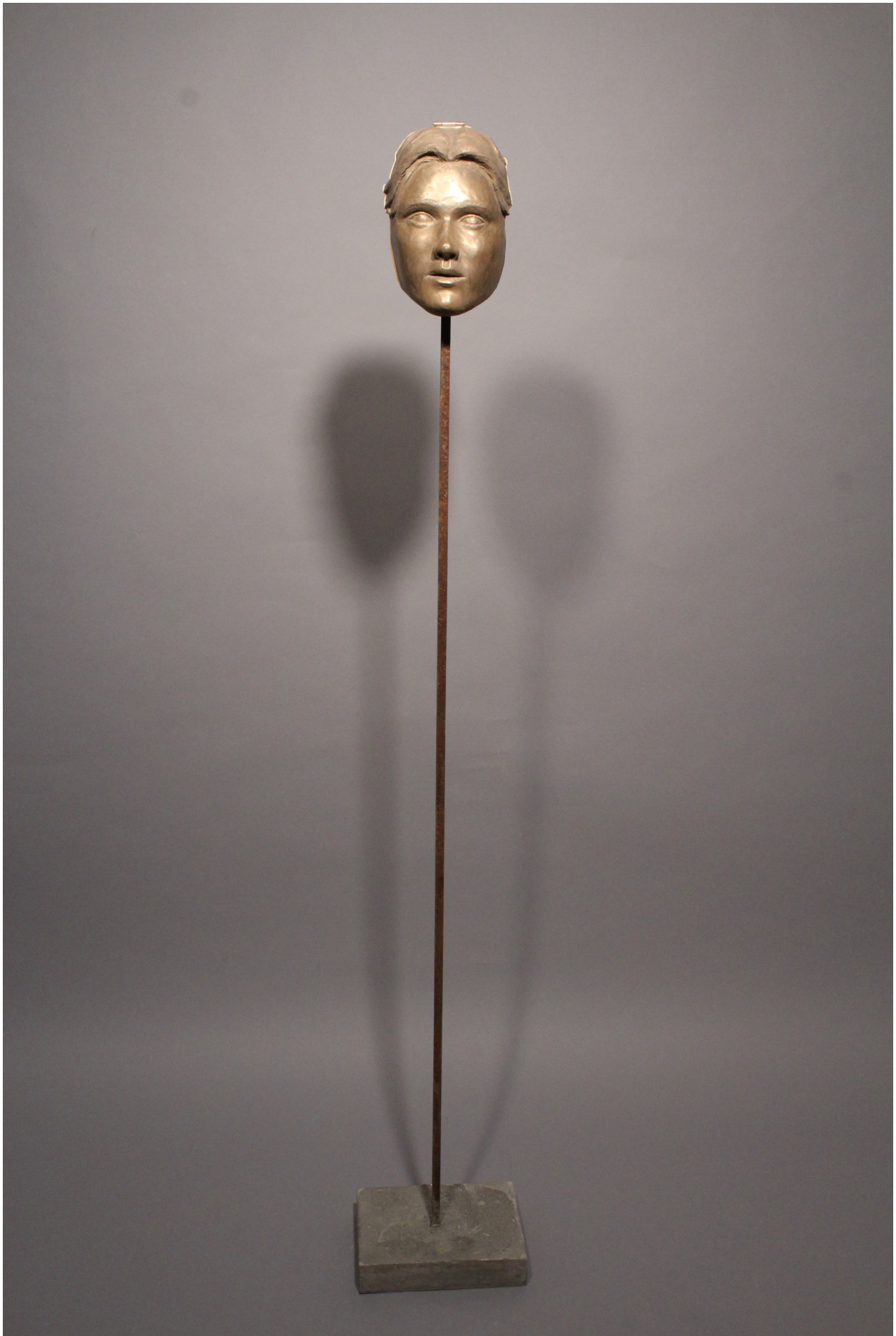
Figure 12: I Have a Secret and I'm Not Sharing