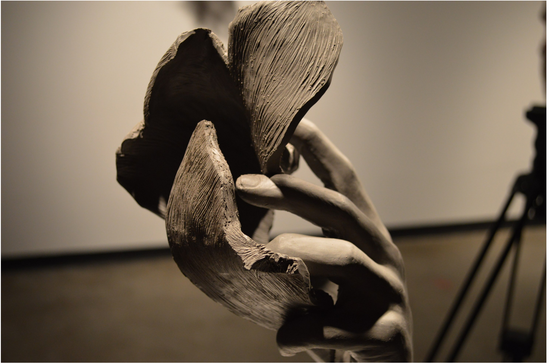
Figure 11: That Which We Cannot Have