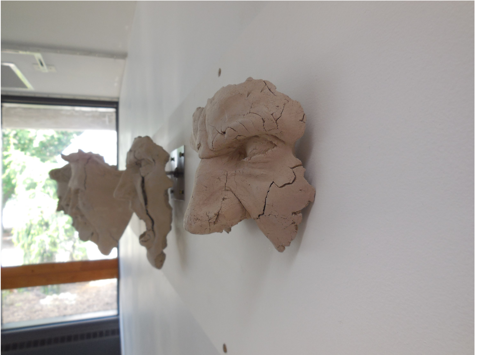
Figure 9: The Dissolution of Anger