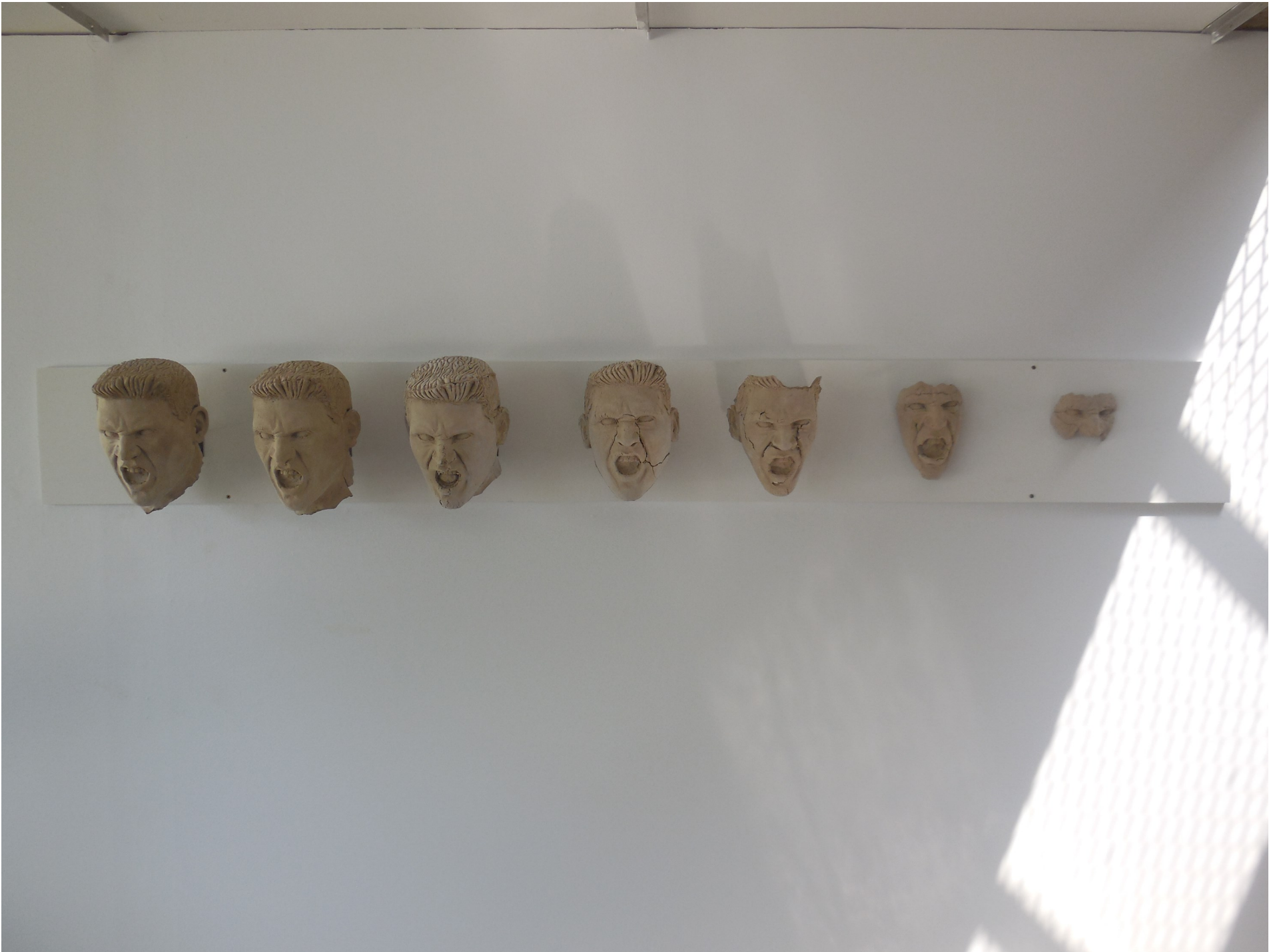
Figure 8: The Dissolution of Anger