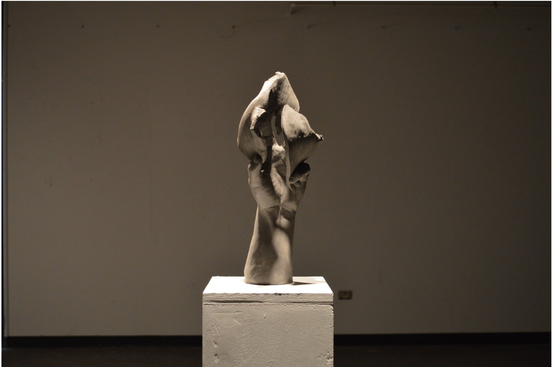
Figure 10: That Which We Cannot Have