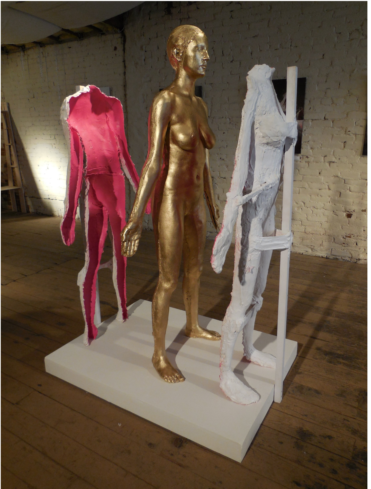
Figure 1: Molding a ♀