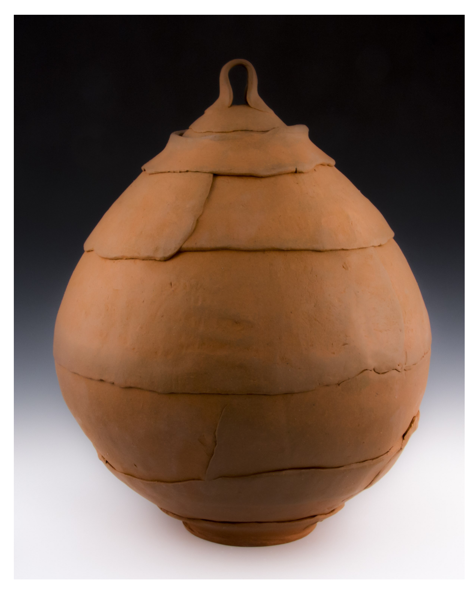
Figure 13: Large Red Jar