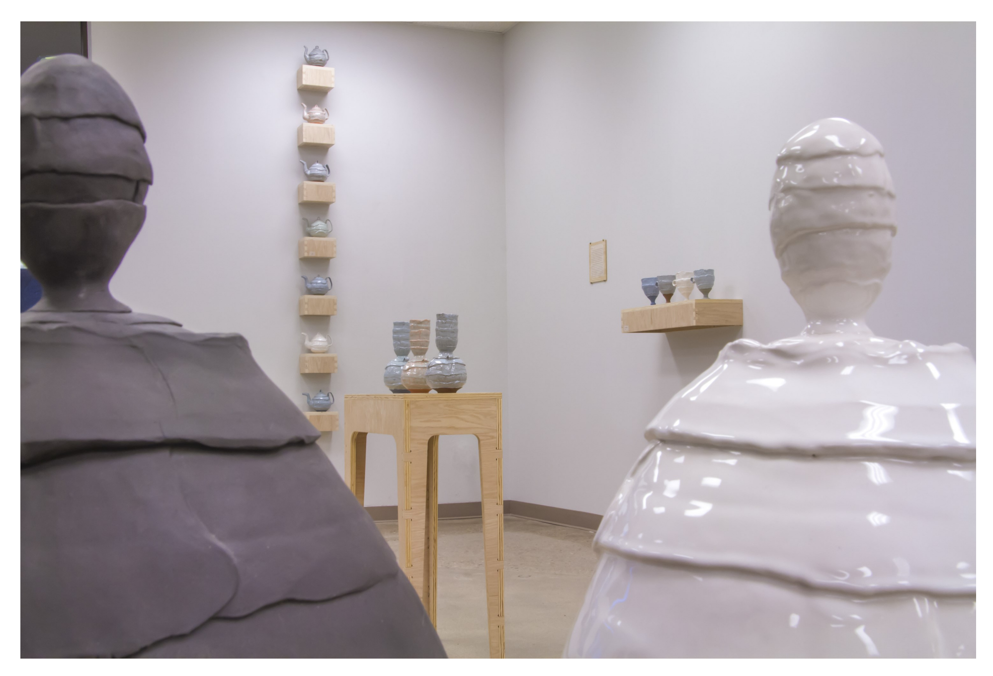
Figure 16: Harmony of Repetition