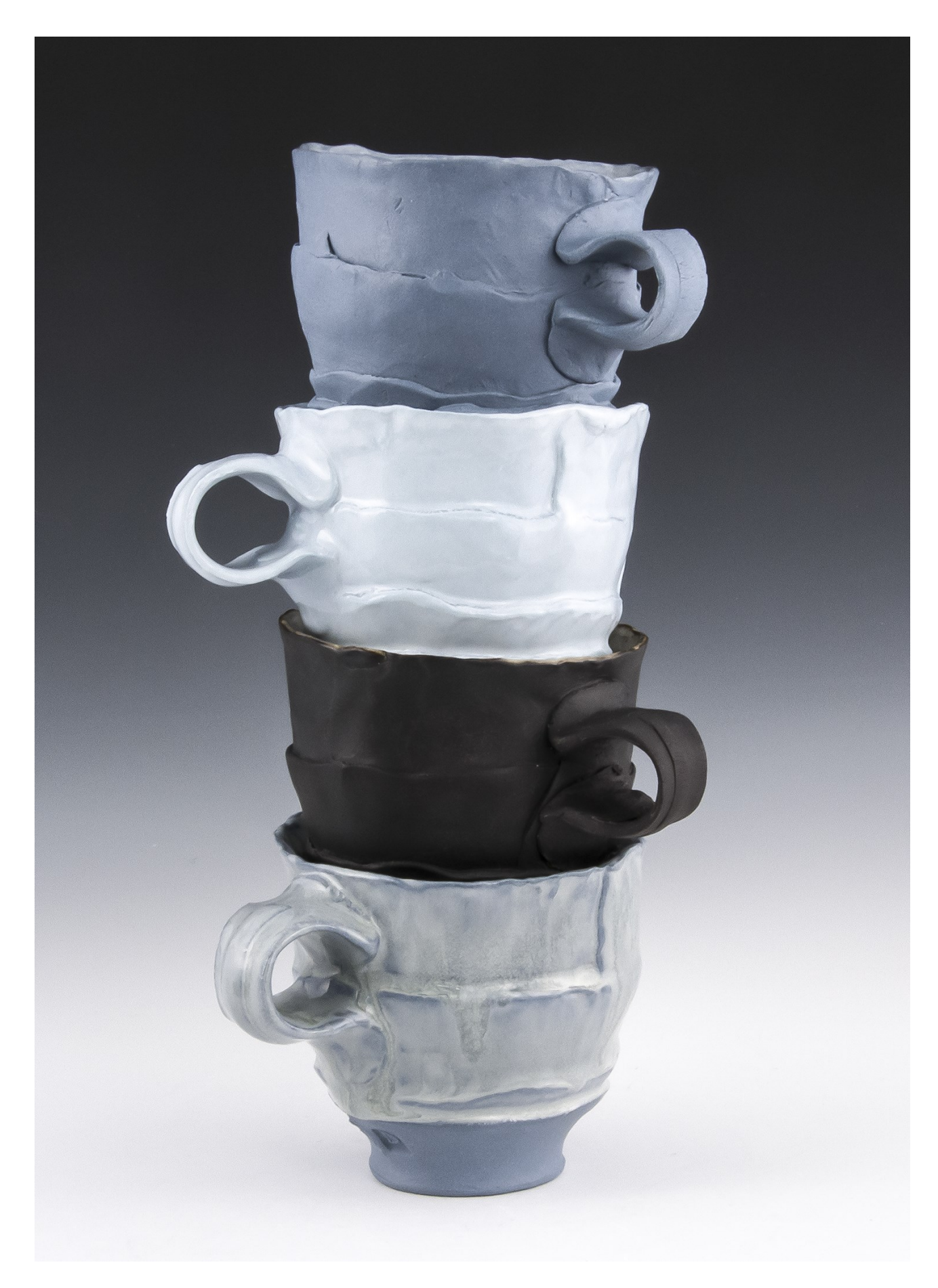
Figure 3: Mug Stack