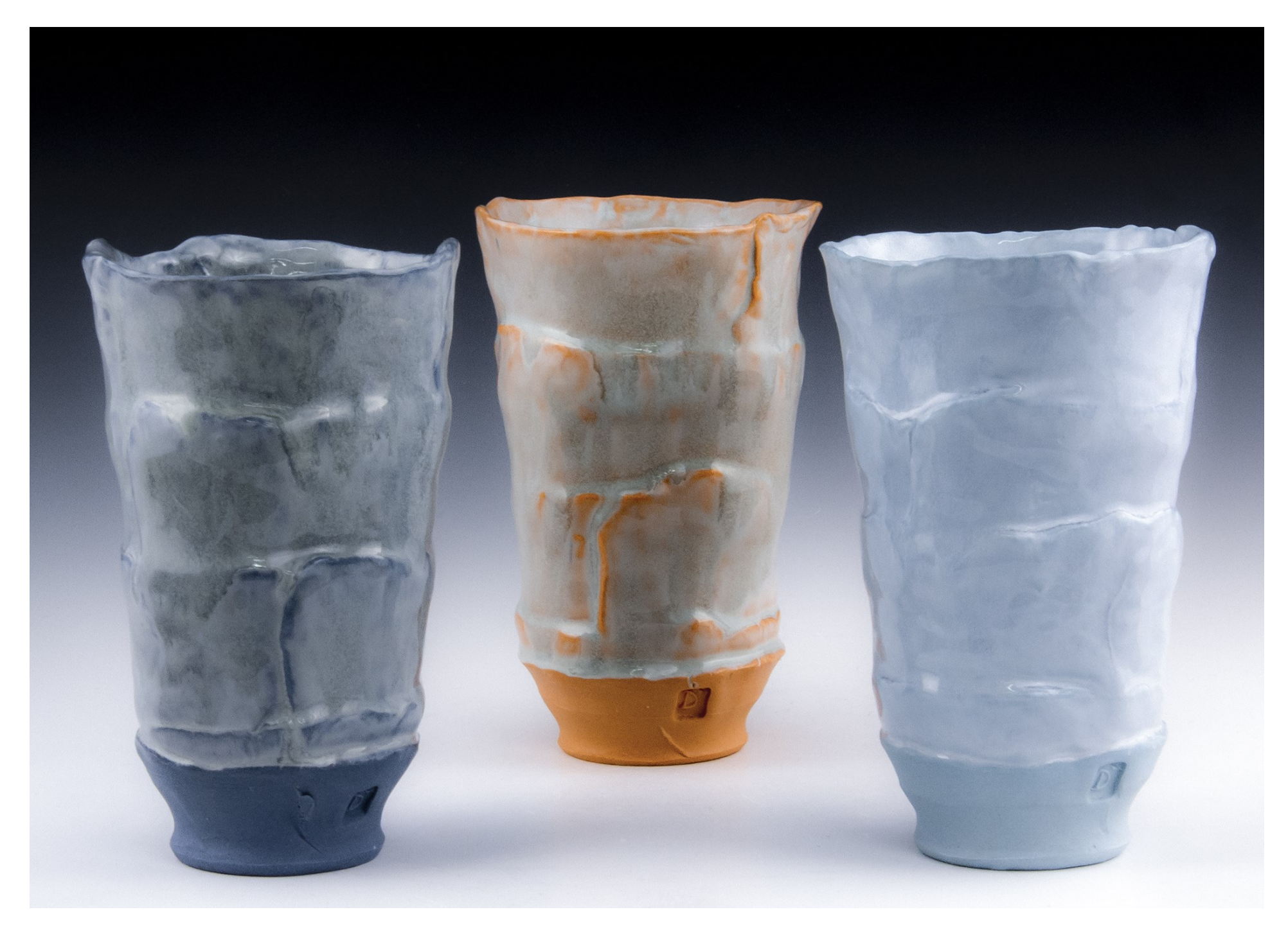
Figure 6: Tumblers