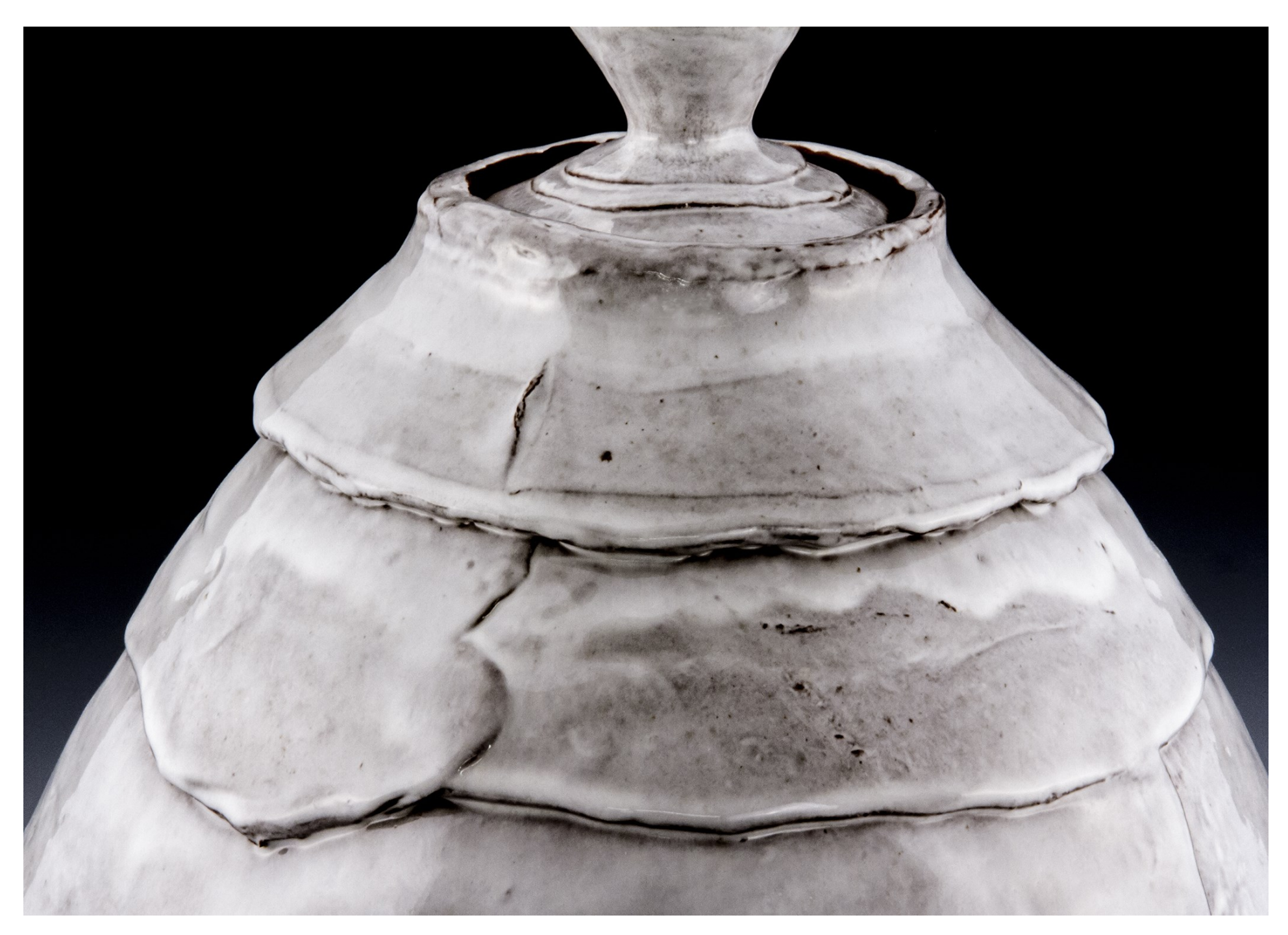
Figure 15: Large White Jar (Detail)