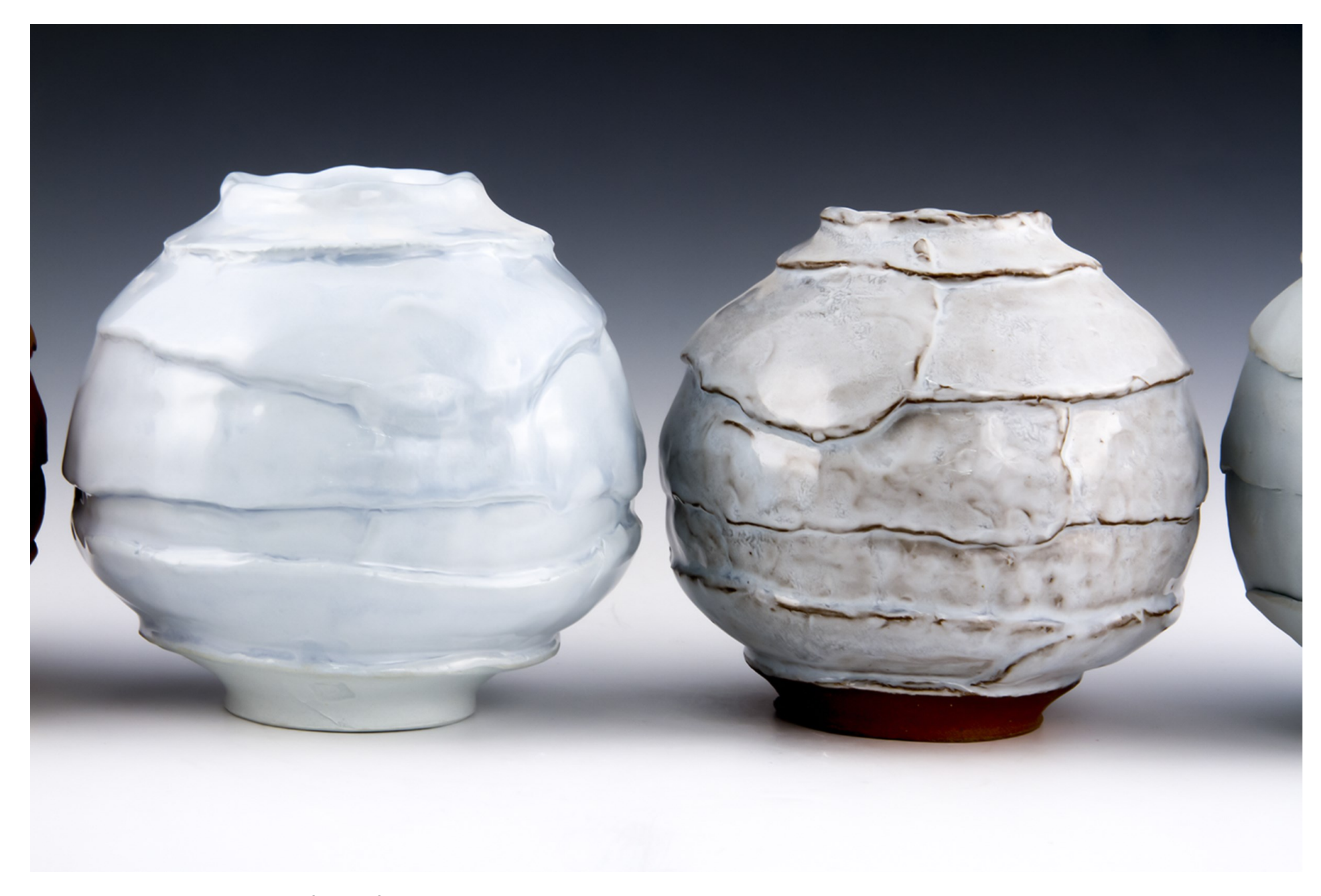
Figure 5: Blue Mini Moons (Detail)