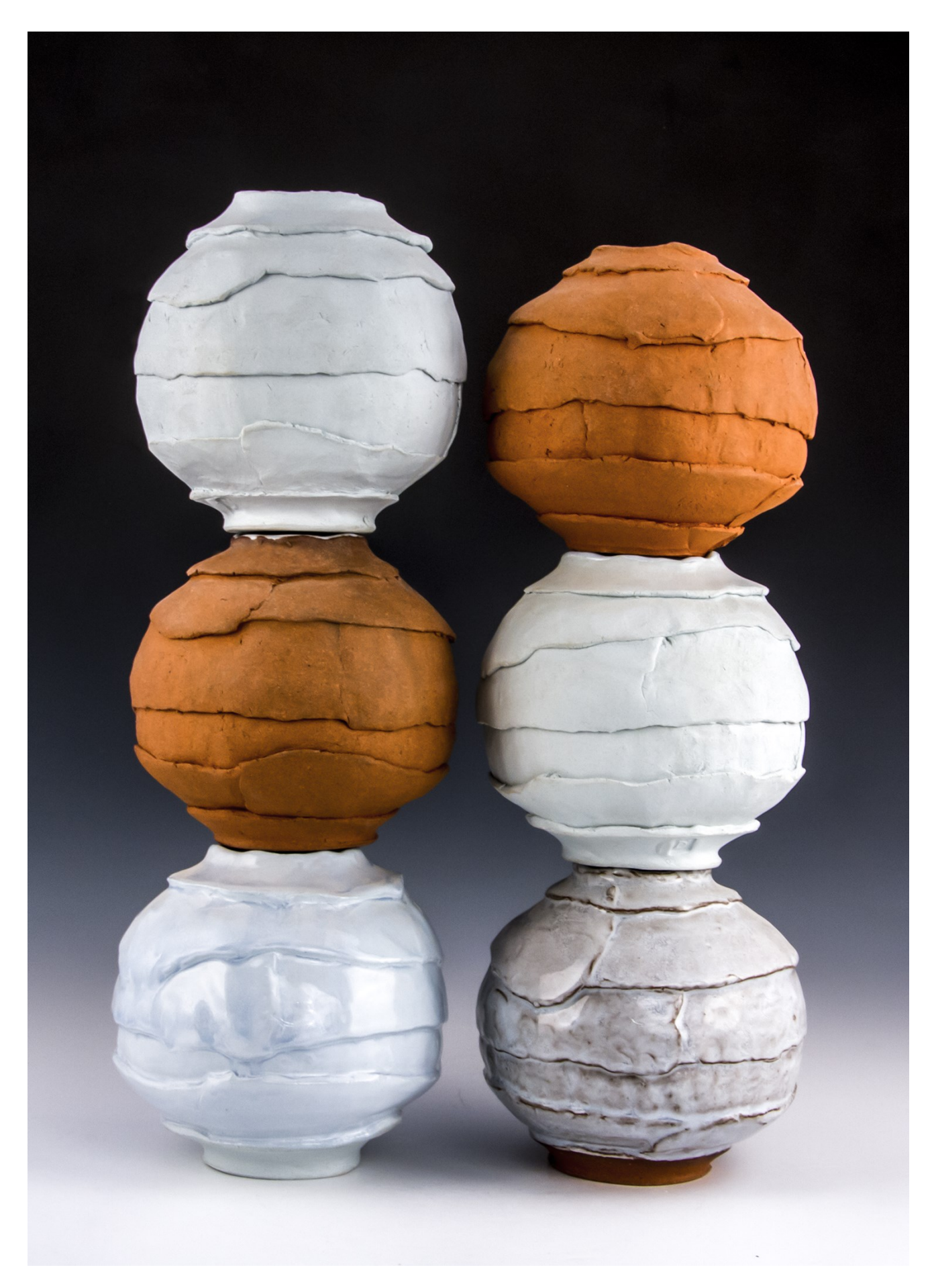
Figure 4: Blue Mini Moons