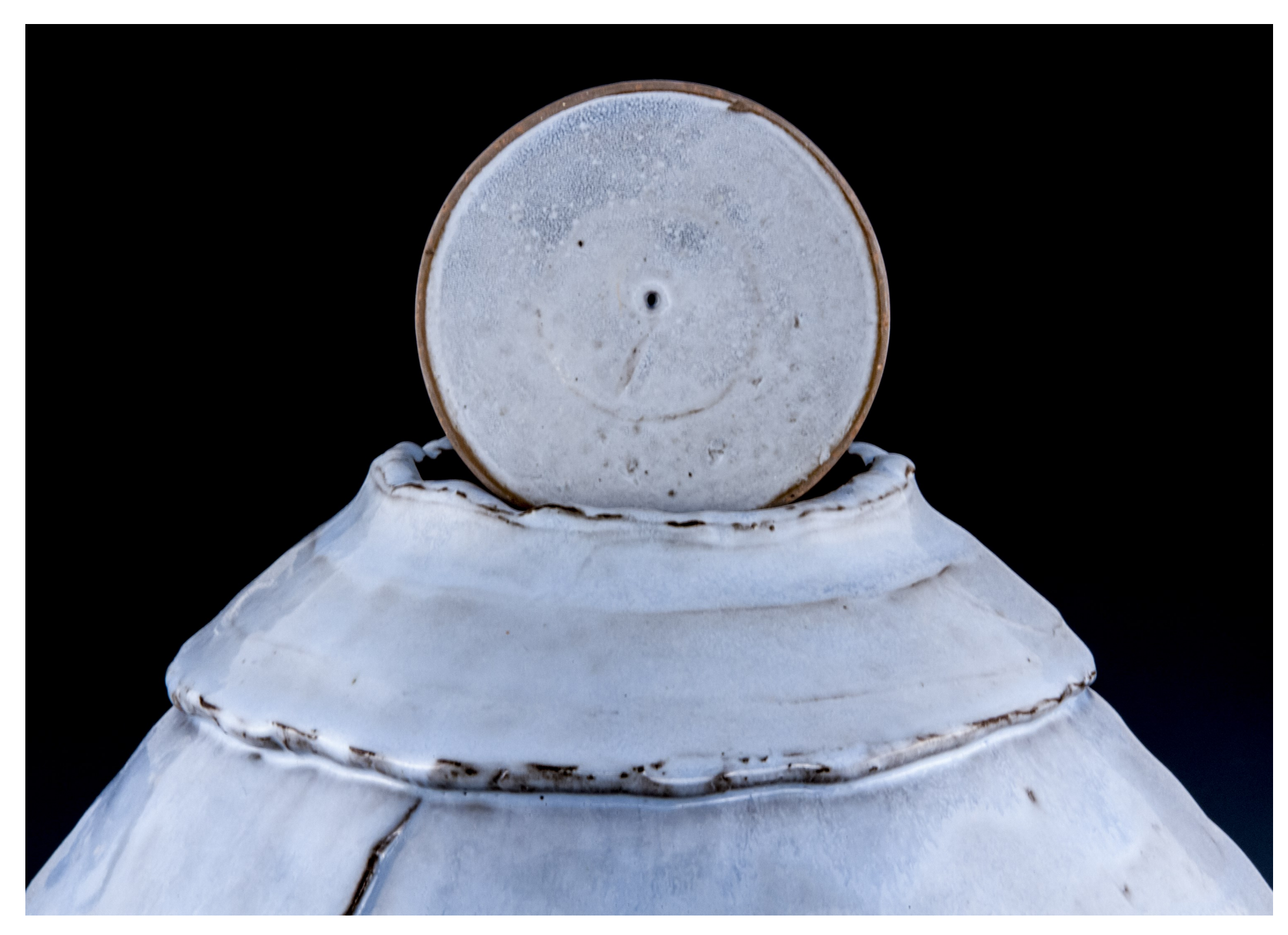
Figure 12: Large Blue Jar (Detail)