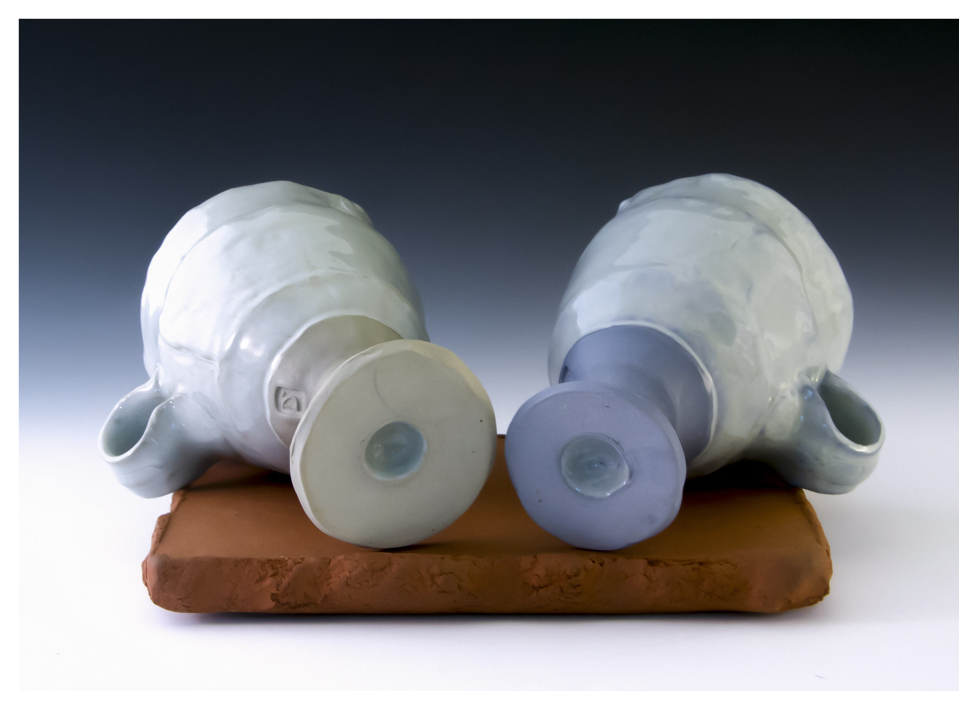
Figure 8: Snifters Pair (Bottom)