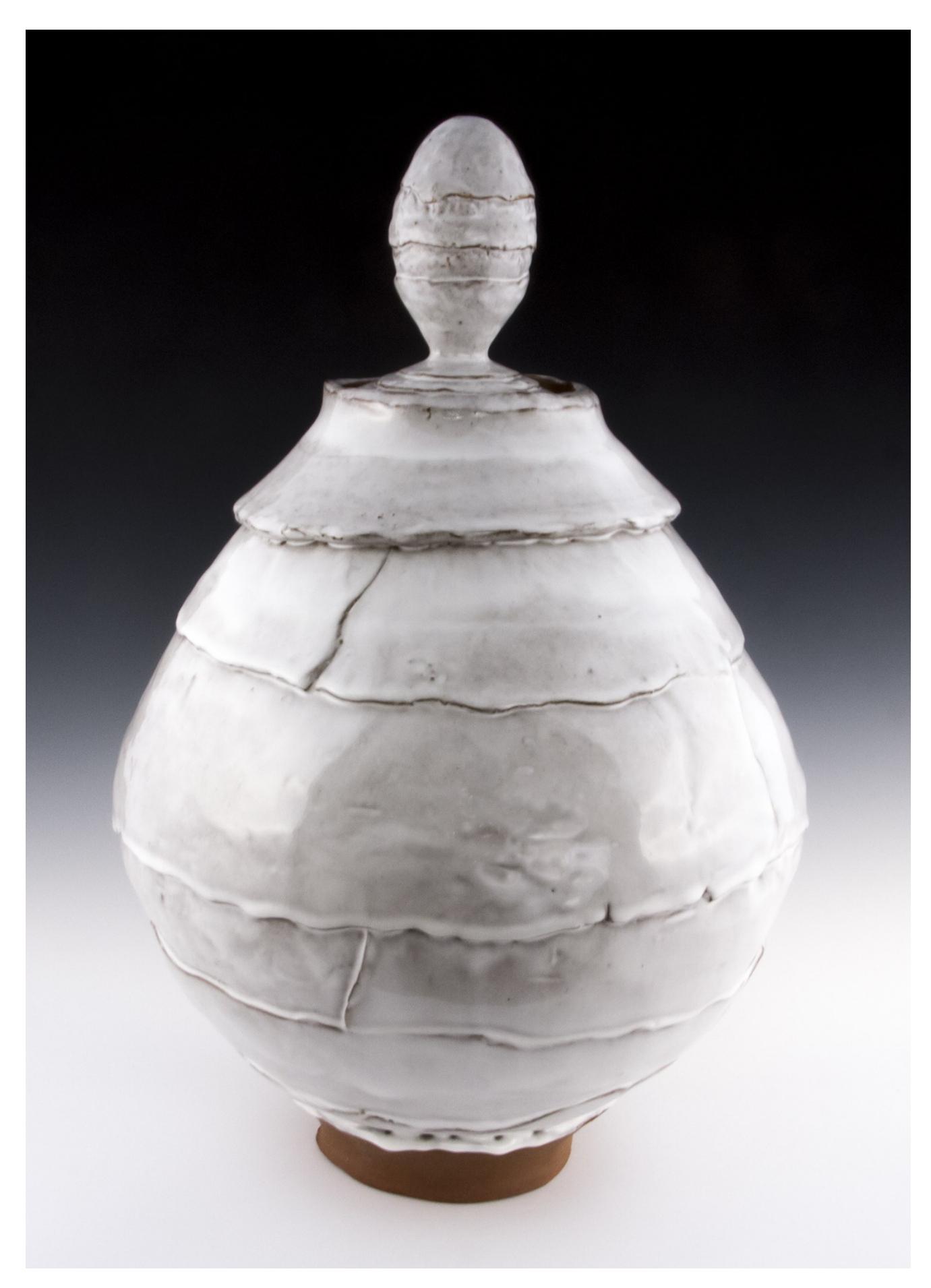
Figure 14: Large White Jar