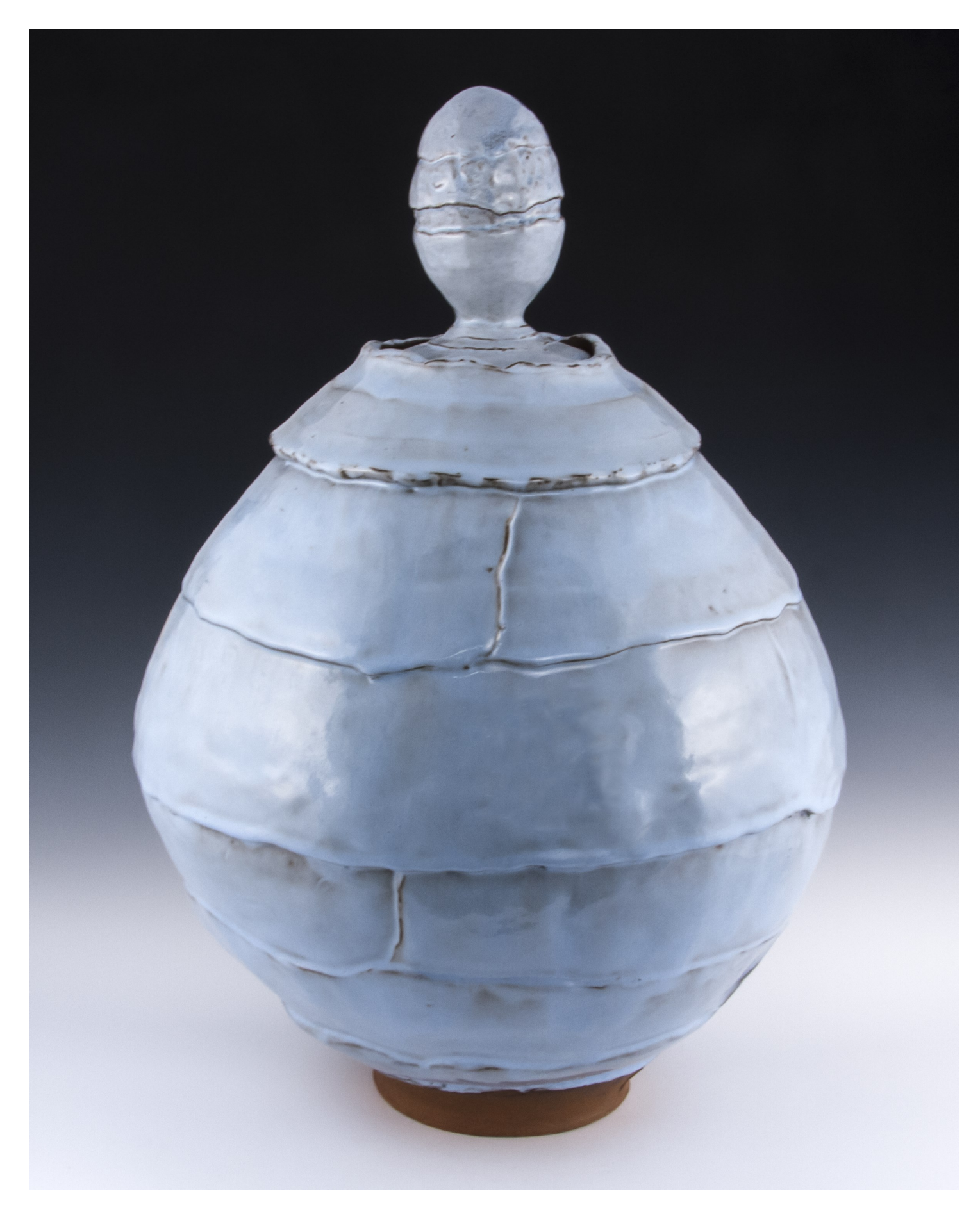
Figure 11: Large Blue Jar