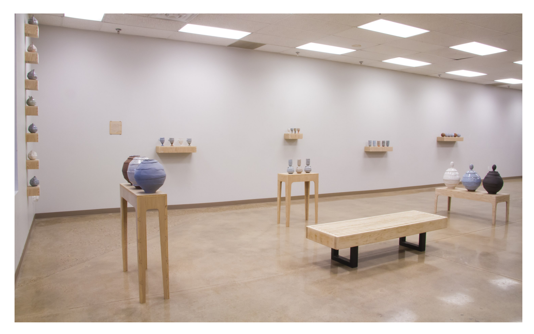
Figure 17: Harmony of Repetition