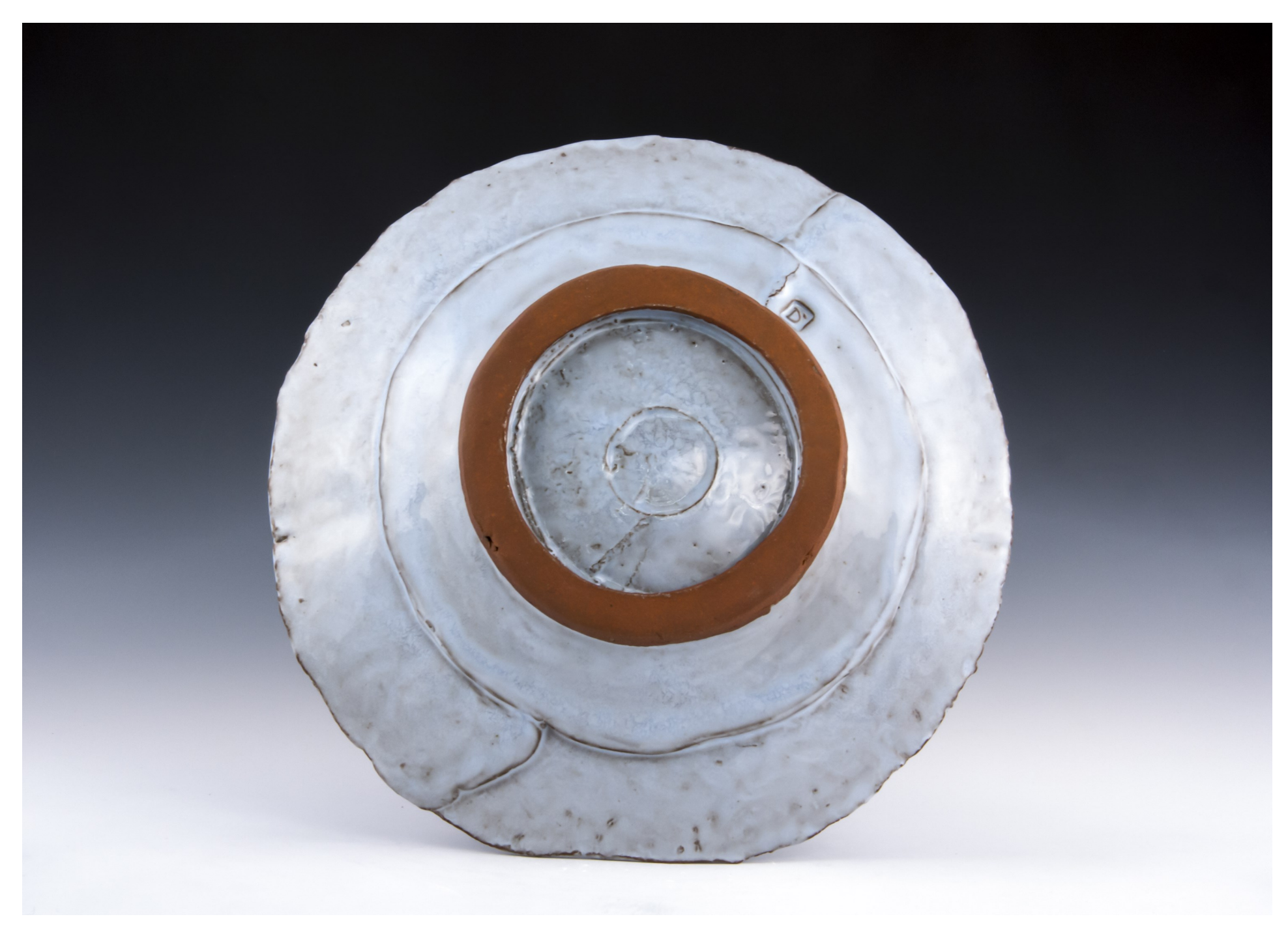
Figure 10: Blue Saucer (Bottom)