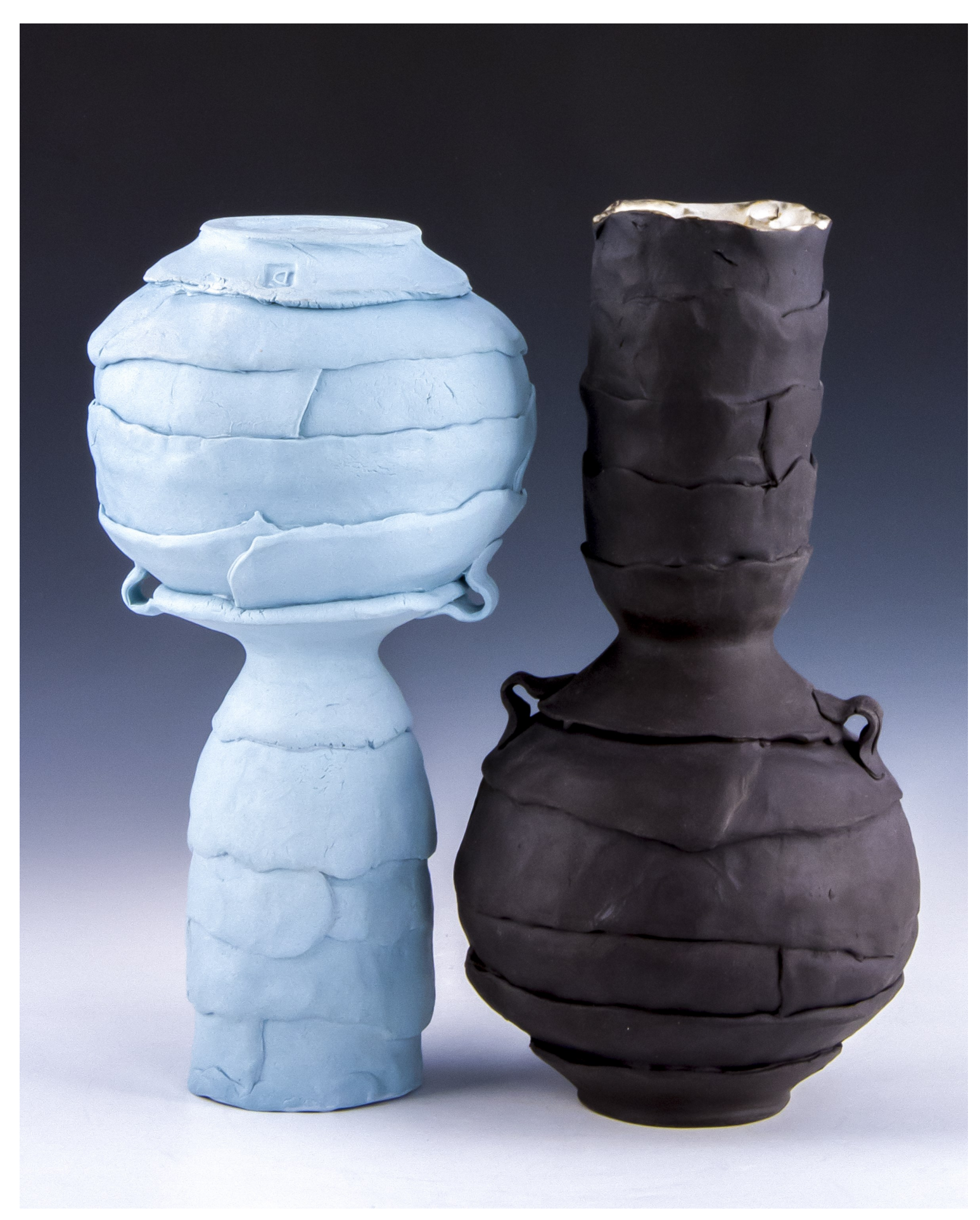
Figure 2: Black and Blue Bottles