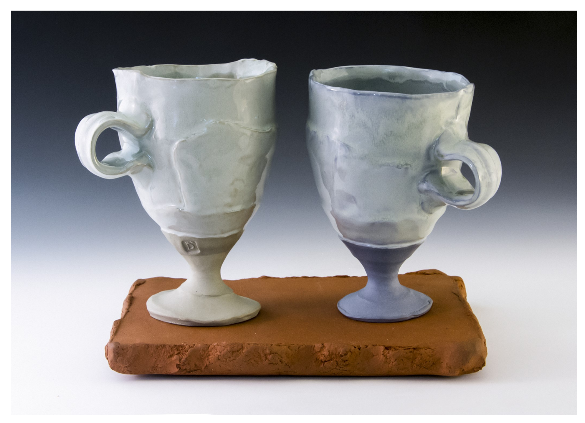
Figure 7: Snifters Pair