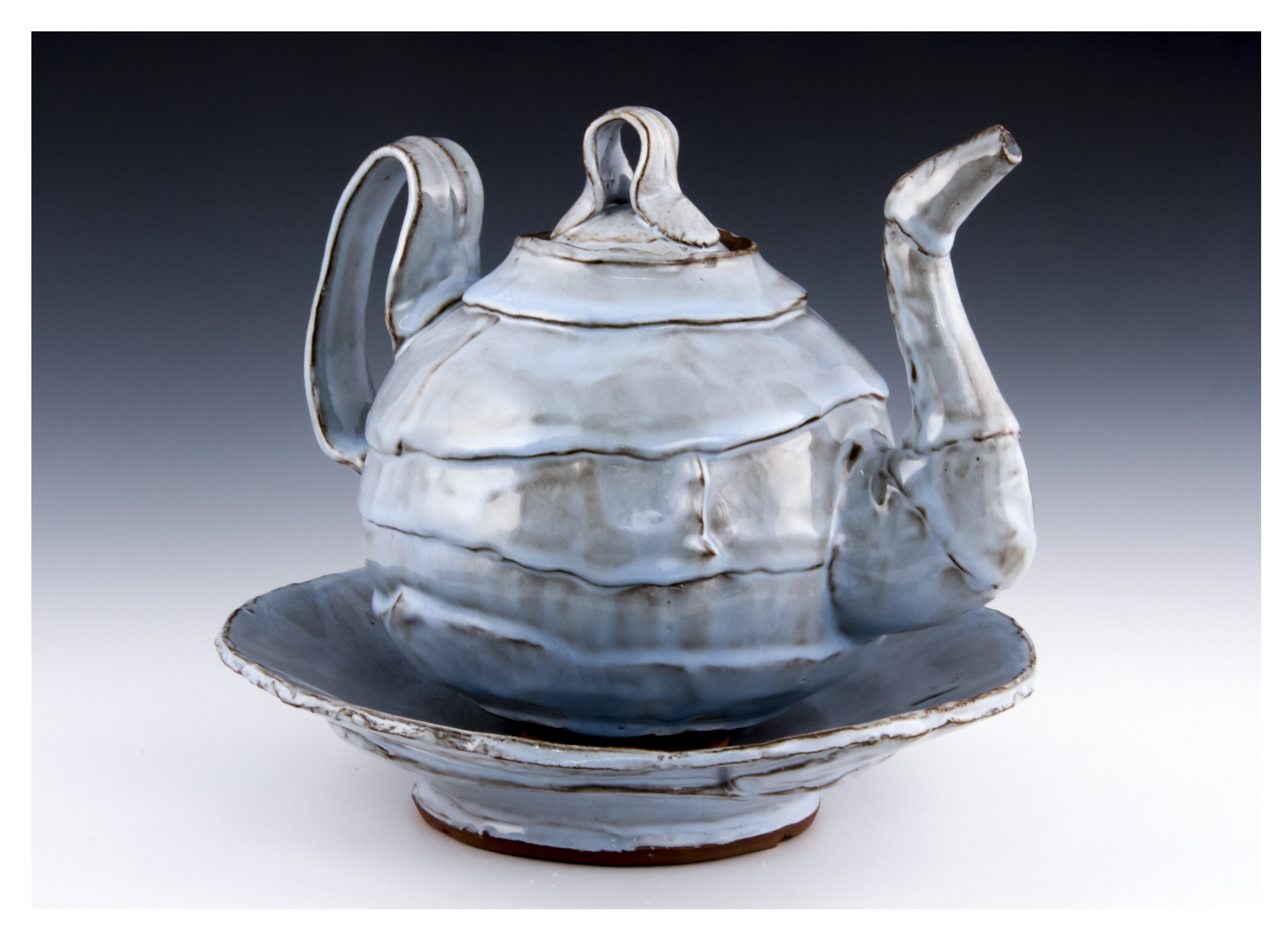
Figure 9: Blue Teapot and Saucer