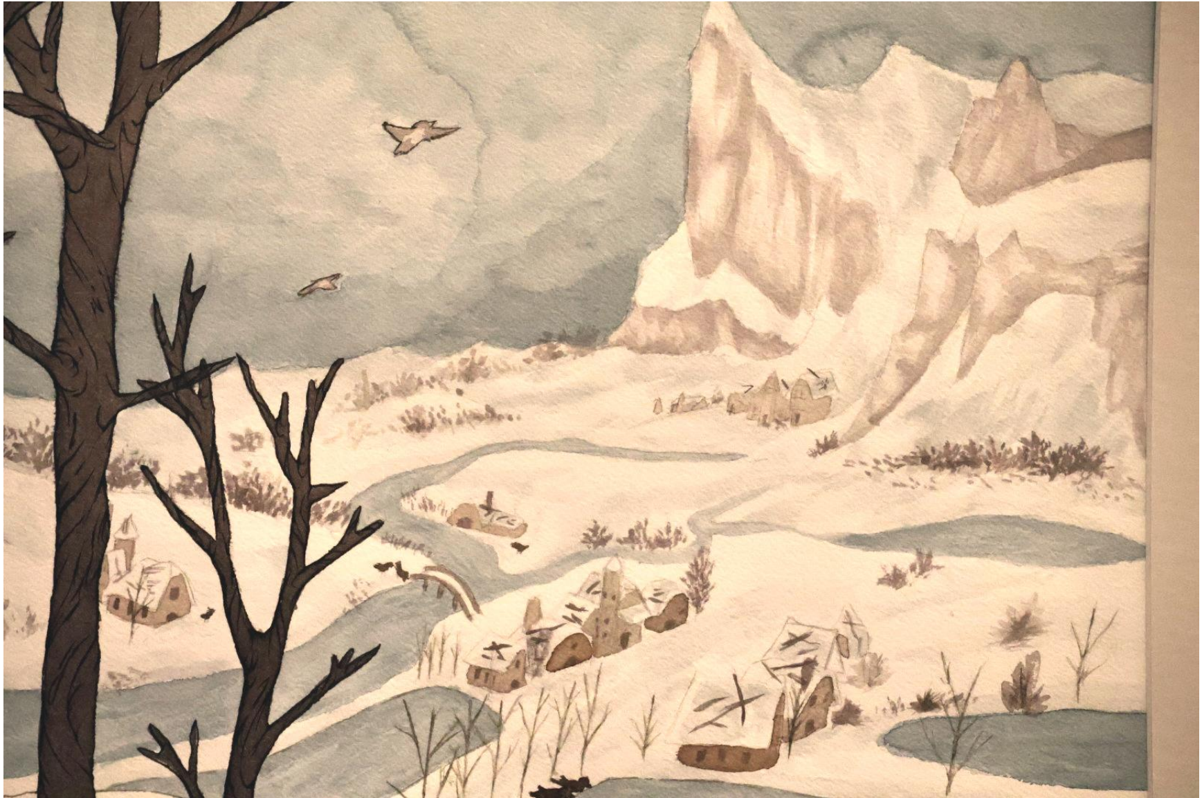
Figure 11: The Pigeons in the Snow (Inspired by Pieter Brugel's Hunters in the Snow) (Detail)