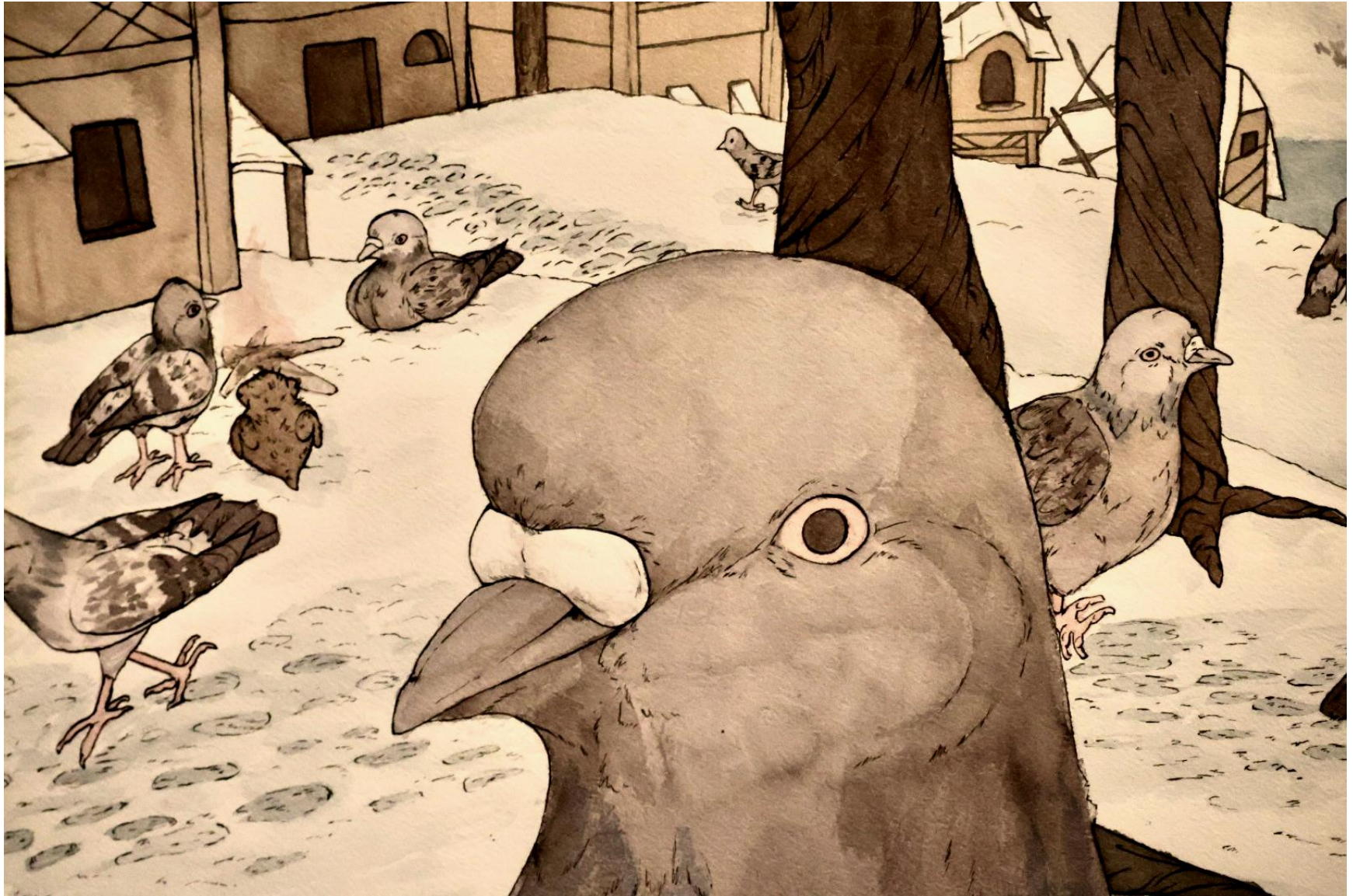
Figure 12: The Pigeons in the Snow (Inspired by Pieter Bruegel's Hunters in the Snow) (Detail)