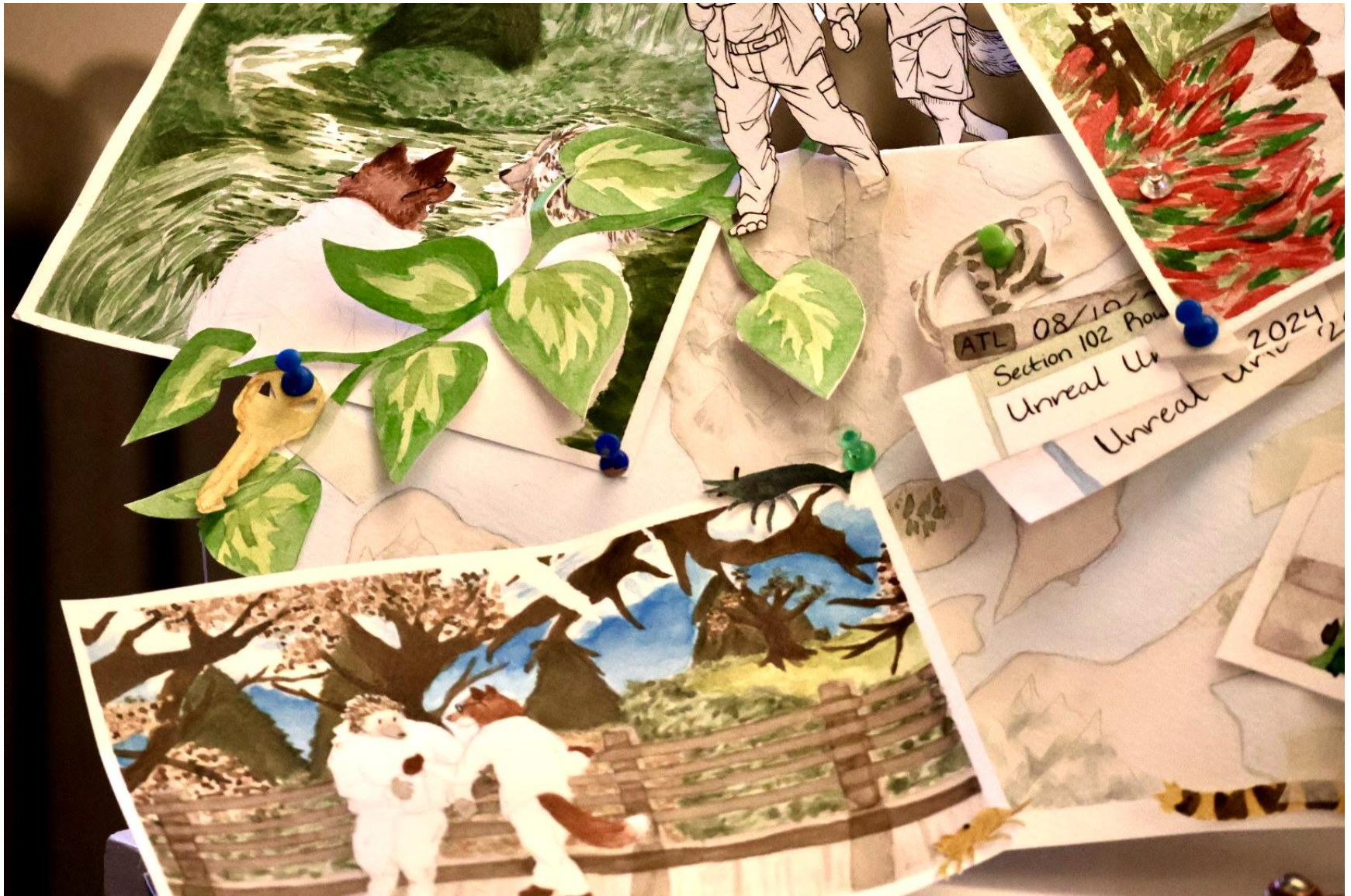
Figure 4: To Many More (Detail)