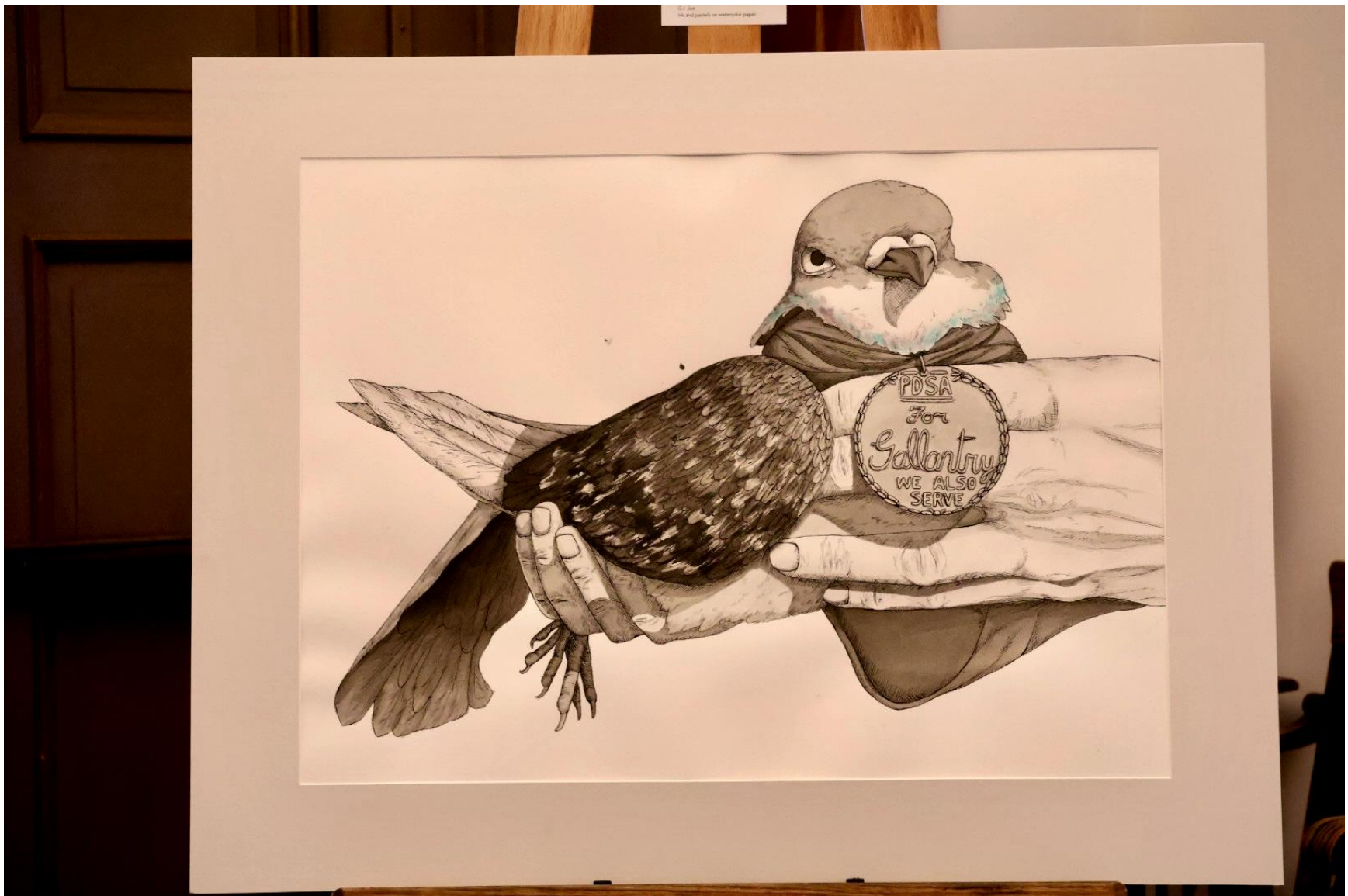
Figure 9: G.I. Joe