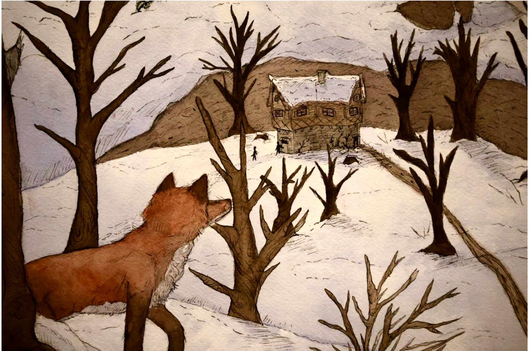
Figure 8: Tuesday Morning, Feb. (Detail)