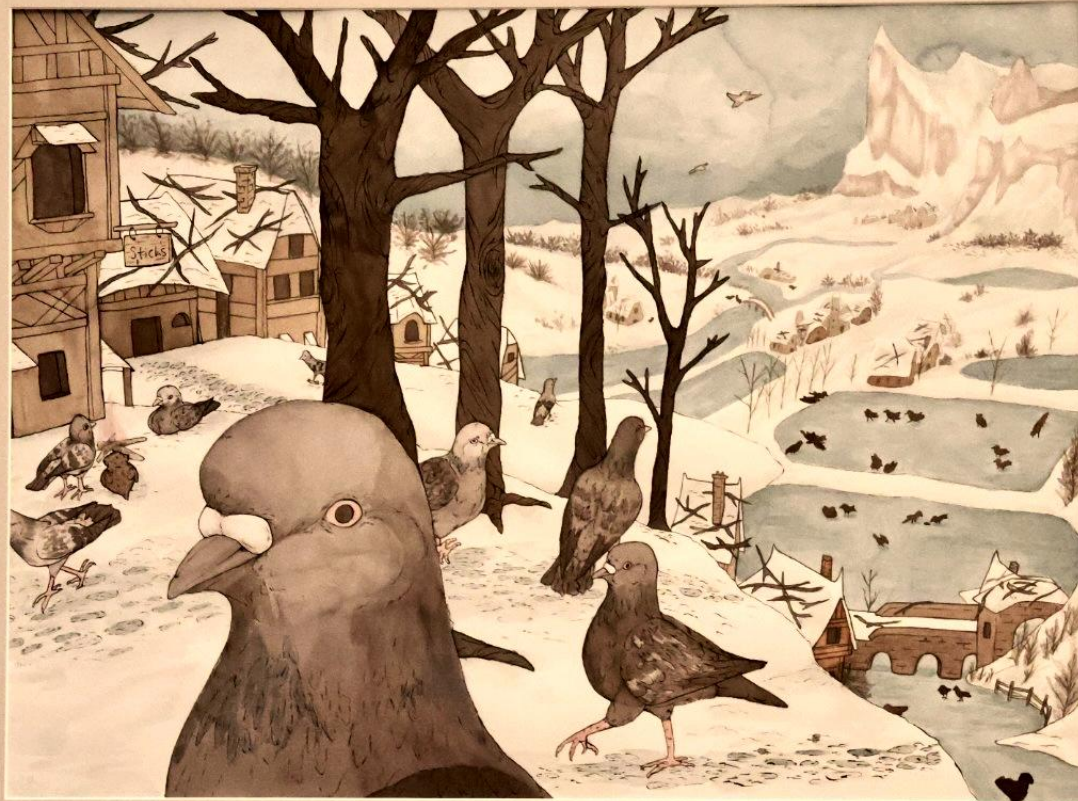
Figure 10: The Pigeons in the Snow (Inspired by Pieter Brugel's Hunters in the Snow)