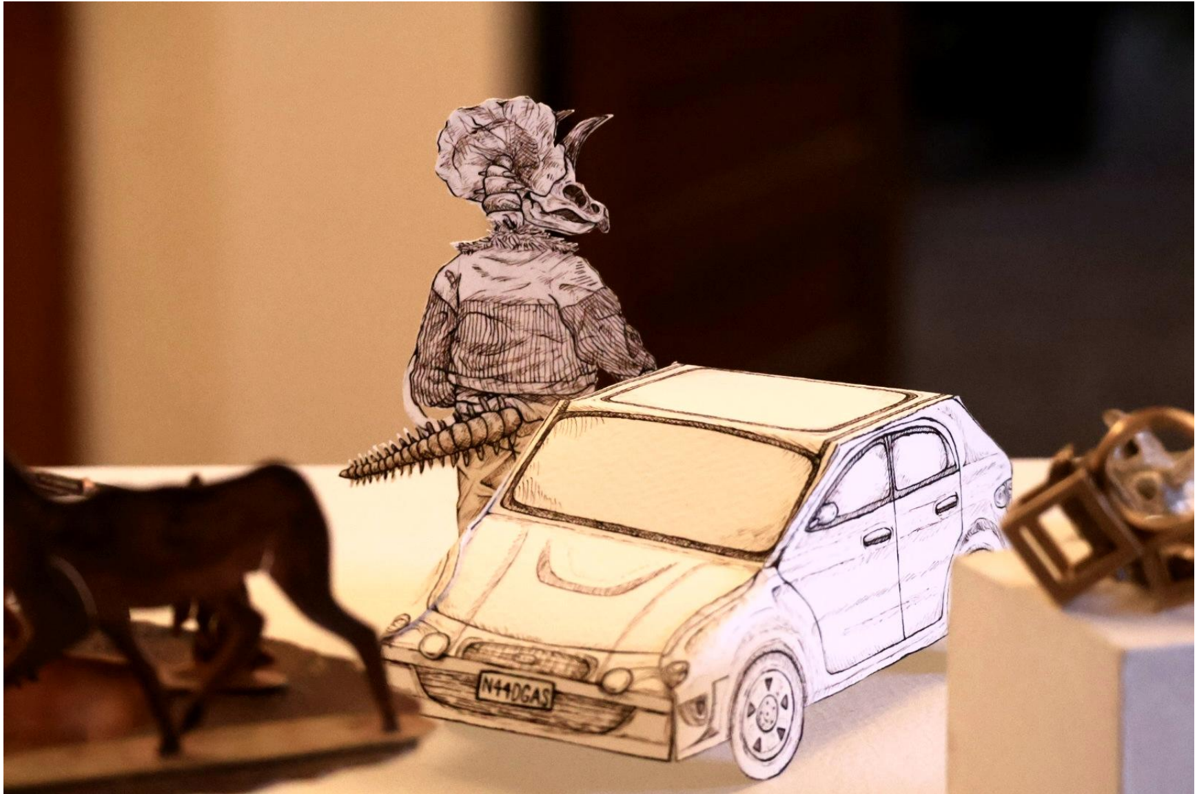
Figure 2: Fossil Fuel (Detail)