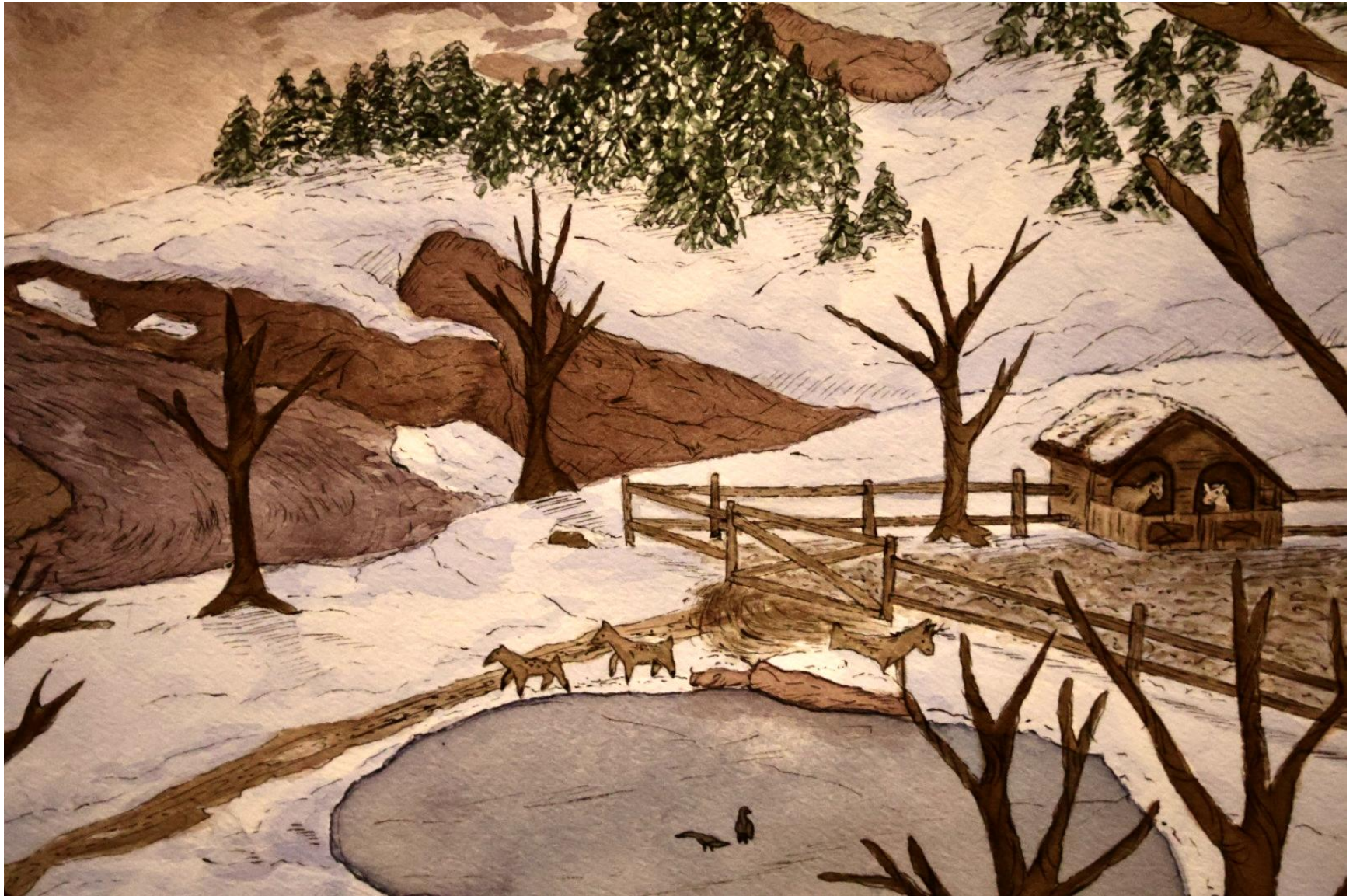
Figure 7: Tuesday Morning, Feb. (Detail)