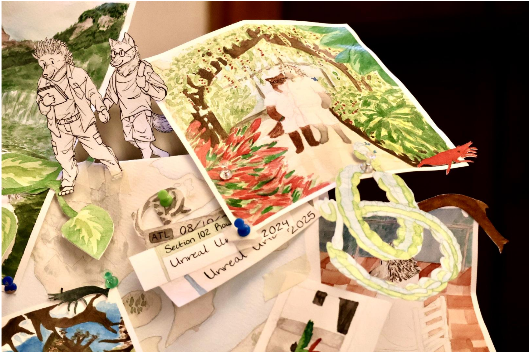
Figure 5: To Many More (Detail)