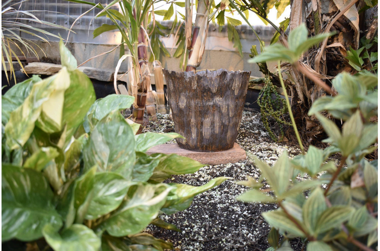
Figure 3: Boscoyo I