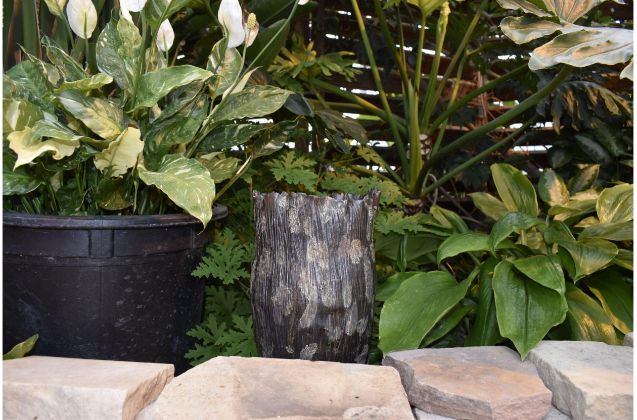
Figure 4: Boscoyo III