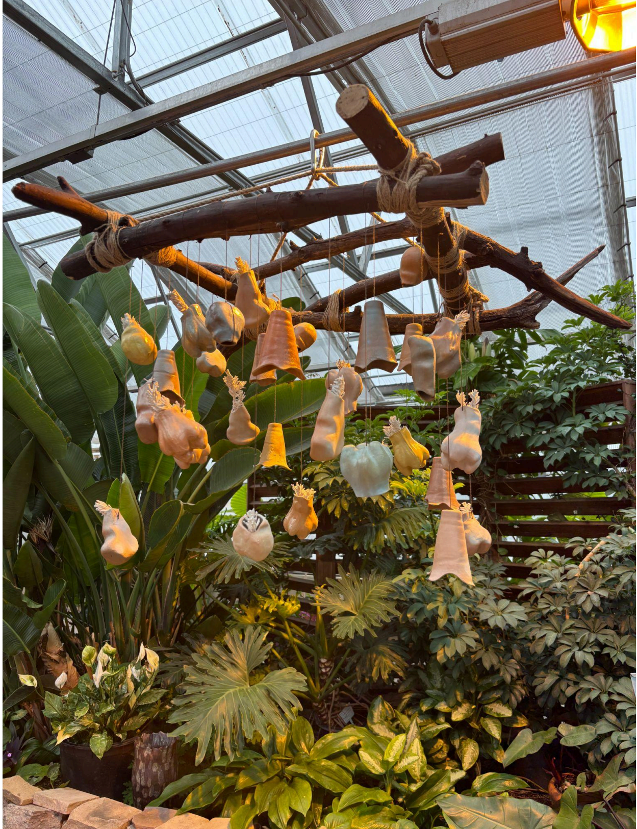
Figure 1: Rooted Remnants