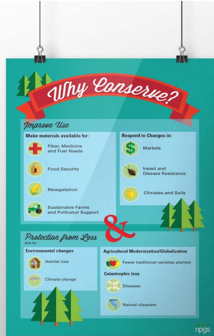
Figure 8: NPGS, Informational Posters