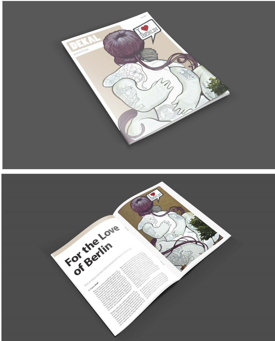
Figure 1: Dekal Magazine