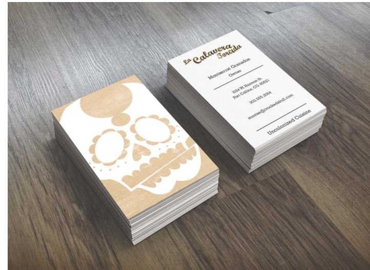
Figure 3: La Calavera Torcida (The Crooked Skull) Restaurant Corporate Package