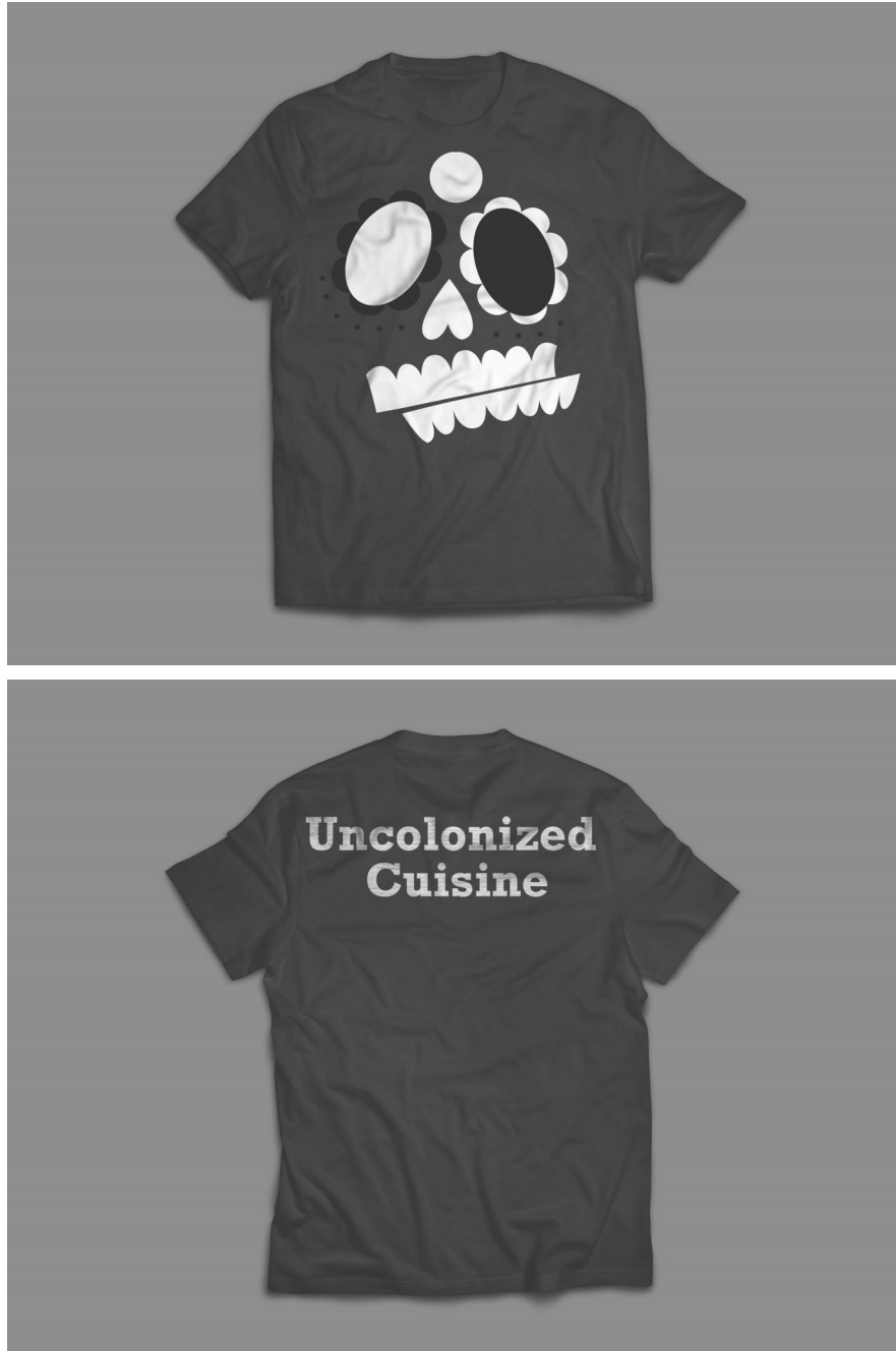
Figure 4: La Calavera Torcida, Server Shirt Design