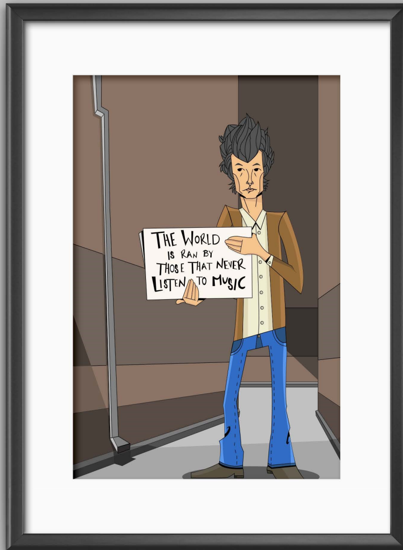
Figure 6: Bob Dylan, Editorial Illustration