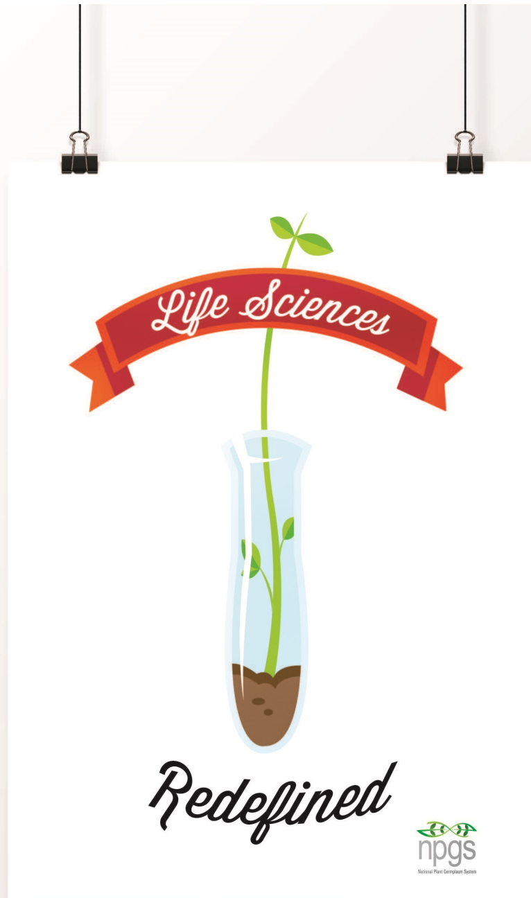
Figure 9: NPGS, Life Sciences Redefined