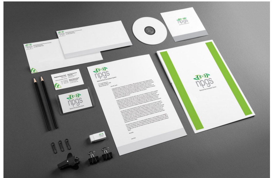
Figure 7: National Plant Germplasm Systems (NPGS) Corporate Branding