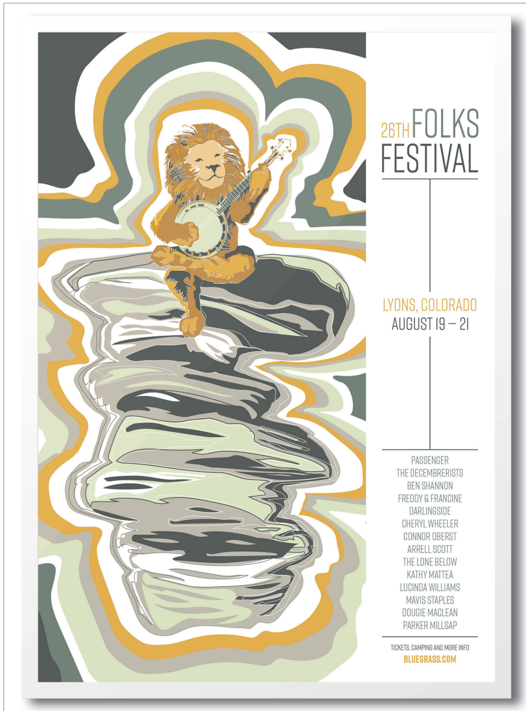
Figure 3: Folks Festival Poster