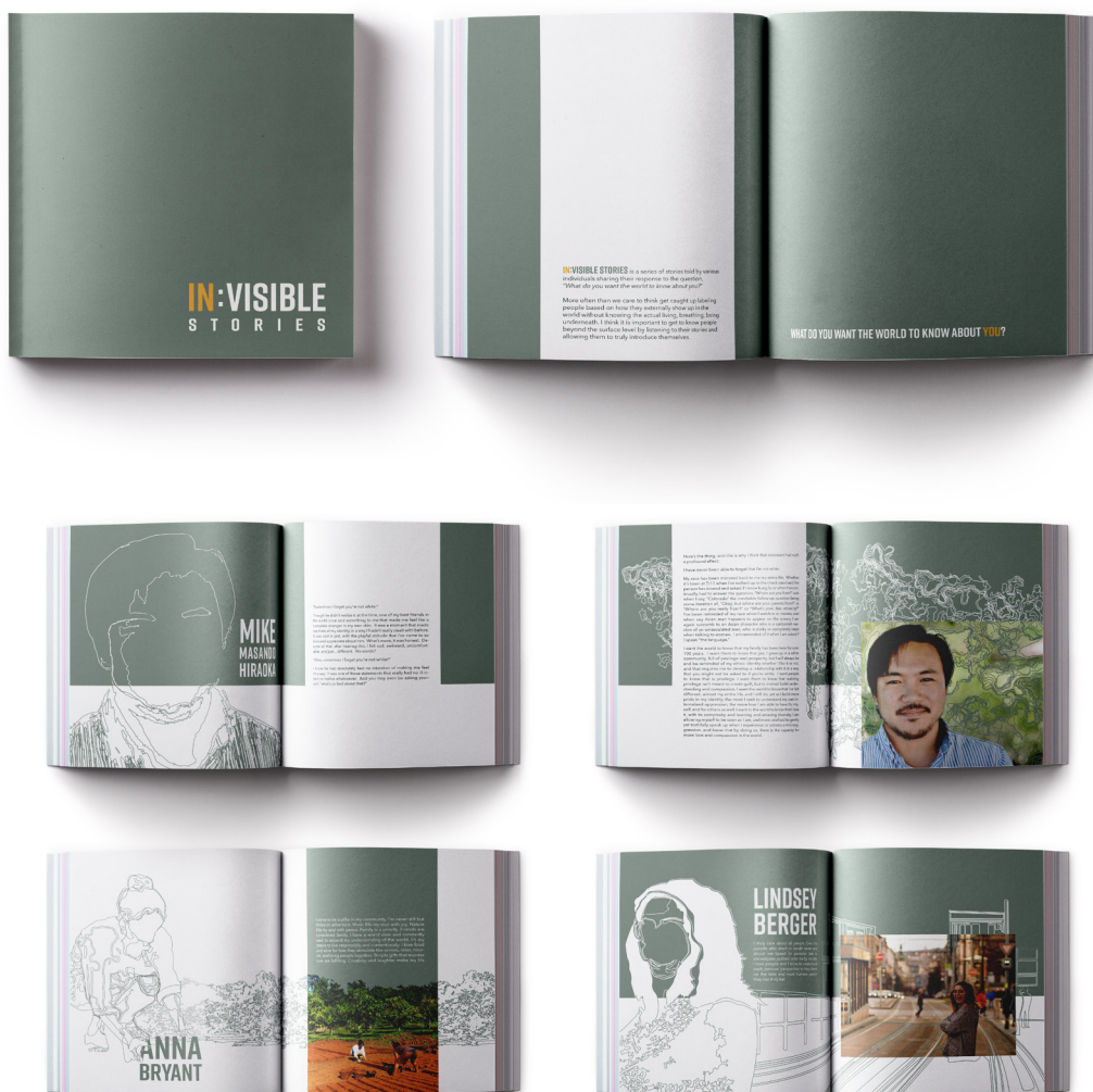
Figure 2: IN:VISIBLE Stories