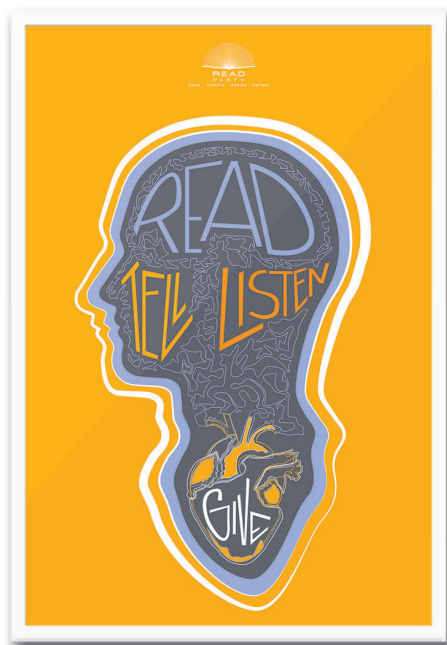
Figure 5: READ Party Posters