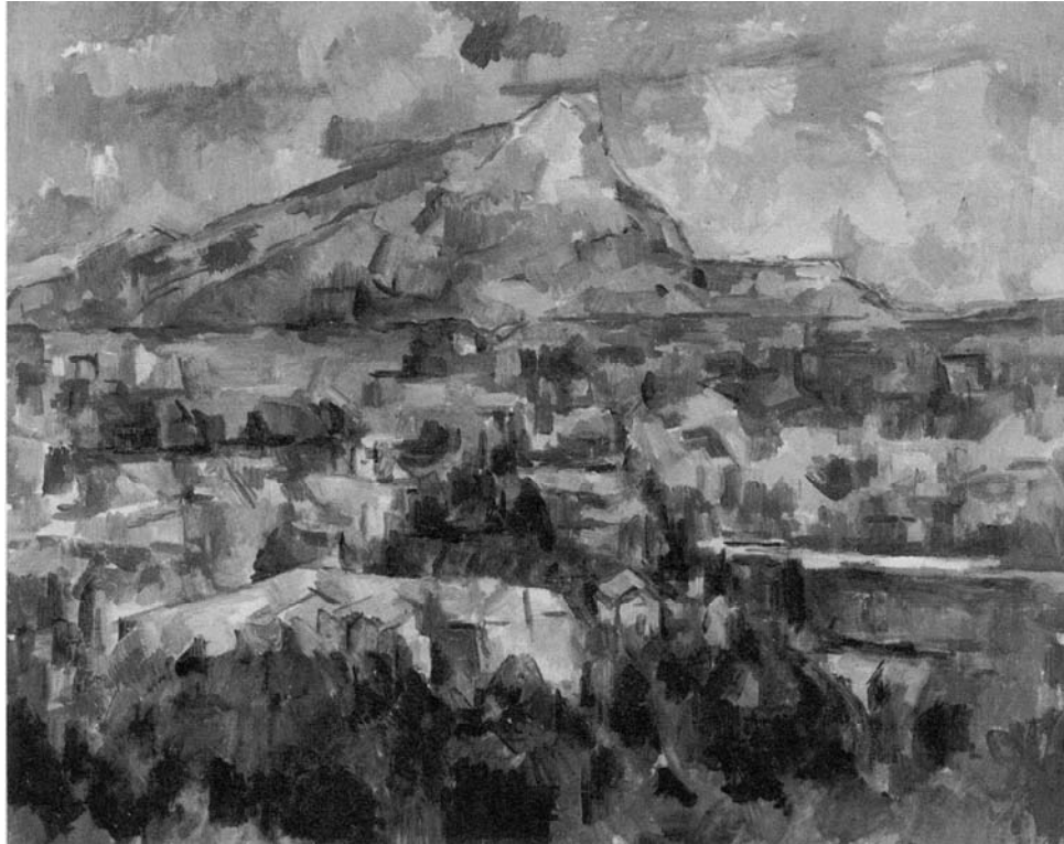
LANDSCAPE: Eighteenth Century to the Present. Paul Cézanne, Mont Sainte-Victoire (1902-1904), oil on canvas, 27 1/2 X 35 1/4 in.; Philadelphia Museum of Art: George W. Elkins Collection.

rural; the Victorian age became more interested in the sublime. Impressionists accentuated color, line, or form to present nature to the viewer, sensitizing the beholder to what was actually there, which beholders might otherwise miss.