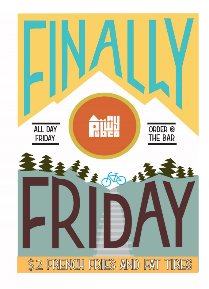
Figure 2: Pubway Train Daily Deals Poster