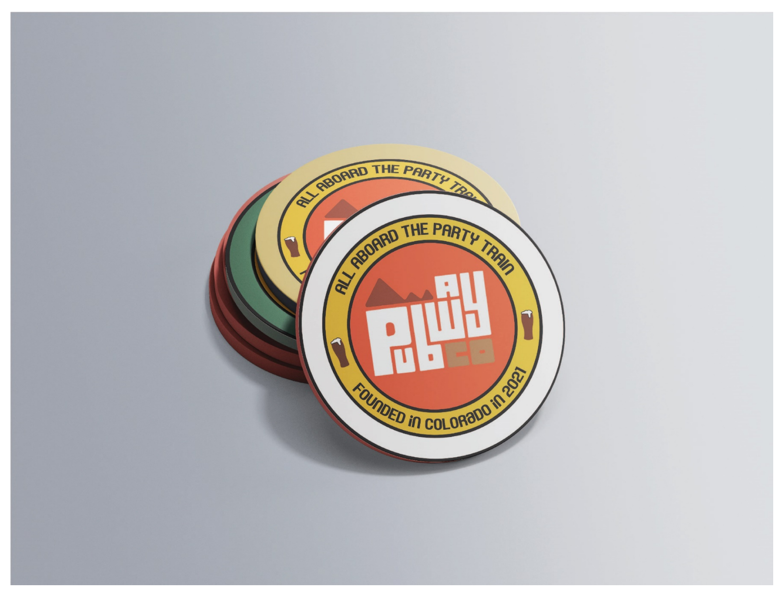
Figure 4: Pubway Train Coasters