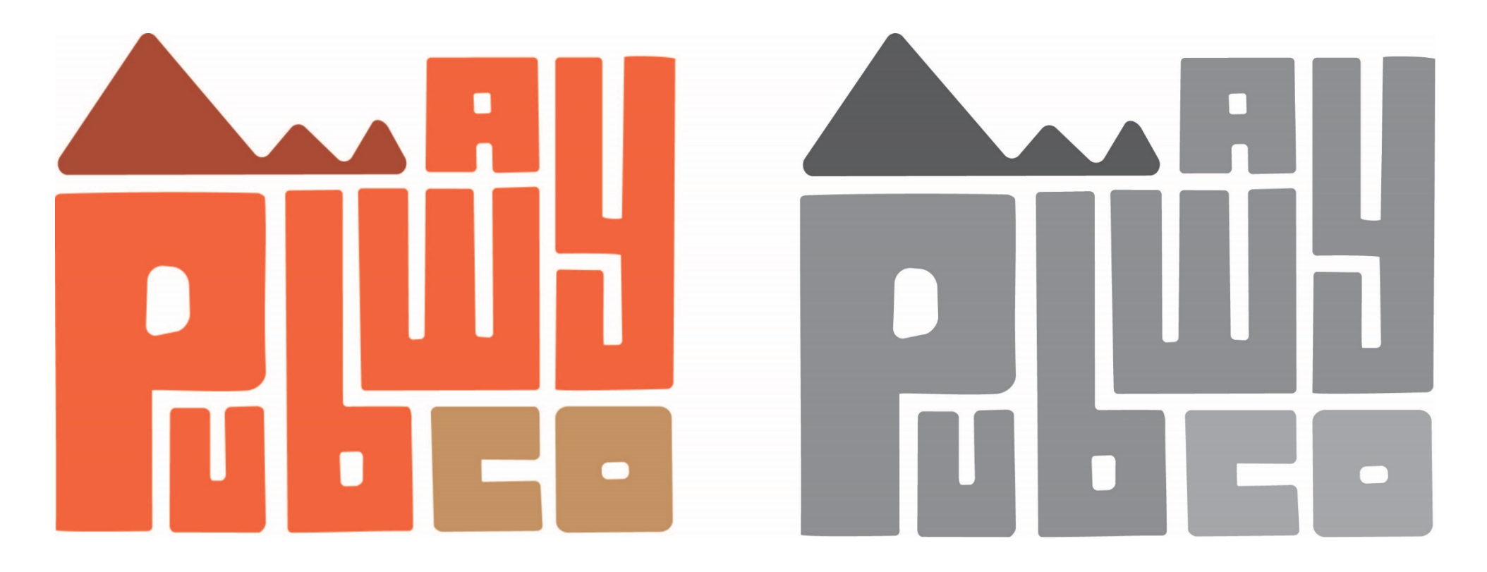
Figure 1: Pubway Train Logo (color, B&W)