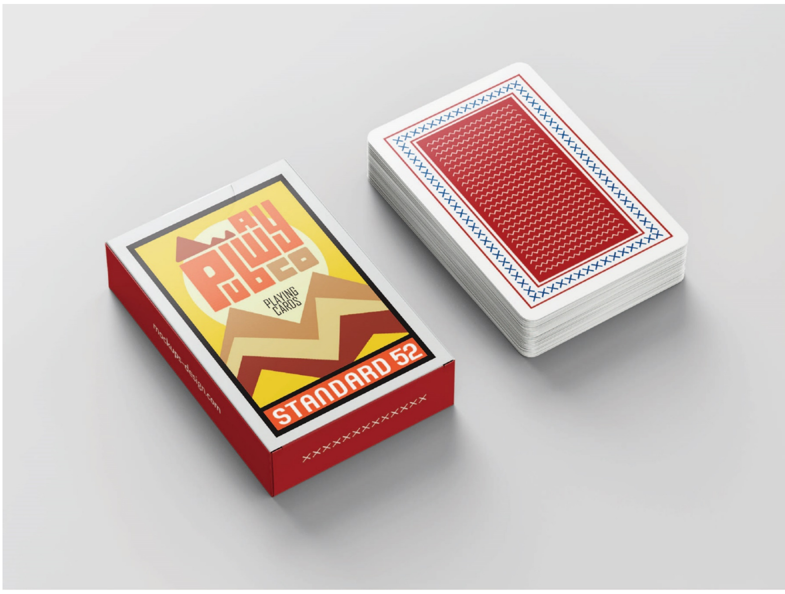
Figure 3: Pubway Train Playing Cards