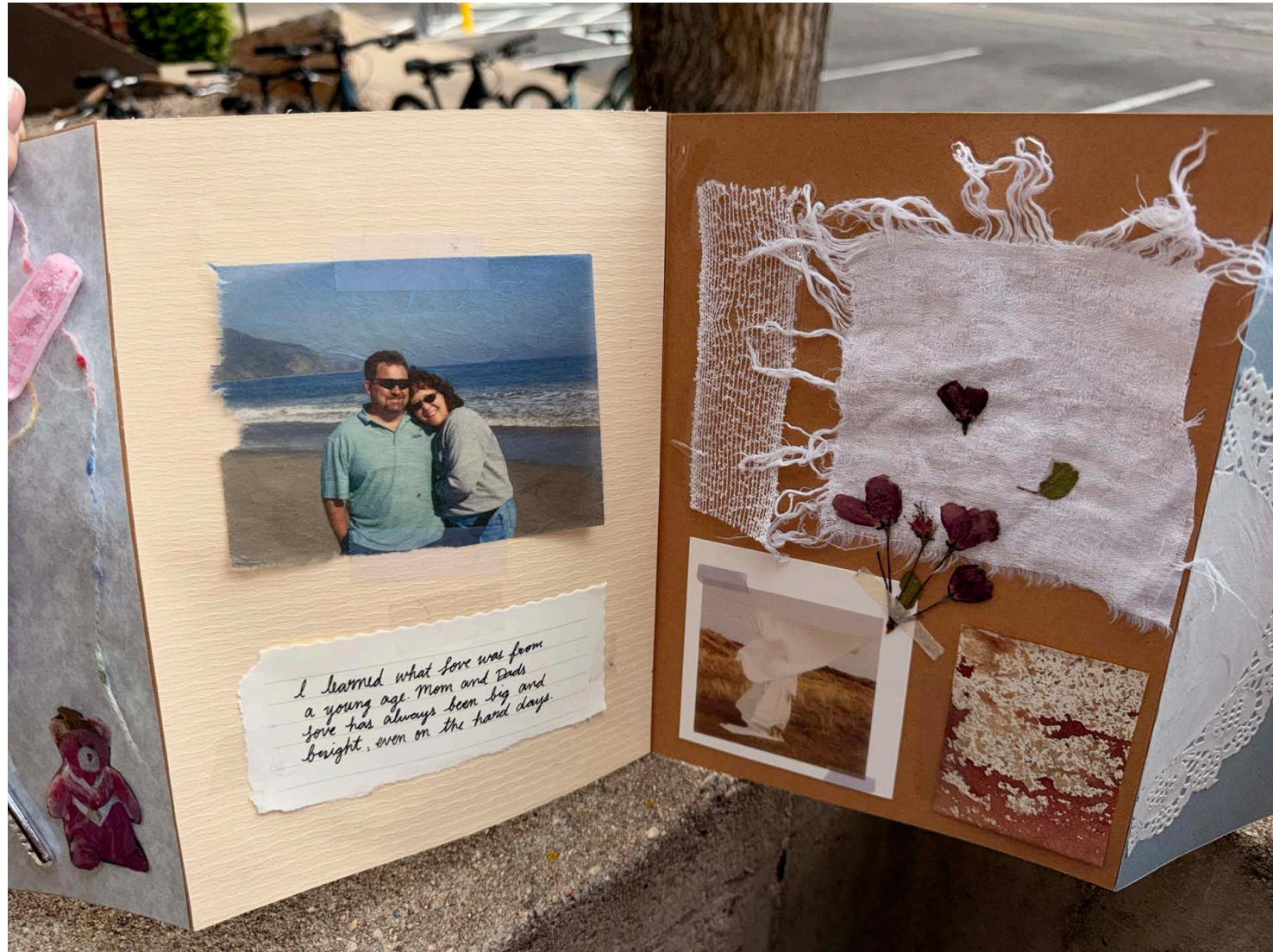
Figure 5: Detail 5