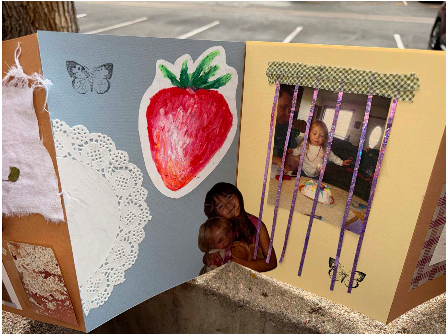
Figure 6: Detail 6