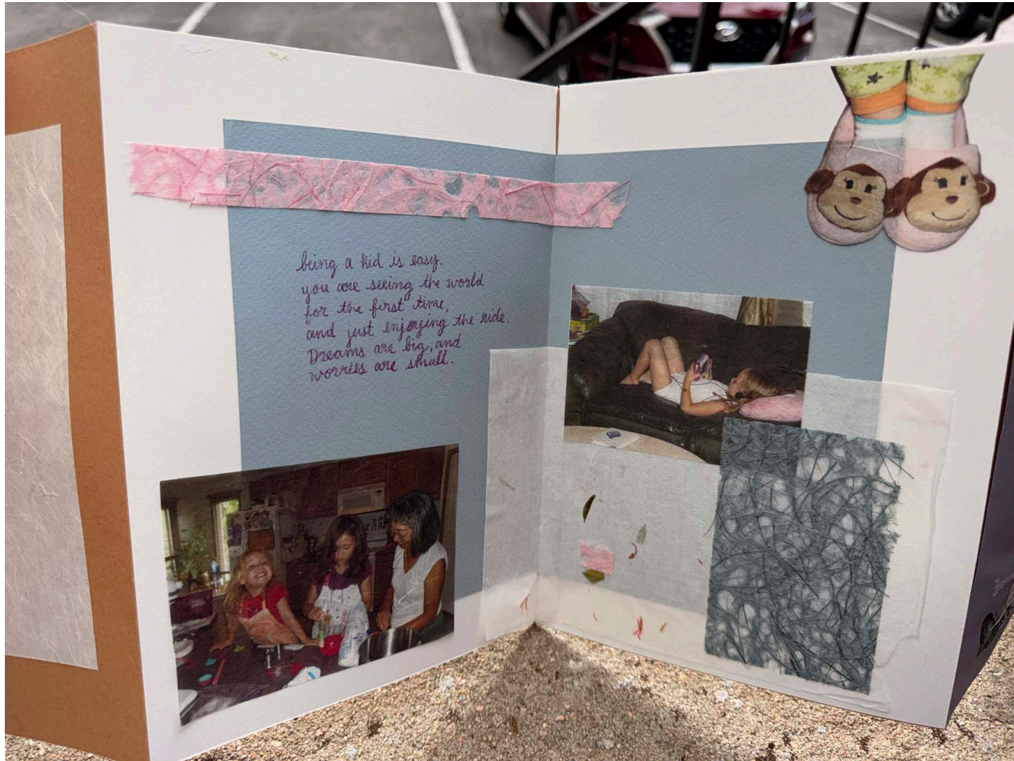
Figure 8: Detail 8