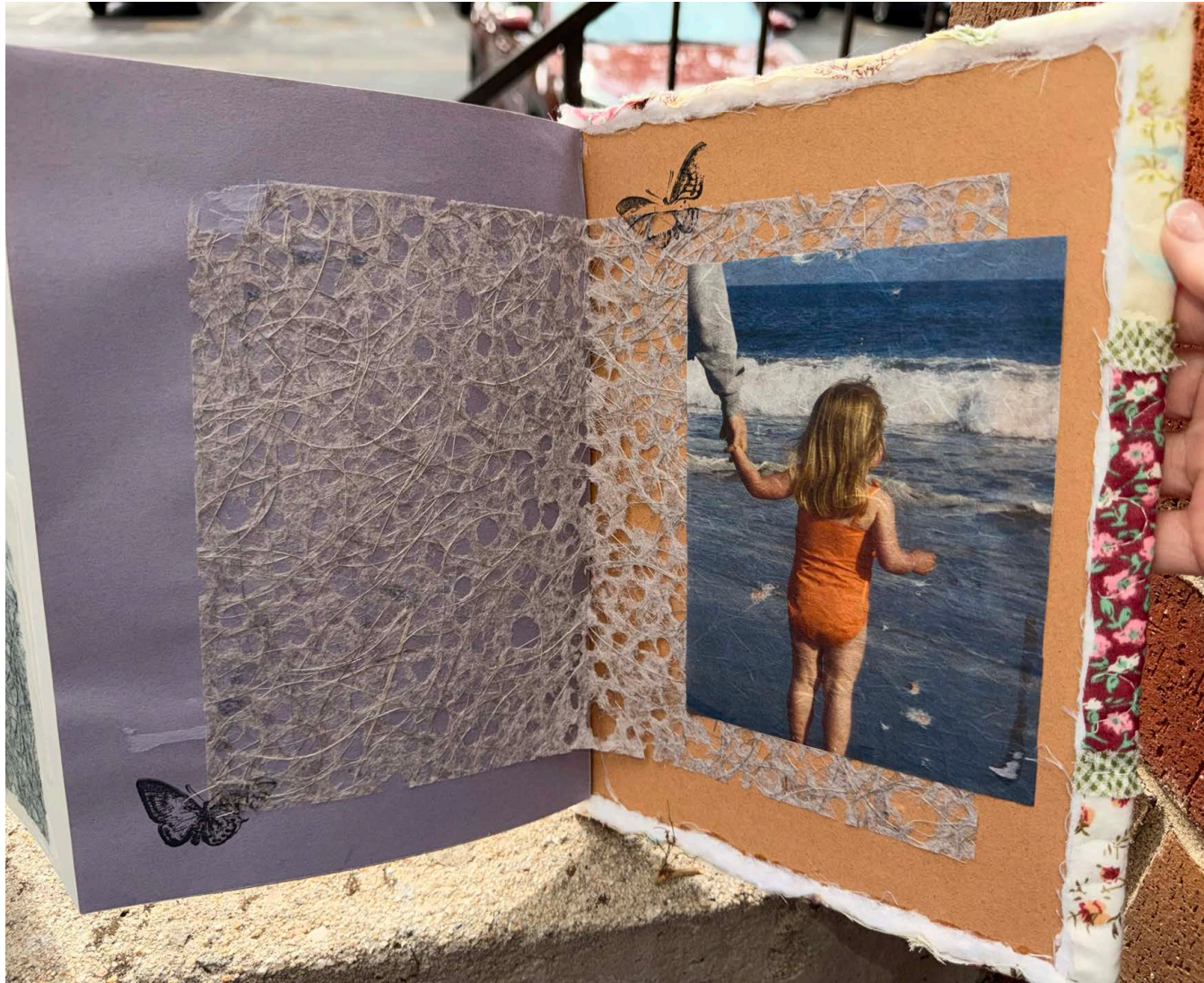
Figure 9: Detail 9