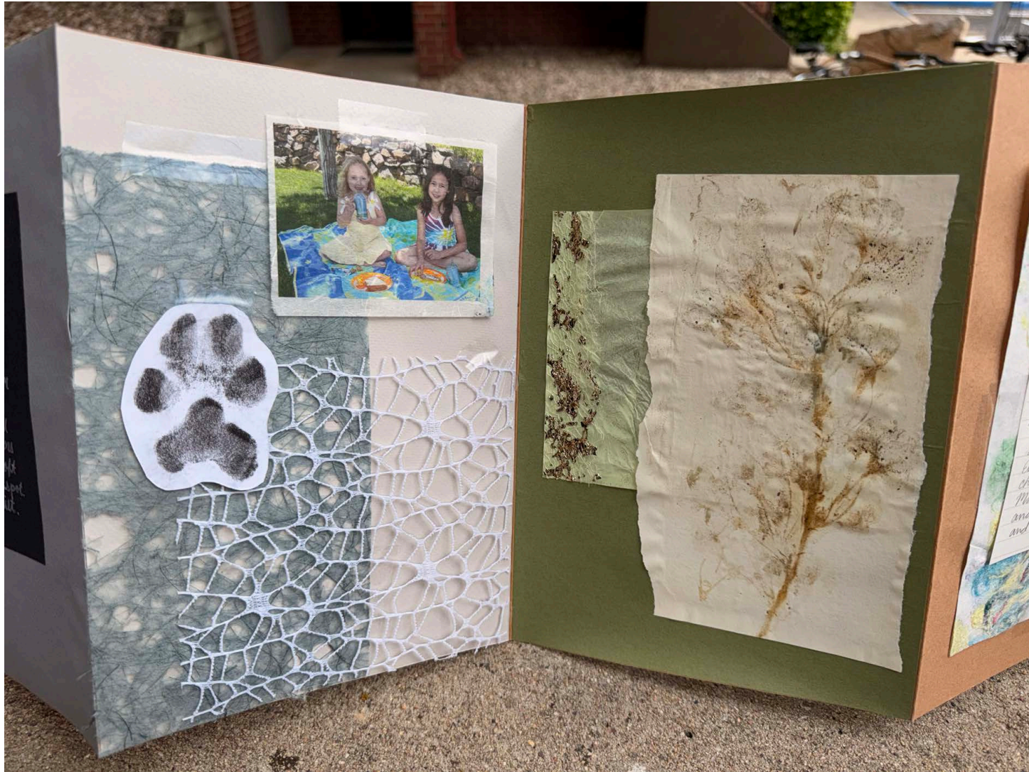
Figure 2: Detail 2