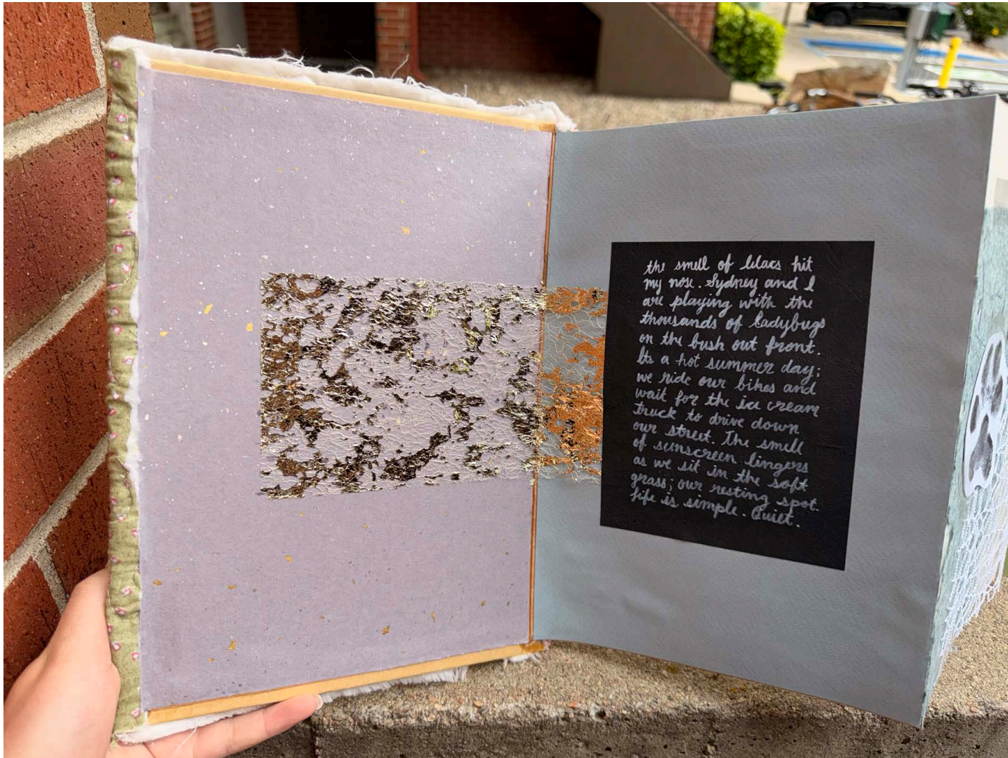
Figure 1: Detail 1