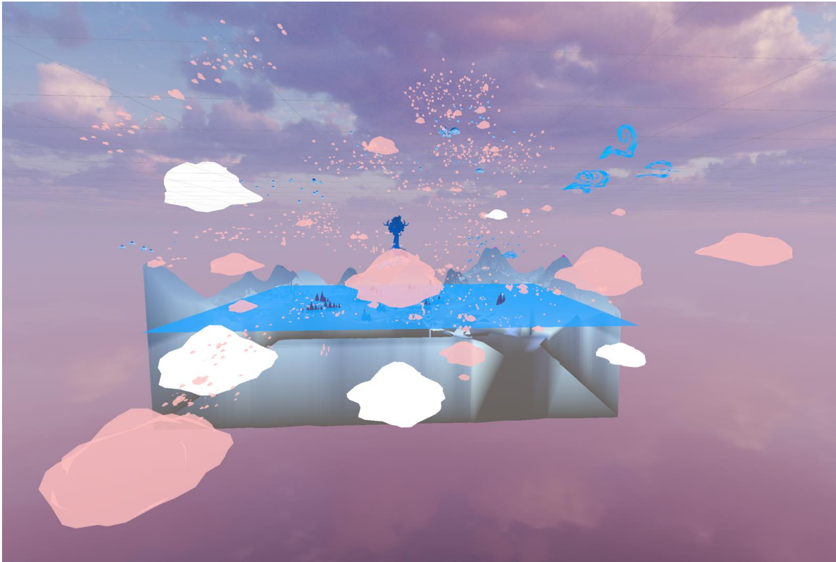
Figure 2: Translucent Dragons Cloud Islands Part 1 https://youtu.be/xAR4N98r8Ts