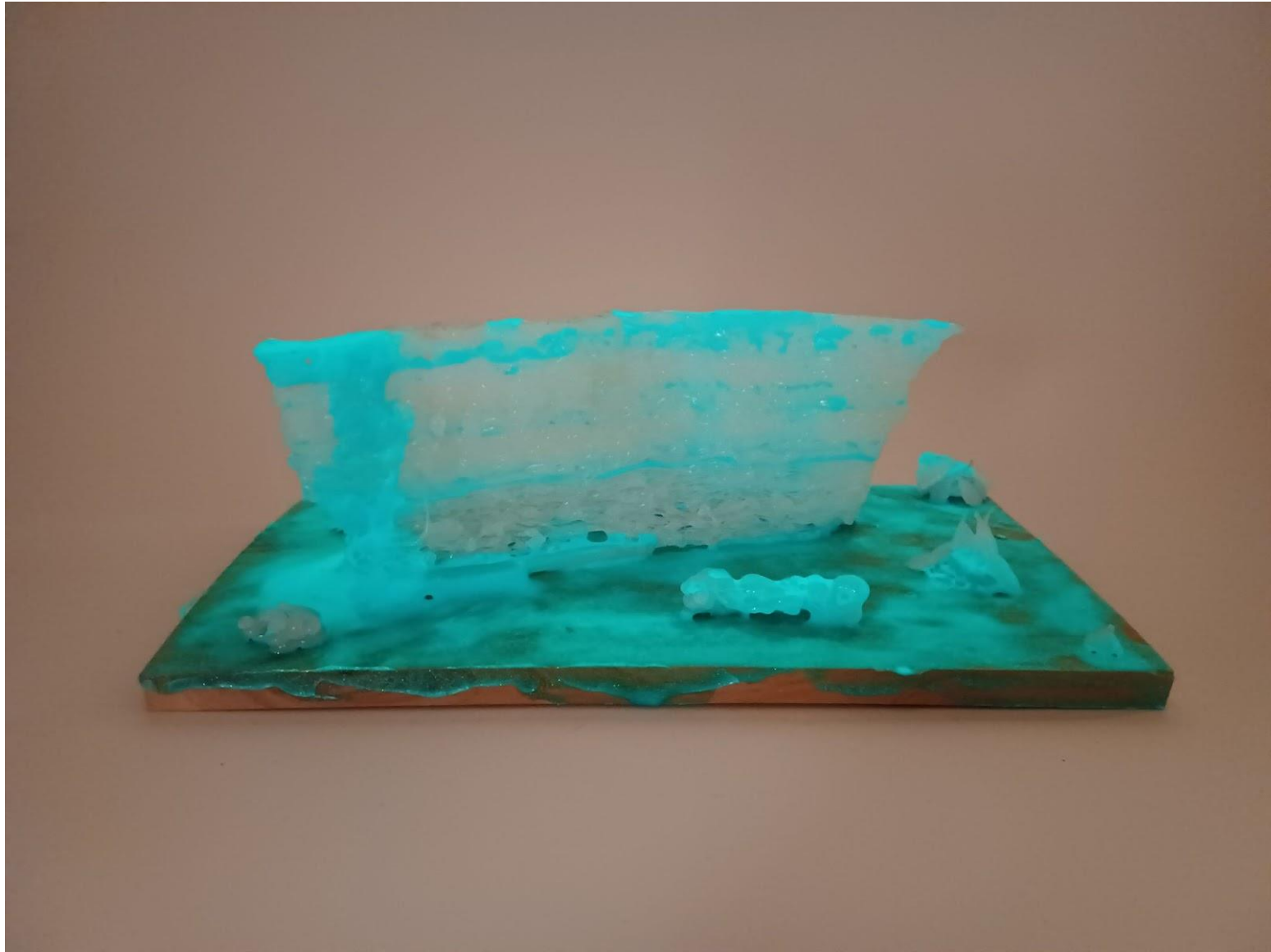
Figure 5: Glowing Melted Iceberg