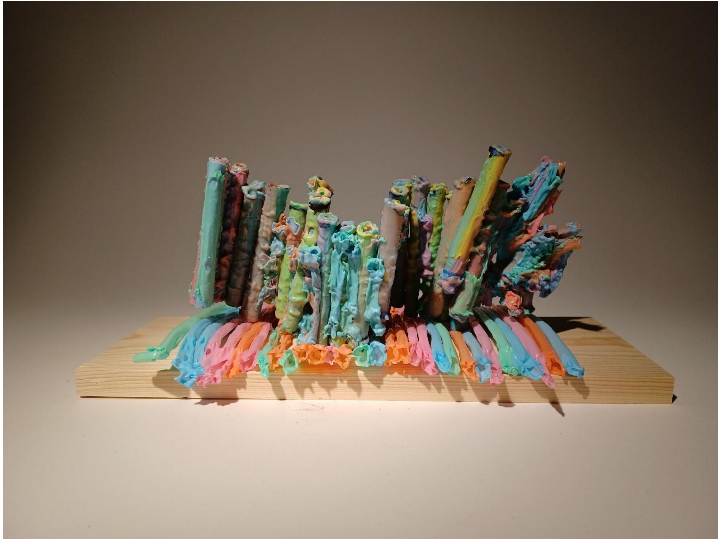
Figure 4: Chaos Coral Reefs