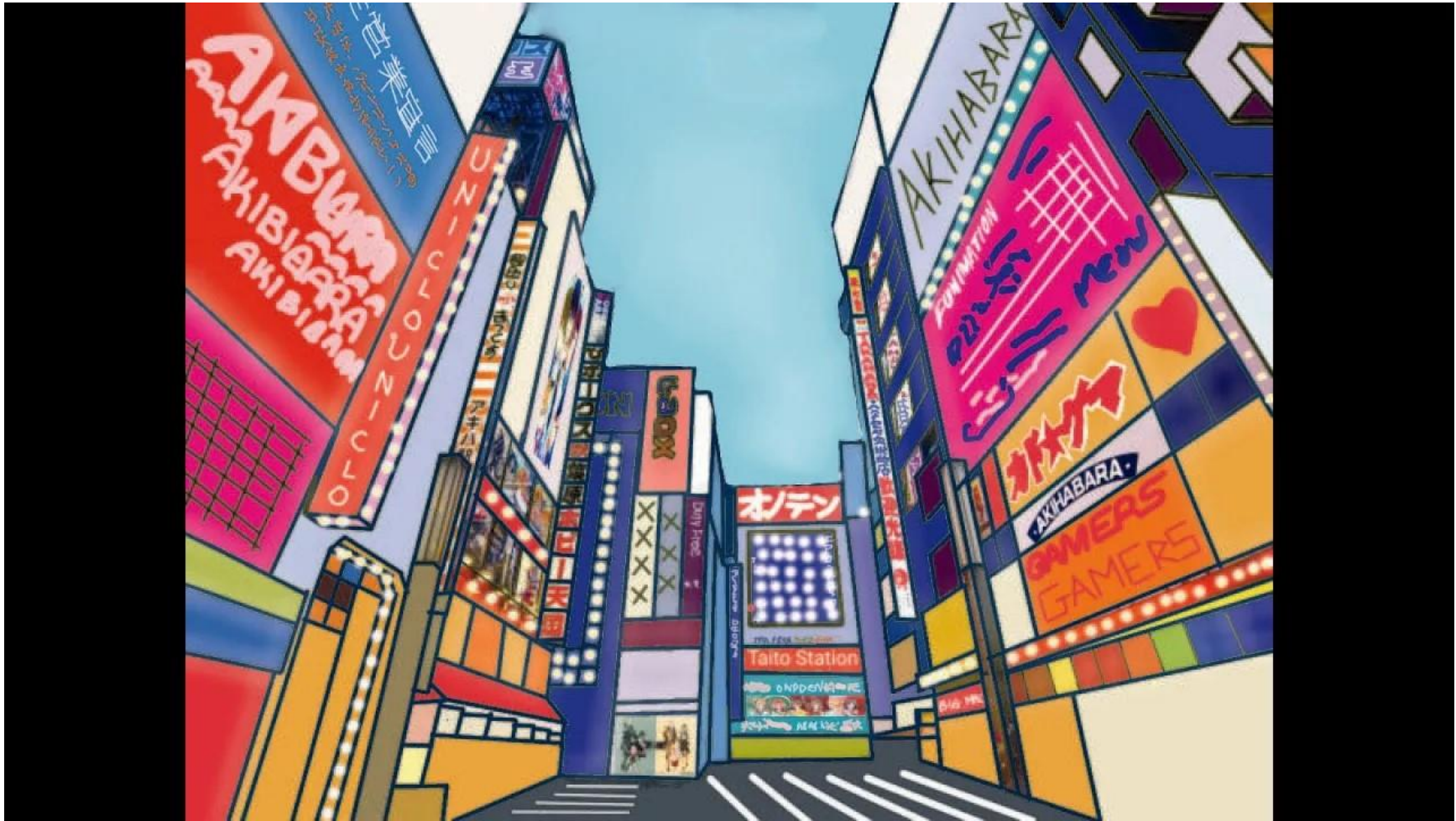
Figure 1: June In Japan https://youtu.be/4KxtWHSdd24