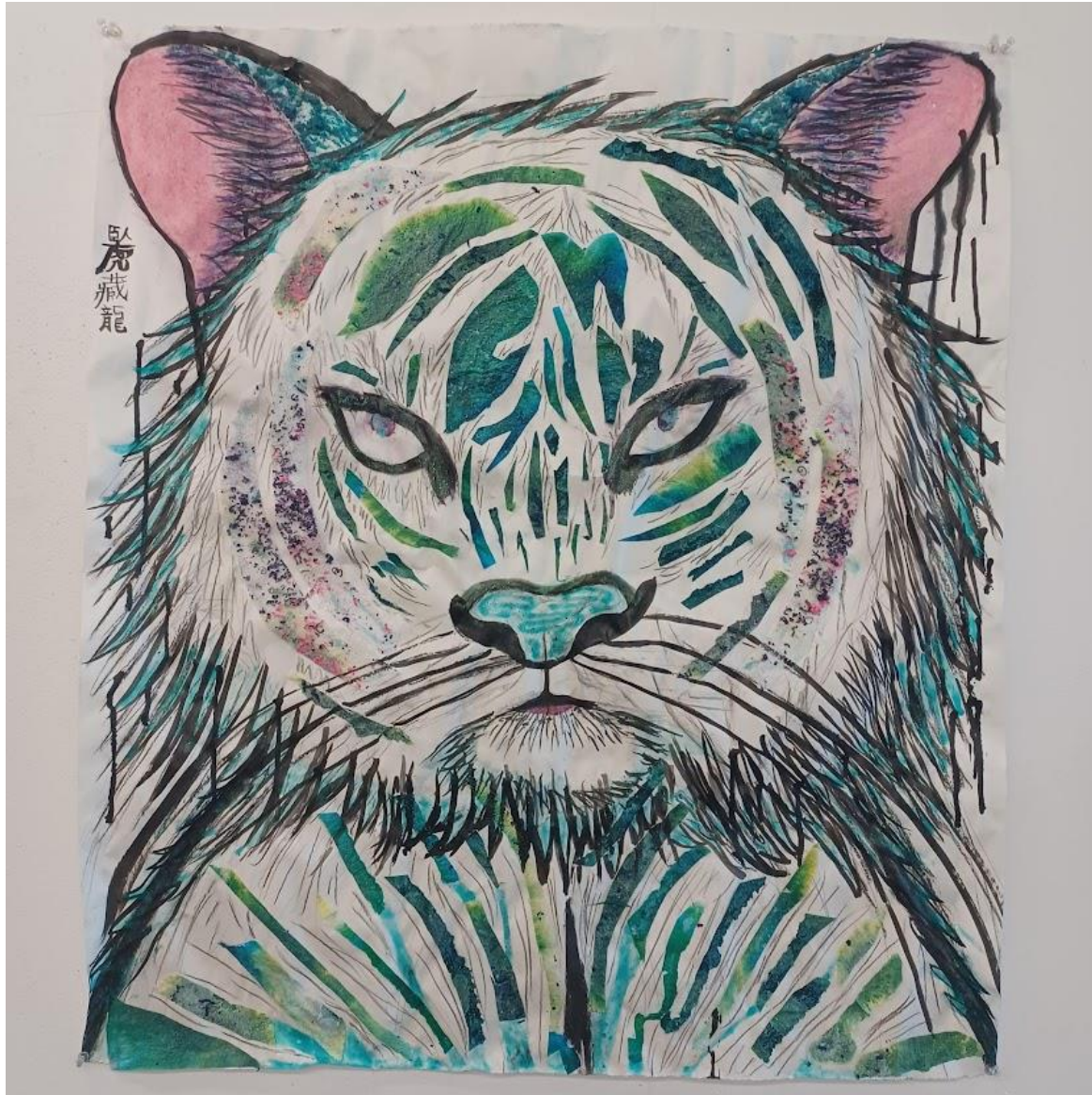
Figure 6: Hidden Tiger