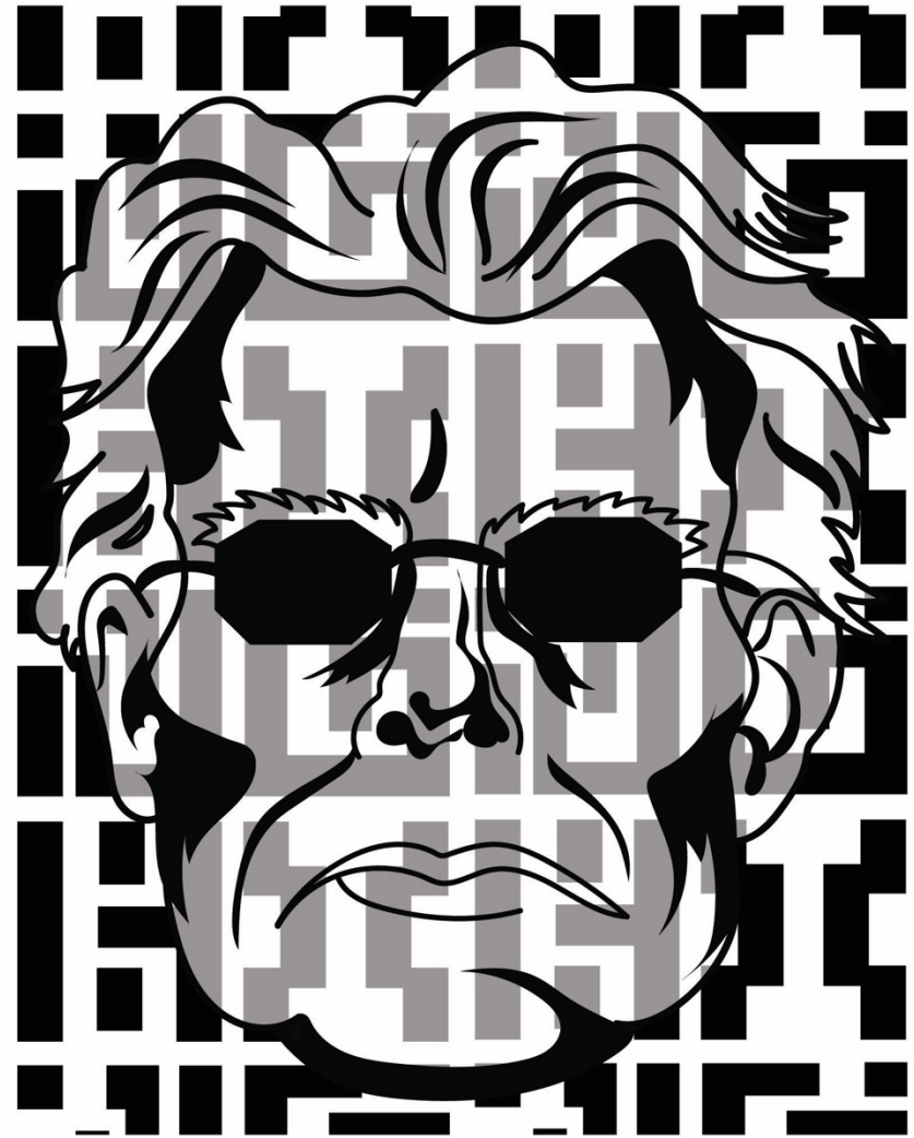
Figure 1: Stephen King Poster Designs 1