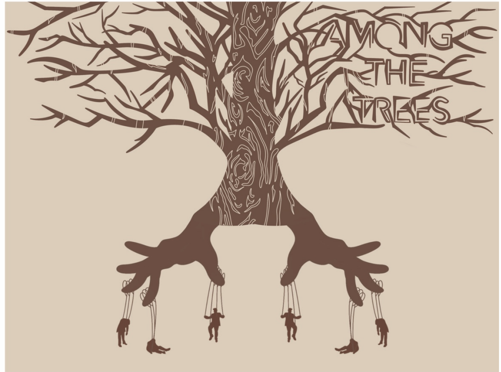
Figure 4: Among the Trees Book Spread and Cover