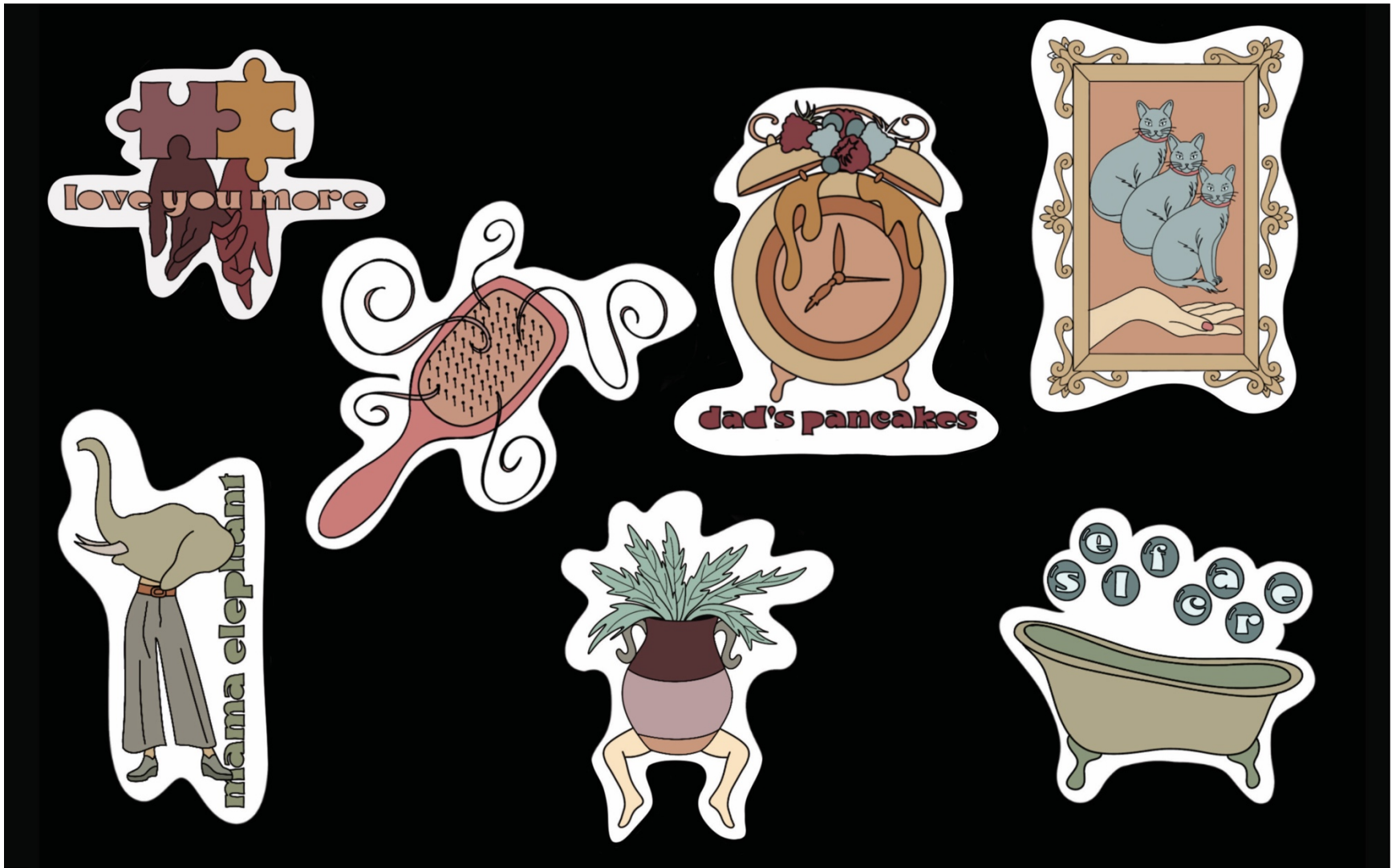
Figure 7: Stickers