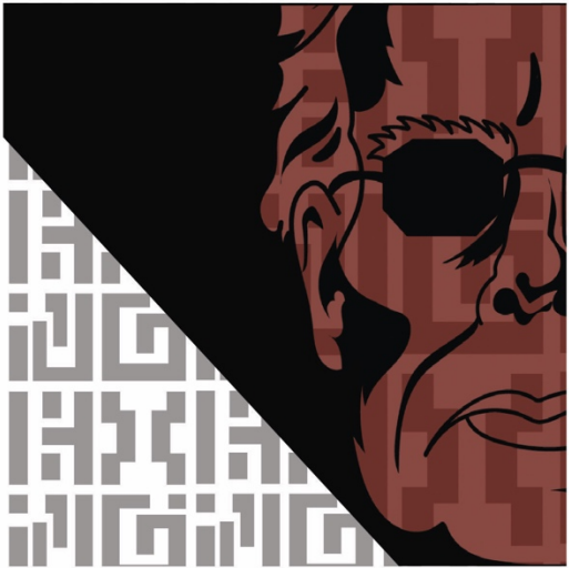
Figure 3: Stephen King Brochure