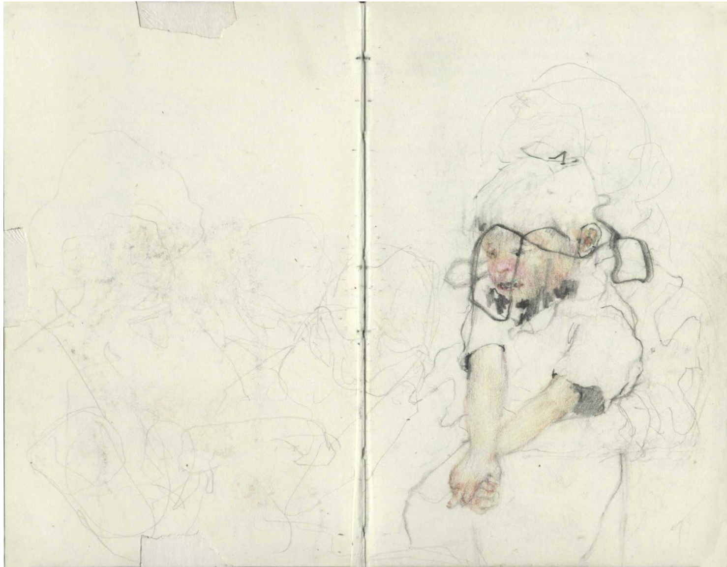
Figure 11: tike