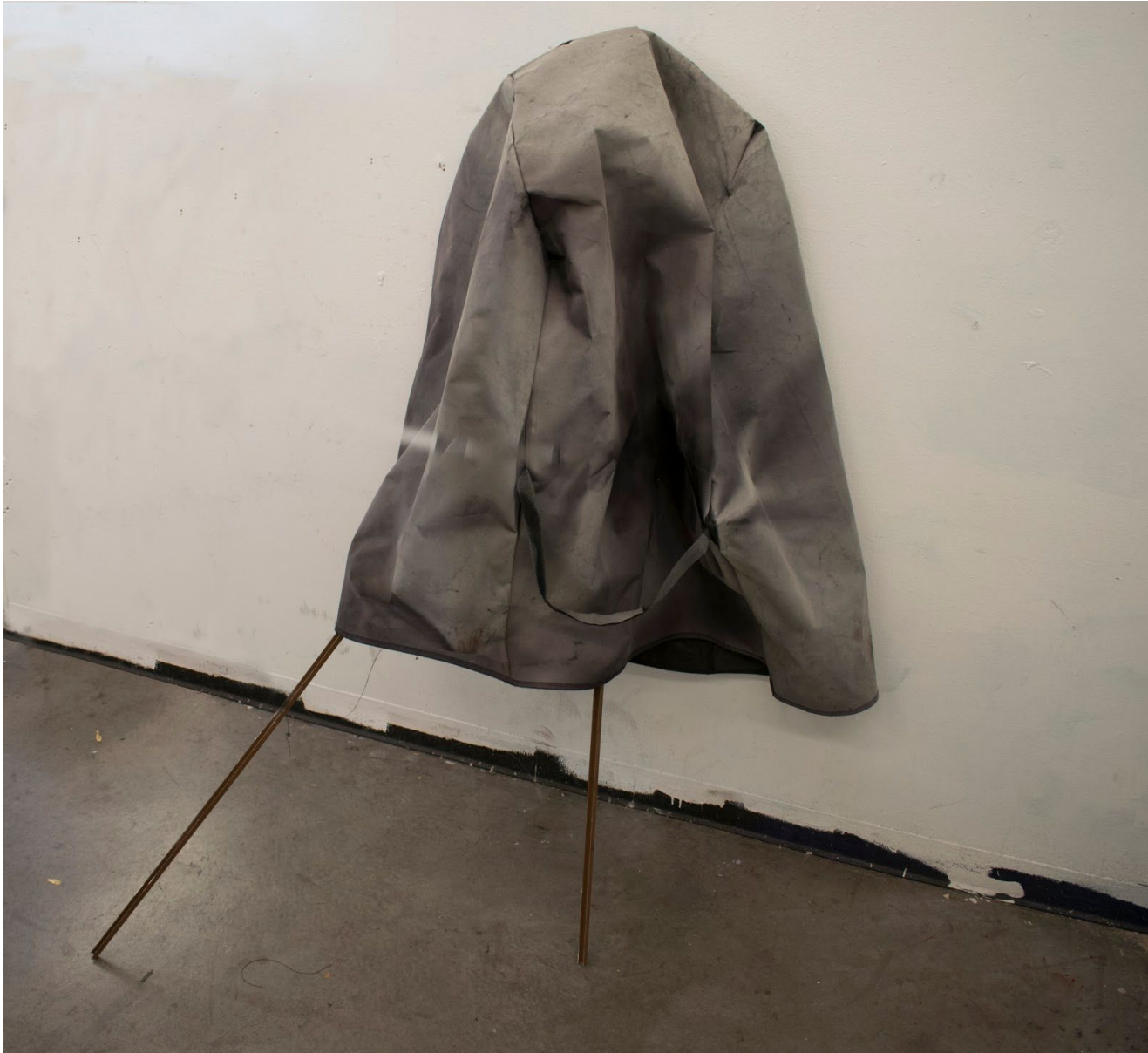
Figure 8: Untitled