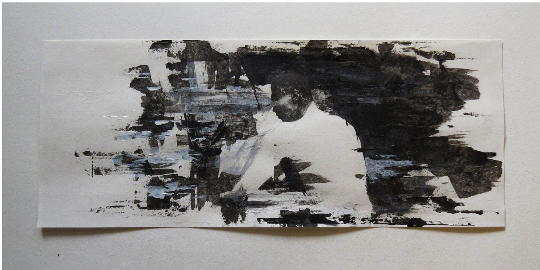
Figure 10: Untitled