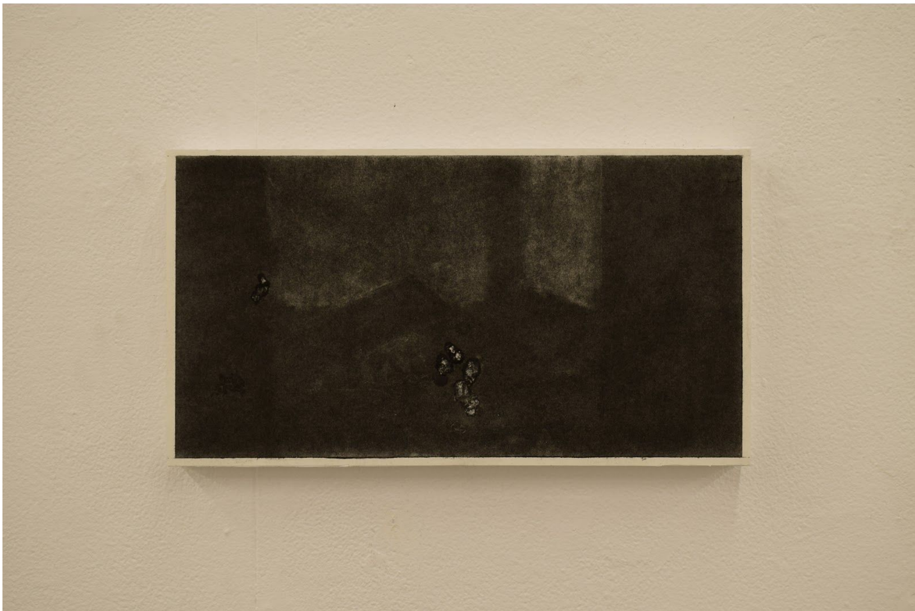
Figure 4: Untitled