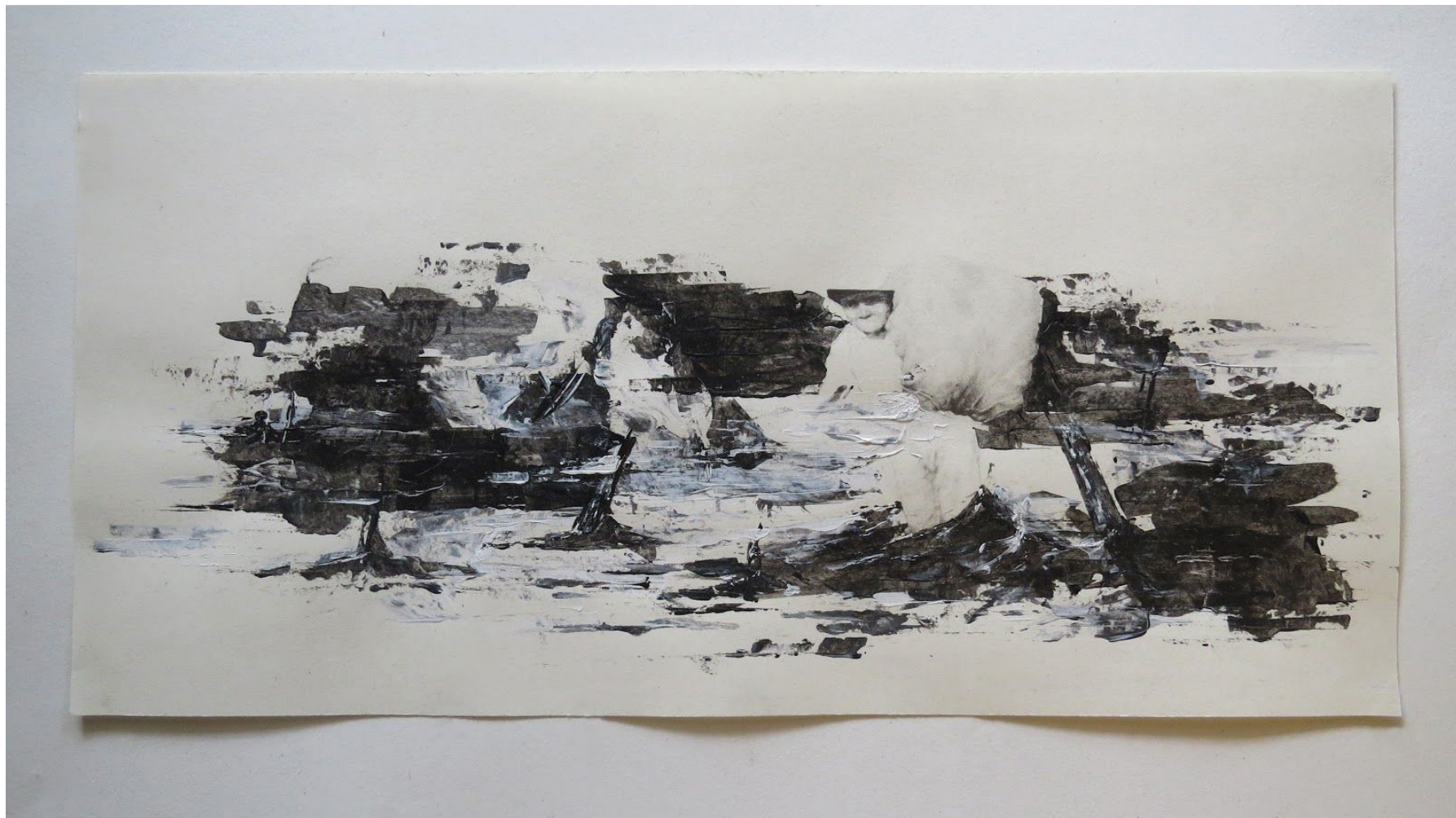
Figure 9: Untitled