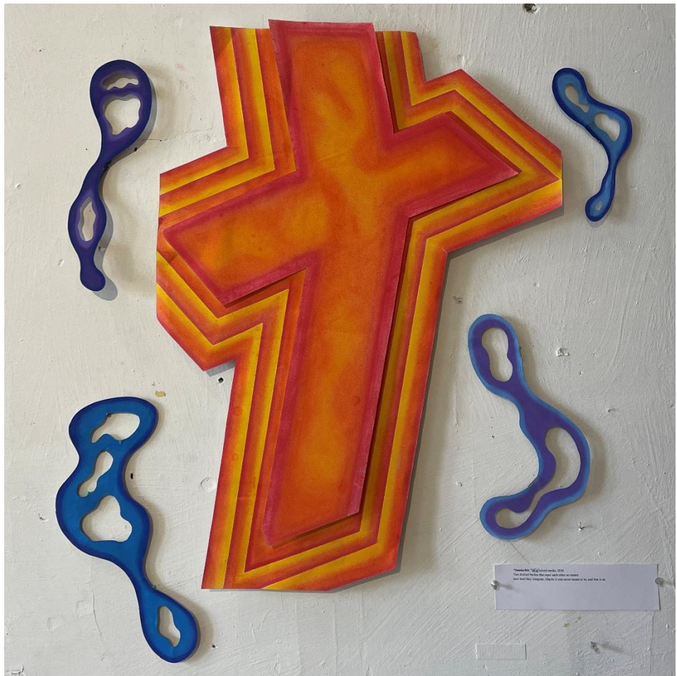
Figure 2: Immiscible