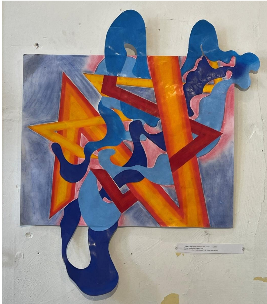
Figure 1: Trinity