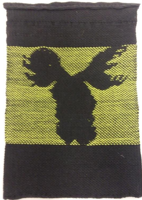
Figure 2: Venus Fly Trap