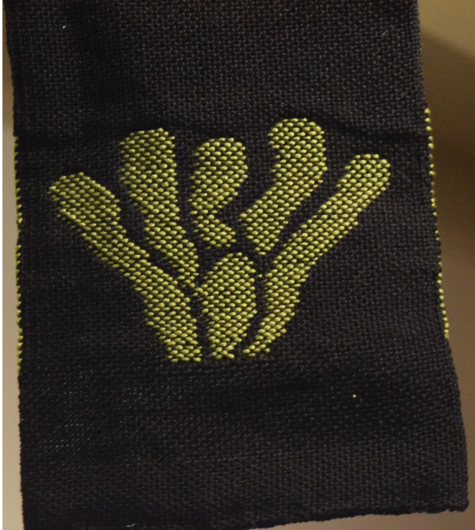
Figure 6: Sundew