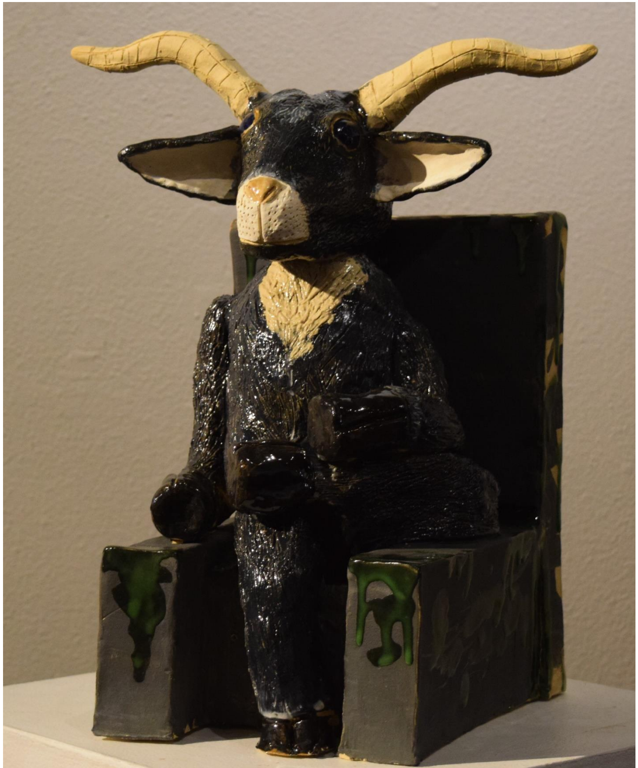
Figure 8: Gracefully