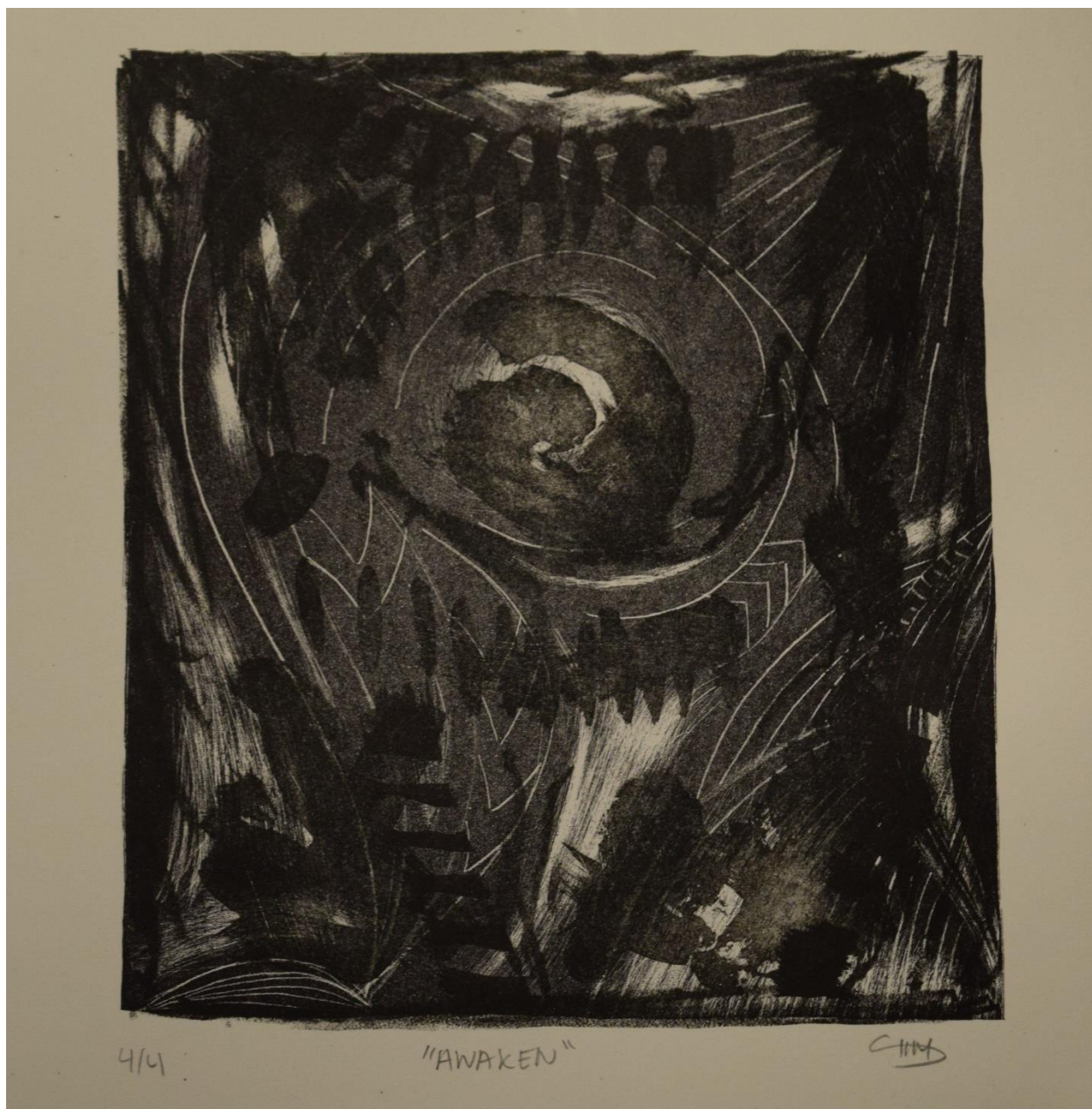
Figure 9: Awaken