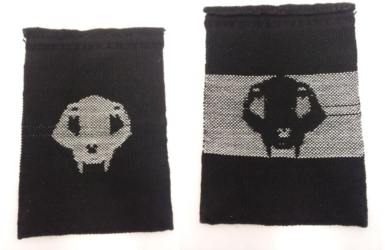
Figure 4: Cat Skull