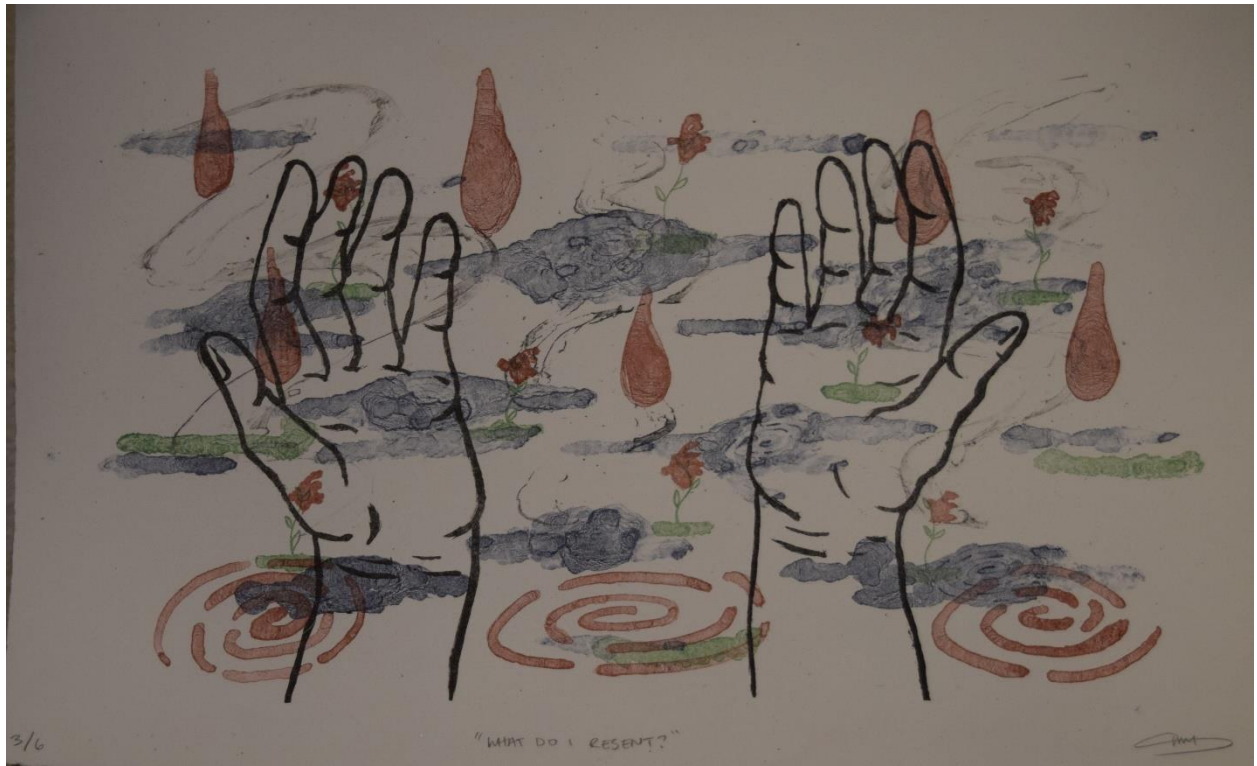
Figure 10: What Do I Resent?