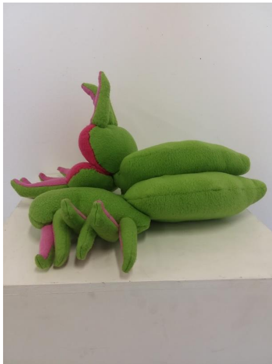
Figure 1: Venus Fly Trap