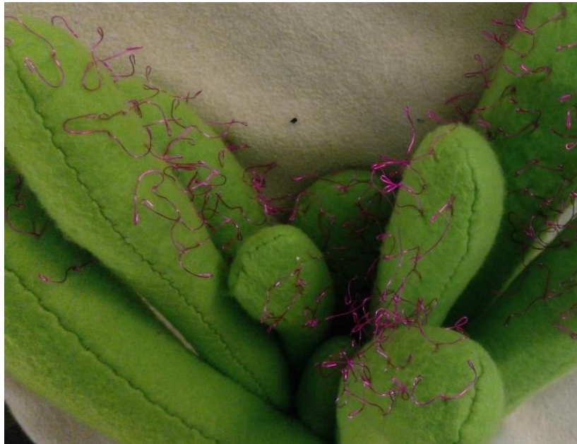
Figure 5: Sundew