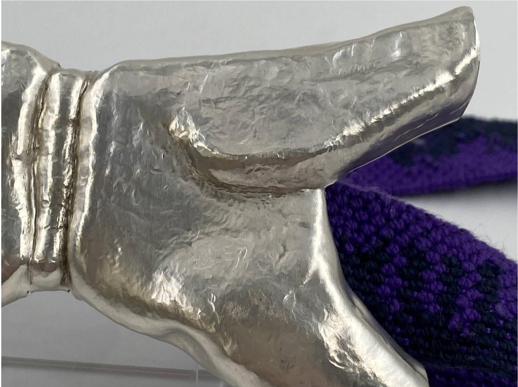
Figure 11: Metamorphosis V (detail)