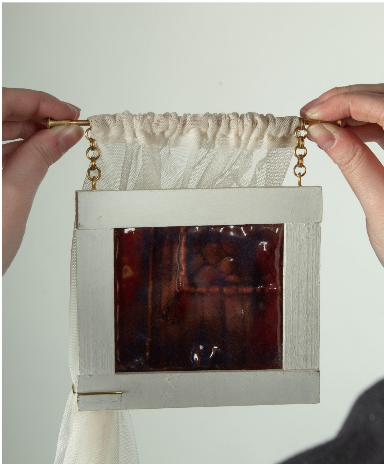
Figure 8: The Blue Room (back detail)