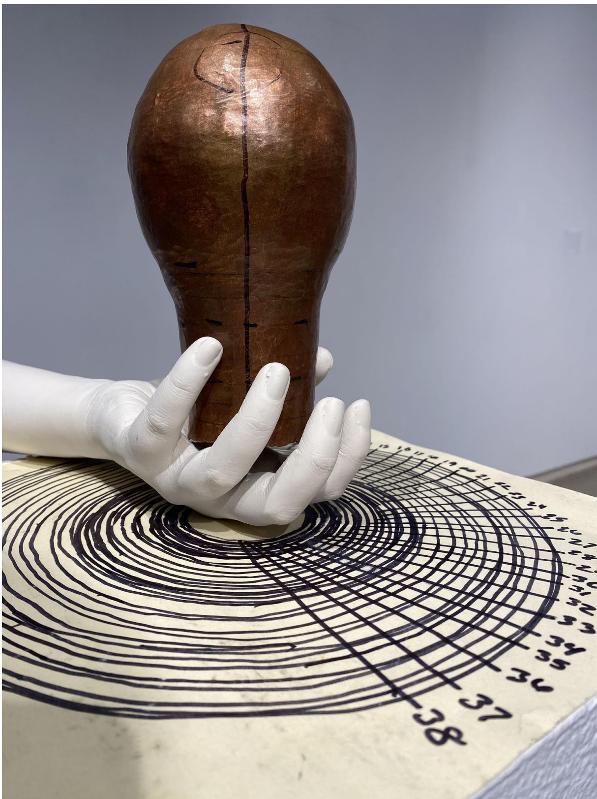
Figure 4: Raising Process