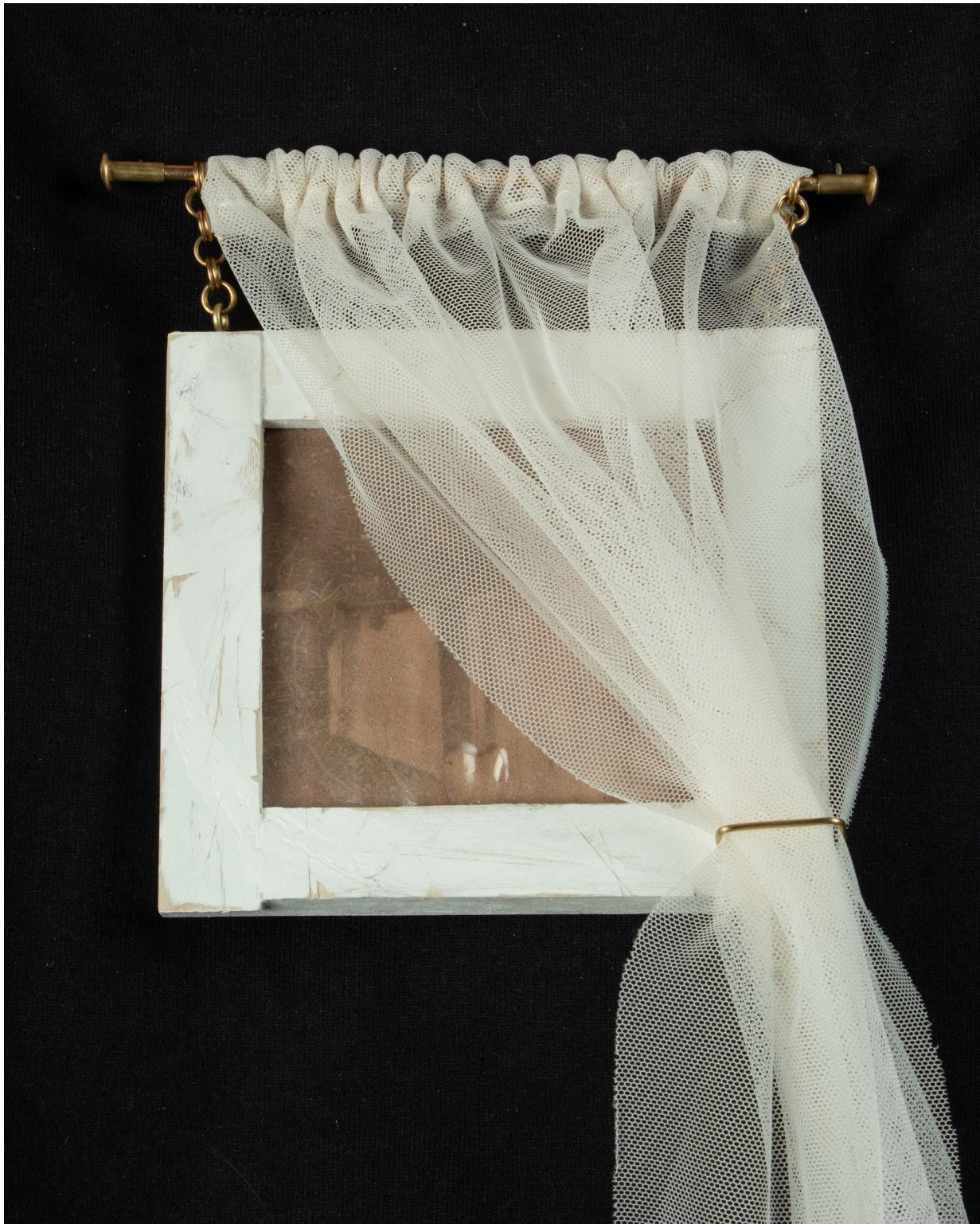
Figure 7: The Blue Room (front detail)