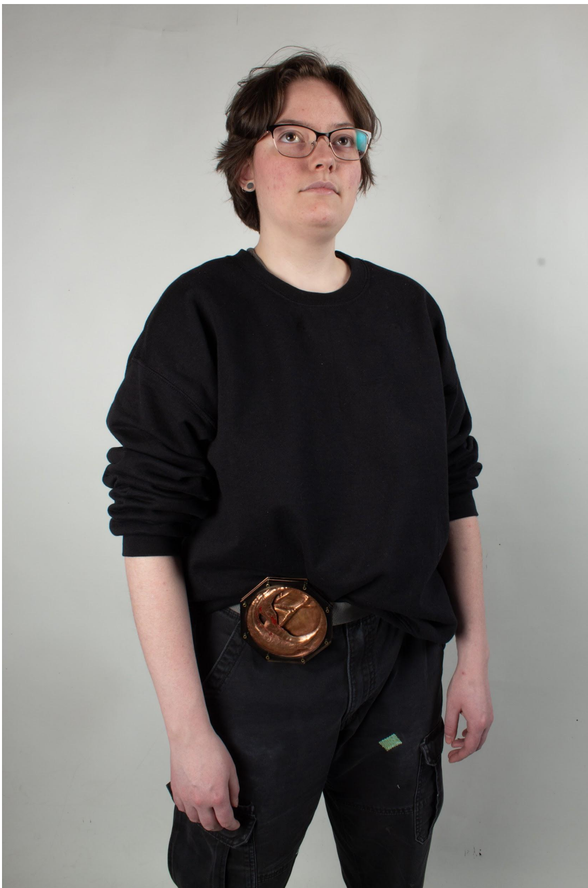
Figure 2: Test Requested: Surgical Result ID: GI20-07692