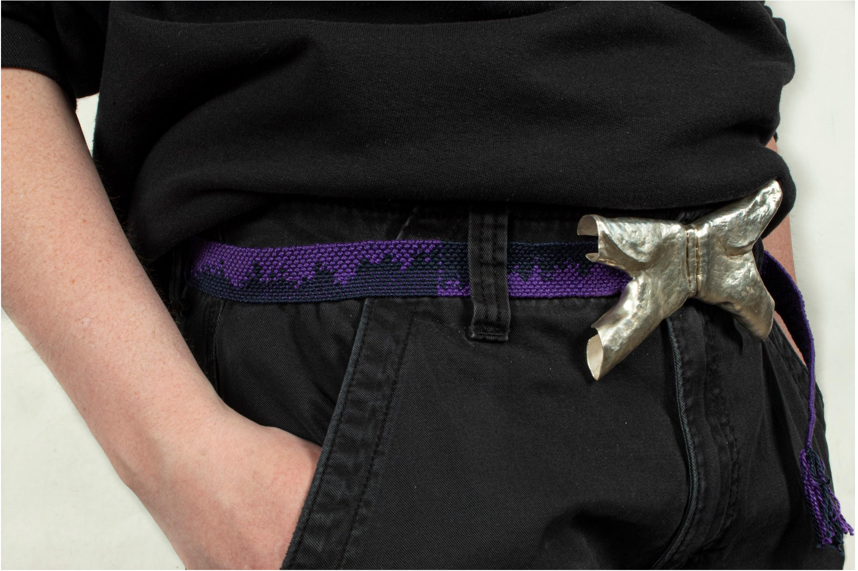
Figure 10: Metamorphosis V