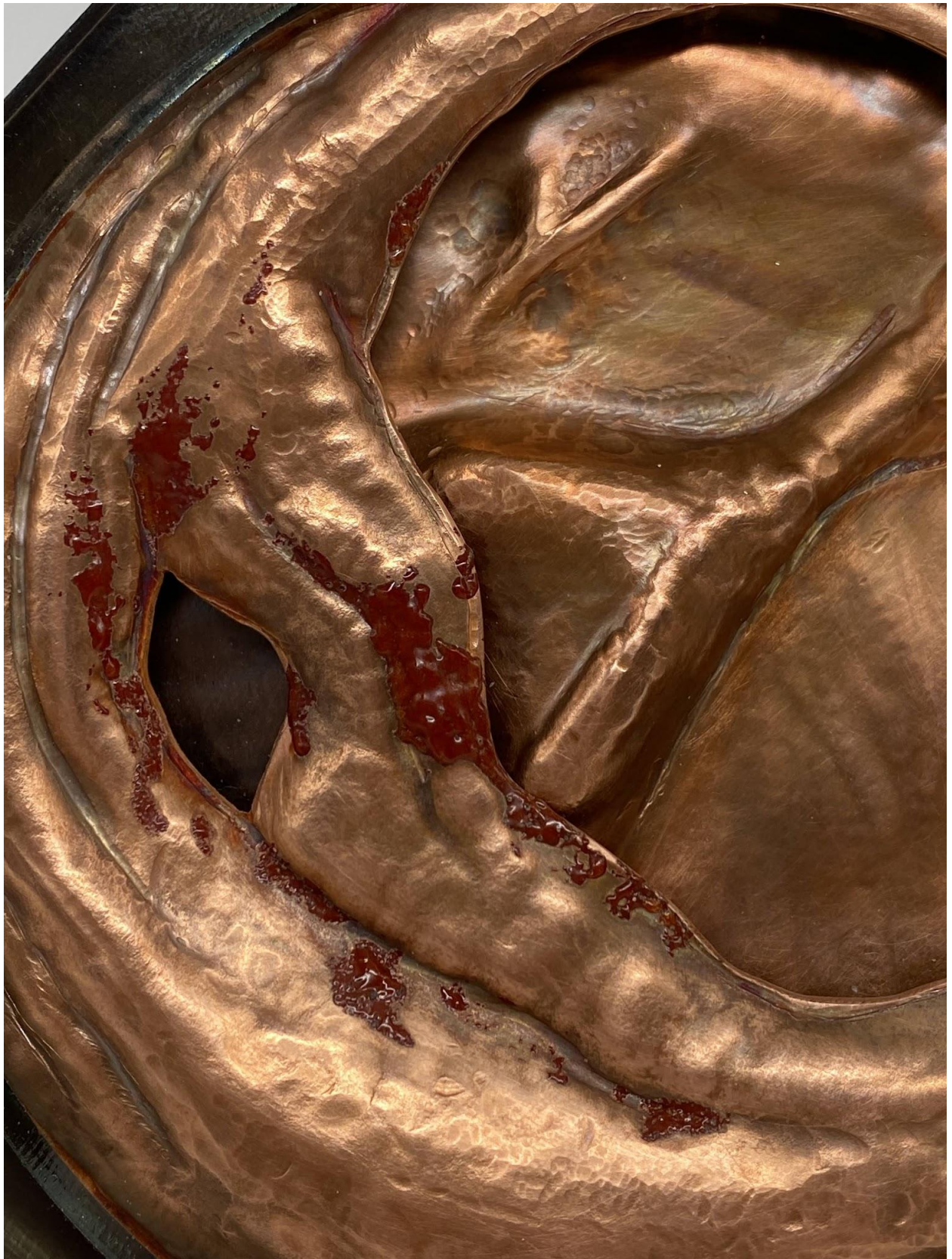
Figure 3: Test Requested: Surgical Result ID: GI20-07692 (detail)