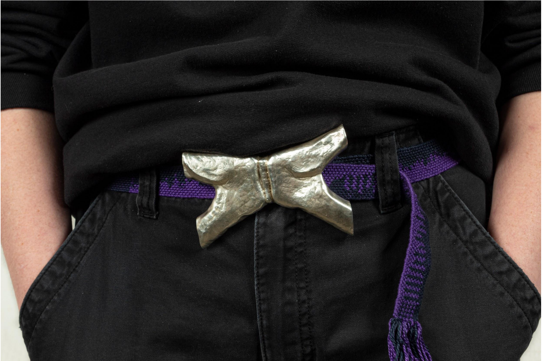
Figure 9: Metamorphosis V