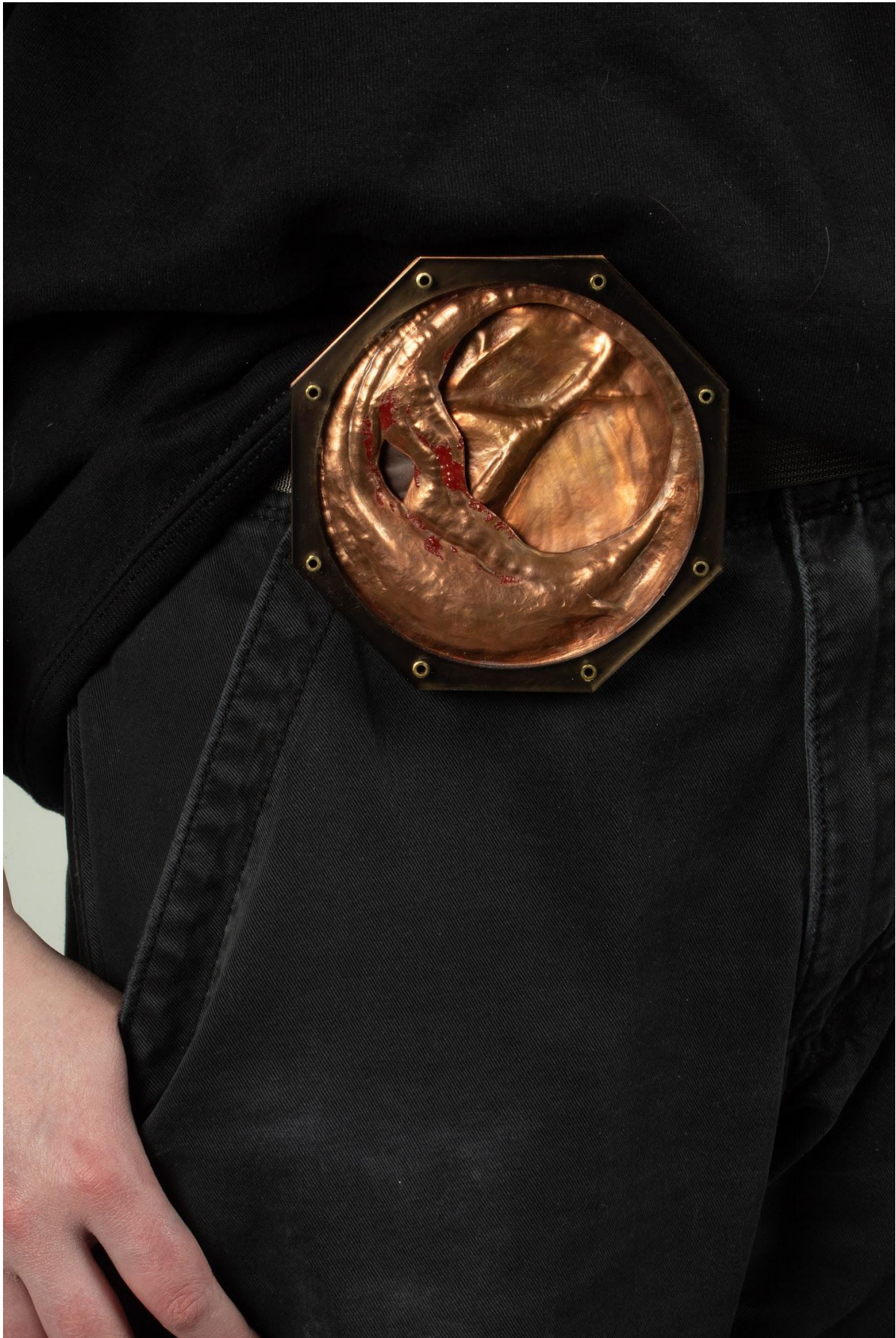
Figure 1: Test Requested: Surgical Result ID: GI20-07692