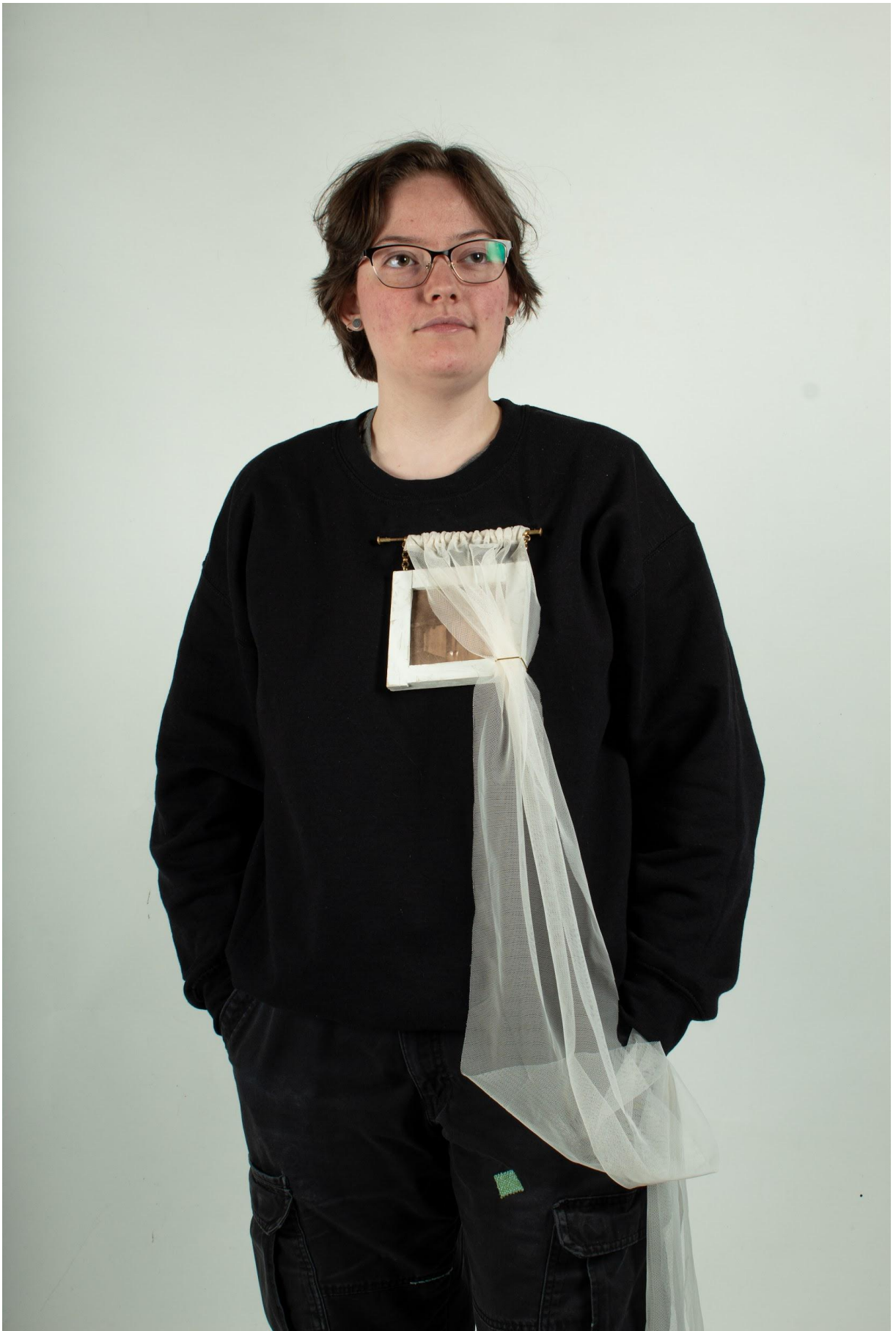
Figure 6: The Blue Room