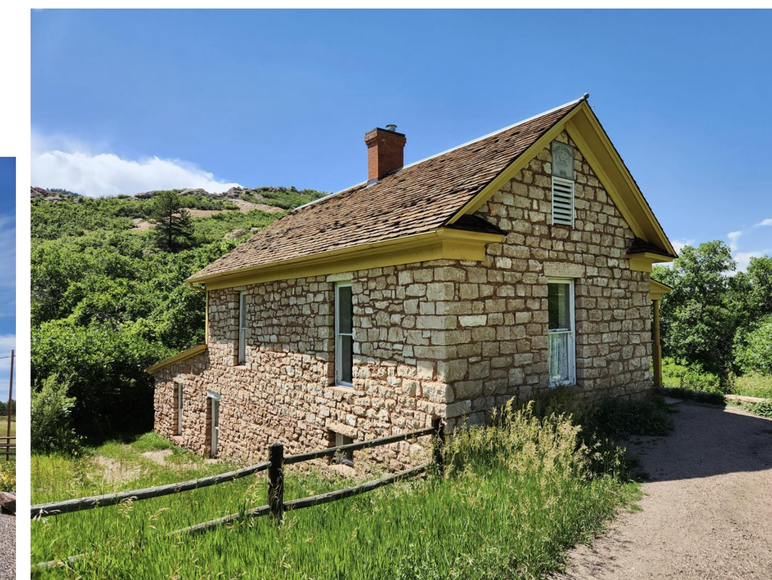
Persse Ranch Homestead