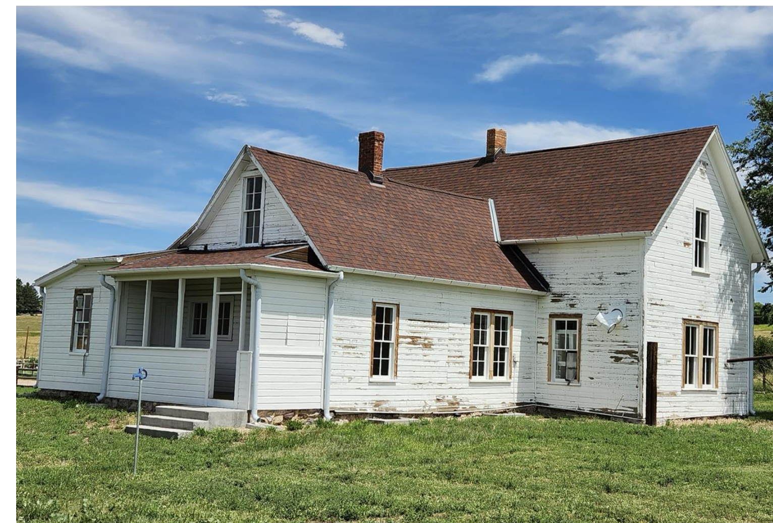
Converse Ranch Homestead