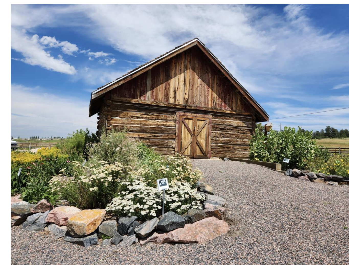
Converse Ranch Outbuilding