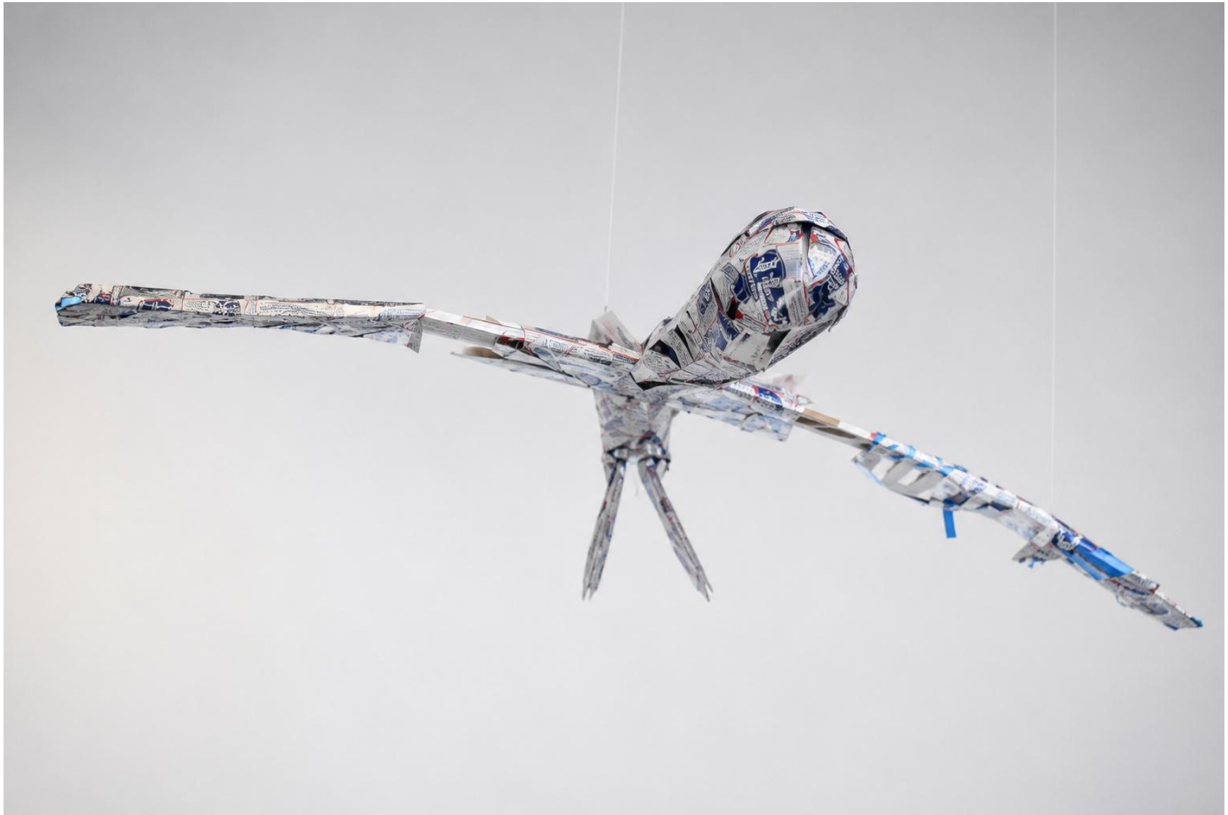
Figure 10: Predator, Fallen