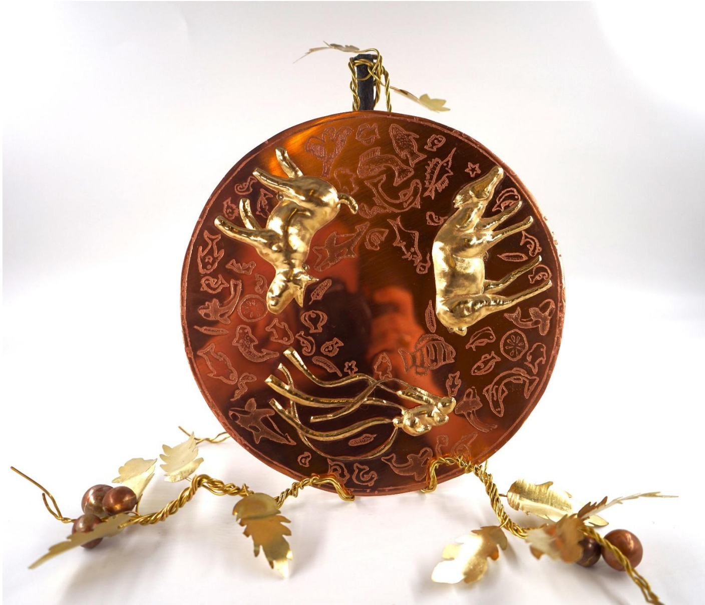
Figure 4: Pitch Burner