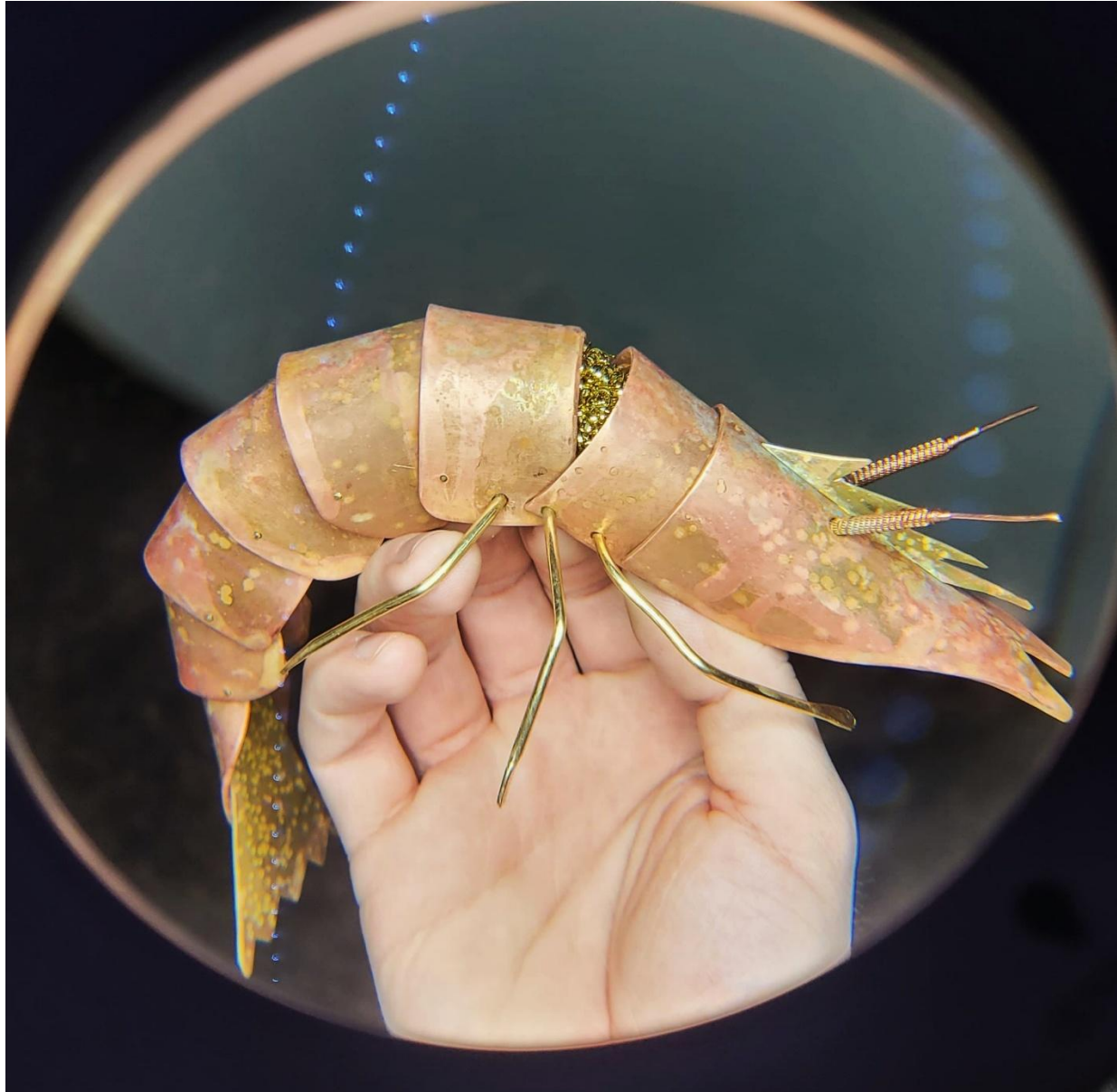
Figure 5: Ghost Shrimp