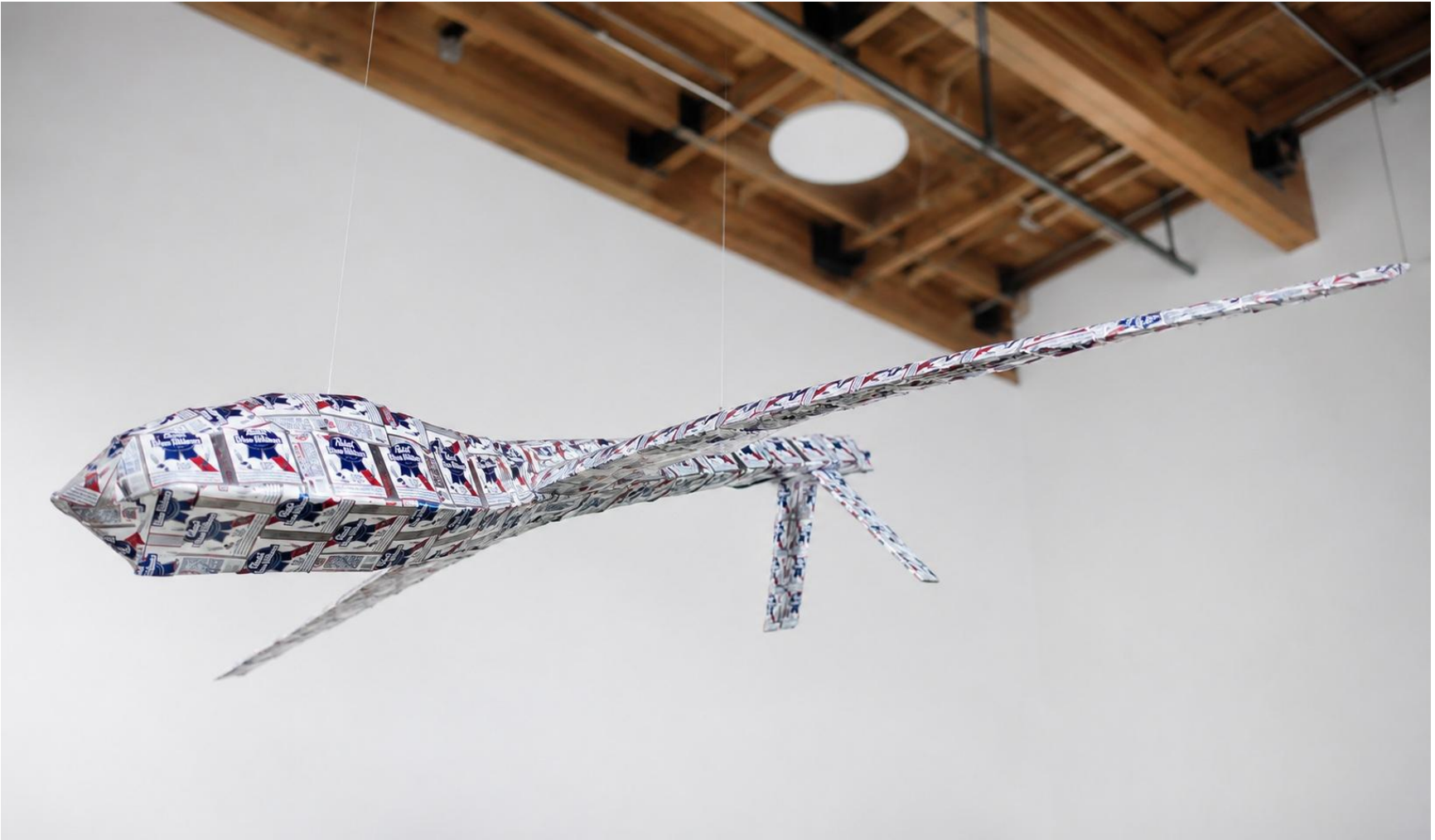
Figure 9: MRWSJ Predator Drone