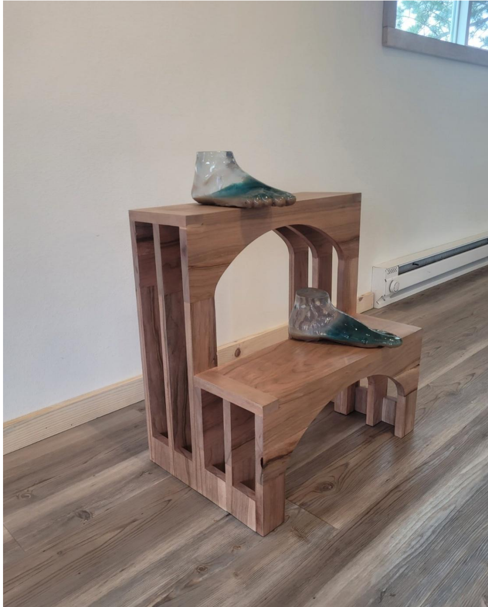
Figure 3: Arcade (Where the Body Passes)