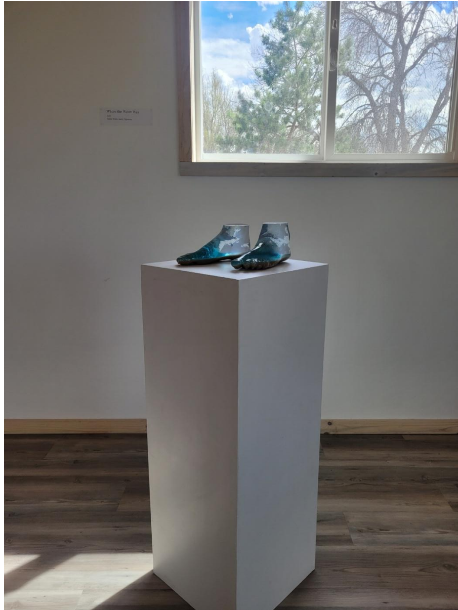
Figure 6: Where the Water Was