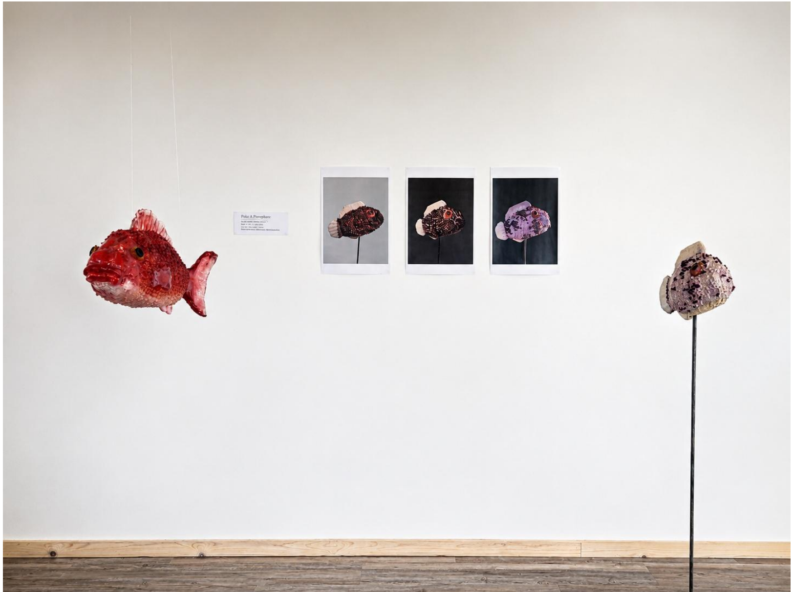
Figure 7: Persephone & Pluto