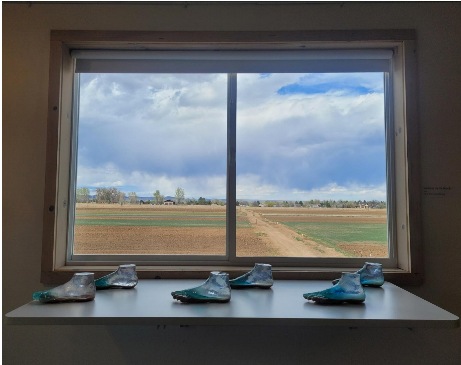
Figure 1: Remember Walking on the Beach?