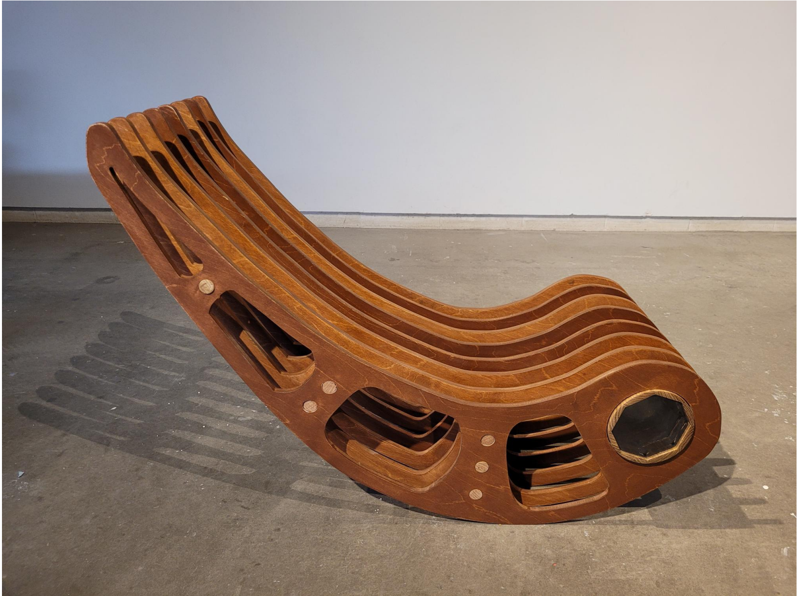
Figure 2: Liftoff (Where the Body Lies)