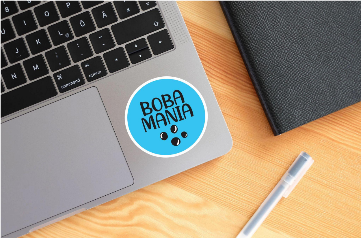
Figure 5: Logo Design