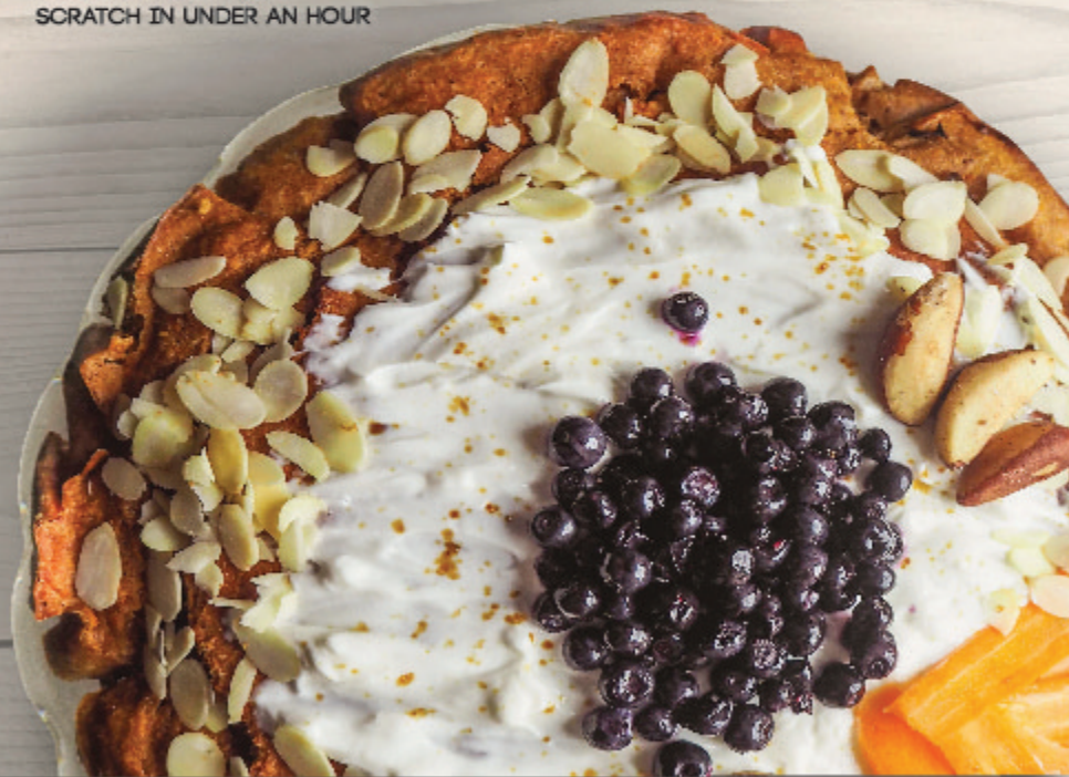
Figure 2: Typographic Magazine

DESSERTS MADE FROM SCRATCH IN UNDER AN HOUR