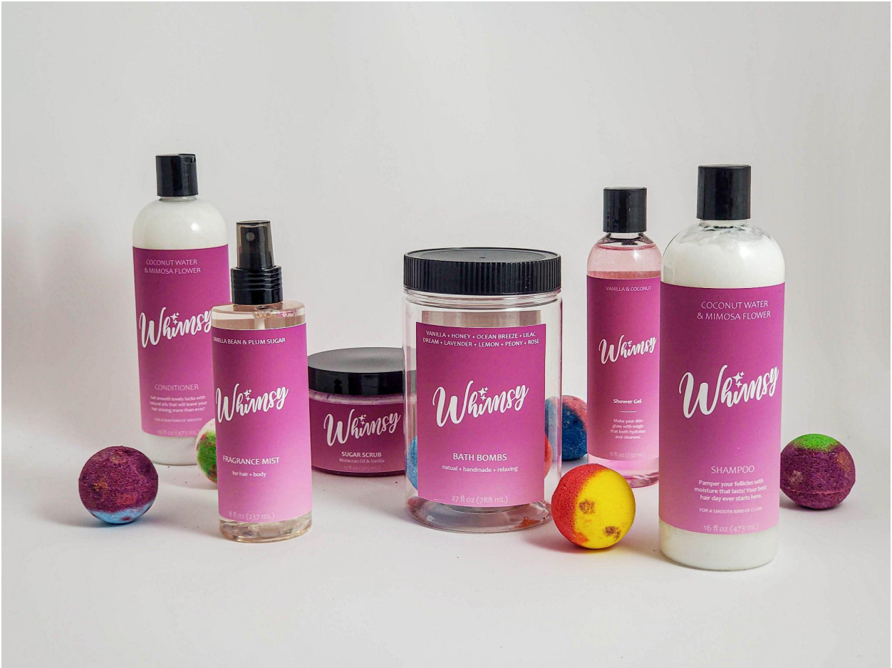
Figure 4: Brand Design