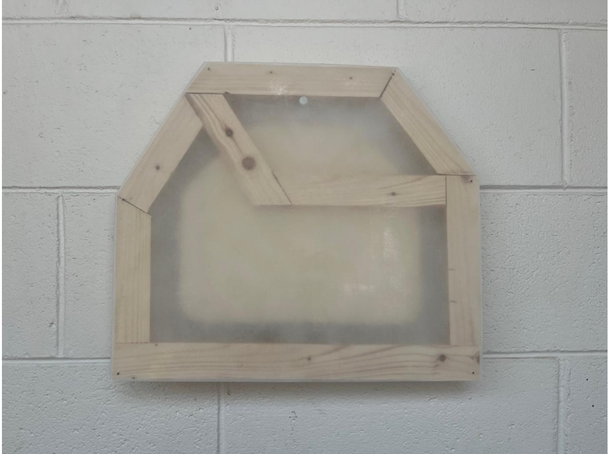
Figure 7: Map I