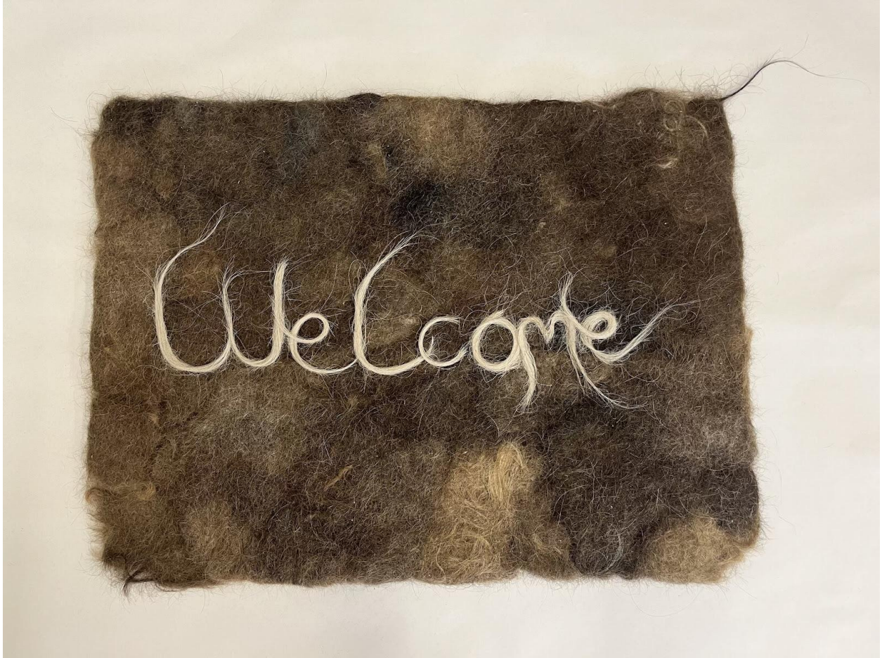
Figure 2: Welcome Mat