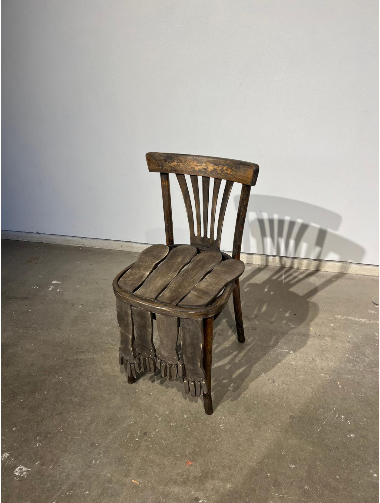
Figure 6: Chair