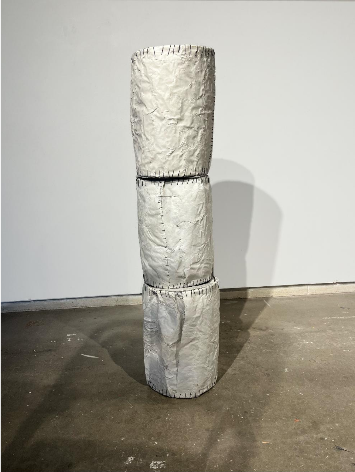
Figure 4: Anatomy and Form