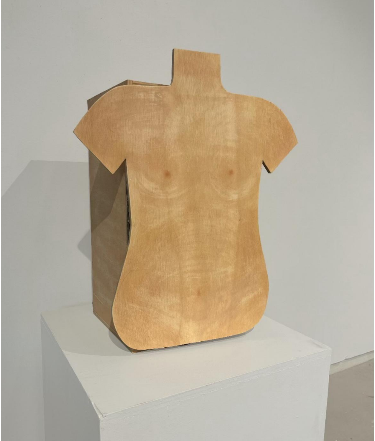
Figure 1: Cabinet (body)