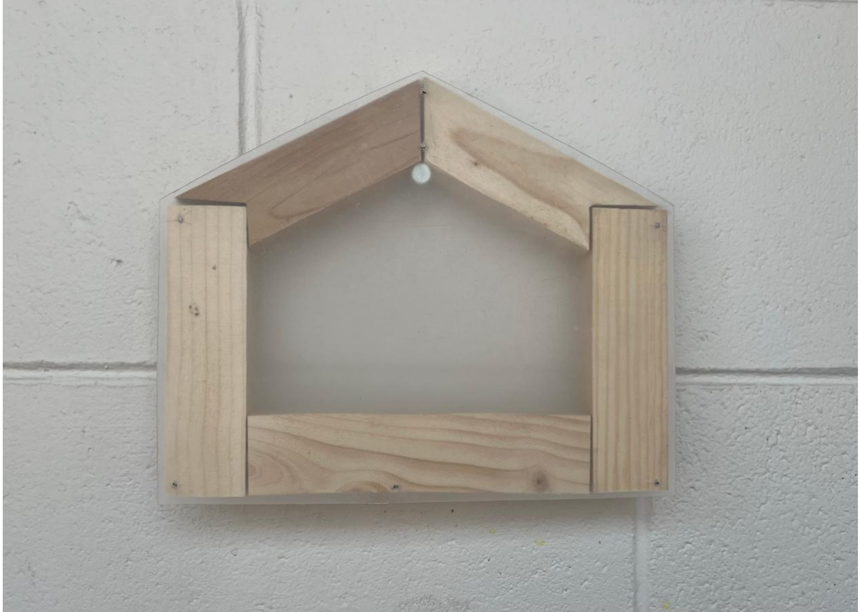
Figure 8: Map II