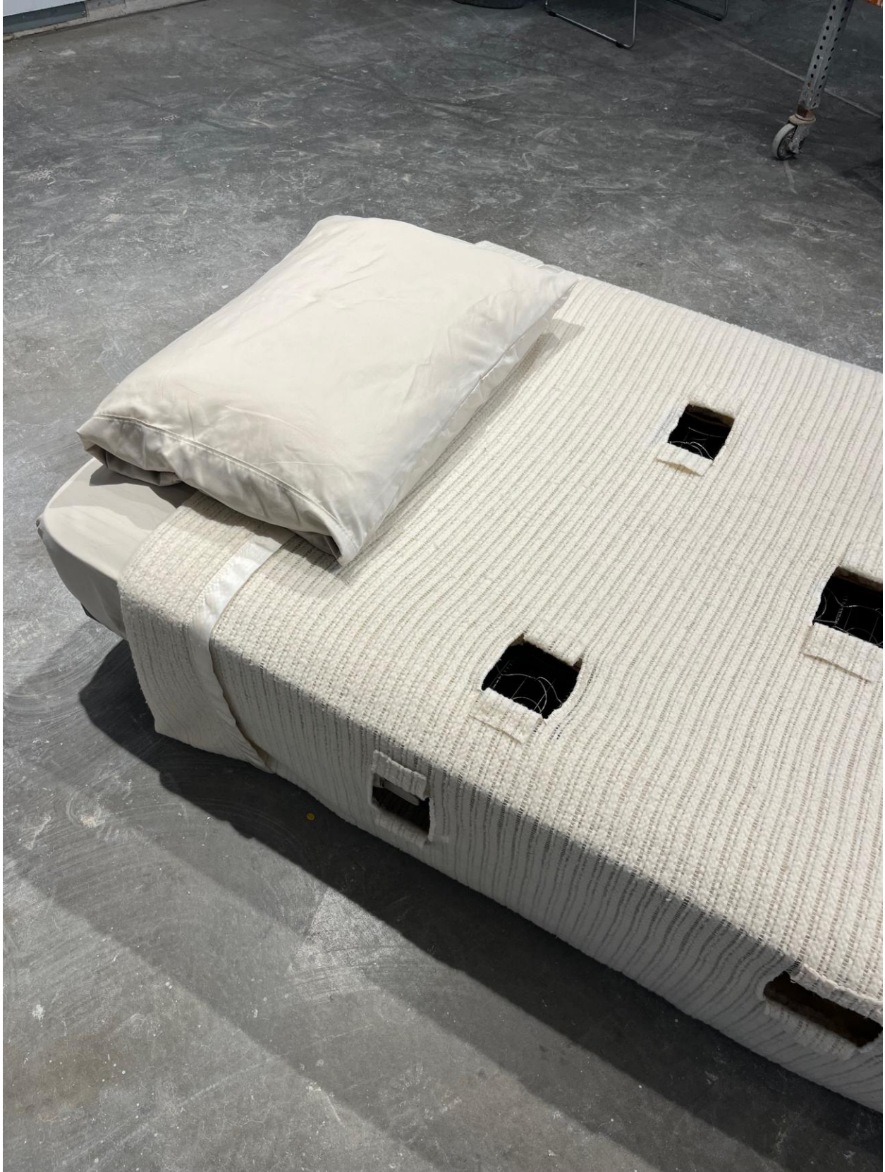
Figure 5: Bed