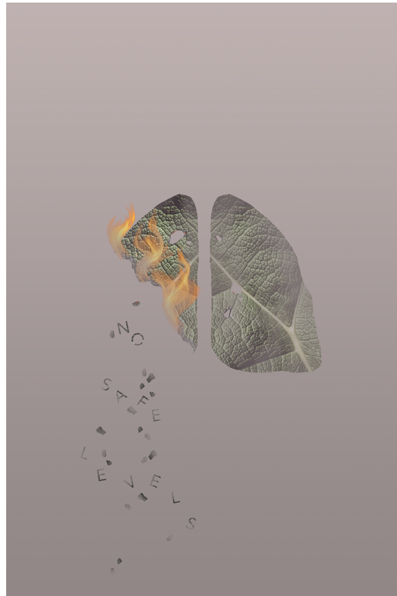
Figure 6: Burnt Lungs Poster