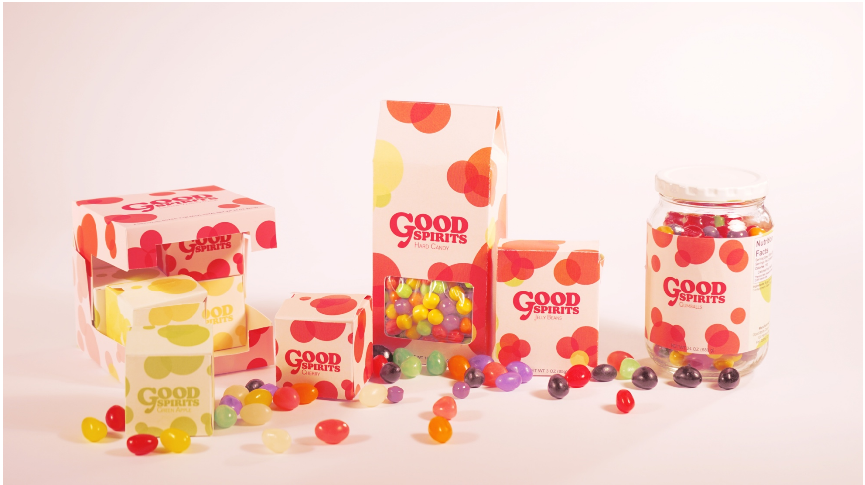
Figure 5: Good Spirits