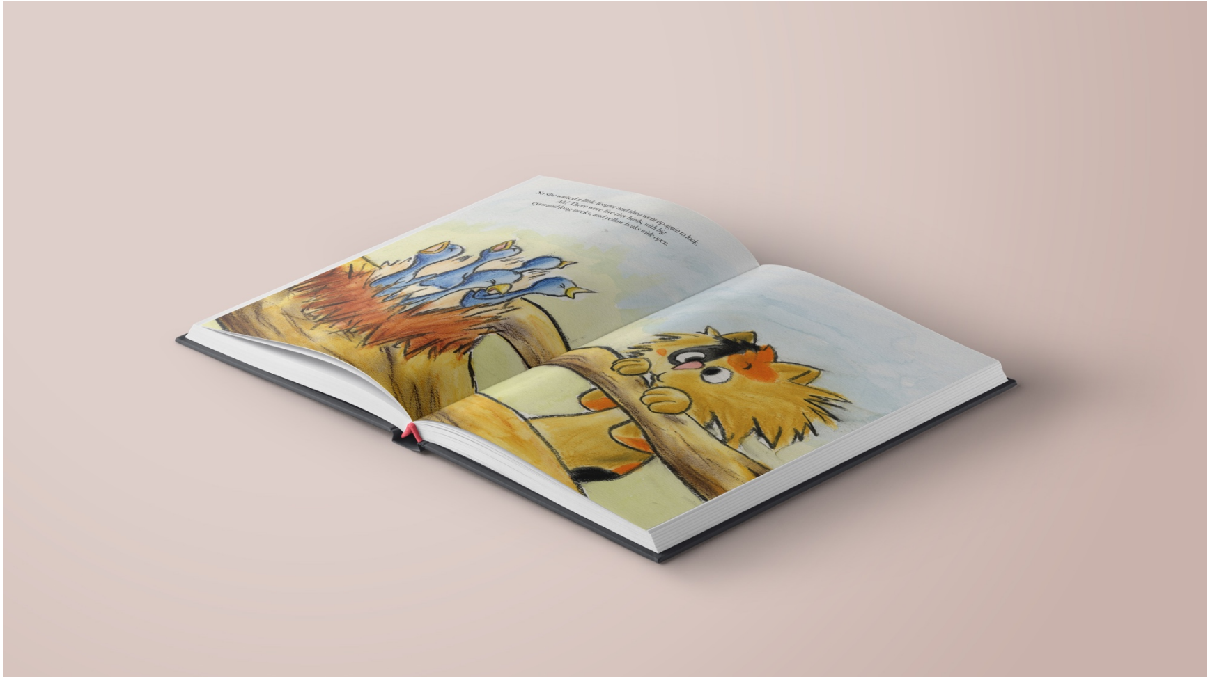
Figure 3: The Patient Cat