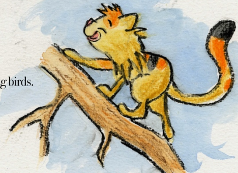
Figure 4: The Patient Cat