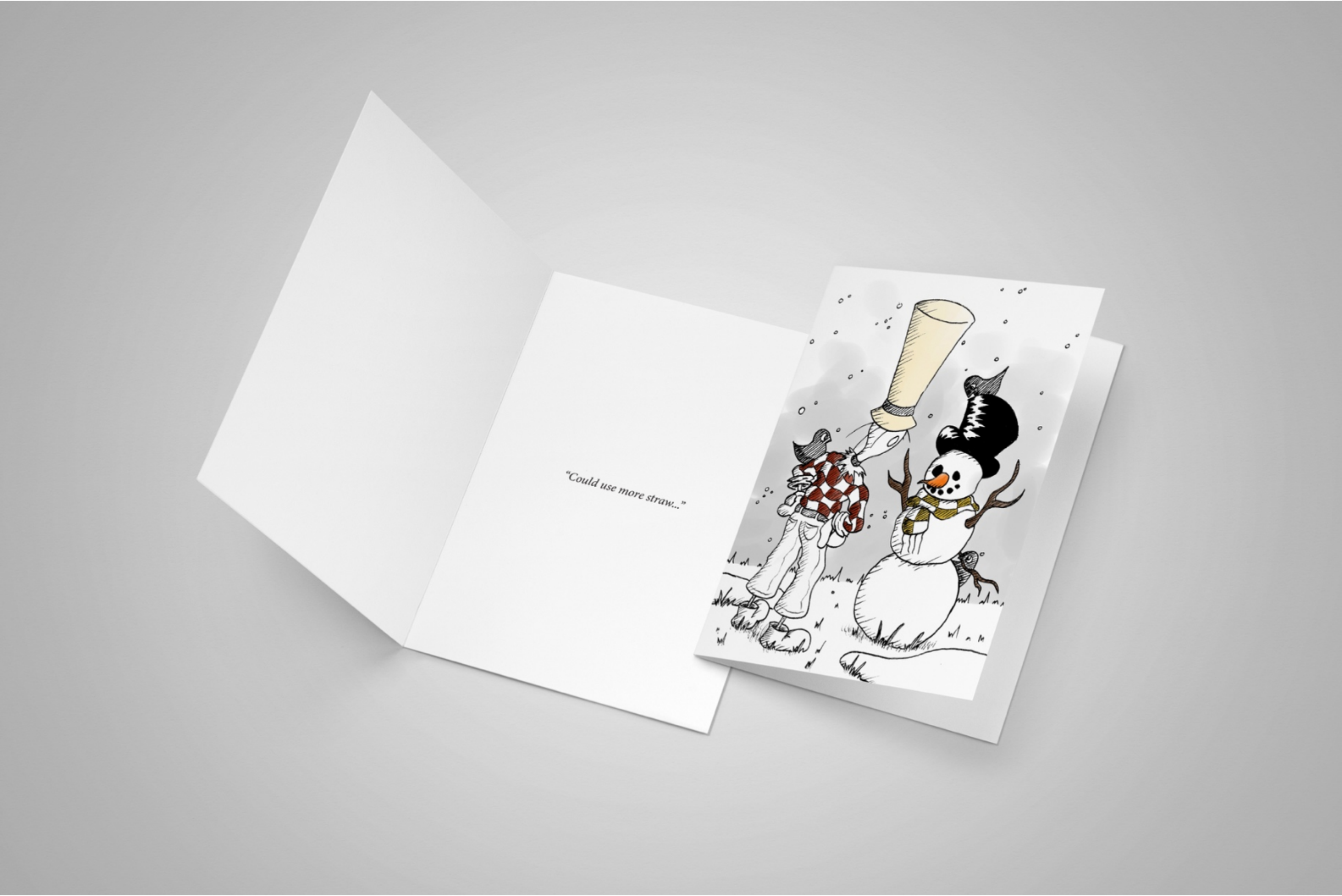
Figure 1: Lonely Scarecrow Greeting Cards