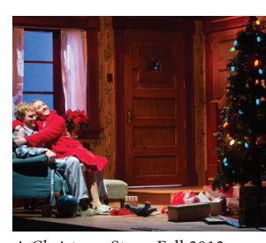
A Christmas Story, Fall 2012

This contemporary adaptation asks the unanswerable questions: Who is right? Does a right exist? How many wrongs make a right?