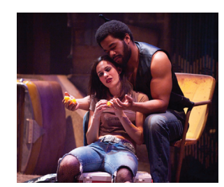
Polaroid Stories, Spring 2010

This broad family comedy about world and self-deception is a classic; shockingly funny and filled characters from French commedia. Tartuffe, a vagrant, poses as a holy man, and nearly tears a family apart with wild