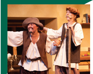
The Alchemist, Summer 2009

Tartuffe by Molière Aug. 22 – Sept. 8, 2013 University Theatre