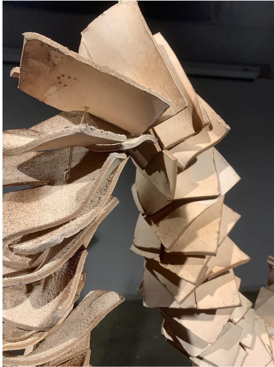
Figure 3: Scaled Leather Garland