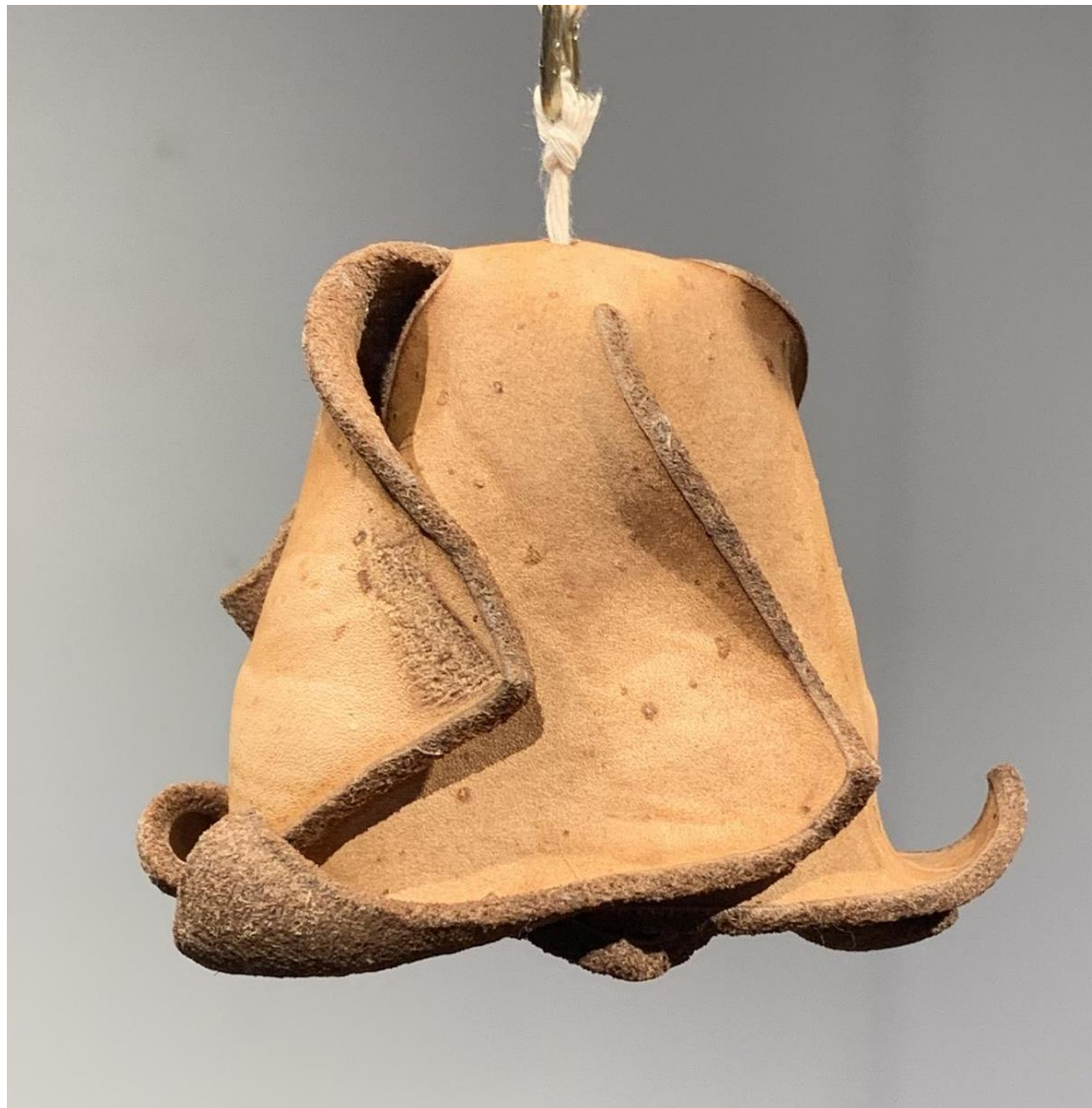
Figure 6: Flesh Roses