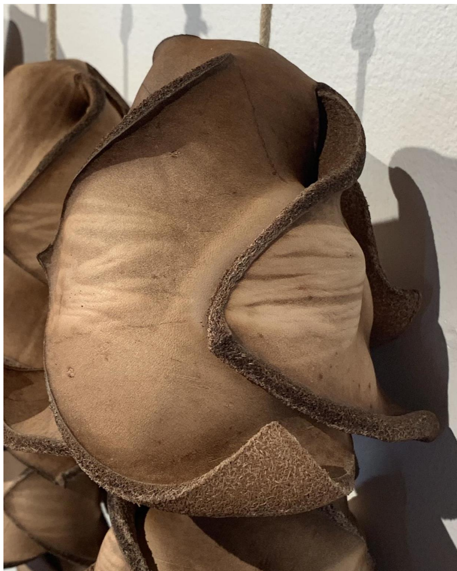
Figure 9: Skin Chimes