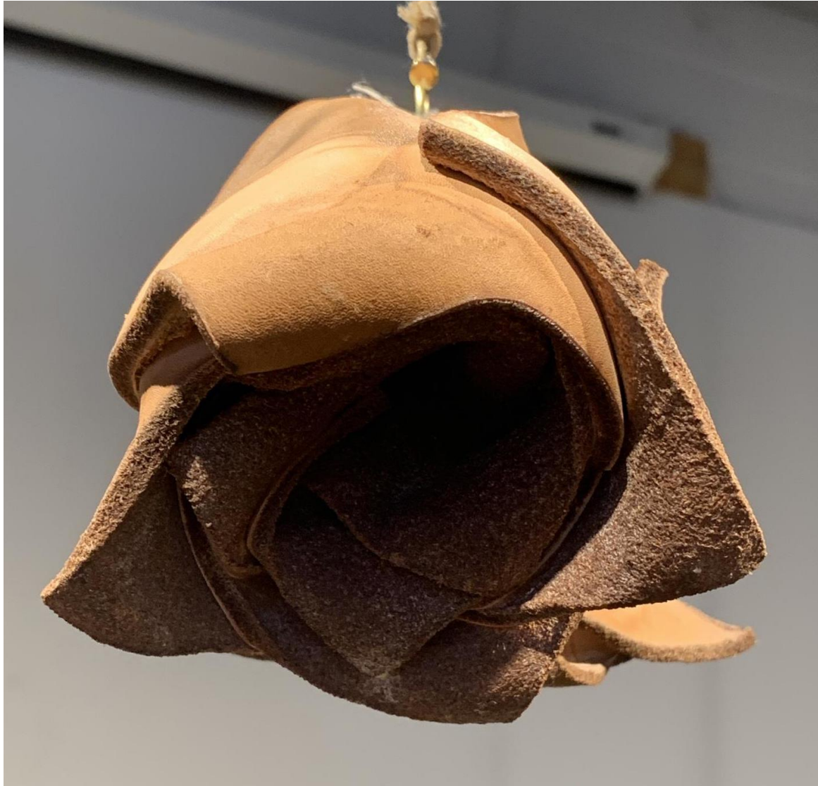
Figure 5: Flesh Roses