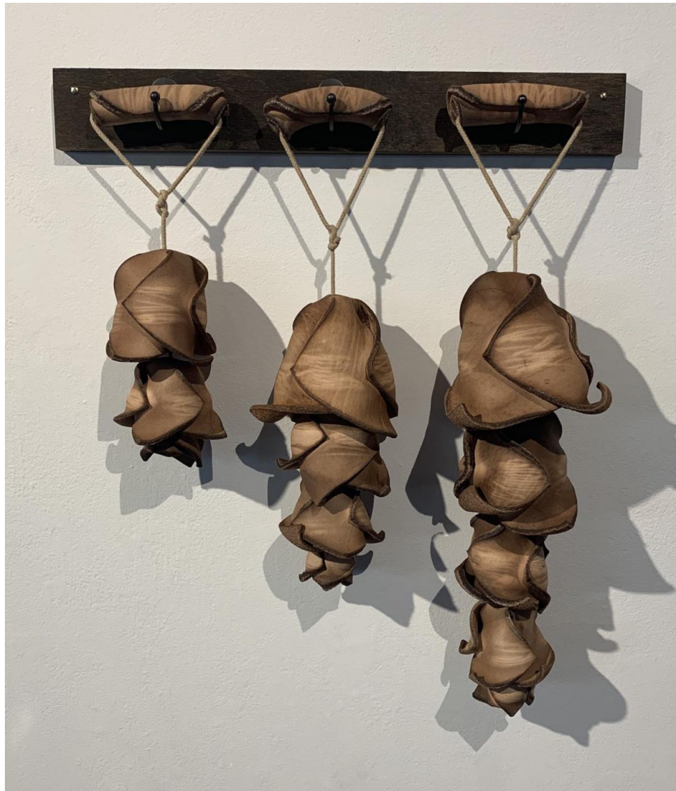
Figure 8: Skin Chimes