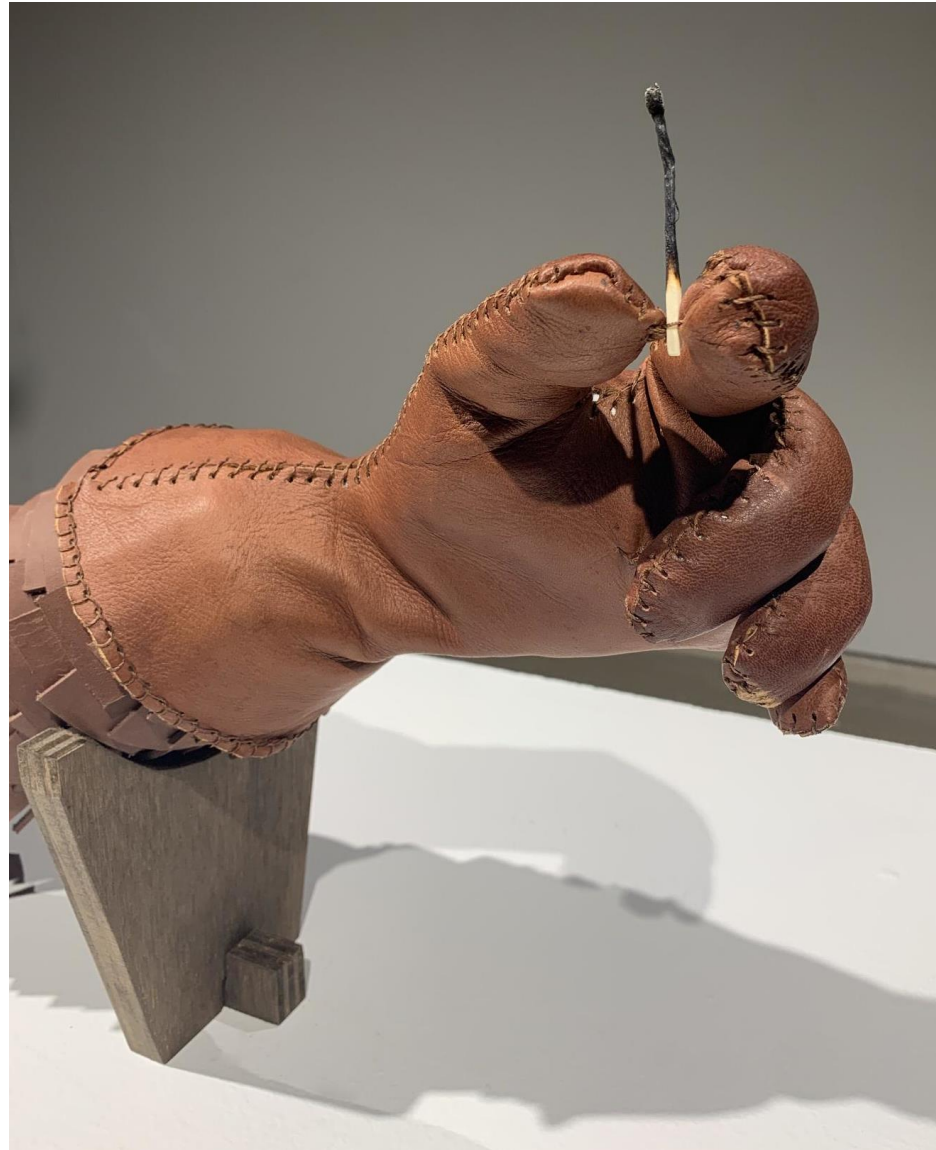
Figure 13: Match