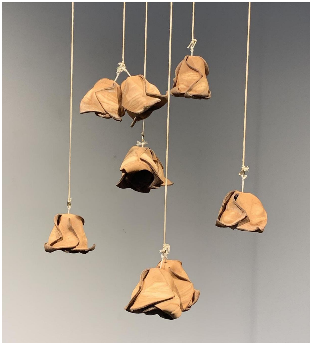
Figure 4: Flesh Roses