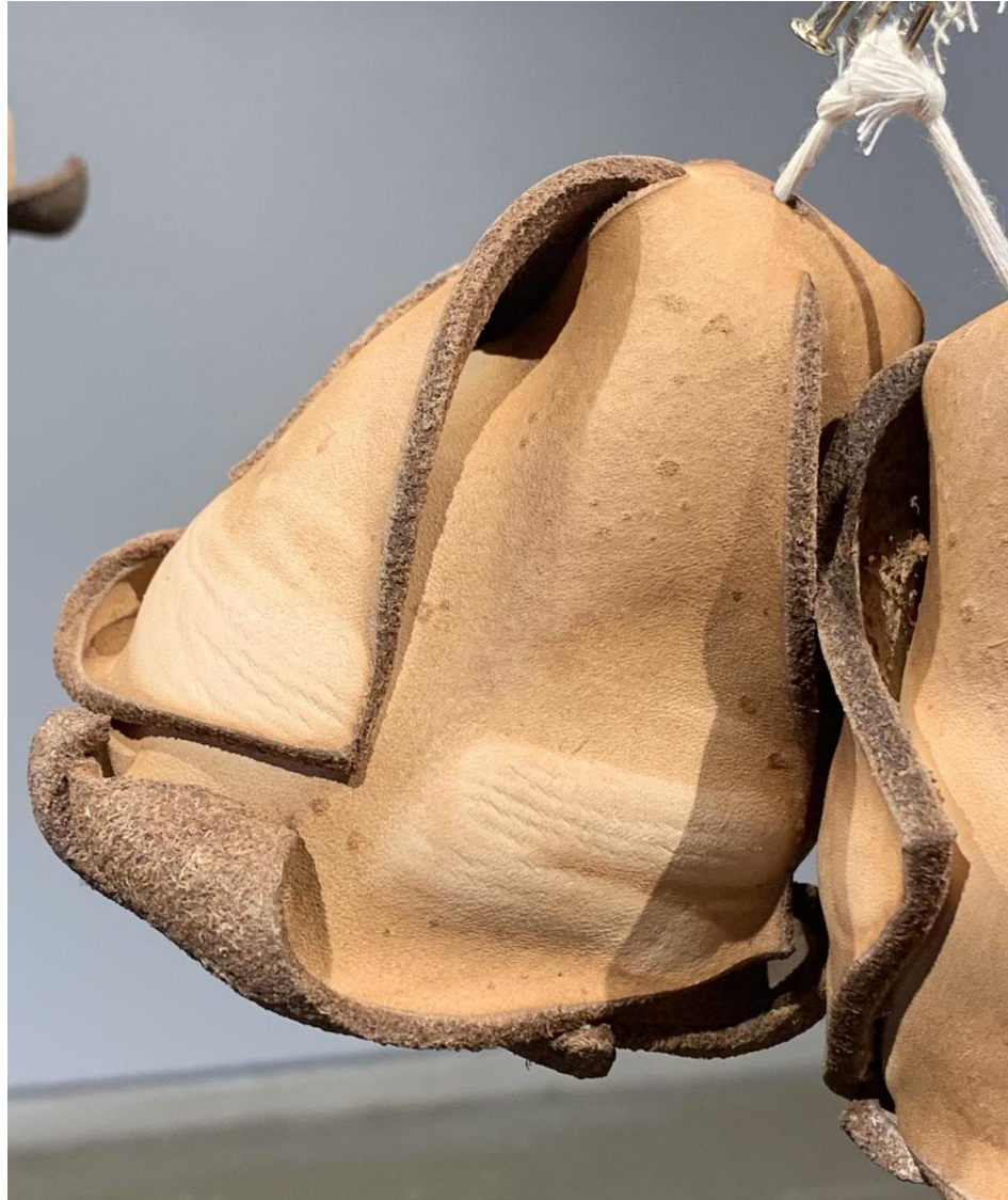
Figure 7: Flesh Roses