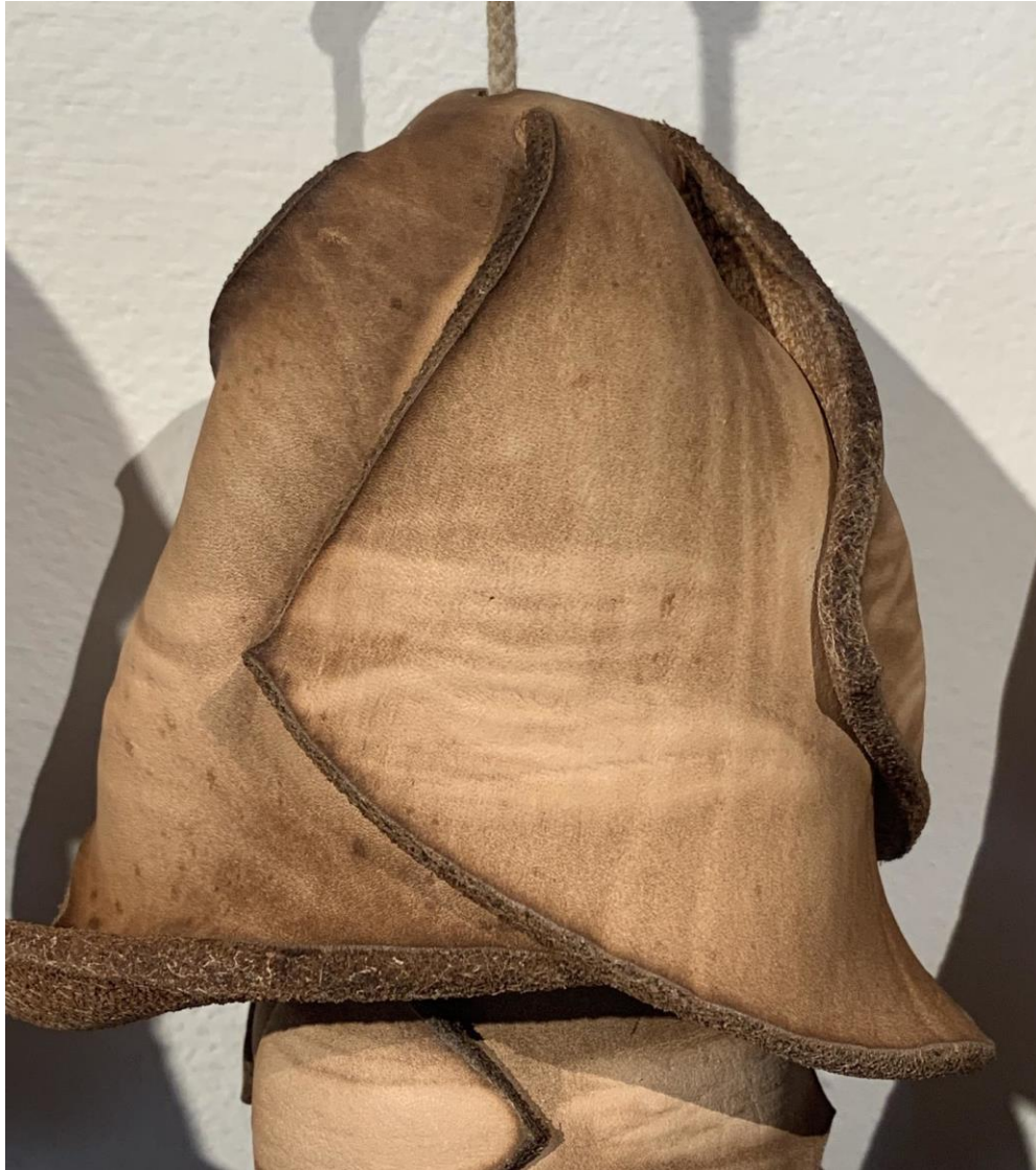
Figure 11: Skin Chimes