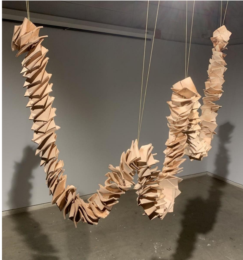
Figure 1: Scaled Leather Garland