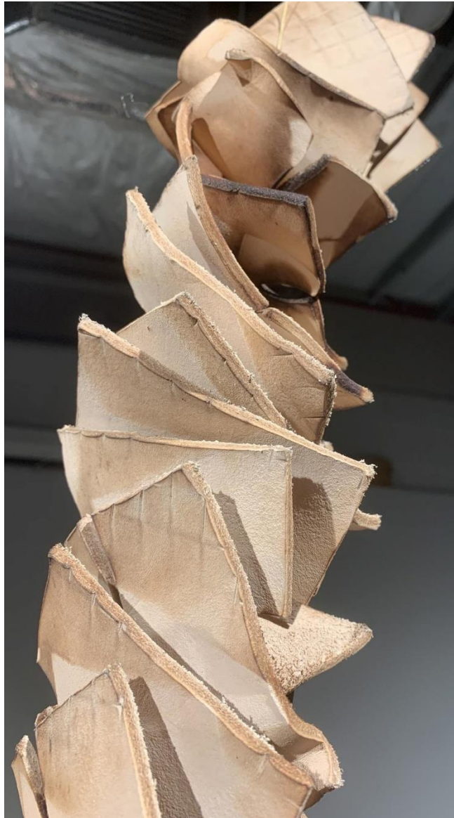
Figure 2: Scaled Leather Garland