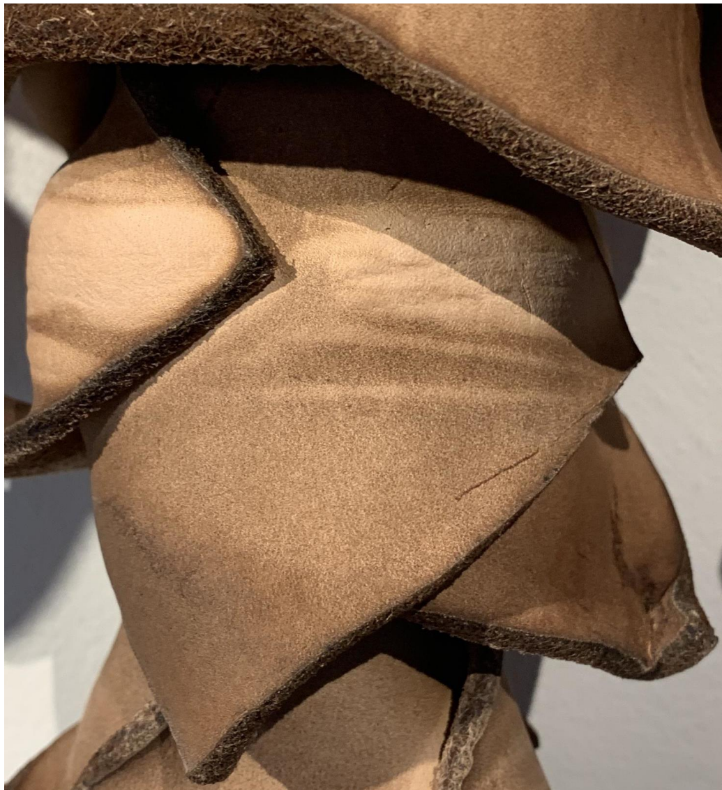
Figure 10: Skin Chimes