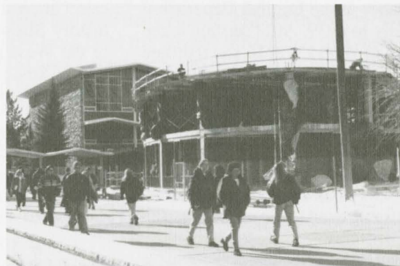
View of Library Construction