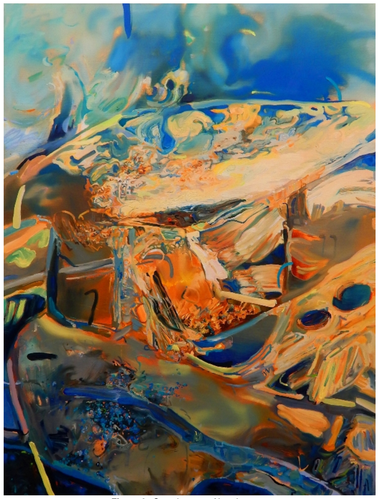
Figure 3: Complacency; Abandonment