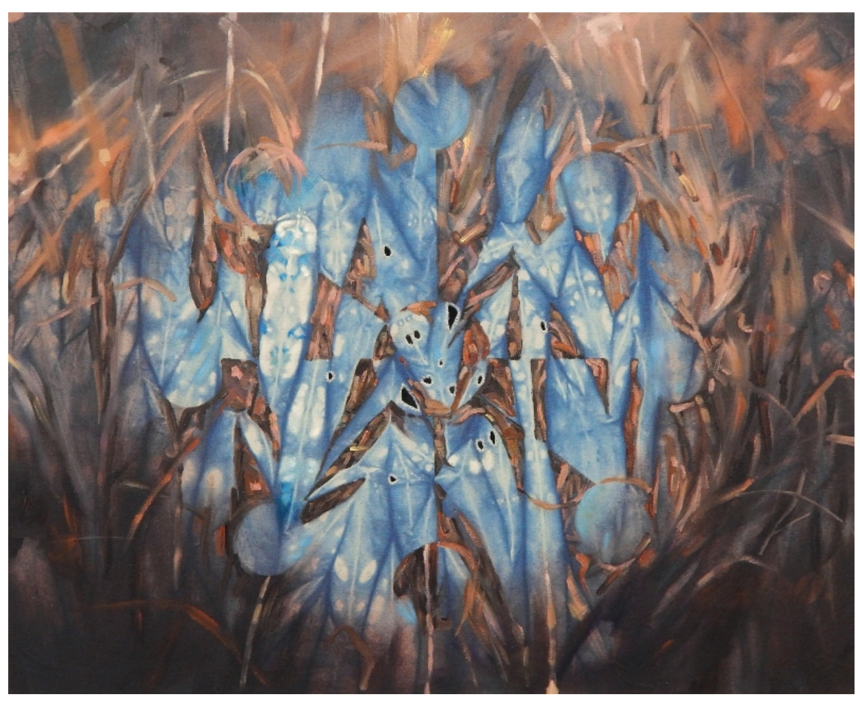
Figure 7: Sanctuary