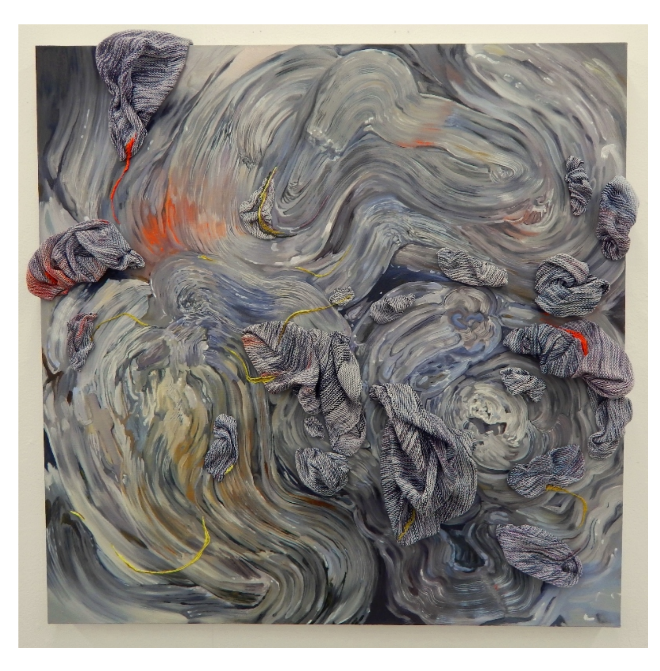
Figure 5: Just a Minor Concussion