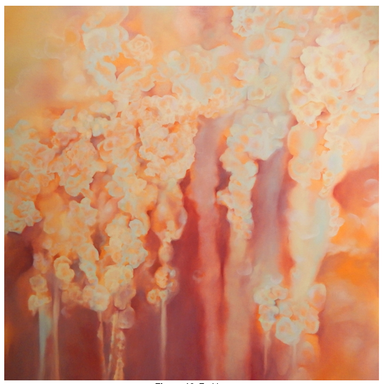
Figure 10: Fruition