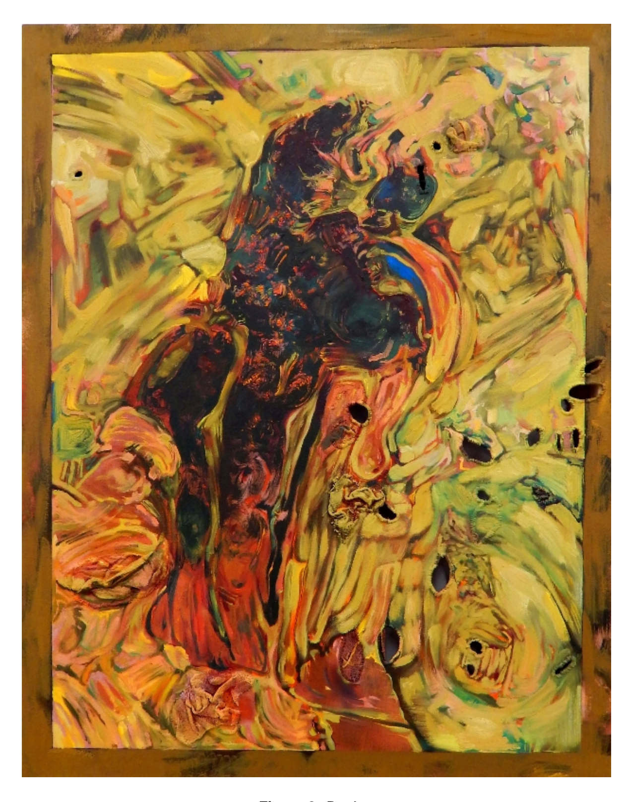
Figure 2: Brother