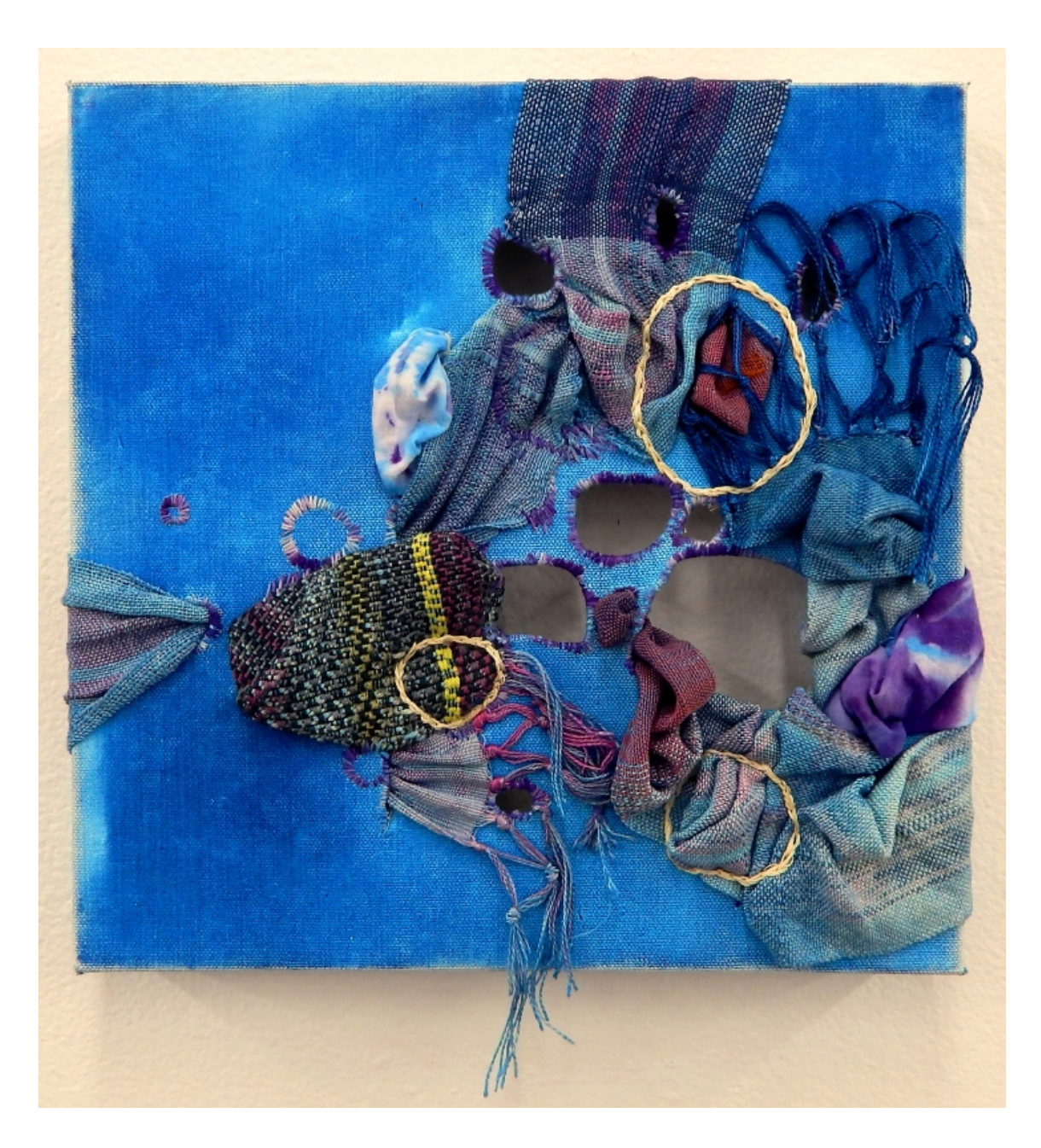
Figure 6: Parrotfish