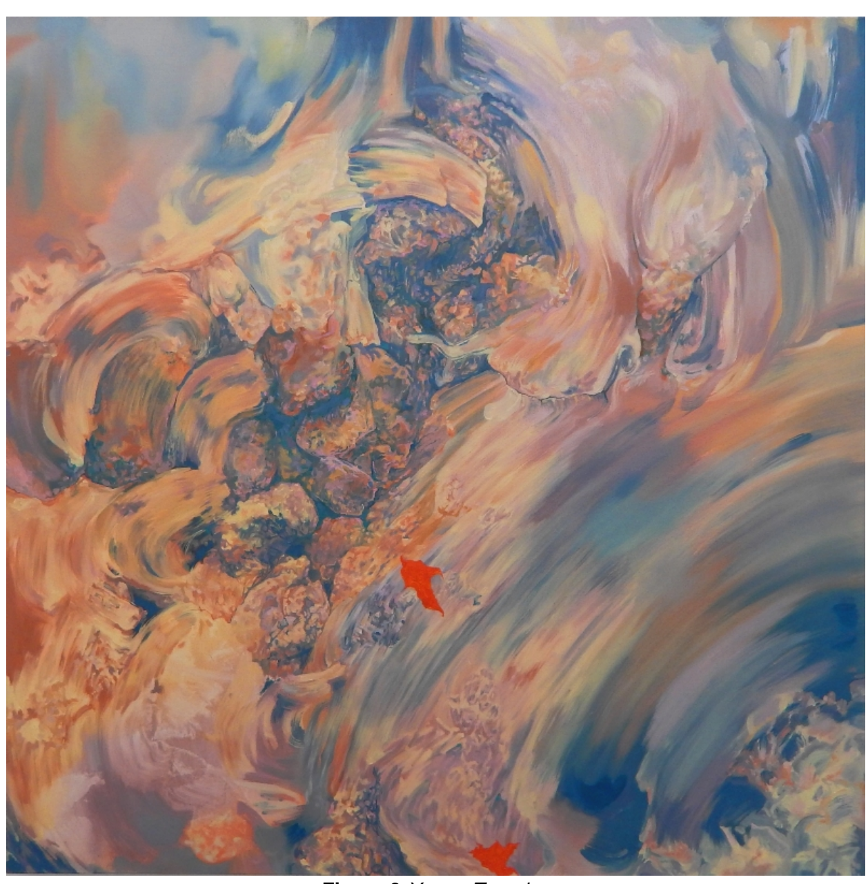
Figure 9: Young Traveler