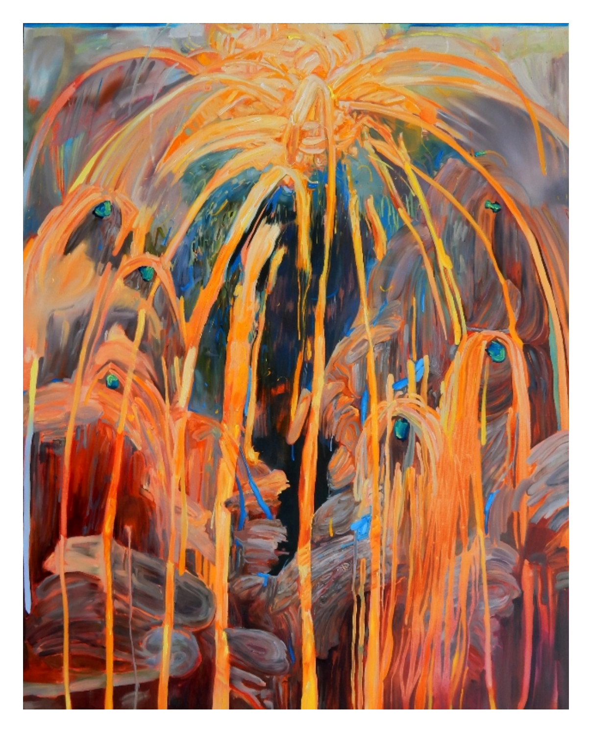
Figure 1: Tijuana