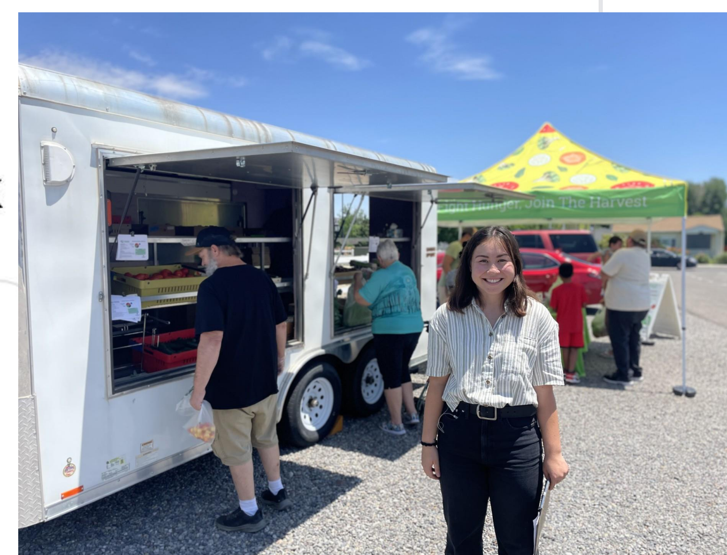
Figure 1. Harvest Mobile Market partnered with Community Food Bank of Grand Junction