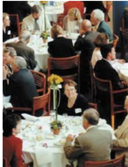
Guests at a previous year's Tables of Content enjoy pre-dinner conversation.

M ark your calendar to attend CSU Libraries' Third Annual Tables of Content, a one-of-a-kind event that is already becoming a campus tradition. Scheduled for 6 p.m. Saturday, June 5, the evening will bring together experts in various fields hosting discussions on topics in science and technology, the arts and humanities, education, current affairs, history and the media.