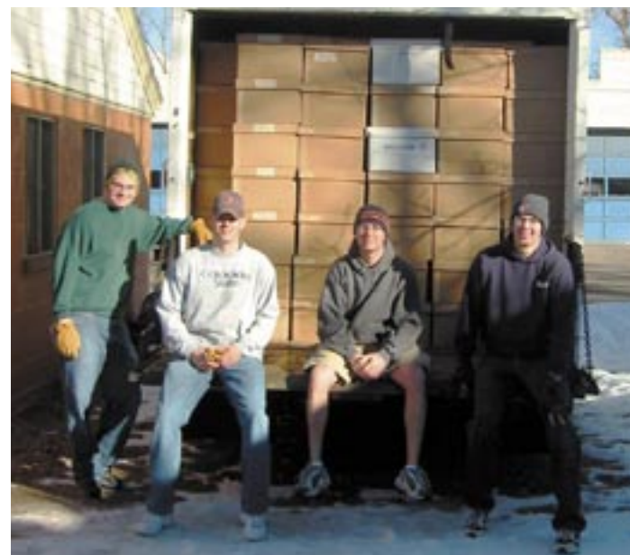
Moving day: Morgan Library's student workers take a breather after loading a moving van with most of the 686 boxes of the Colorado Agricultural Archive.