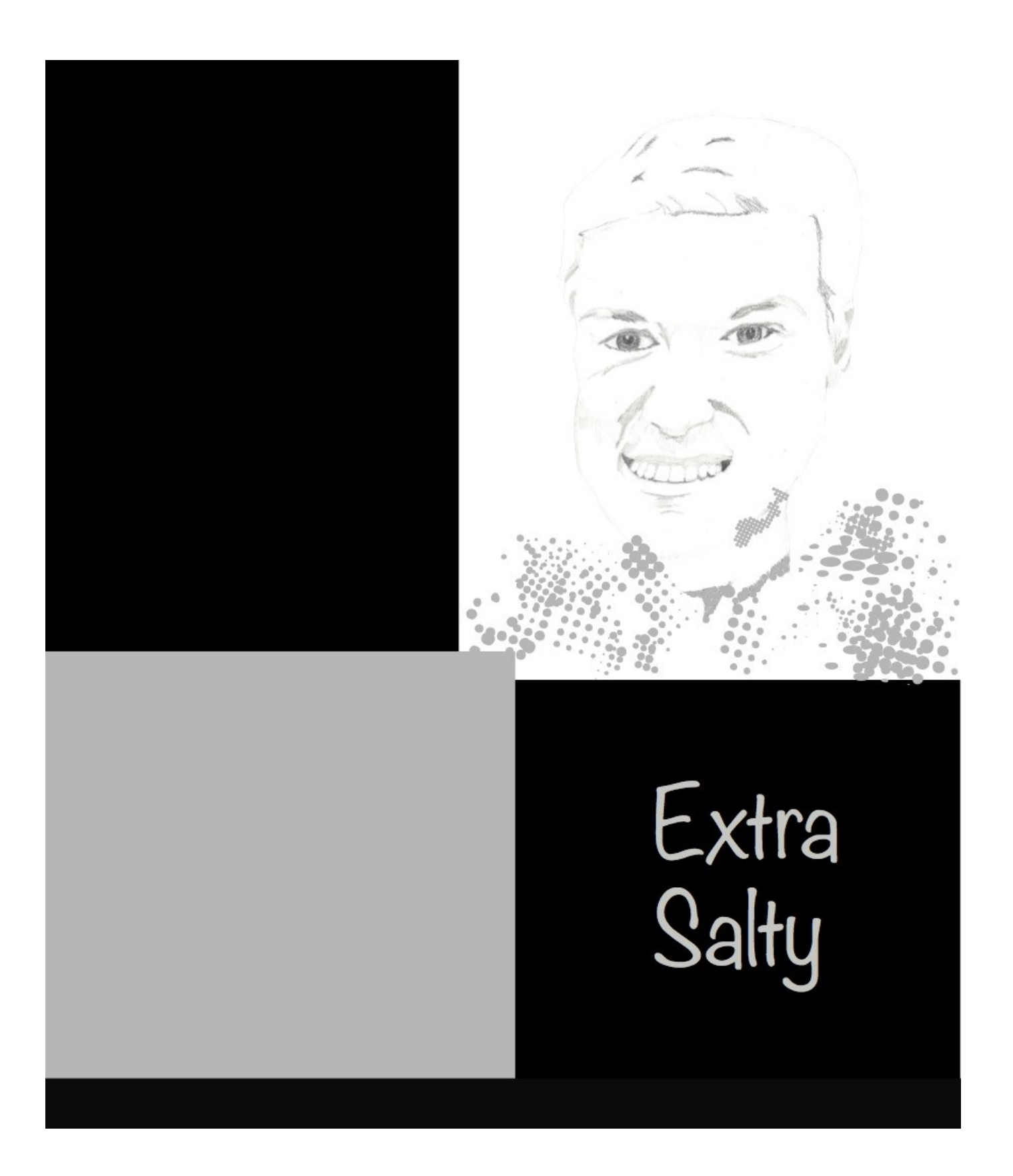
Figure 9: Bryson Calendar Portrait.