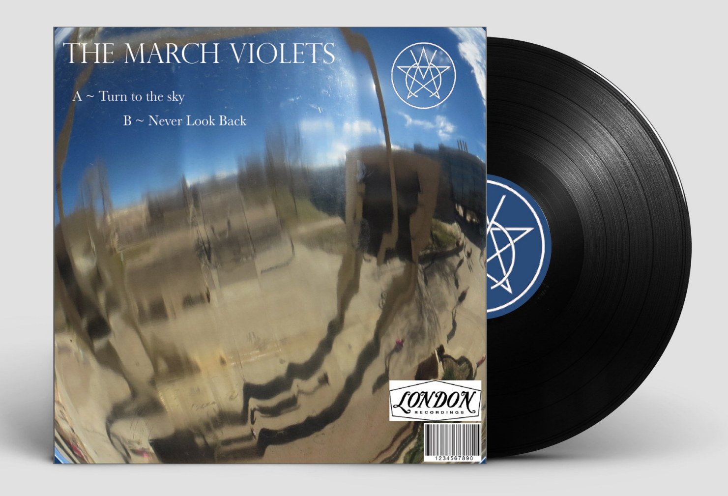
Figure 8: Vinyl Back Cover.