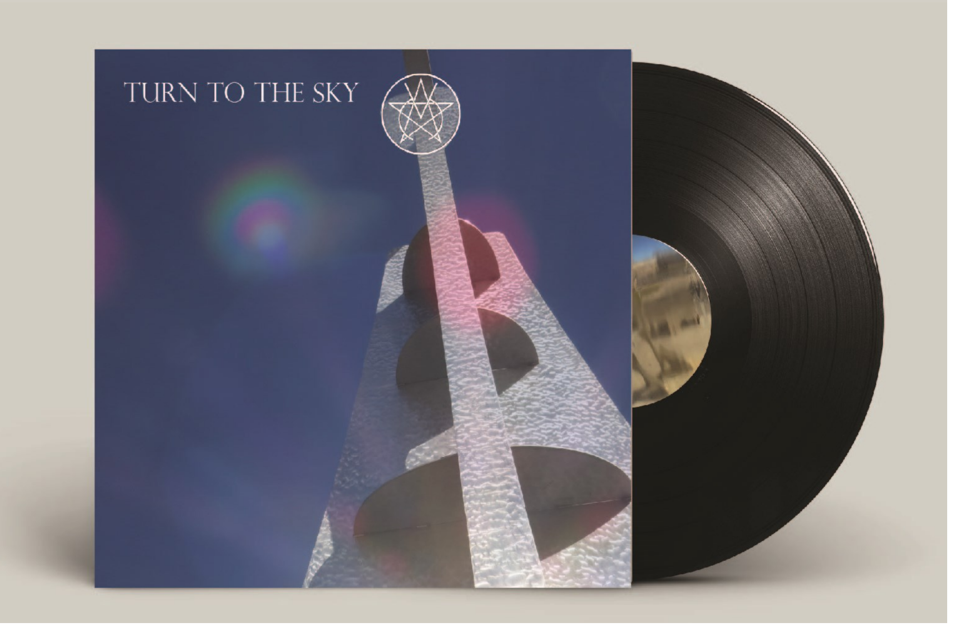
Figure 7: Vinyl Front Cover.