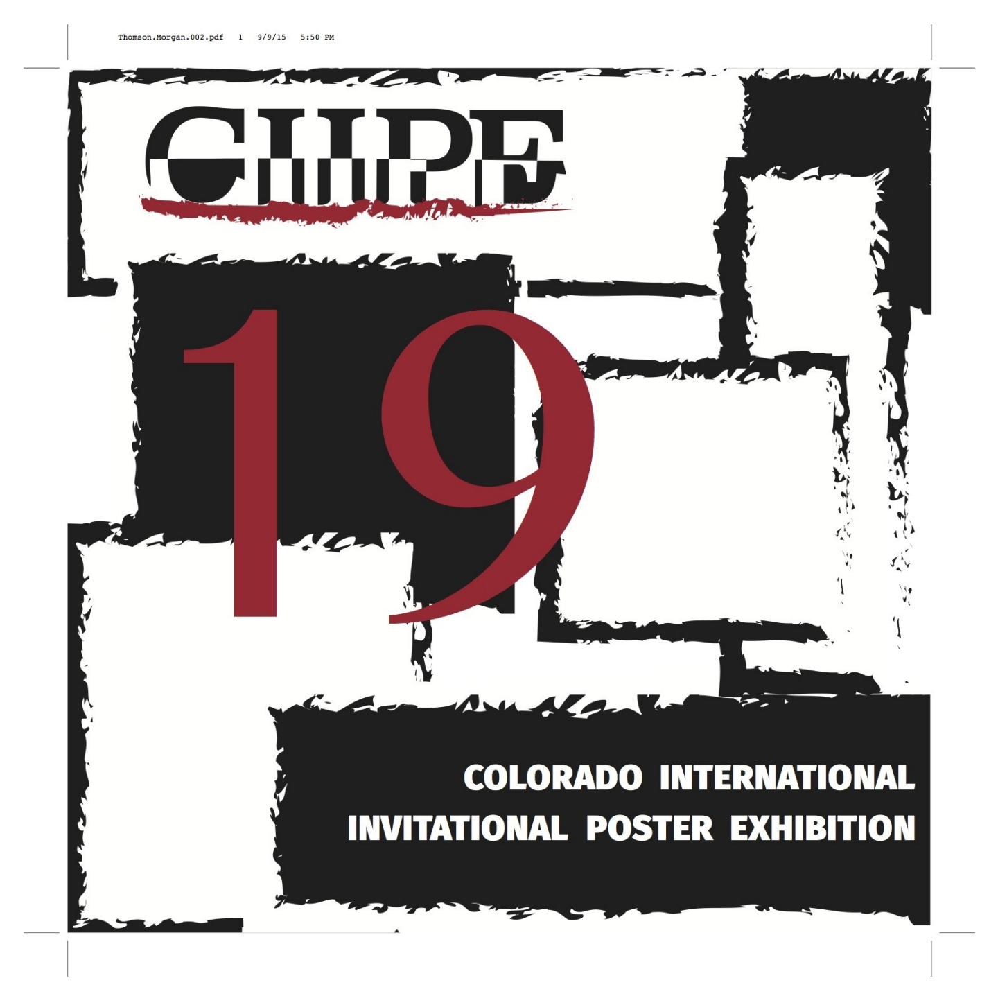
Figure 4: CIIPE Catalog Cover.