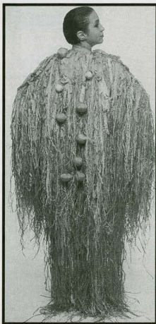
Celebration Coat 54 made of rayon, cotton, and raffia. 70 x 52 x 4 inches, 1991.