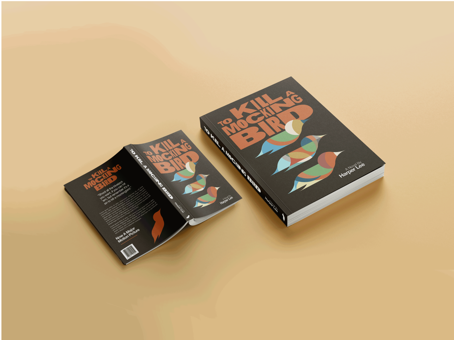
Figure 9: To Kill A Mockingbird Cover Re-design