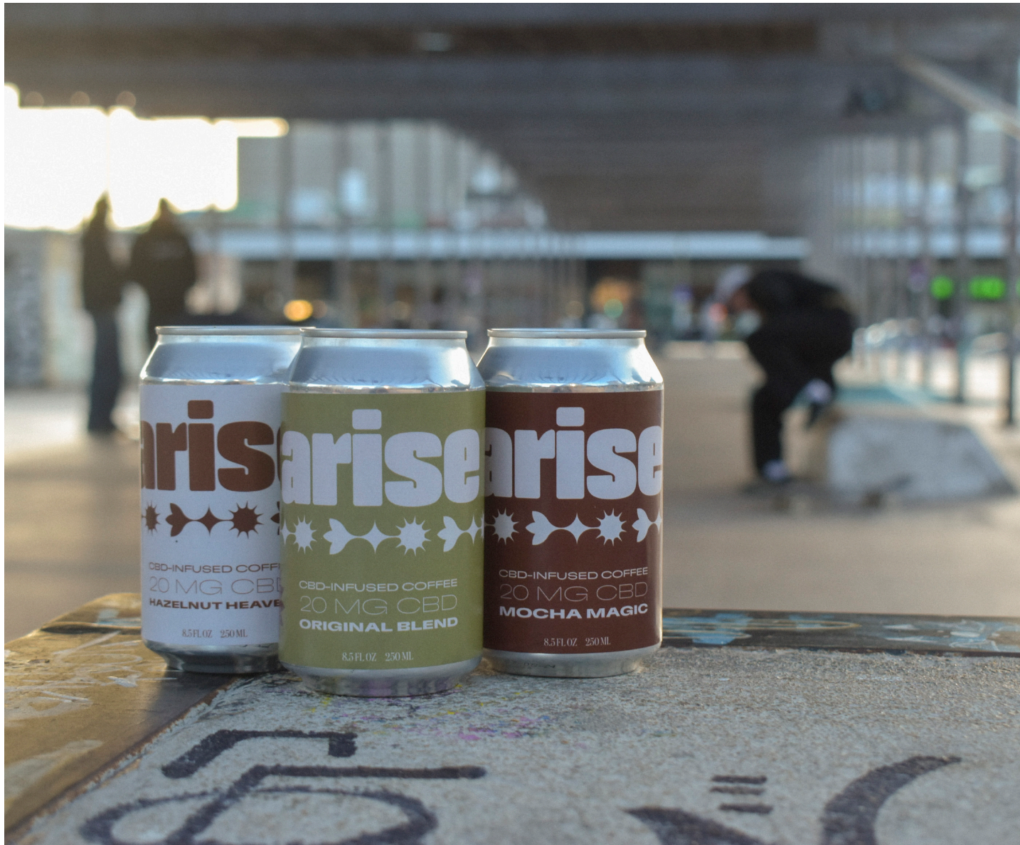
Figure 3: Arise CBD Coffee