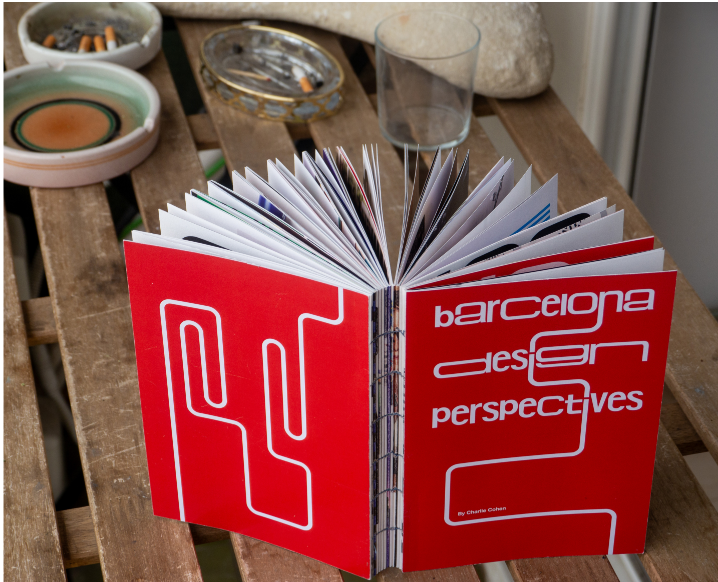
Figure 1: Barcelona Design Perspectives