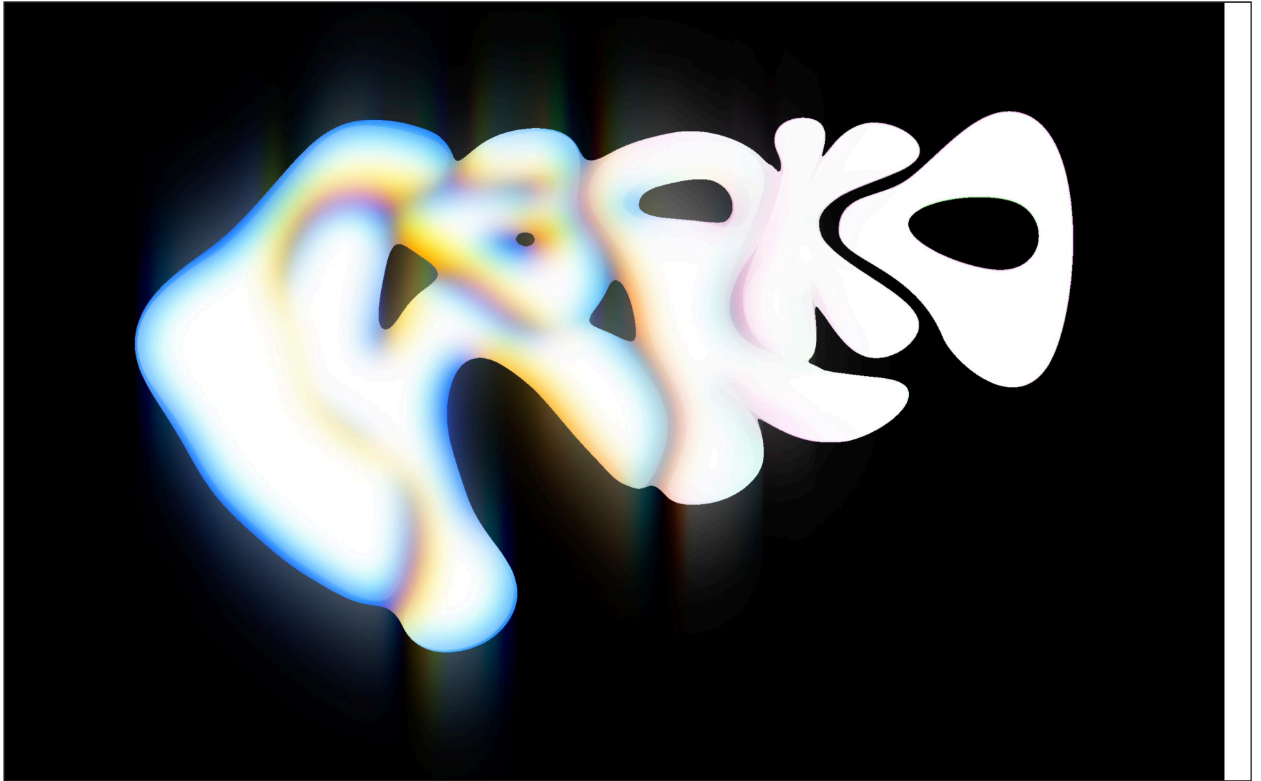
Figure 2: Charko (Music Production Alias)