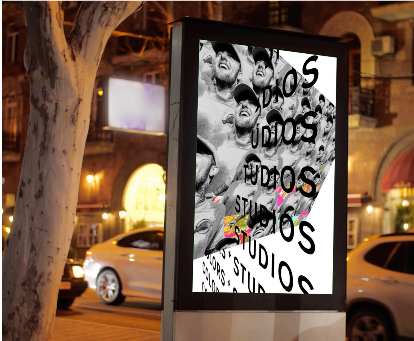
Figure 5: Colors Motion Identity