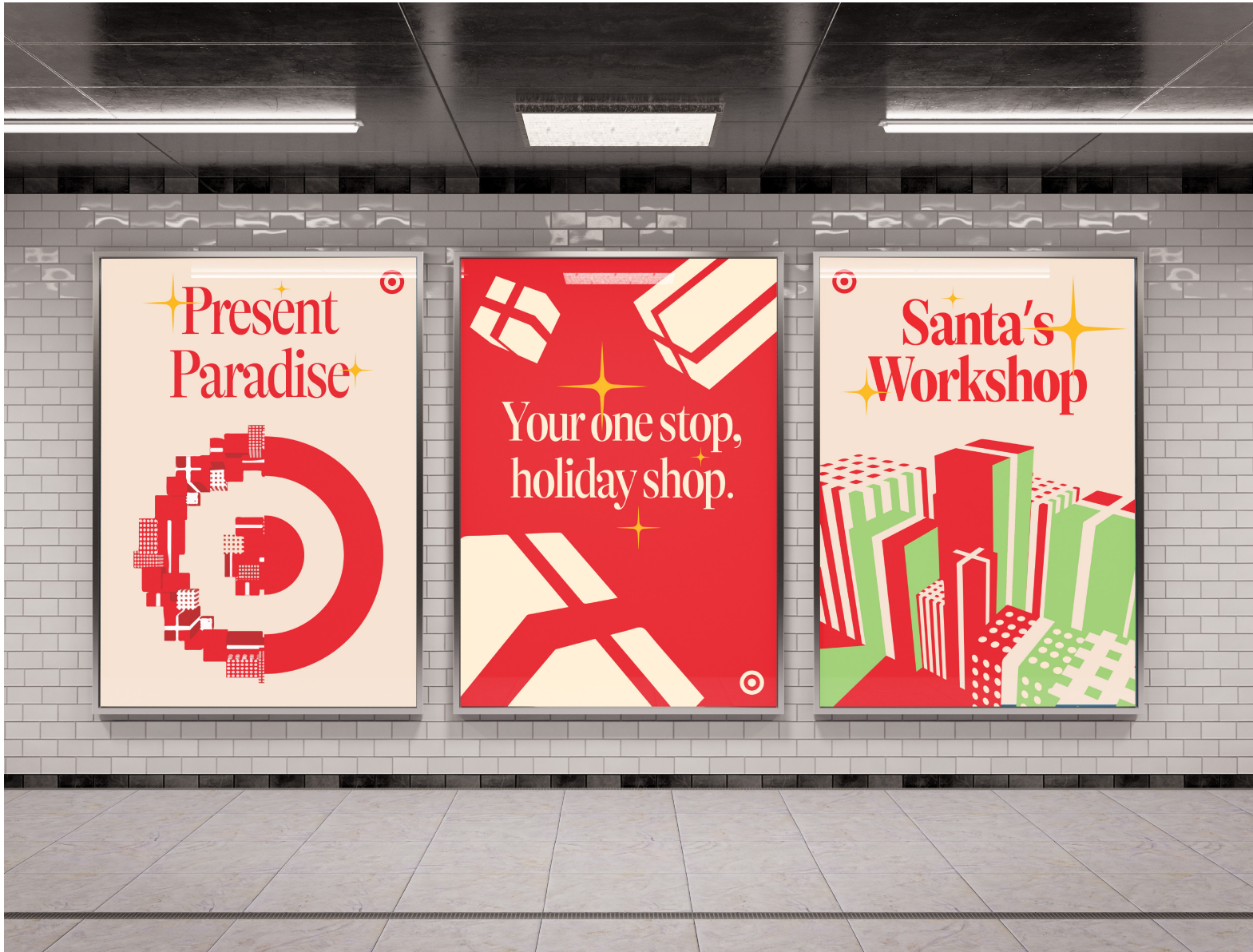
Figure 6: Target Christmas Campaign