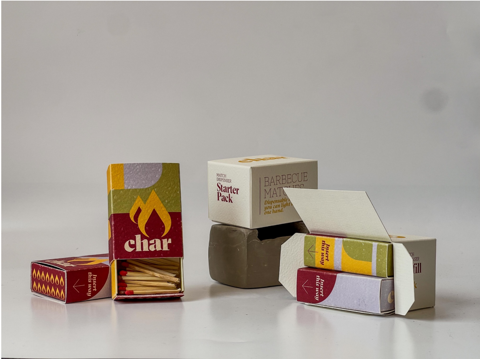
Figure 8: Char Barbecue Matches