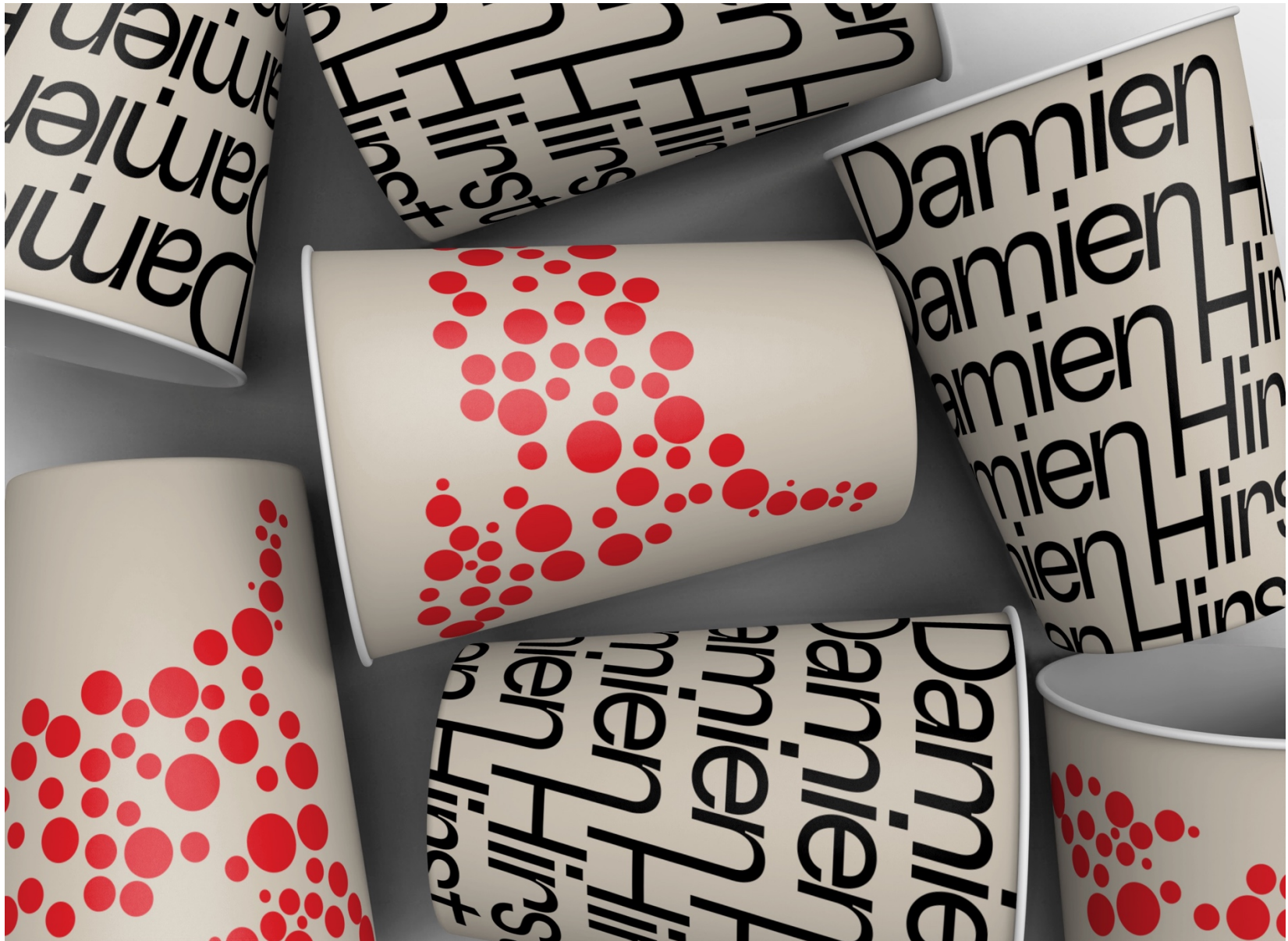
Figure 7: Damien Hirst Re-Brand