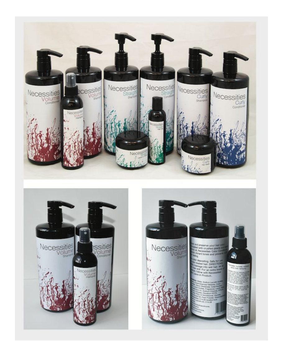
Figure 6: Packaging