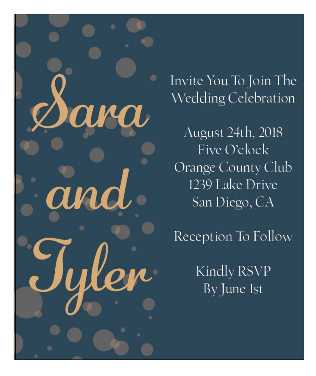
Figure 5: Wedding Invite Inside