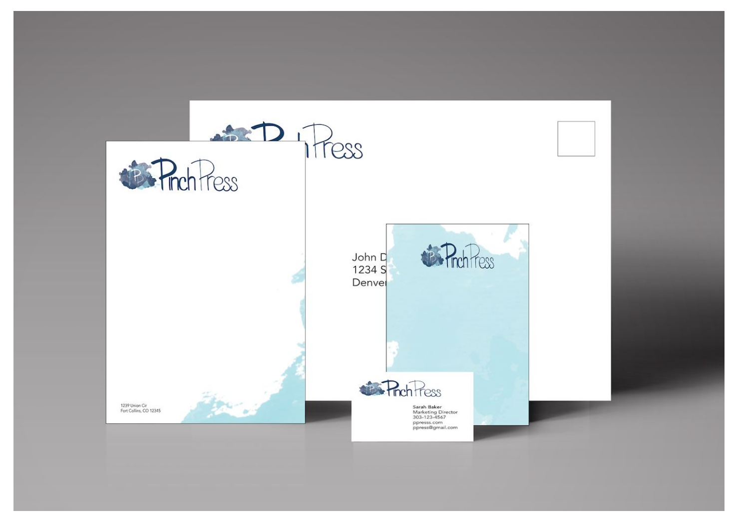
Figure 3: Branding