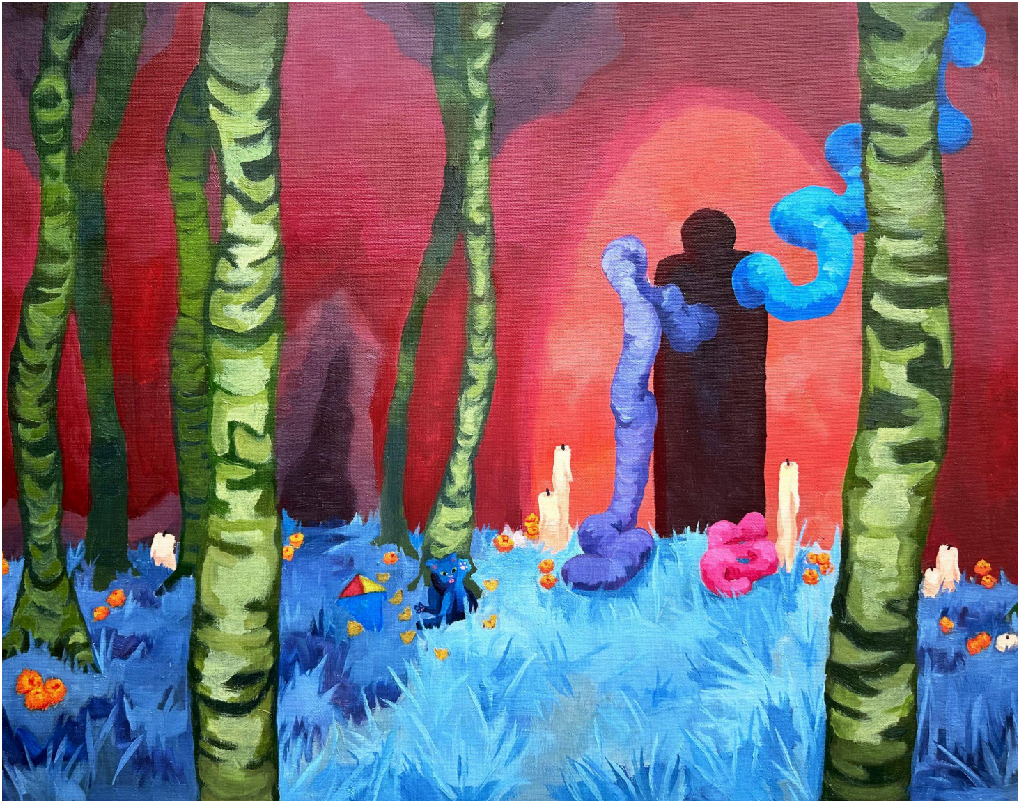
Figure 2: Taking a Breather