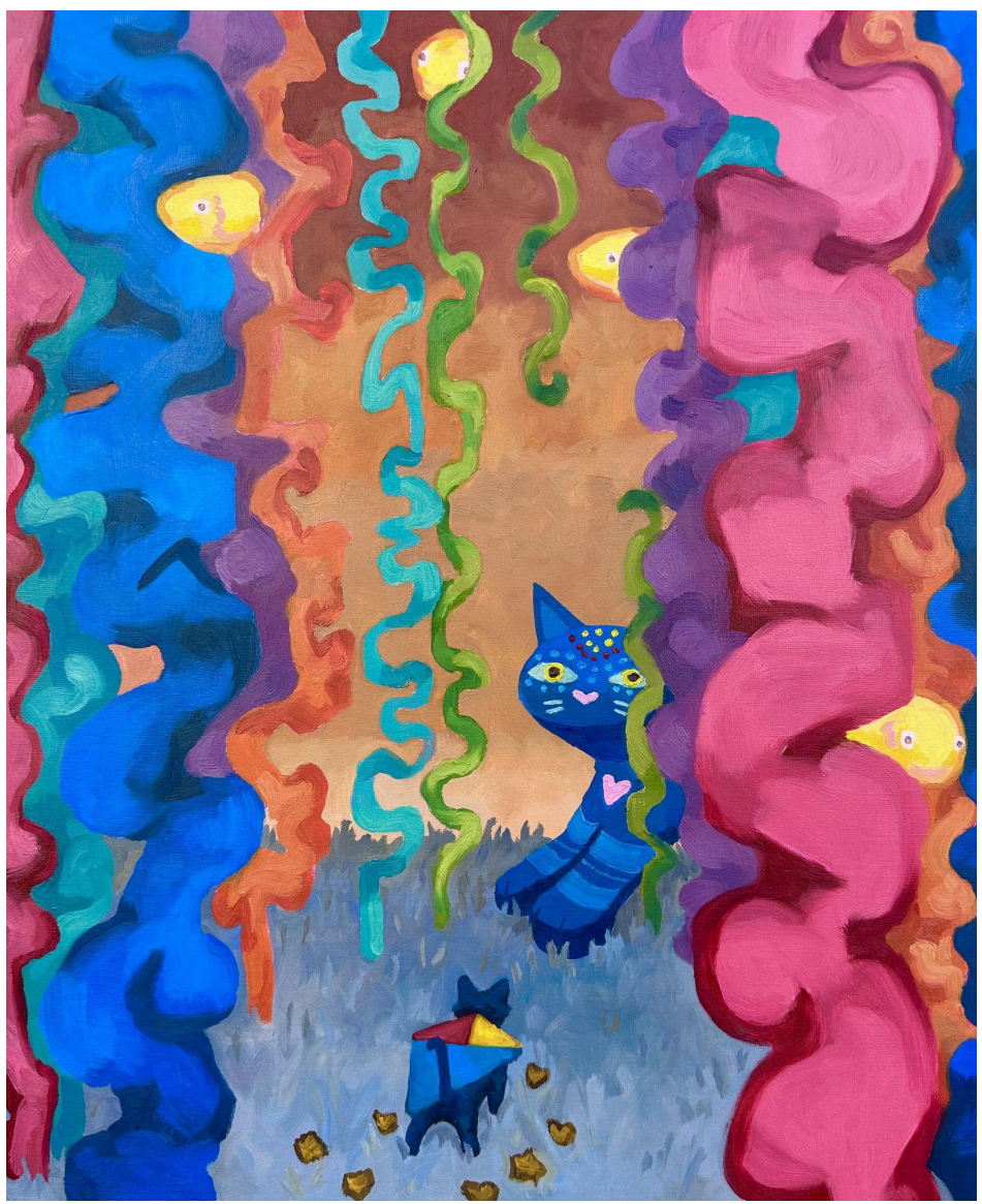
Figure 3: Alebrije's Cavern