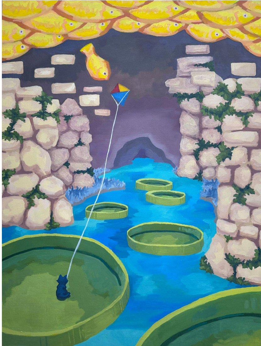
Figure 6: Curiosity's Journey