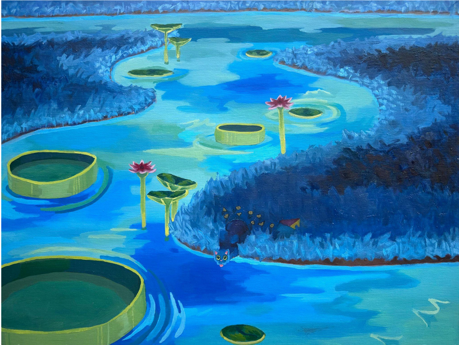
Figure 5: Curious Alluring Ride