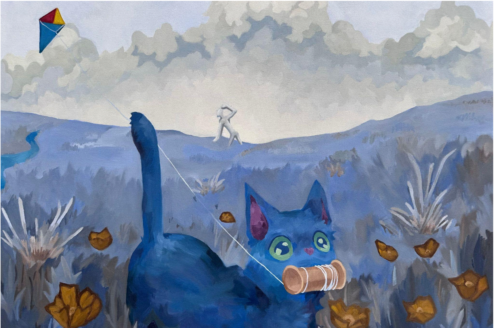
Figure 1: Pursuit of Whimsy