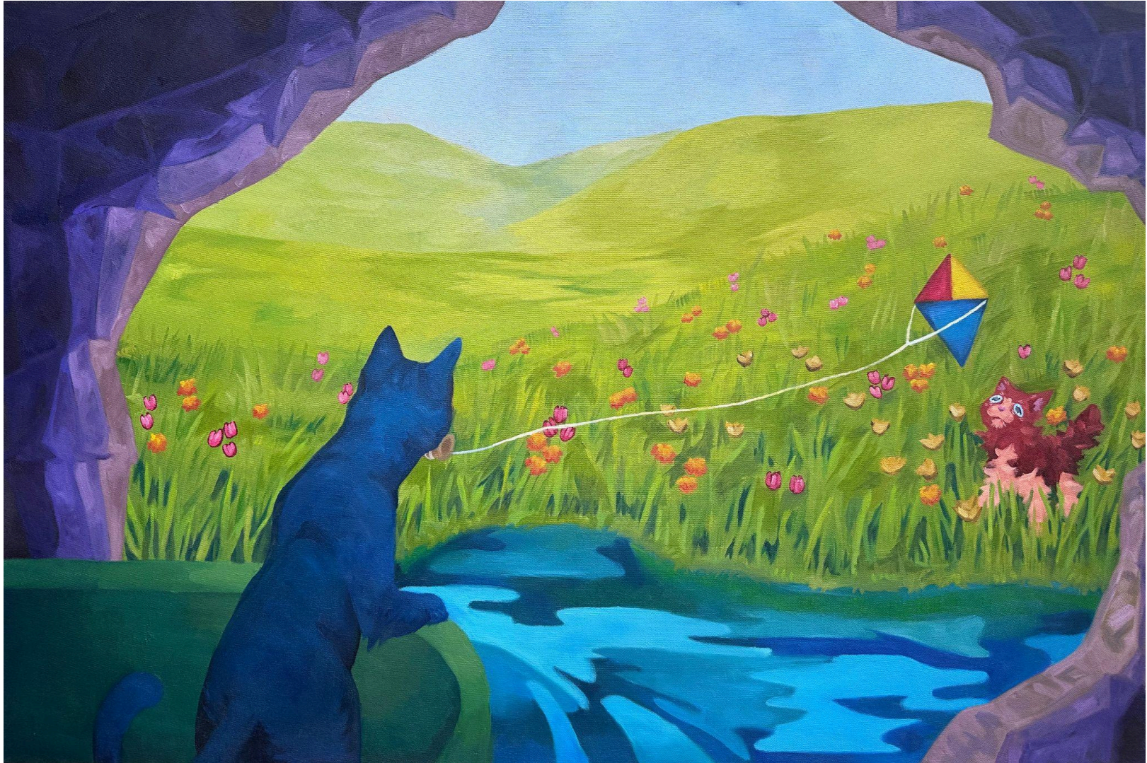
Figure 7: To the Other Side