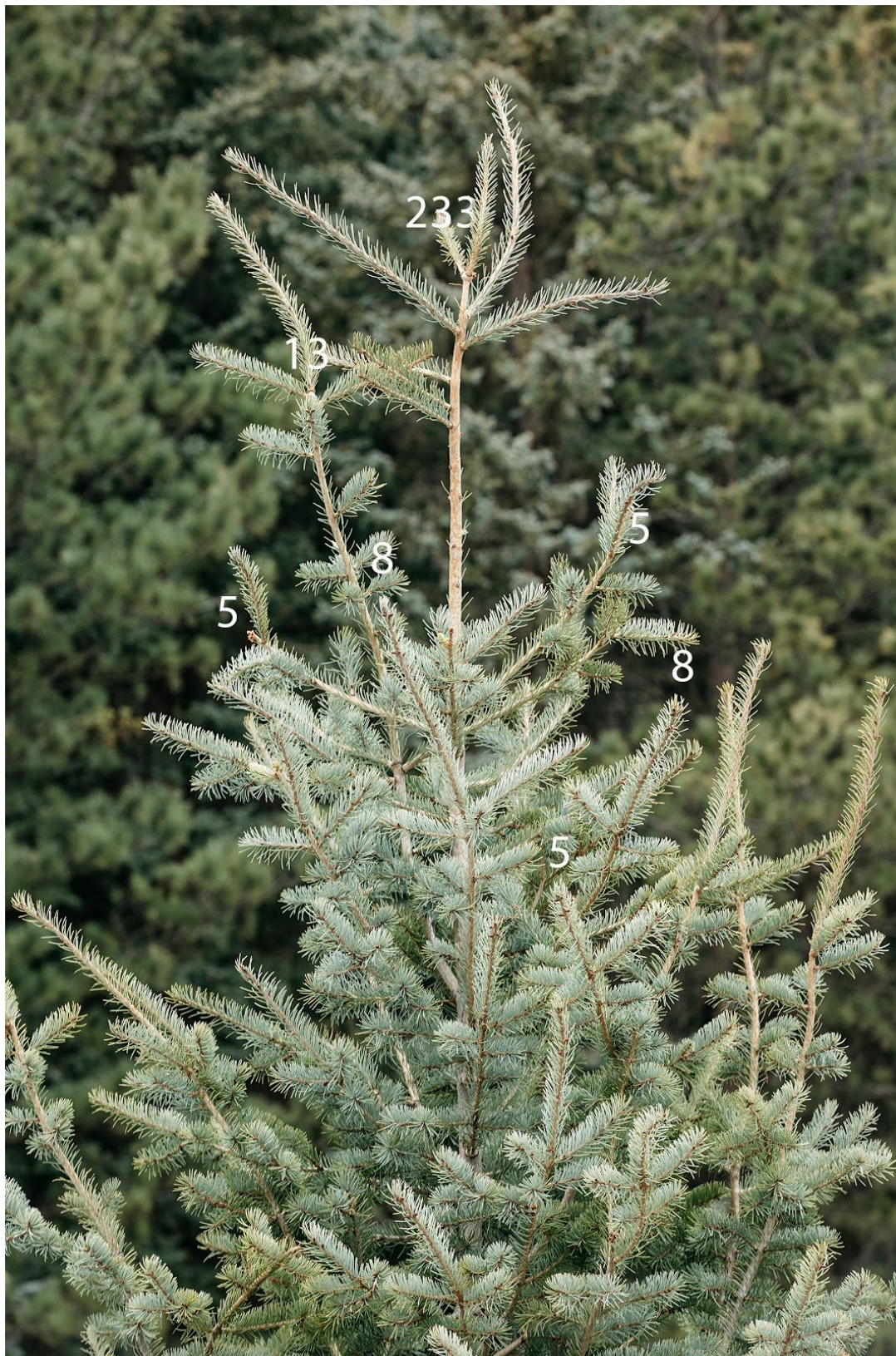
Figure 1: Untitled