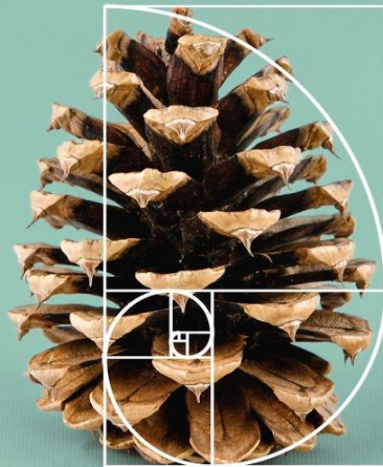
Figure 3: Untitled