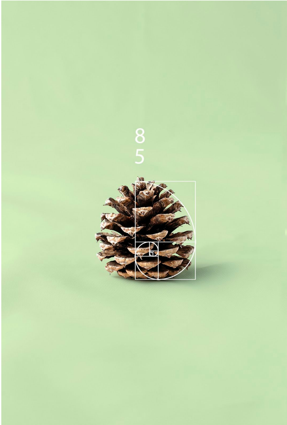
Figure 5: Untitled