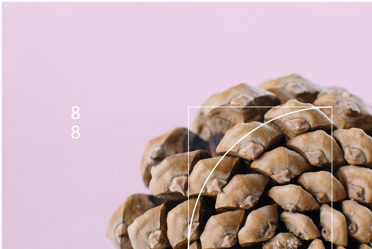
Figure 8: Untitled