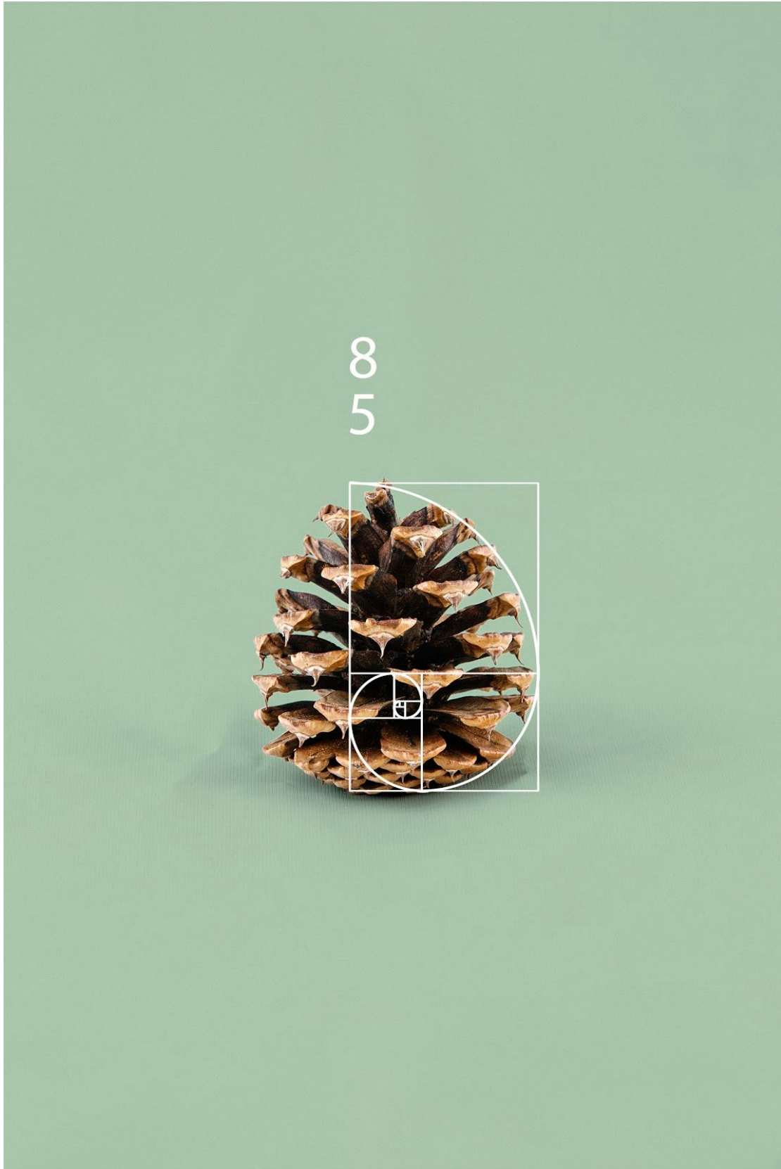
Figure 4: Untitled