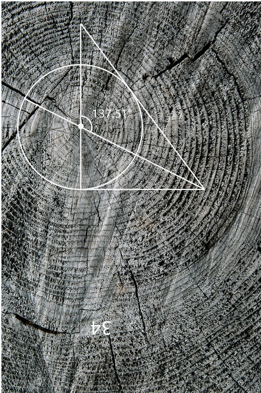
Figure 2: Untitled