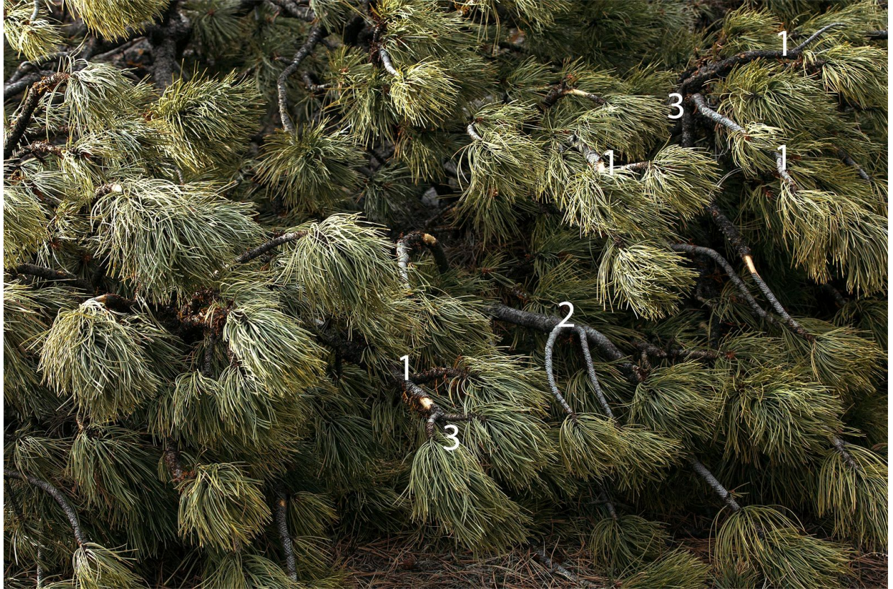
Figure 7: Untitled