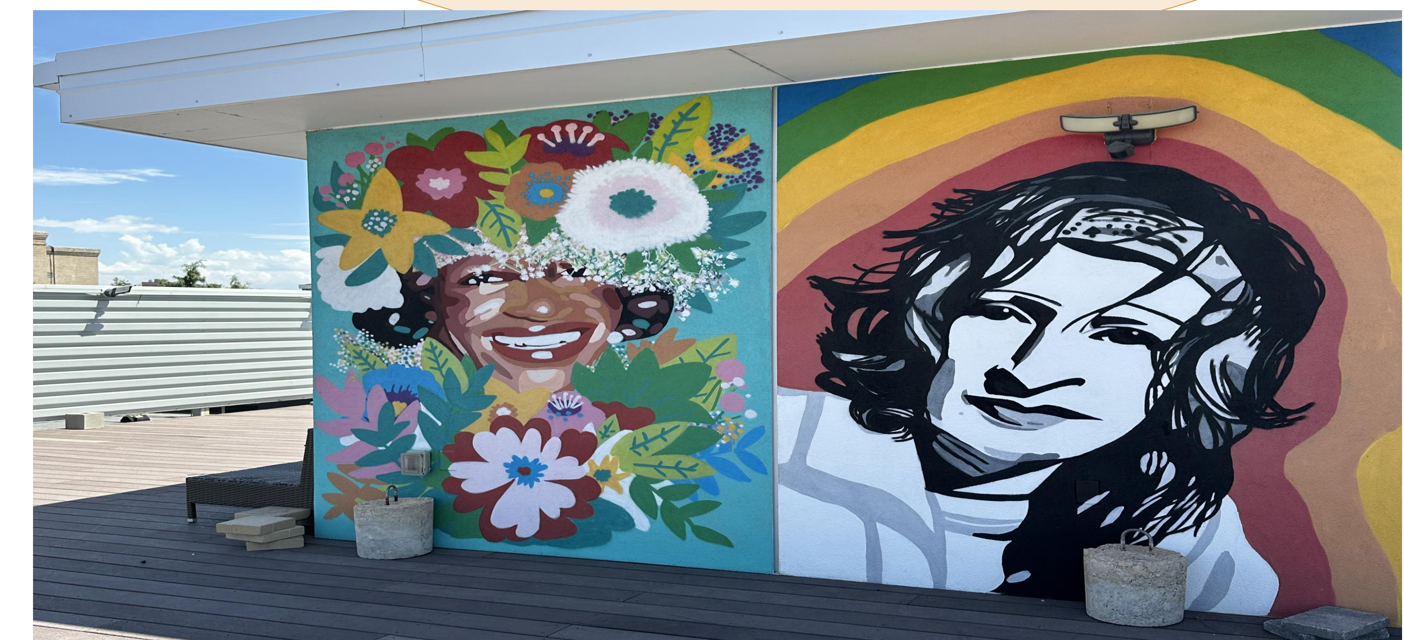
The Center on Colfax, taken on July 24th, 2023

" I think representation is another really important piece in making sure that on the website or on the staff, people making decisions and also our LGBTQ or how that lens to making sure we're making decisions that are impacting LGBT Q folks in a positive way. So, yeah, there's a lot, a lot about language about representation about just celebrating people's differences." — CSU Pride center