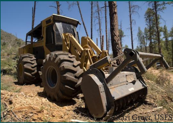
ari Grant, USFS