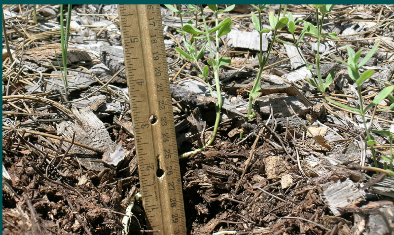
In Colorado, average mulch depth is 0.5 to 2-inches.