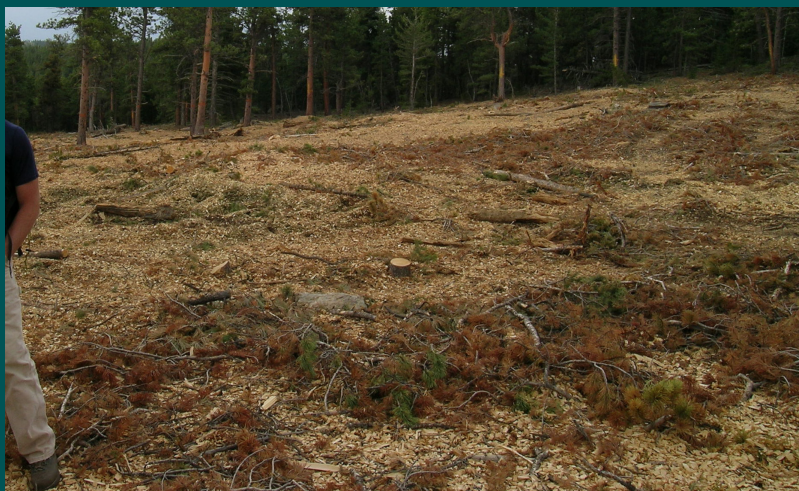
Even and heavily distributed chips. In larger masticated treatment areas in Colorado (several acres or more), average coverage of woody material is about 60% (Battaglia et. al, 2010). However, any given square foot within a treatment area may be fully covered in masticated material or have none at all.

Specifying sizes for trees or brush to mulch (e.g. diameter, height, clump size, and distribution), or the size of clumps or groups of vegetation to retain can manage the depth of mulch debris. If less mulched material is desired on the soil, treatment options that remove biomass from the site, such as whole tree harvest or chipping into roll-off dumpsters, are recommended as a complementary management tool. Actual depth of mulched material on the forest floor can vary greatly across a treatment area. For example, in Colorado depths often average only 0.5 to 2-inches in most areas, with localized pockets of heavier accumulations (Battaglia et al. 2010).