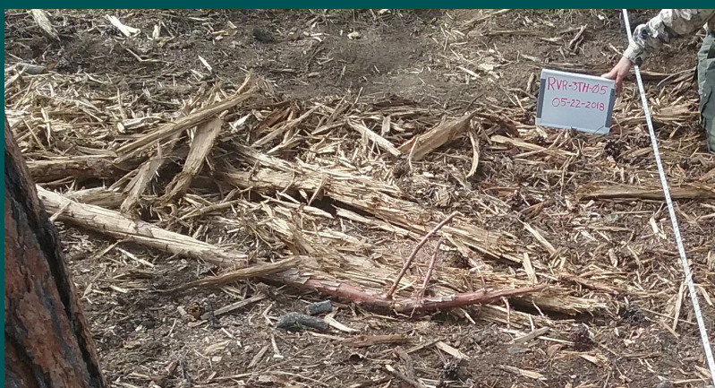
Localized pockets of heavier accumulation