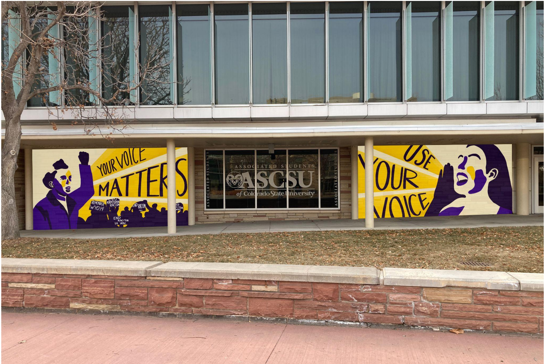
Figure 2: Your Voice Matters, Mural Concept