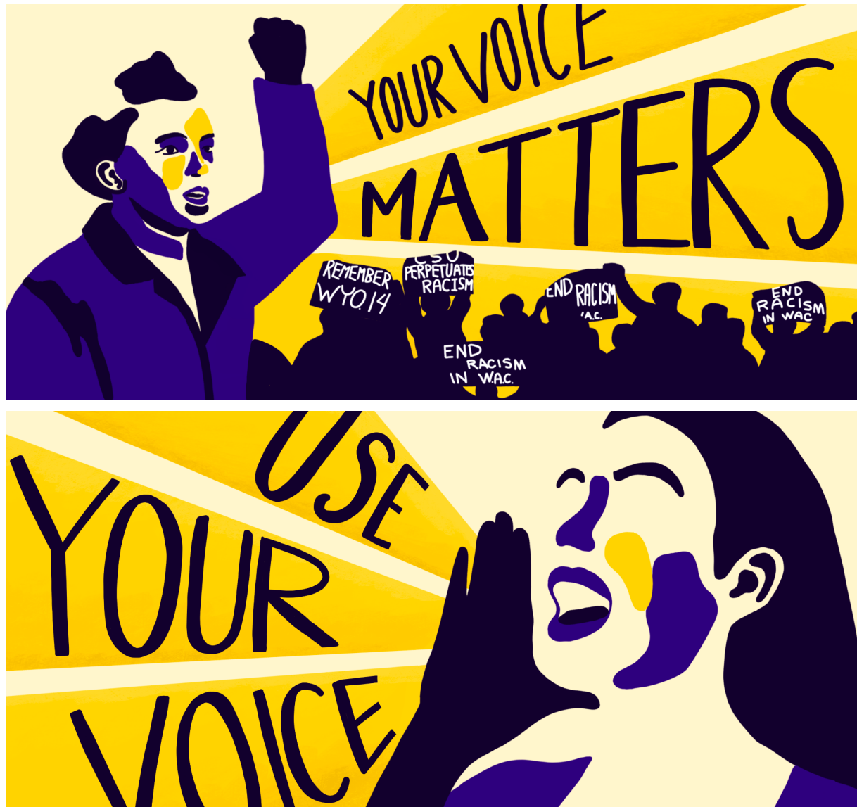
Figure 1: Your Voice Matters, Mural Concept