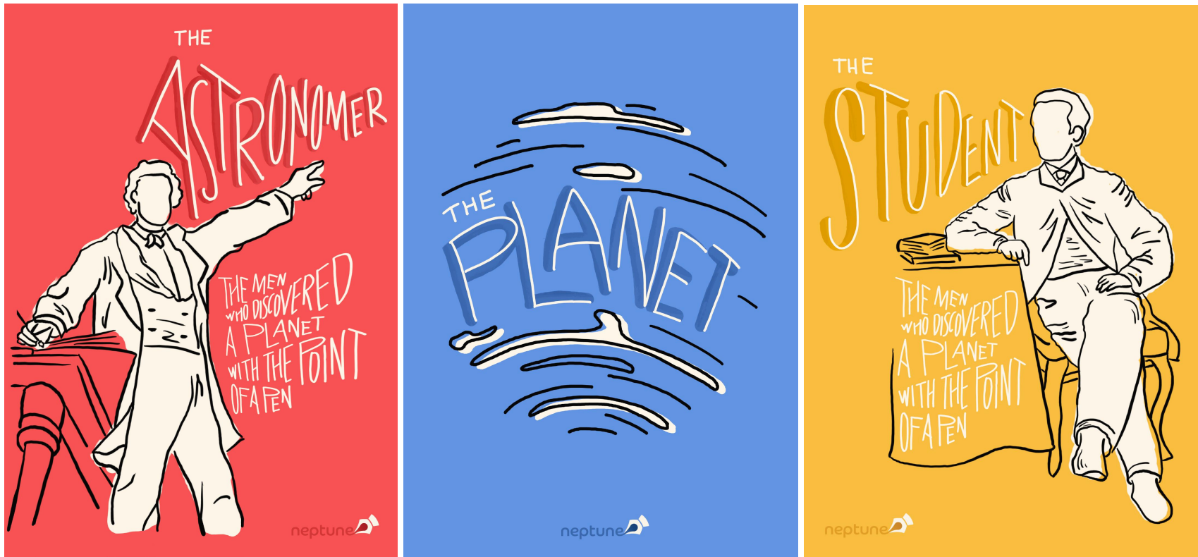
Figure 8: 'Neptune' Musical Poster Triptych