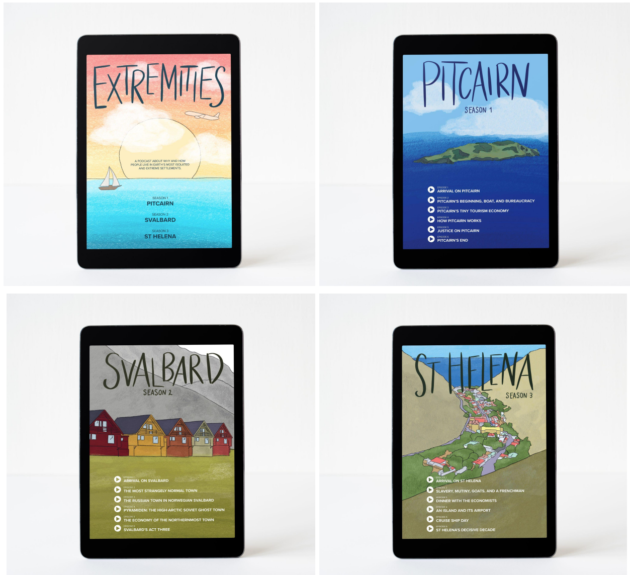
Figure 4: Extremities Podcast Tablet App Concept