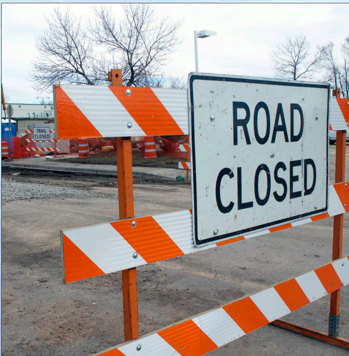
Above: Re-routing residents through CSU's campus, construction crews blocked off a section of Prospect Road in between College and Centre avenues. The road re-opened April 5.