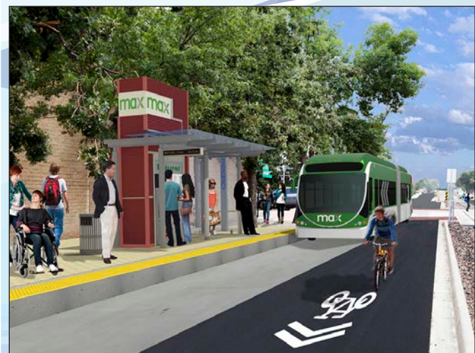
Above and below: renderings of MAX transit bus stations.