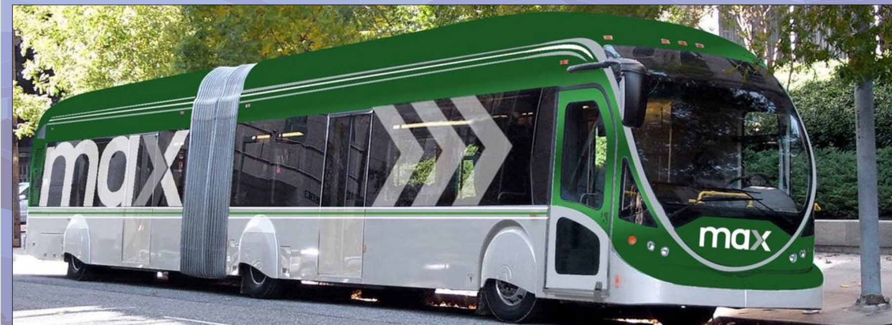
The MAX Transit Bus.