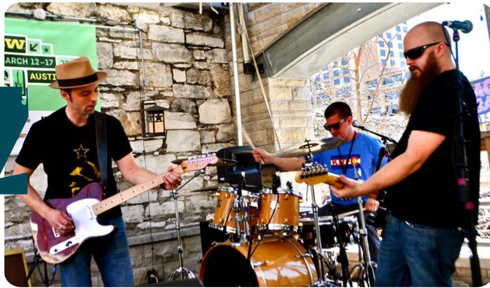
Turn 4, a SpokesBUZZ band, plays at SXSW.