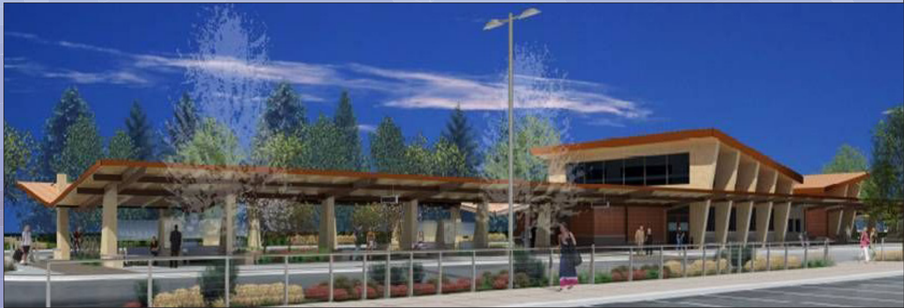
A rendering of the completed system provides a sneak peek at what will come to be known as the University Station and the “gateway” to Colorado State’s campus.