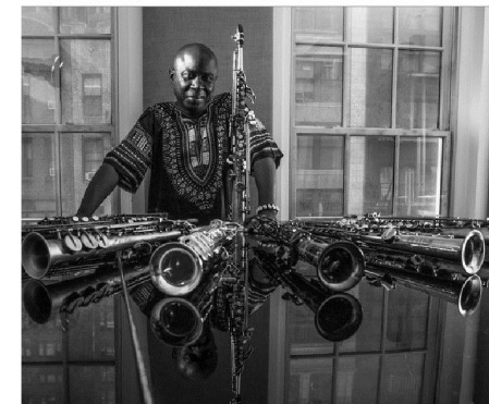
SAM NEWSOME NYC Jazz Great