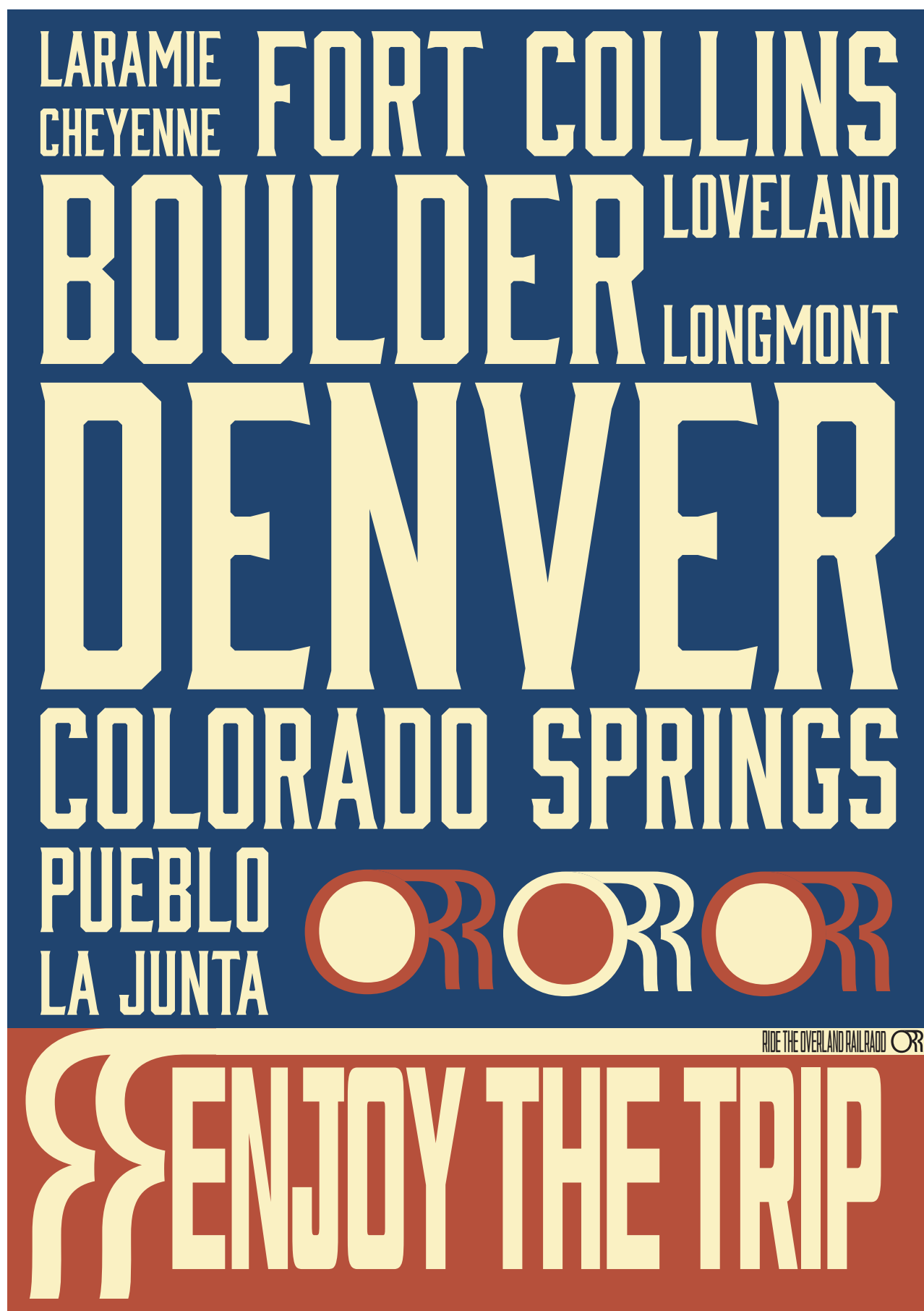
Figure 3: ORR Poster Diptych 1, a