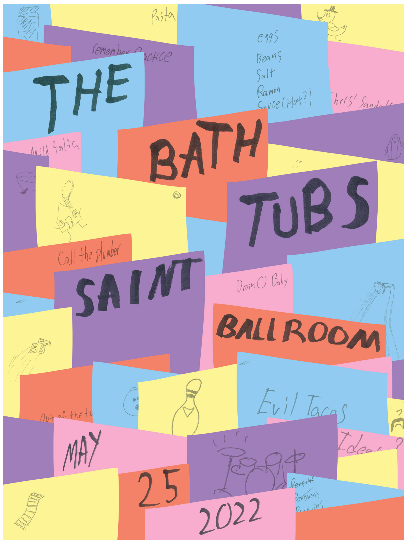
Figure 7: Event Poster