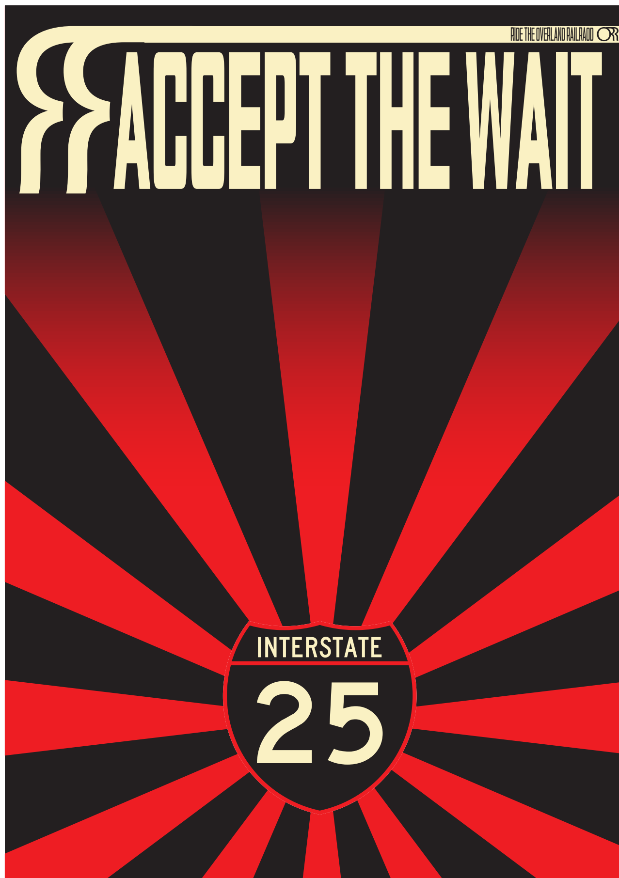
Figure 5: ORR Poster Diptych 2, a