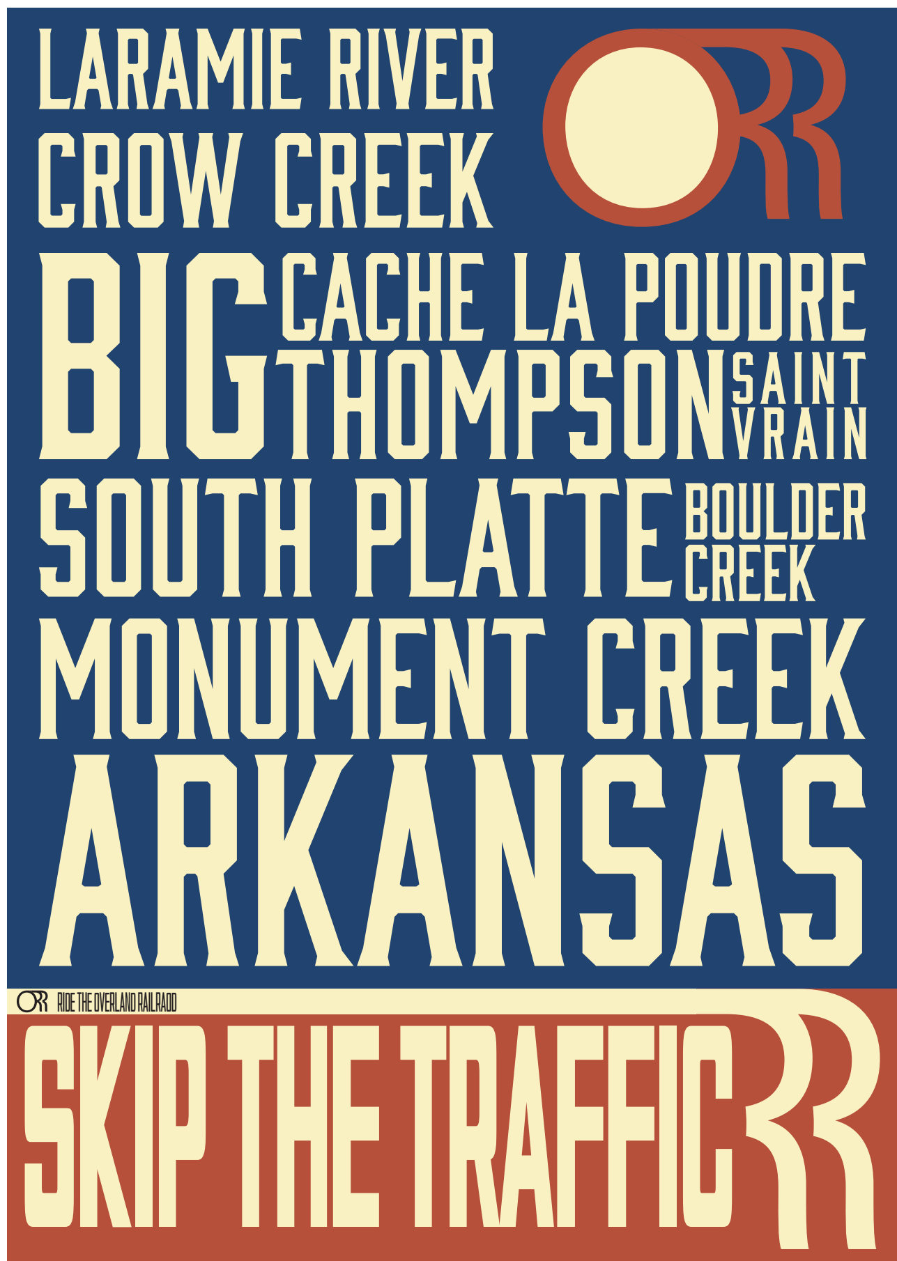
Figure 4: ORR Poster Diptych 1, b