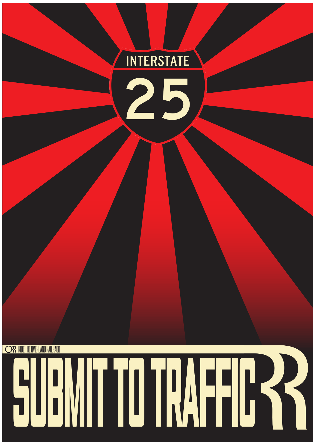
Figure 6: ORR Poster Diptych 2, b