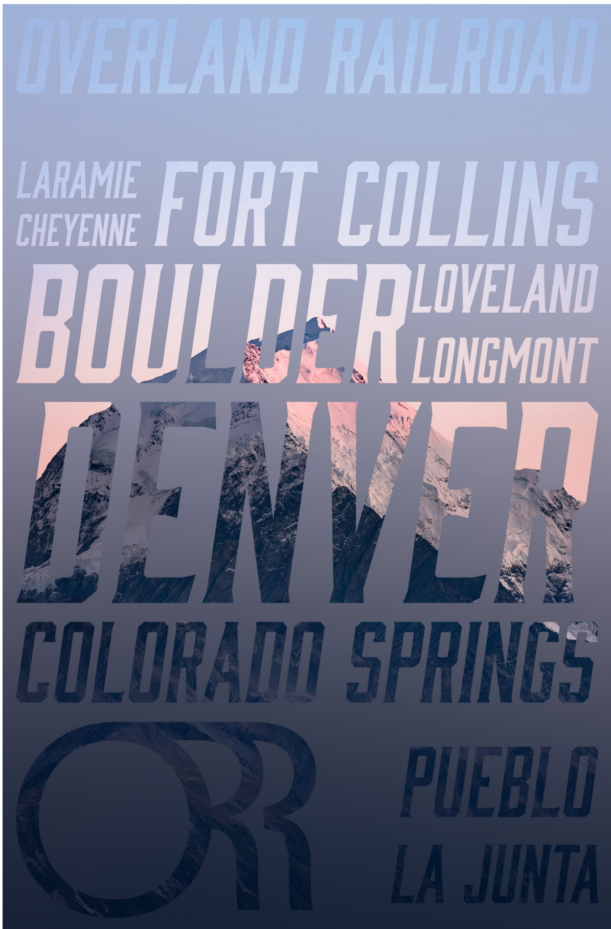
Figure 1: ORR Program Cover