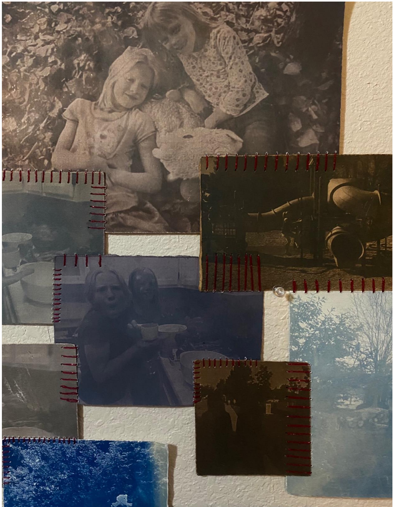
Figure 10: My Greatest Fear is Forgetting You (Detail Shot)