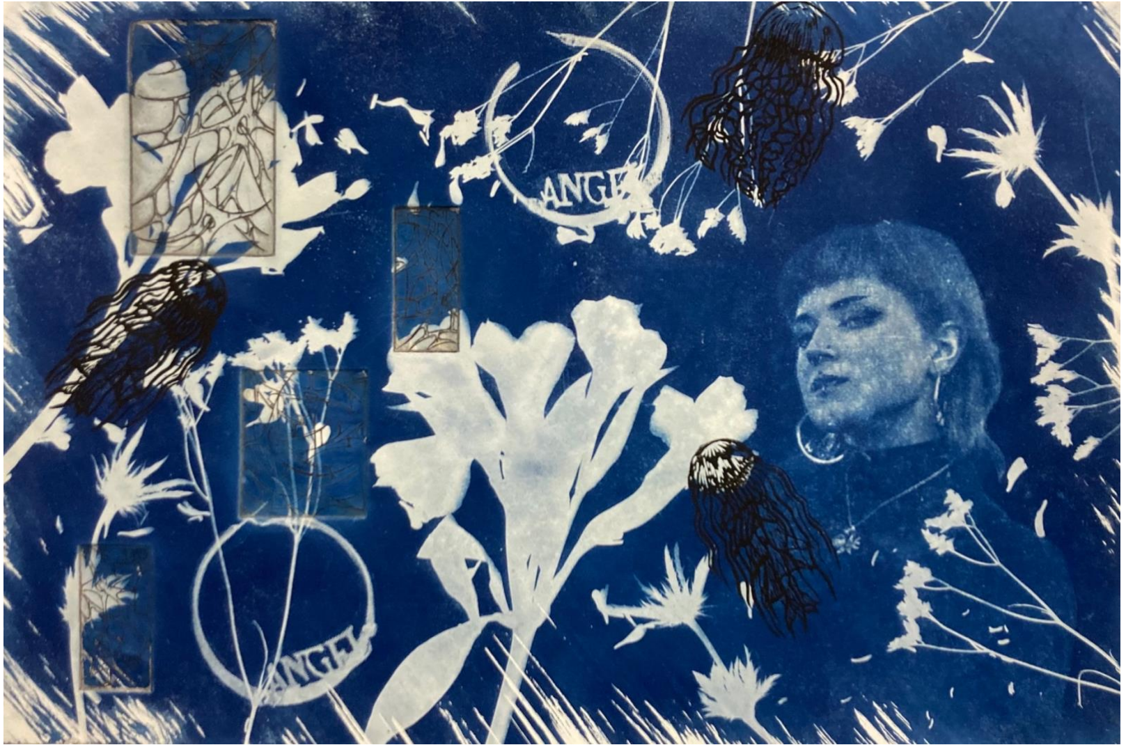
Figure 5: Ode to Chloe