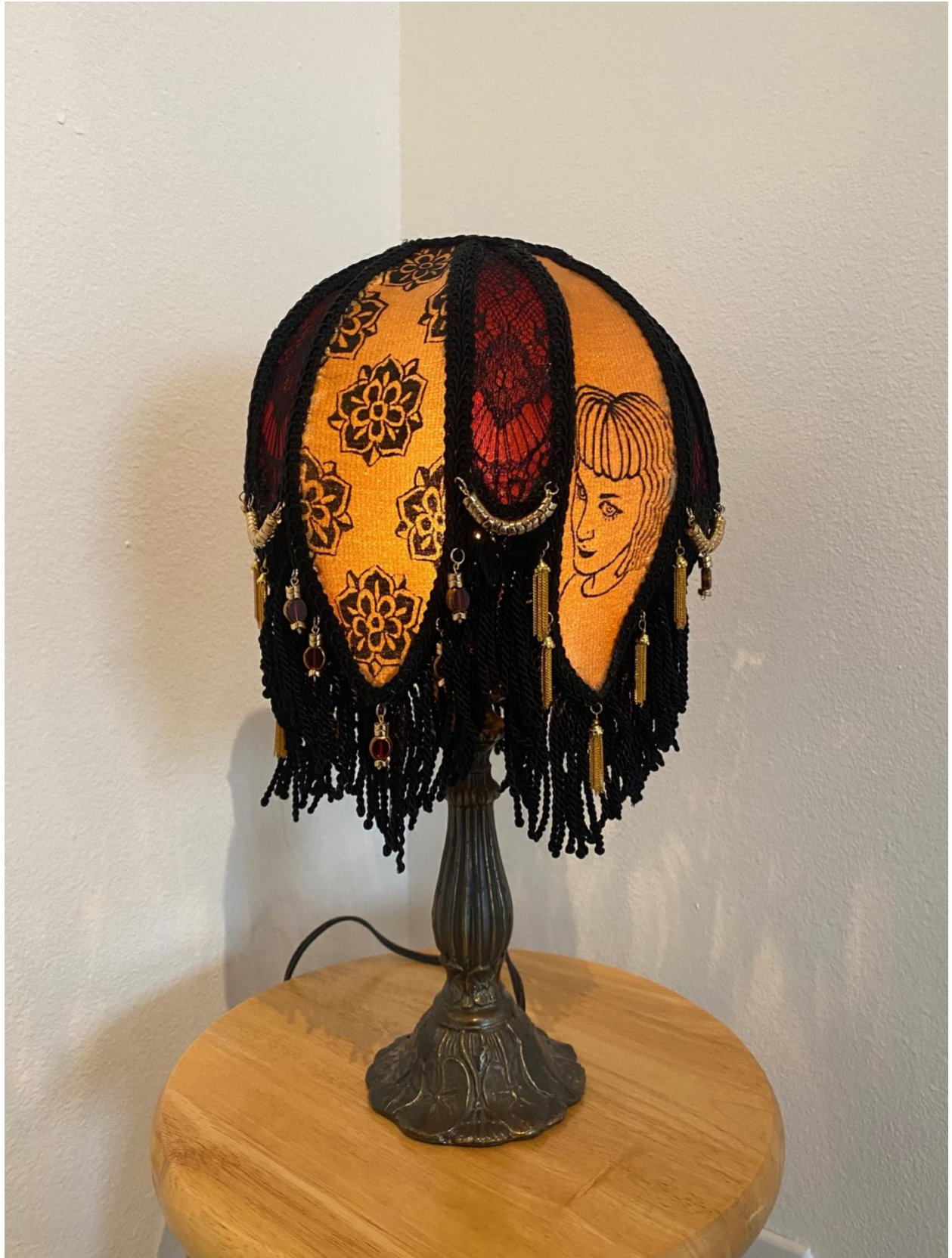
Figure 1: Light of My Life