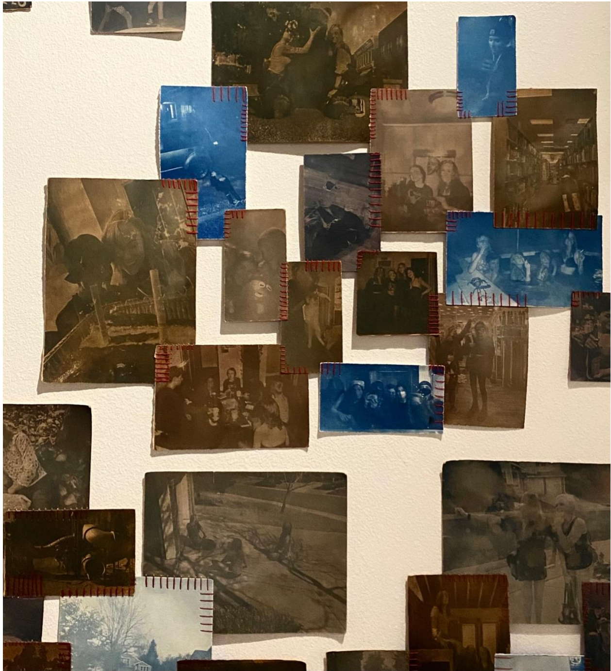
Figure 9: My Greatest Fear is Forgetting You (Detail Shot)