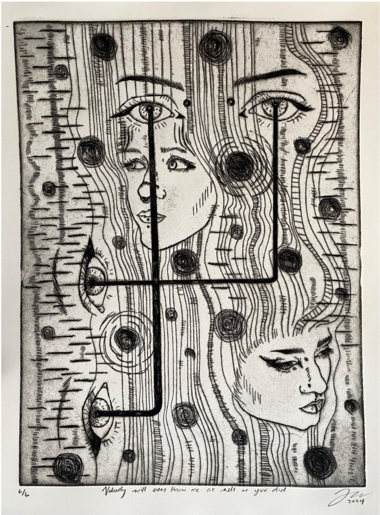
Figure 4: Nobody Will Ever Know Me as Well as You Did