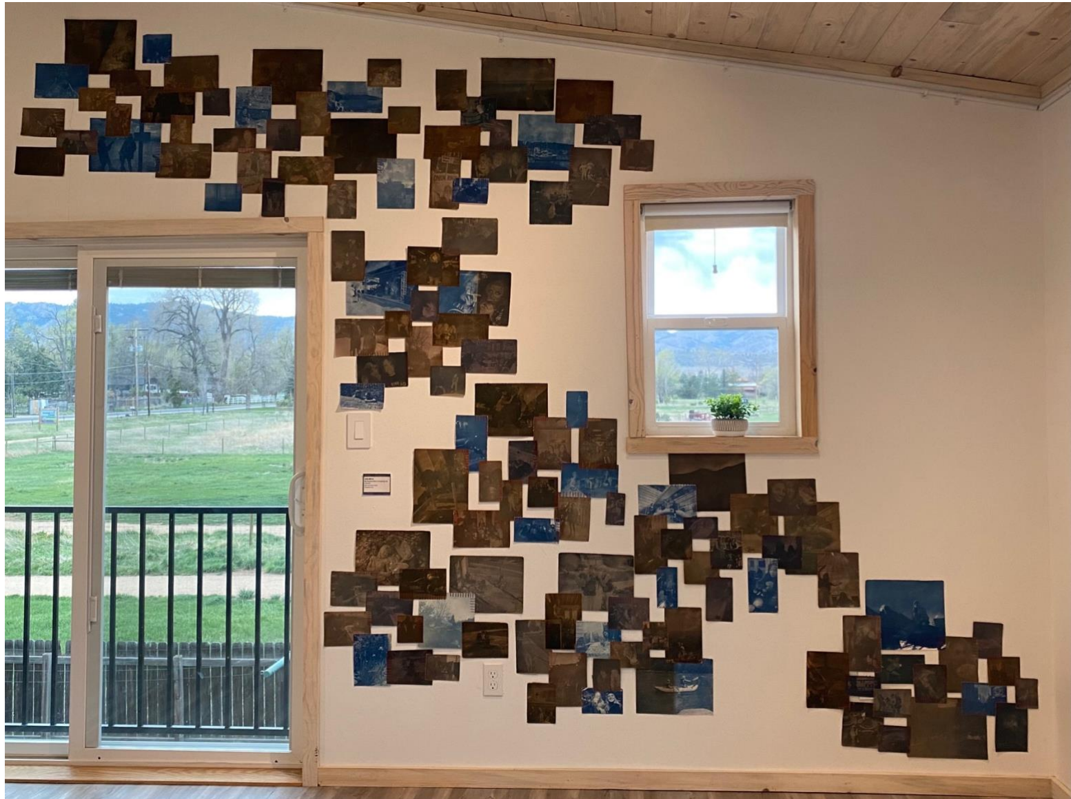
Figure 7: My Greatest Fear is Forgetting You