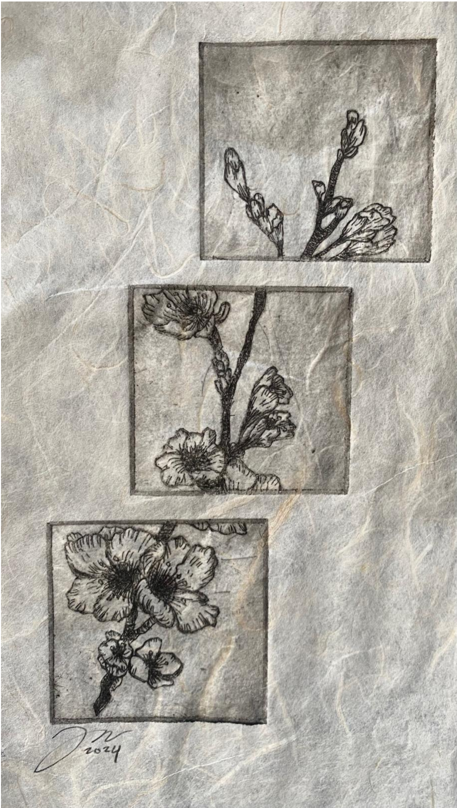
Figure 3: Everything Holds Memories of You